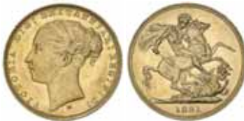
1359* Queen Victoria , 1881 Melbourne, no BP (McD.161a). Nearly uncirculated/uncirculated.