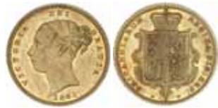
1392* Queen Victoria , 1881 Sydney. Brush marks on obverse, otherwise nearly uncirculated.