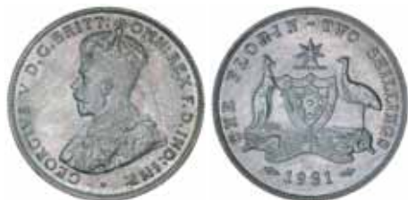
1532* George V, 1931. Uncirculated.