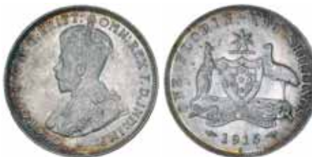
1510* George V, 1915H. Soft strike, good extremely fine.