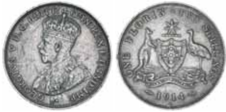
1507* George V, 1914H. Surface marks, otherwise toned, good very fine and rare in this condition.