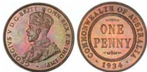
1652* George V , 1934. Attractive red and crimson tone, choice uncirculated.