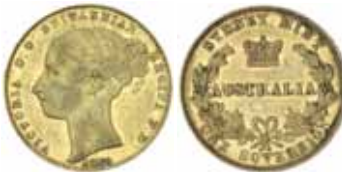
1315* Queen Victoria , first type, 1856. Minor rim nicks and field marks, some dirt in reverse denticles, lettering and wreath, original surface, good very fine and rare in this condition. $7,000

Ex Reserve Bank of Australia Sale (lot 1552).