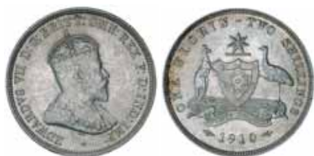
1499* Edward VII, 1910. Nearly uncirculated/uncirculated.