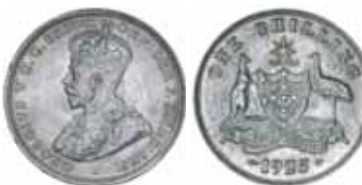
1574* George V, 1925. Nearly uncirculated/uncirculated.