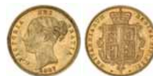
1397* Queen Victoria , young head, 1887 Melbourne. Contact marks and edge knock on obverse, die break on reverse, nearly extremely fine.