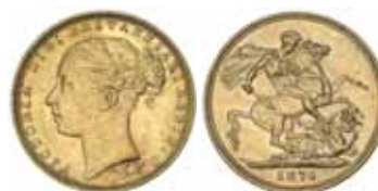
1354* Queen Victoria , 1876 Melbourne. Nearly uncirculated. $480 Ex 'The Douro Cargo'.

Ex Douro Cargo (lot 861 part) and Noble Numismatics Sale 53 (lot 3639).