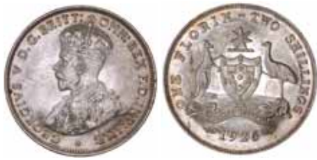
1528* George V, 1926. Considerable original mint bloom, golden brown toning in parts, nearly uncirculated and rare in this condition.