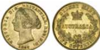
1316* Queen Victoria , second type, 1857, with wreathed head of Victoria left by L.C.Wyon. Extremely fine and rare in this condition. $3,200

Ex Reserve Bank of Australia Sale (lot 1552).