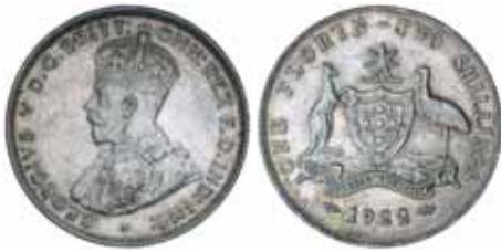
1521* George V , 1922. Contact marks, die break on reverse, good very fine/nearly extremely fine. $500