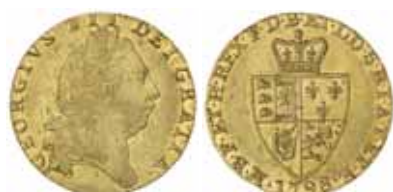
1293* Great Britain , George III, guinea, fifth head or spade type, 1798 (S.3729). Nearly extremely fine with some mint bloom.

Private purchase from R.Lobel 7/2/1976 and L.Filacouridis Collection.