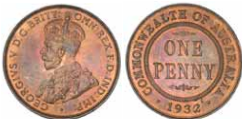
1649* George V , 1932. Subdued mint bloom, brown and red uncirculated.