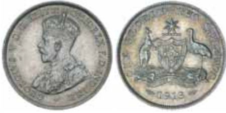
1504* George V, 1913. Nearly extremely fine/good extremely fine.