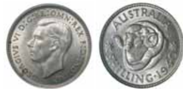
1582* George VI, 1940. Lightly toned, uncirculated and scarce in this condition.