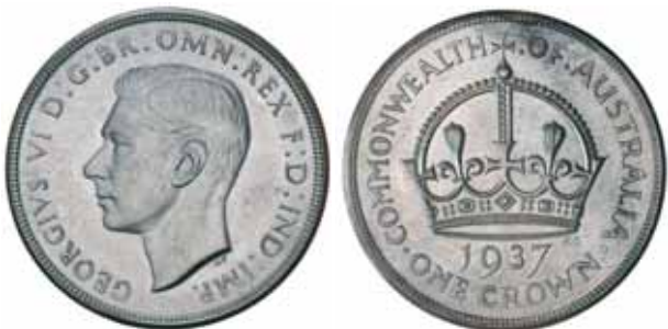
1496* George VI , 1937. Obverse with contact marks, otherwise uncirculated. $100