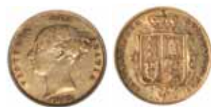
1393* Queen Victoria , 1882 Sydney. Good very fine and rare.

Private purchase from Winsor & Sons, 10 September 2007.