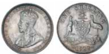
1570* George V, 1922. Attractive tone, nearly uncirculated.