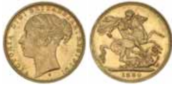
1357* Queen Victoria , 1880 Sydney no BP (McD.158c). Nearly uncirculated.