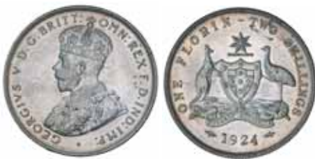
1524* George V , 1924. Choice uncirculated. $2,500