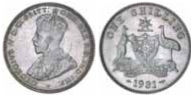
1575* George V, 1931. Toned, nearly uncirculated.