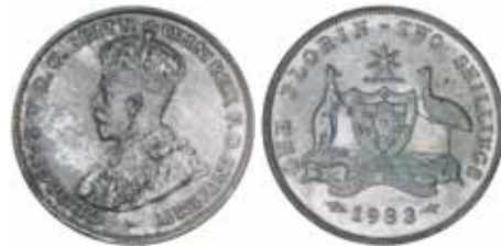
1535* George V, 1933. Obverse unevenly toned, good extremely fine.