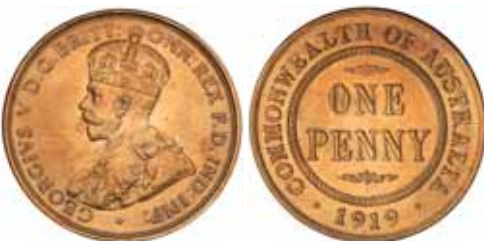
1630* George V , 1919 dot below scroll. Full red, choice uncirculated.