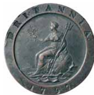
1296* Great Britain , George III, copper cartwheel twopence, 1797 (S.3776). Minor edge nicks, dark toned, otherwise very fine.