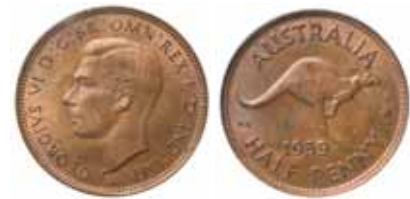
1708* George VI , 1939 kangaroo reverse. Red and brown, uncirculated and rare in this condition. $1,600