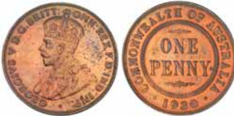
1646* George V , 1930, Indian die. Obverse rim bruises at 9.30 and 3 o'clock, cleaned of patina, orange red metal colour with toned high points, full centre diamond and eight clear pearls, nearly extremely fine/extremely fine and extremely rare in this condition, the third finest currency coin we have handled and as such of great importance.