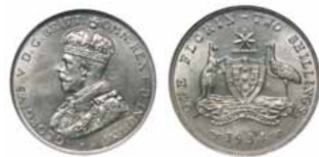
1537* George V, 1934. Slight brushing on field under and in front of portrait, otherwise choice uncirculated.