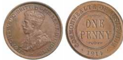
1674* George V , 1914. Well struck for this date, brown with traces of red on reverse, nearly uncirculated and rare in this condition.