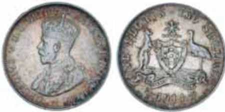
1506* George V, 1914H. Good very fine.