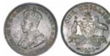
1564* George V, 1916M. Toned, uncirculated.