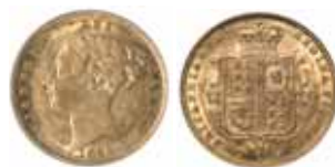
1394* Queen Victoria , 1883 Sydney (McD.25a). Dusty part tone, original mint bloom, nearly uncirculated.