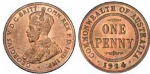
1639* George V , 1924, London die. Subdued full original mint red, peripheral die breaks both sides, reverse die clash noticeable, choice uncirculated.