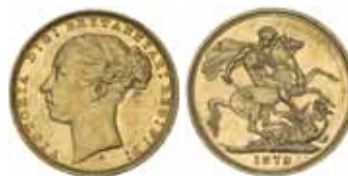
1355 Queen Victoria , 1876 Sydney. Extremely fine/good extremely fine. $300