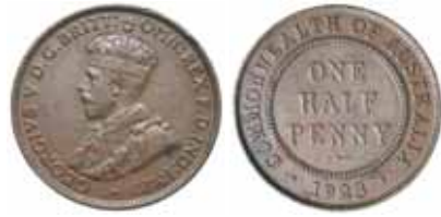
1701* George V , 1923. Peripheral die break on obverse and reverse, edge knock on obverse at 2 o'clock, reverse with edge knock at 2-3 o'clock, good very fine. $1,650