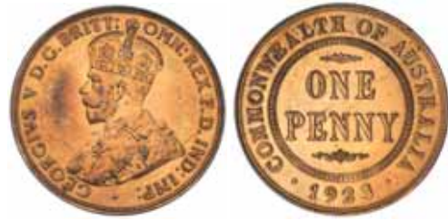
1638* George V , 1923, London die. Cleaned of toning, brilliant red reverse, obverse peripheral die break, uncirculated.