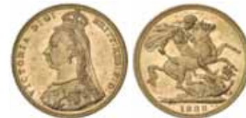
1366* Queen Victoria , 1888 Melbourne (McD.177a). Nearly uncirculated and rare.