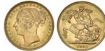
1363* Queen Victoria , 1885 Sydney. Nearly uncirculated.