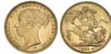
1362* Queen Victoria , 1884 Sydney. Nearly uncirculated.