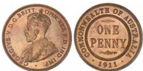
1619* George V, 1911. Nearly full subdued original mint red, uncirculated.