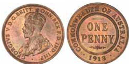
1622* George V, 1913. Subdued original red and light brown, uncirculated.