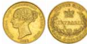
1336* Queen Victoria , first type, 1856. Metal flaw on reverse field, nearly extremely fine and rare in this condition.