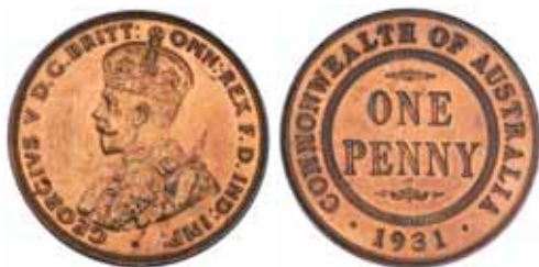
1648* George V , 1931, London die. Cleaned of patina, raw red metal colour, toning on high points, good extremely fine.