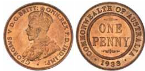
1650* George V , 1933/2 overdate. Full mint red, choice uncirculated and rare, one of the finest known.