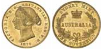
1333* Queen Victoria , second type, 1870. Considerable mint bloom, nearly uncirculated.