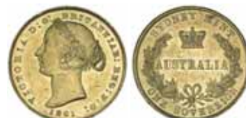
1321* Queen Victoria , second type, 1861. Some mint bloom, good extremely fine and rare in this condition.

Ex Spink Australia Sale 9 (lot 1247) and Noble Numismatics Sale 46 (lot 1518).