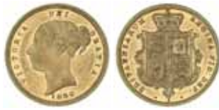
1391* Queen Victoria , 1880 Sydney. Nearly extremely fine/ extremely fine.