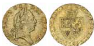
1294* Great Britain , George III, half guinea, fifth head or spade type, 1793 (S.3735). Nearly very fine/very fine.

Private purchase from R.Lobel 2/8/1979 and L.Filacouridis Collection.