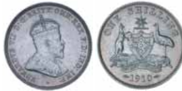
1556* Edward VII, 1910. Nearly uncirculated.