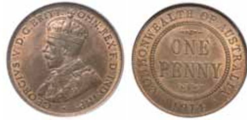
1673* George V , 1914. Red and brown, uncirculated and rare in this condition.