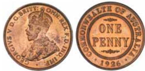
1641* George V , 1926 London die. Peripheral die breaks on both sides, nearly full mint red, uncirculated/choice uncirculated and rare in this condition, one of the finest known.