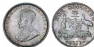
1565* George V, 1917M. Contact marks, uncirculated.