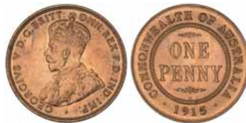
1625* George V, 1915H. Full subdued original mint red, choice uncirculated and rare in this condition, one of the finest known.