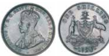
1572* George V, 1924. Deep blue grey tone, strong strike showing re-entered and overdated 4, minor hairline contact marks take this away from being a gem, attractive, uncirculated and rare in this state.