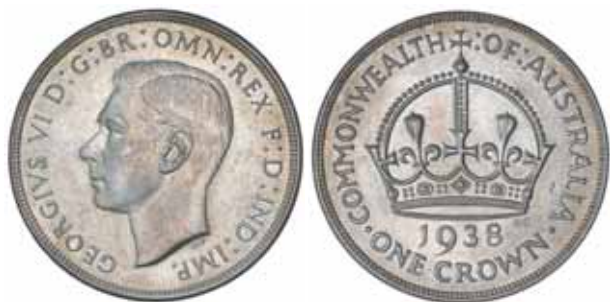
1497* George VI, 1938. Underlying mint bloom, nearly uncirculated.