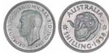
1579* George VI, 1938. Uncirculated.