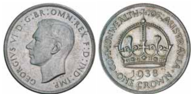
1498* George VI, 1938. Obverse with contact marks, otherwise extremely fine.