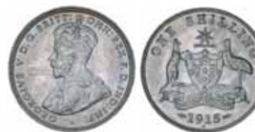
1563* George V, 1915H. Nearly full mint bloom, uncirculated and very rare in this condition, one of the finest known.