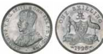
1573* George V, 1925. Full original cartwheeling mint bloom, uncirculated.