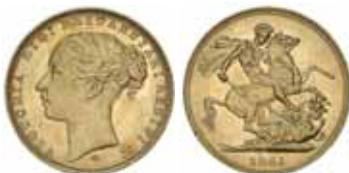
1360* Queen Victoria , 1881 Melbourne, no BP (McD.161a). Cleaned, good extremely fine.