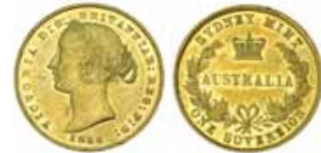
1319* Queen Victoria , second type, 1859. Surface marks, otherwise with considerable brilliance in the lettering and devices, extremely fine/good extremely fine.

Ex Noble Numismatics Sale 62 (lot 1426).