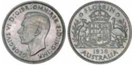
1548* George VI, 1938. Uncirculated.