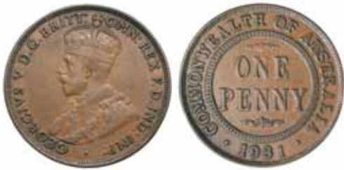
1647* George V , 1931 dropped 1, Indian die. Rim bruise, brown patina, good fine and very rare.