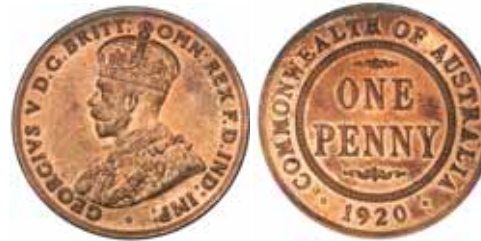
1632* George V , Melbourne Mint specimen penny, 1920 plain, Indian die. Proof-like reverse, cleaned of toning, red and brown, nearly FDC and excessively rare in this state.