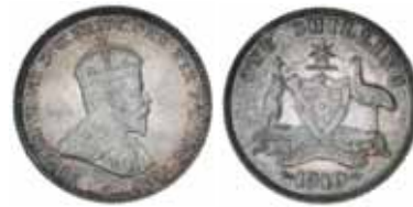
1555* Edward VII, 1910. Toned, nearly uncirculated.