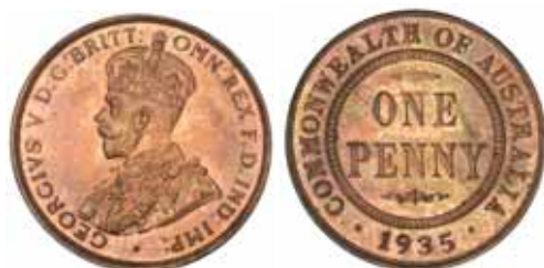
1653* George V , 1935. Dull toned mint red, uncirculated.