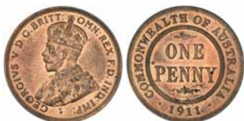
1620* George V, 1911. Red and brown uncirculated with some carbon spotting.