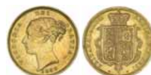
1396* Queen Victoria , 1886 Sydney. Nearly uncirculated and very rare in this condition.