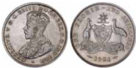
1525* George V , 1924. Seriffed 4, die break through date, lightly toned matte fields, well struck, nearly uncirculated. $1,500