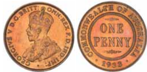
1651* George V , 1933. Dull cleaned mint red, uncirculated.