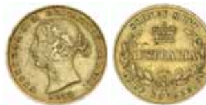
1337* Queen Victoria , second type, 1858, first E in sovereign over an R placed there in error. Scratches across portrait, otherwise relatively unworn, good very fine and extremely rare, possibly the finest known.