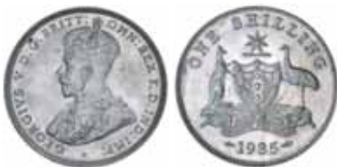
1577* George V, 1935. Uncirculated.