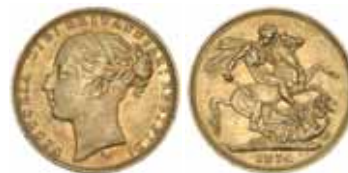
1351* Queen Victoria , 1871 Sydney, small BP. Nearly extremely fine. $350