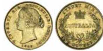
1318* Queen Victoria , second type, 1859. Good extremely fine and rare in this condition.