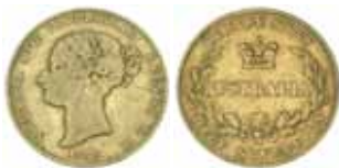
1335* Queen Victoria , first type, 1855, with filleted head of Victoria left by James Wyon. Evenly worn, fine/good fine and extremely rare in this grade, probably the ninth or tenth finest known.