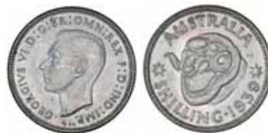
1580* George VI, 1939. Original mint bloom, uncirculated.