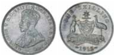
1559* George V, 1912. Attractively toned, light frictional wear, otherwise nearly uncirculated and rare in this condition.