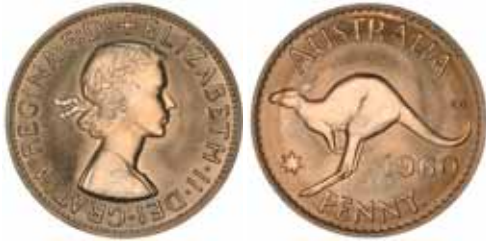
1668* Elizabeth II , Perth Mint proof, 1960. FDC.