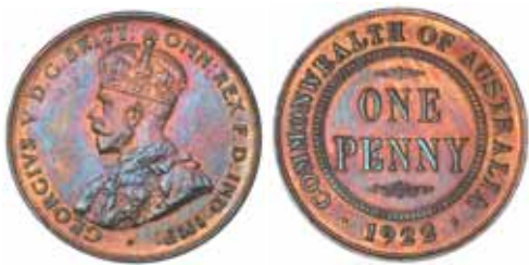
1637* George V , 1922, London die. Cleaned, glossy purple brown, good extremely fine.