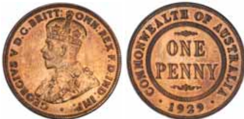
1645* George V , 1929, Indian die. Cleaned of patina, raw red metal colour with some re-toning, good extremely fine.

Ex Spink Australia Sale 12, 4 April 1984 (lot 772) when it was bought for an important collection in Perth which was later sold en bloc in Sale 26 (lot 905) to Richard Williams (whose collection was sold in Sale 35) but with the exception of this 1930 penny.