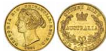
1322* Queen Victoria , second type, 1861. Lightly toned, relatively unmarked surfaces, extremely fine and rare in this condition.

Ex Noble Numismatics Sale 53 (lot 3507).