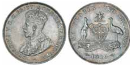
1509* George V, 1915H. Well struck attractive golden and blue grey toning, contact marks in right obverse field, otherwise relatively unmarked and choice uncirculated, very rare in this condition.