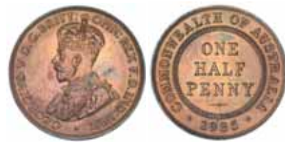
1707* George V , 1935. Cleaned but sharply struck, nearly uncirculated. $200