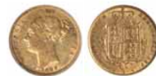
1398* Queen Victoria , young head, 1887 Sydney. Good very fine.