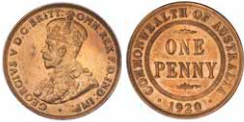
1634* George V , 1920 dot above top scroll and dot below bottom scroll, Indian die. Mostly red uncirculated and very rare, one of the finest known.