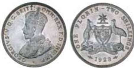
1523* George V , 1923. Choice uncirculated. $3,000