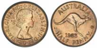
1489* Elizabeth II , Perth Mint proof halfpenny, 1963. Spot on Queen's neck, otherwise FDC. $200