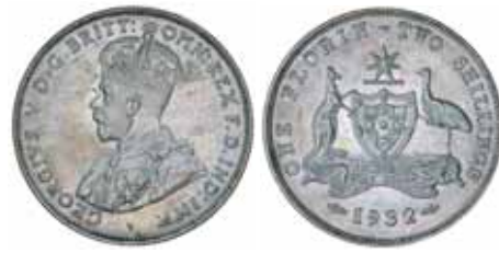
1533* George V, 1932. Nearly extremely fine/good extremely fine.