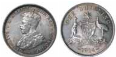
1561* George V, 1914. Lightly toned, underlying mint bloom, nearly uncirculated.