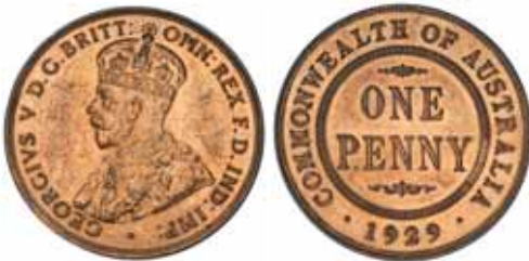
1644* George V , 1929, London die. Obverse peripheral die breaks, minor rim bruise, cleaned of patina, raw red metal colour, good extremely fine and rare.