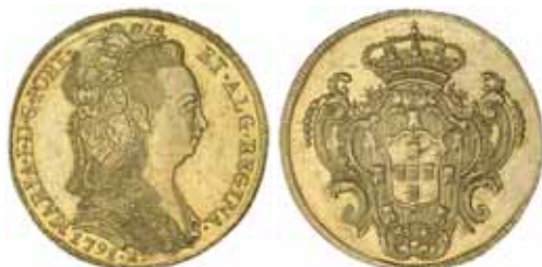
1291* Brazil , Maria I, gold six thousand four hundred reis, 1791R (Rio de Janeiro) (KM.226.1). Edge filed in part, otherwise nearly extremely fine.