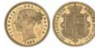
1395* Queen Victoria , 1883 Sydney (McD.25a). Nearly uncirculated and rare in this condition.