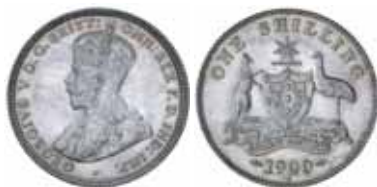
1568* George V, 1920M. Nearly uncirculated.