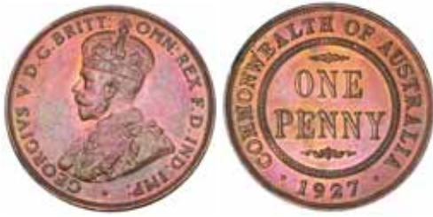
1642* George V , 1927, London die. Brown and crimson red, uncirculated.