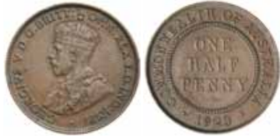
1699* George V , 1923. Peripheral die breaks both sides, medium brown patina, good very fine and rare in this condition. $2,000