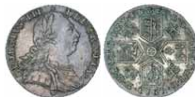
1295* Great Britain , George III, shilling 1787 (S.3743). Extremely fine.

Private purchase from R.Lobel 8/10/1976 and L.Filacouridis Collection.