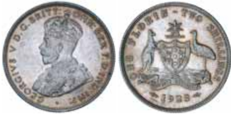
1522* George V , 1923. Golden tone, choice uncirculated. $3,250