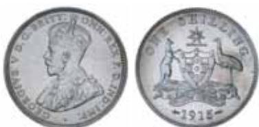
1562* George V, 1915. Hairline on right obverse field, cleaned, otherwise good extremely fine.