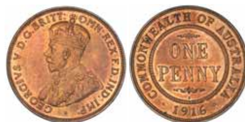
1626* George V, 1916I. Cleaned, dull re-toning, reverse mark on inner circle and 6 of date, nearly uncirculated.