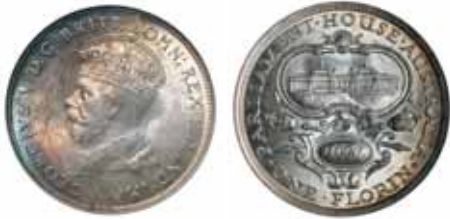
1529* George V, 1927 Canberra. Obverse iridescent tone, choice uncirculated with three clear steps.