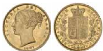
1350* Queen Victoria , 1887 Sydney. Surface marks, otherwise extremely fine/good extremely fine. $450