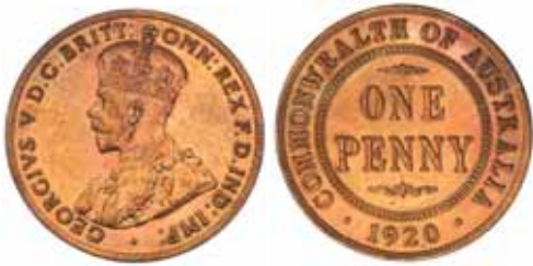
1635* George V , 1920 dot above bottom scroll, Indian die. Cleaned of patina, raw red metal colour, good extremely fine.