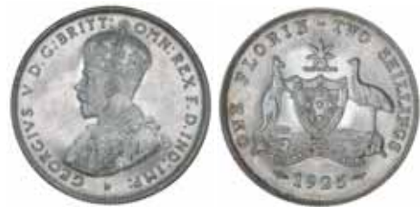
1526* George V , 1925. Satin mint bloom, choice uncirculated. $1,500