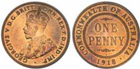
1628* George V , 1918I. Red and brown, choice uncirculated and rare in this condition.