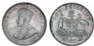
1558* George V, 1911. Mint bloom, uncirculated.