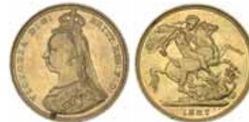
1365* Queen Victoria , Jubilee head, 1887 Sydney (McD.174). Nearly uncirculated and rare in this condition.