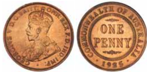
1640* George V , 1925, London die. Plain die state with vertical flaw on cheek, cleaned of patina subdued raw red metal colour, good extremely fine and rare in this state.