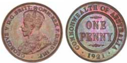
1636* George V , 1921, Indian die. Double entered obverse legend, attractive iridescent tone, uncirculated and rare in this condition, one of the finest known.