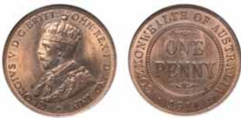
1672* George V , 1911. Full mint red, lightly toned, choice uncirculated.