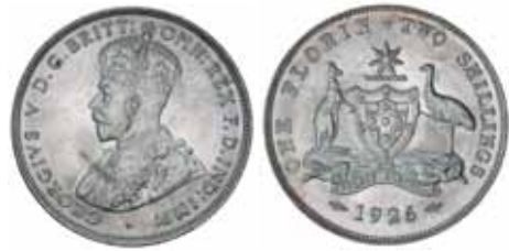
1527* George V , 1926. Well struck with full original mint bloom, one angular scratch under emu takes this away from gem uncirculated, rare in this condition. $4,000