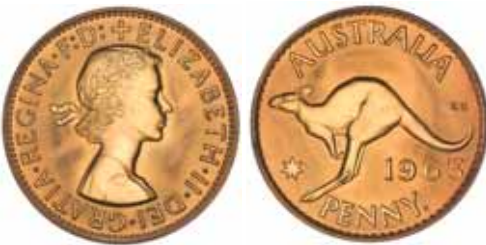
1670* Elizabeth II , Perth Mint proof 1963. Full red, FDC.