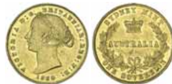
1320* Queen Victoria , second type, 1860. Surface marks, otherwise extremely fine and rare.