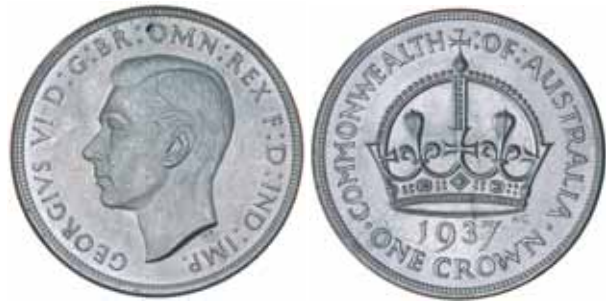
1494* George VI , 1937. Contact marks on obverse, otherwise nearly uncirculated/uncirculated. $200