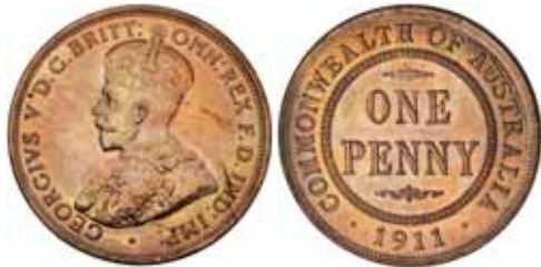
1671* George V , penny, 1911. Full original mint red, choice uncirculated.