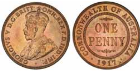
1627* George V , 1917I. Full original mint red, choice uncirculated, one of the finest known.