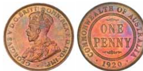
1633* George V , 1920 small dot below bottom scroll, Indian die. Attractive lilac and red concave reverse with peripheral die breaks, uncirculated.