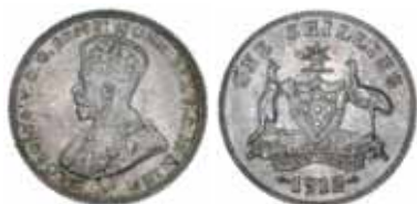
1560* George V, 1912. Toned, reverse with friction marks on feathers, good extremely fine/nearly uncirculated.