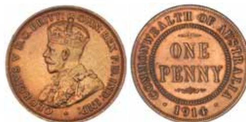
1623* George V, 1914. Cleaned of patina, raw red metal colour, good extremely fine.