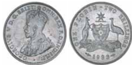
1536* George V, 1933. Extremely fine/good extremely fine.