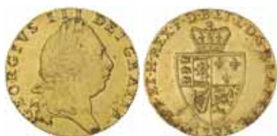
1292* Great Britain , George III, guinea, fifth head or spade type, 1793 (S.3729). Cleaned, otherwise nearly extremely fine.

Private purchase from R.Lobel 5/1/1978 and L.Filacouridis Collection.