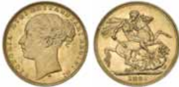
1358* Queen Victoria , 1881 Melbourne (McD.161). Nearly uncirculated.