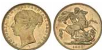
1361* Queen Victoria , 1882 Sydney. Nearly uncirculated.