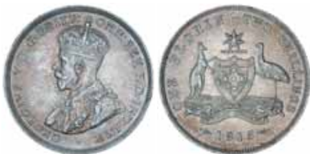
1508* George V, 1915. Good very fine/extremely fine.