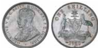
1567* George V, 1920M. Good extremely fine/uncirculated.