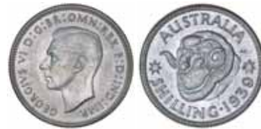
1581* George VI, 1939. Uncirculated.