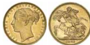
1352* Queen Victoria , 1873 Melbourne. Good extremely fine. $480

Private purchase from Monetarium May 1995.