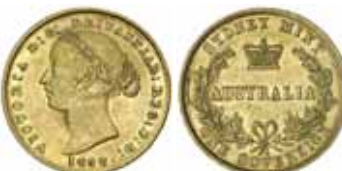
1317* Queen Victoria , second type, 1858. Good very fine and rare. $1,500