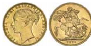
1353* Queen Victoria , 1874 Sydney. Some contact marks, otherwise nearly uncirculated. $800

Private purchase from Monetarium May 1995.