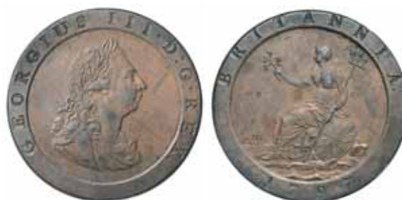
1298* Great Britain , George III, copper cartwheel penny, 1797 (S.3777). Nearly extremely fine.