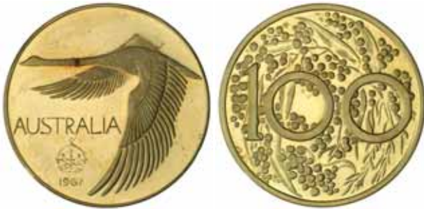
1490* Elizabeth II , unofficial swan pattern dollar, 1967, in gold (22ct, 40.3g, 38mm) plain edge by Andor Meszaros for John Pinches. Some edge knocks, contact marks and hairline scratches in fields, otherwise good extremely fine. $8,000