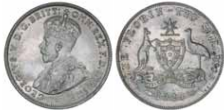
1530* George V, 1928. Peripheral die breaks obverse and reverse, spotting on reverse, uncirculated.