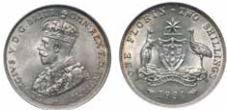
1531* George V, 1931. Full mint bloom, light tone, choice uncirculated.