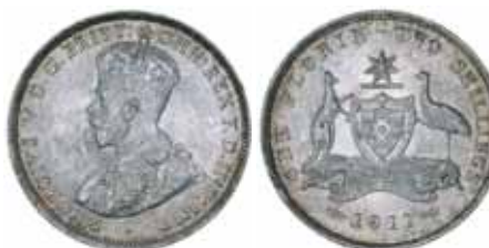
1502* George V, 1911. Frosty bloom, golden peripheral tone, light contact marks, uncirculated.