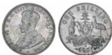
1569* George V, 1921 star. Dirt adhesion on lower right reverse, subdued original mint bloom, nearly uncirculated and rare in this condition.