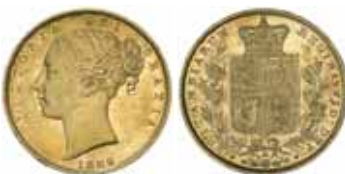
1348* Queen Victoria , 1886 Melbourne. Surface marked, otherwise good very fine/nearly extremely fine and very rare. $11,000