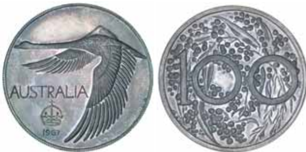
1491* Elizabeth II , unofficial pattern silver swan dollar, 1967, by Andor Meszaros for John Pinches, milled edge. In 'Pattern Crown' case of issue, toned FDC. $1,250 Ex M.Ward Collection.