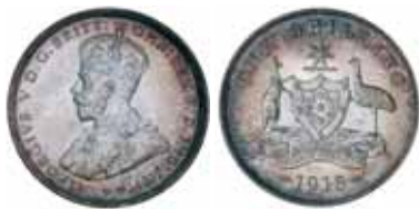
1566* George V, 1918M. Uncirculated.