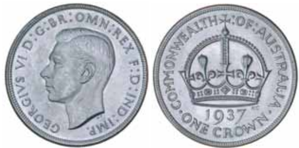
1495* George VI , 1937. Contact marks on obverse, otherwise nearly uncirculated. $180