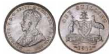
1557* George V, 1911. Well struck, choice uncirculated and rare in this condition.