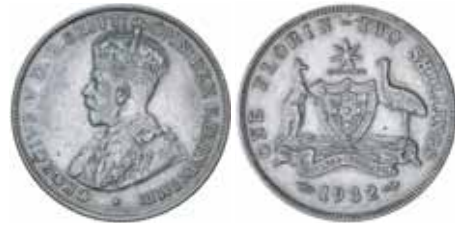
1534* George V, 1932. Good very fine and rare in this condition.