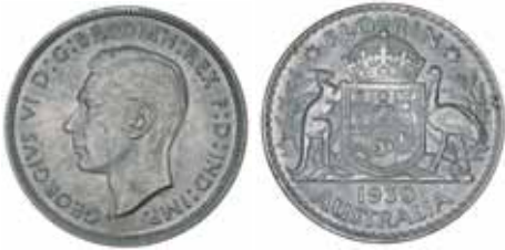
1549* George VI, 1939. Weak strike on crown, uncirculated.