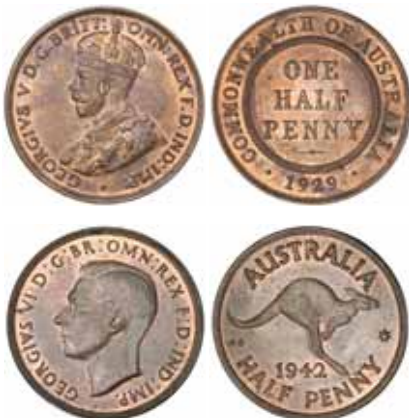
1704 George V - George VI , 1929, 1942. Brown and red, nearly uncirculated. (2) $150