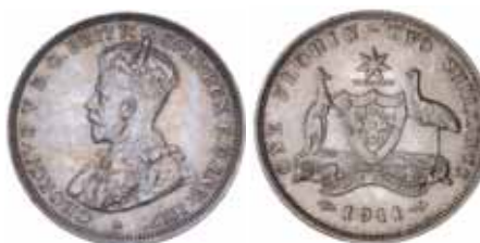
1501* George V, 1911. Lightly toned, well struck, uncirculated.