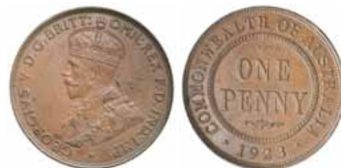
1677* George V , 1923 London die. Well struck bluish brown with traces of red, reverse underlying brilliance, uncirculated.