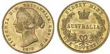
1334* Queen Victoria , second type, 1870. Original mint bloom, nearly uncirculated.