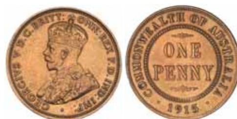
1624* George V, 1915. Cleaned of patina, glossy raw red metal colour, good extremely fine, reverse rim nick at 8.30 o'clock.