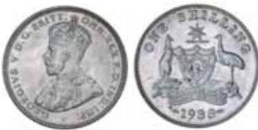
1576* George V, 1933. Uncirculated and rare in this condition.