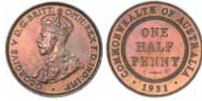
1705* George V , 1931. Dull red brown re-toning, good extremely fine. $100