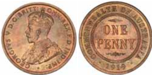
1629* George V , 1919. Subdued re-toning, choice uncirculated.