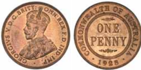
1643* George V , 1928, London die. Peripheral obverse die breaks, subdued full mint red, choice uncirculated and rare in this condition.