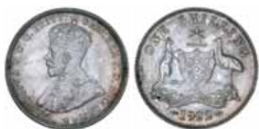
1571* George V, 1922. Nearly uncirculated.