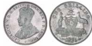
1578* George V, 1936. Toned, uncirculated.