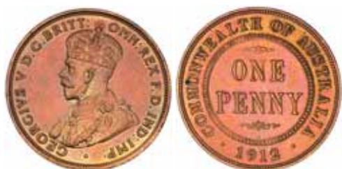
1621* George V, 1912H. Cleaned of patina, glossy raw red metal colour, unmarked good extremely fine.