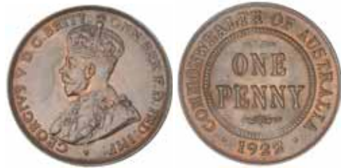
1676* George V , 1922, London die. Brown and red, uncirculated.