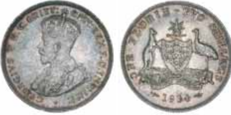
1505* George V, 1914. Toned, nearly uncirculated.