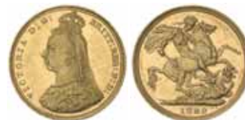
1367* Queen Victoria , 1889 Sydney (McD.178). Nearly uncirculated.