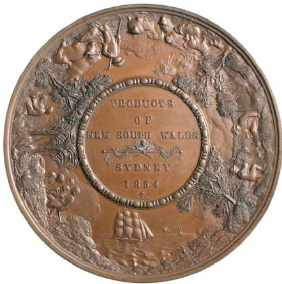
2833* Products of New South Wales, Sydney, 1854, exhibition medal in bronze (73mm) by L.C.Wyon (C.1854/5). In beautiful condition without any friction, brilliant bronzed finish, FDC and probably the finest known.