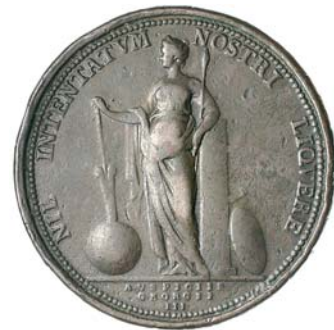
2822* Captain James Cook , memorial medal in bronze (43mm) by L.Pingo for the Royal Society in 1784 (MH.374; BHM.258; Eimer 780). A worn, battered and bruised example with dark brown patina, fine.