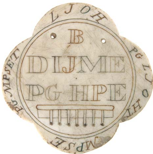
lot 2824 reverse

It is of interest to note that the images of a moon, sun and stars was also a feature of the Charlotte Medal made by a convict on the First Fleet when it arrived at Botany Bay in 1788.