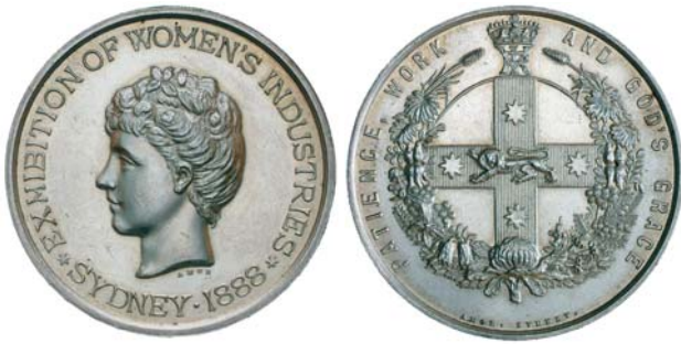
2855* Exhibition of Women's Industries Sydney, 1888 , in silver (39.5mm) (C.1888/14), by Amor, Sydney, unnamed. Nearly extremely fine.