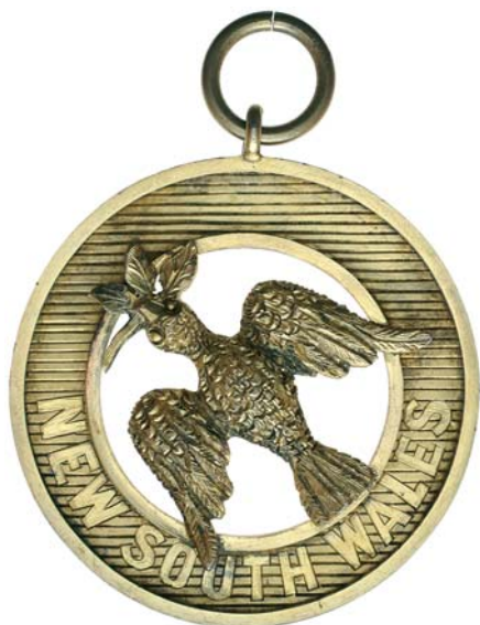
lot 2946 part