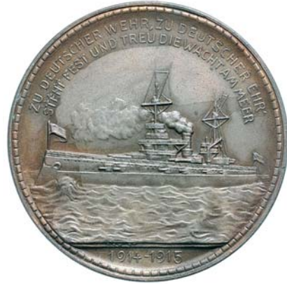
2886* Captain von Muller, SMS Emden, 1914 , in bronze (54mm) by M.& W. St (Mayer and Wilhelm, Stuttgart), not in M.H. Light to medium brown tone, good extremely fine and rare.