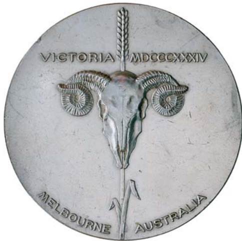
2902* Victoria, Melbourne Centenary Celebrations, 1934 , in silver (64mm) (C.1934/9), by G.Rayner Hoff. Edge nicks and scuff marks, otherwise very fine and scarce in silver.