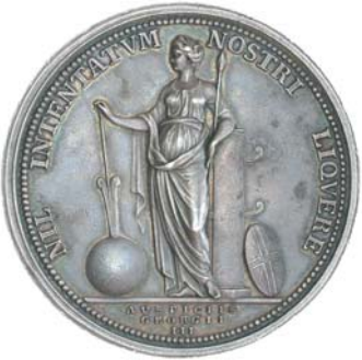
2819* Captain James Cook , memorial medal in silver (43mm) by L.Pingo for the Royal Society in 1784 (MH.374; BHM.258; Eimer 780). Dark gun metal grey toned, slight rim bruises at 6 and 9 o'clock on the obverse, otherwise good extremely fine, only 291 struck.