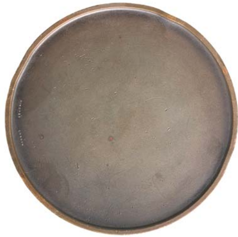
2906 Stations of the Cross, The Resurrection , in bronze (64mm) by Andor Meszaros. Uncirculated.