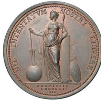
2821* Captain James Cook , memorial medal in bronze (43mm) by L.Pingo for the Royal Society in 1784 (MH.374; BHM.258; Eimer 780). Attractive red brown bronzed finish, nearly uncirculated, one of the 574 struck, sold at 10S 6d each.