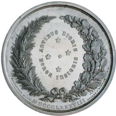
2856* Centennial International Exhibition Melbourne, 1888 , in silver (51mm) by Stokes & Martin (C.1888/8), edge inscribed, 'William Vial And Son'. Hairlines and a few minor edge nicks, otherwise extremely fine.