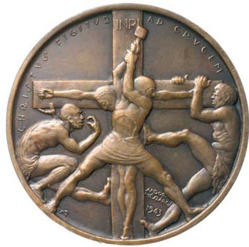
2905* Stations of the Cross, Christ nailed to the Cross , in bronze (64mm) by Andor Meszaros, 1943. Edge bruises, very fine.

Ex Terry Naughton Collection, from Strand Coins, 15/8/12.