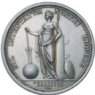
2820* Captain James Cook , memorial medal in silver (43mm) by L.Pingo for the Royal Society in 1784 (MH.374; BHM.258; Eimer 780). Slightly polished with surface marks, nearly extremely fine, only 291 struck.