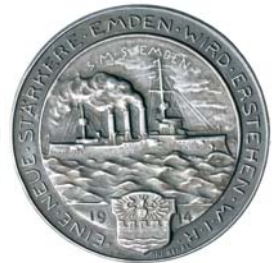
2887* Captain von Muller, SMS Emden, 1914 , in silver (33mm) (18.14g) by Zeigler/Grunthal (MH.430a). Dark tone, nearly extremely fine.