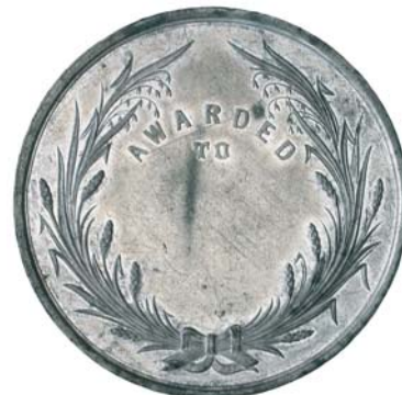
2835* Opening of the Victorian Exhibition, 1872, in white metal (47mm) (C.1872/3 variant), by Stokes & Martin, reverse, wreath and inside 'AWARDED/TO', unnamed. A few slight edge marks, some toning, otherwise good very fine.