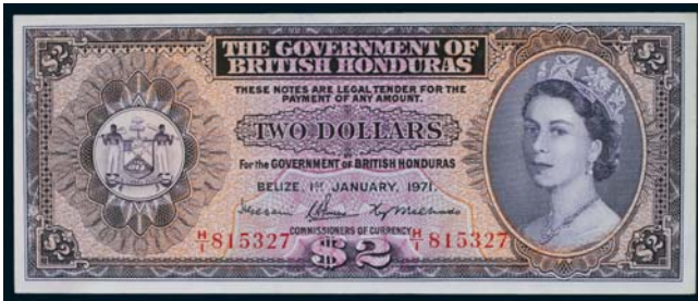
3309* British Honduras , The Government of British Honduras, Elizabeth II, two dollars, 1st January, 1971, H/1 815327 (P.29c). Uncirculated and scarce in this condition. $180