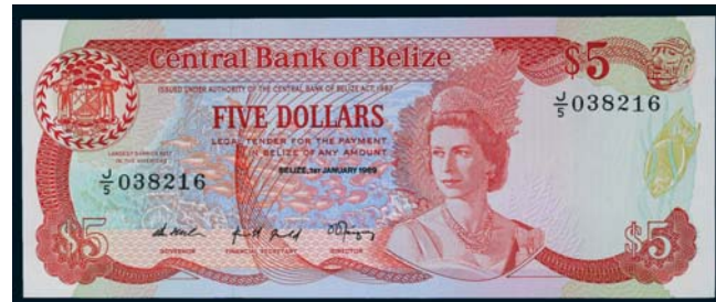
3288* Belize, Central Bank of Belize, Elizabeth II, five dollars, 1st January 1989, J/5 038216 (P.47b); ten dollars, 1st January 1987, P/5 210931 (P.48a); twenty dollars, 1st January 1986, T/5 129035 (P.49a). Uncirculated and scarce. (3)