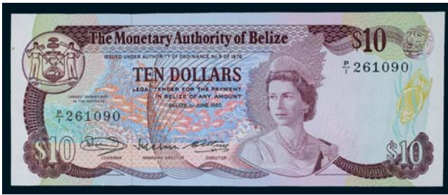
3282* Belize, The Monetary Authority of Belize, Elizabeth II, ten dollars, 1st June 1980, P/1 261090 (P.40a). Uncirculated and scarce.