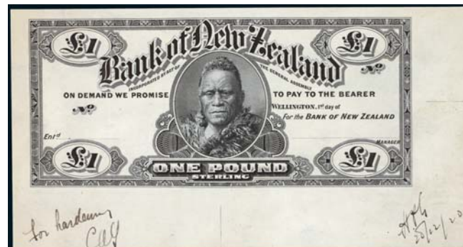
3198* Bank of New Zealand , uniform issue, printer's proof, uniface on paper, one pound, Wellington, 1st day of....., with comments 'For Hardening' and date '20/12/20' in pen in extended bottom margin (L.467; P.S235Act; Robb 17a). Nearly uncirculated and rare.