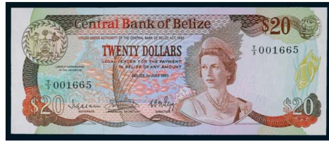
3286* Belize, Central Bank of Belize, Elizabeth II, twenty dollars, 1st July 1983, T/3 001665 (P.45). Uncirculated and rare.