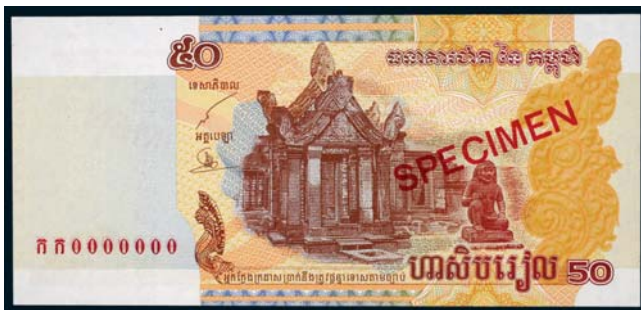
3321* Cambodia, National Bank of Cambodia, 1995-99 issue, specimen set of fifty, one hundred, two hundred, five hundred and one thousand riels (2), all prefixed and numbered 0000000, with SPECIMEN in red diagonally on fronts and backs (P.41s, 43s, 44s, 51s, 52s). Uncirculated. (5) $150