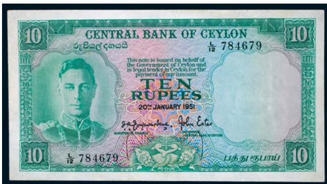
3333* Ceylon, Central Bank of Ceylon, George VI, ten rupees, 20th January 1951, L/12 784679 (P.48a). Virtually uncirculated and rare thus. $400