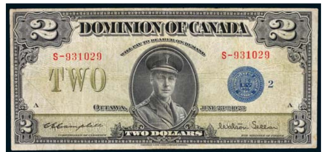
3324* Canada, Dominion of Canada, two dollars, Ottawa, June 23rd 1923, S-931029 (P.34i). Flattened, fine or better and scarce. $200