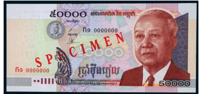
3322 Cambodia, National Bank of Cambodia, 1995 issue, five thousand, ten thousand and fifty thousand riels, all with prefixes and numbered 0000000, SPECIMEN in red diagonally both sides (P.55s, 56s, 57s). Uncirculated. (3) $100