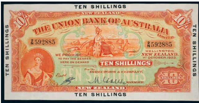
3205* The Union Bank of Australia Limited, uniform issue, ten shillings, Wellington, 1st October 1923, 2/N 592885, imprint of Waterlow & Sons Limited, London, without STERLING (P.S371b; Robb M.81; L.542). Light creases, nearly extremely fine and very rare, especially in this condition. $3,500