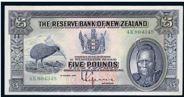
3219* Reserve Bank of New Zealand, L.Lefeaux, 1st August 1934, five pounds, 4K 804348 (P.156) last prefix. Flattened, good very fine. $600