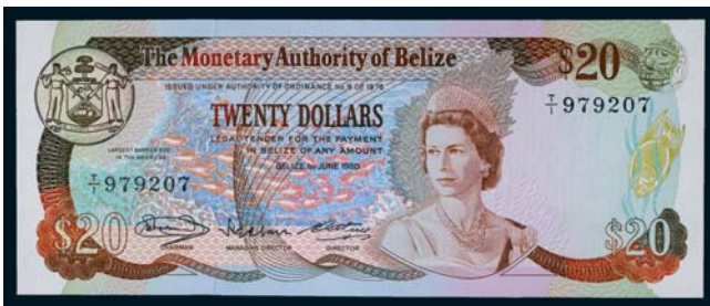
3283* Belize, The Monetary Authority of Belize, Elizabeth II, ten dollars, 1st June 1980, T/1 979207 (P.41a). Uncirculated and scarce.