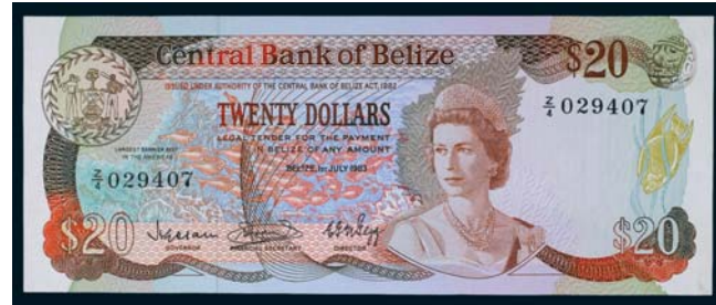
3287* Belize, Central Bank of Belize, Elizabeth II, twenty dollars replacement note, 1st July 1983, Z/4 029407 (P.45r). Uncirculated and rare.