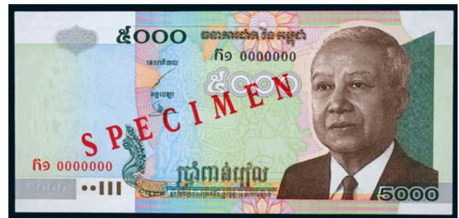
3323* Cambodia, National Bank of Cambodia, 2001 issue, five thousand, ten thousand and fifty thousand riels, all with prefixes and numbered 0000000, SPECIMEN in red diagonally both sides (P.55s, 56s, 57s). Uncirculated. (3) $180