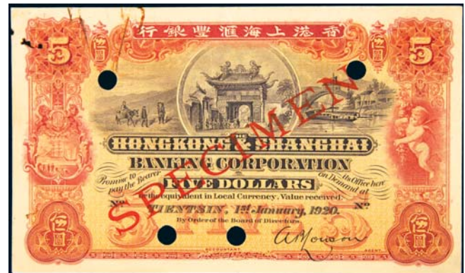
3335* China, The Hong Kong & Shanghai Banking Corporation, specimen note, ten dollars local currency, Tientsin, 1st January 1920, imprint of Waterlow & Sons, Limited, Great Winchester Street, London, England, perforated with four large holes, stamped SPECIMEN across front of note in red (PS. 382s). Rust holes and paper clip rust marks in corner area, otherwise nearly extremely fine and extremely rare. $2,000