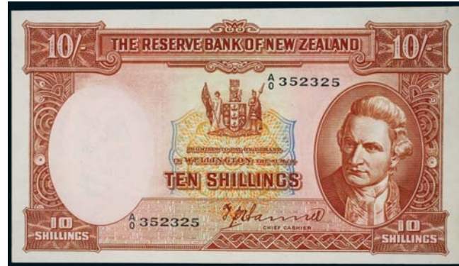
3220* Reserve Bank of New Zealand, T.P.Hanna (1940-56) A/0 352325 (P.158a) first prefix of type. Virtually uncirculated and very rare in this condition. $750