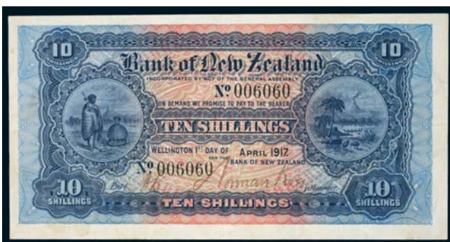
3195* Bank of New Zealand , seventh issue, ten shillings, Wellington, 1st April 1917, No. 006060, '10 Shillings' in top corners, imprint of Bradbury Wilkinson & Co Ld, London (P.S222b; Robb.D.711; L.456). Quarter folds, crisp original paper, nearly very fine and rare.