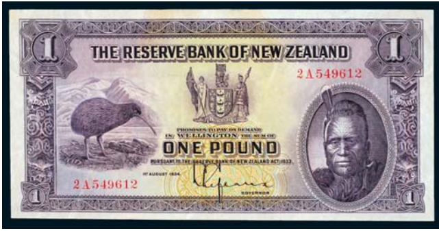
3217* Reserve Bank of New Zealand, L.Lefeaux, 1st August 1934, one pound, 2A 549612 (P.155). Creases and folds, two repaired tears in top margin, otherwise nearly very fine. $130