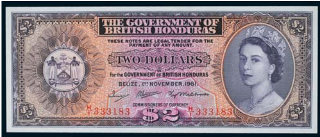
3308* British Honduras , The Government of British Honduras, Elizabeth II, two dollars, 1st November, 1961, H/1 333183 (P.29b). Uncirculated and rare in this condition. $300