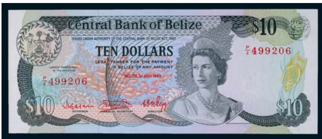
3285* Belize, Central Bank of Belize, Elizabeth II, ten dollars, 1st July 1983, P/4 499206 (P.44a). Uncirculated and scarce.