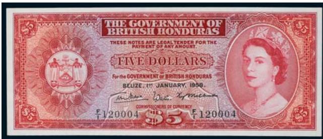
3310* British Honduras , The Government of British Honduras, Elizabeth II, five dollars, 1st January, 1958, F/1 120004 (P.30a). Uncirculated and very rare in this condition. $750