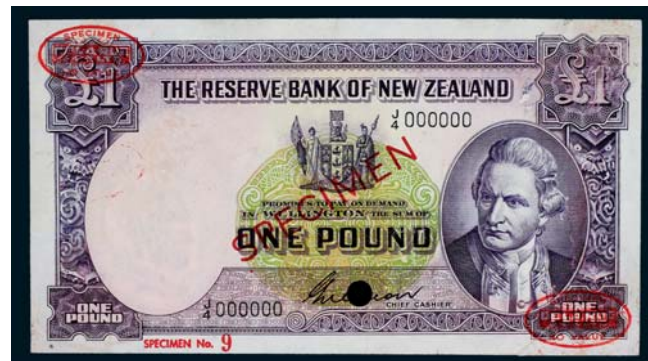
3223* Reserve Bank of New Zealand, G.Wilson (1955-56), specimen one pound, J/4 000000, imprint of Thomas de la Rue & Company Limited, London on back and their SPECIMEN/NO VALUE lozenge in red in two opposite corners on front and back, SPECIMEN in red diagonally both sides, SPECIMEN No. 9 in red bottom left margin on front, single punch hole cancellation at signature (P.159bs). A partially repaired 1cm tear at bottom right, slight delamination top right, back faded, otherwise extremely fine. $1,000