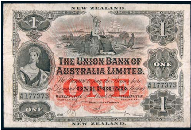
3204* The Union Bank of Australia Limited, fourth issue, one pound, Wellington, 1st March 1905, No. 4/N 177373, imprint of Waterlow & Sons, Ltd. London (Robb M.42; L.533, P.S362b). Soiled, folds and creases, fine. $1,500