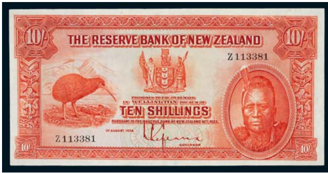
3210* Reserve Bank of New Zealand, L.Lefeaux, 1st August 1934, ten shillings, Z 113381 (P.154). Flattened on folds, a little dirty on back, otherwise very fine.