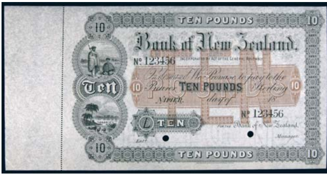
3193* Bank of New Zealand , third issue, specimen ten pounds, Napier 18-, No. 123456, imprint of Bradbury, Wilkinson & Co, Engravers & c London, two hole cancellation in signature reserve (Robb D.35; L.447; P.S193). Uncirculated and very rare.