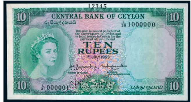
3334* Ceylon, Central Bank of Ceylon, Elizabeth II, specimen ten rupees, 1st July 1953, discordant serial numbers L/30 1000000 - L/21 000001, imprint of Bradbury Wilkinson & Co Ld, New Malden, Surrey, England, SPECIMEN perforated at lower centre, numbered 12345 in top margin on front, printer's instructions '0/84416 - 5/8/52' panned in back top margin (P.55s). Virtually uncirculated and very rare. $500