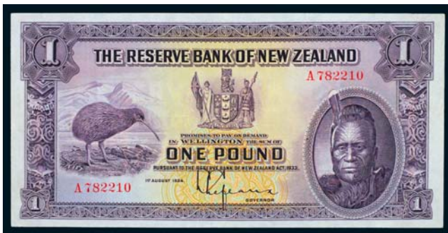
3212* Reserve Bank of New Zealand, L.Lefeaux, 1st August 1934, one pound, A 782210 (P.155). Flattened of folds, good very fine.