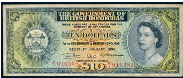
3311* British Honduras , The Government of British Honduras, Elizabeth II, ten dollars, 1st January, 1958, F/1 016382 (P.31a). Fine and scarce. $100