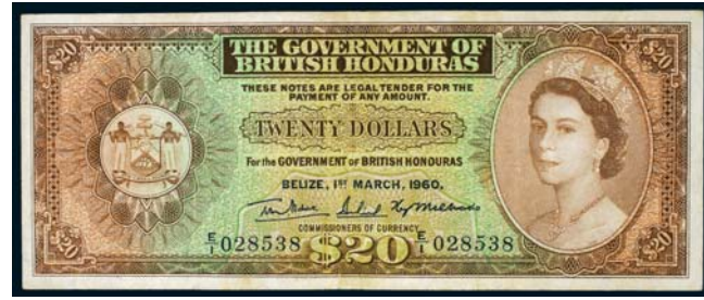
3312* British Honduras , The Government of British Honduras, Elizabeth II, twenty dollars, 1st March, 1960, E/1 028538 (P.32a). Very fine and scarce. $150