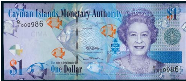
3331* Cayman Islands, Cayman Islands Monetary Authority, Elizabeth II, set of one, five, ten, twenty five, fifty and one hundred dollars, 2010 series, matching serial numbers D/1 000986 (P.38a-43a). Uncirculated, only 1,000 sets issued. (6) $450