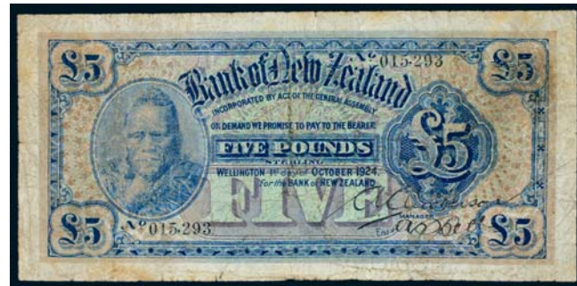
3197* Bank of New Zealand , uniform issue, five pounds, Wellington, 1st October 1924, arched bank name, black serial numbers 015,293, imprint of Bradbury Wilkinson & Co Ltd New Malden, Surrey (P.S235; Robb D.841; L.469). Many folds and creases, small margin tears, a full note, very good and scarce.