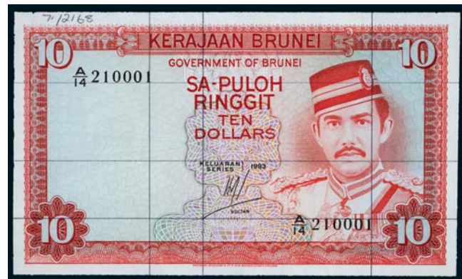
lot 3314 part