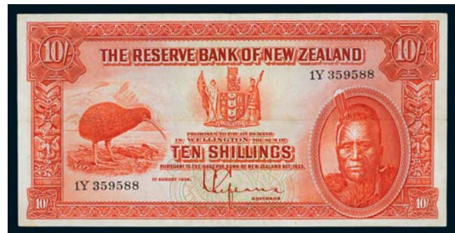
3209* Reserve Bank of New Zealand, L.Lefeaux, 1st August 1934, ten shillings, 1Y 359588 (P.154). Flattened of folds, otherwise very fine. $500

Ex Noble Numismatics Sale 62 (lot 3381).