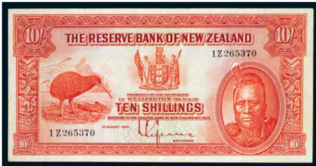
3211* Reserve Bank of New Zealand, L.Lefeaux, 1st August 1934, ten shillings, 1Z 265370 (P.154). Folds and creases, original crisp paper, nearly very fine.

Ex Noble Numismatics Sale 81 (lot 2555).