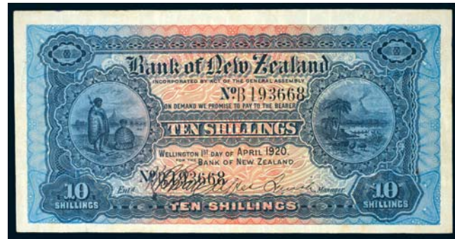
3196* Bank of New Zealand , seventh issue, ten shillings, Wellington, 1st April 1920, No. B 193668, words and figures omitted from back, imprint of Bradbury Wilkinson & Co. Ld. London (P.S224; Robb D.711; L.458). Original body to paper, nearly very fine and very rare.