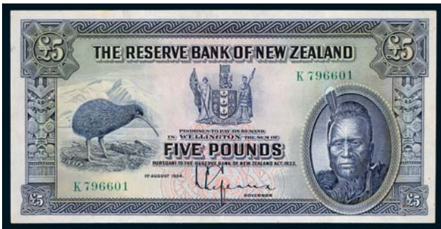
3218* Reserve Bank of New Zealand, L.Lefeaux, 1st August 1934, five pounds, K 796601 (P.156). Crisp and original, minor tone spots bottom right, otherwise nearly extremely fine and rare thus. $800