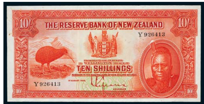
3208* Reserve Bank of New Zealand, L.Lefeaux, 1st August 1934, ten shillings, Y 926413 (P.154). Minor tone spotting, crisp original body, good very fine and rare. $800