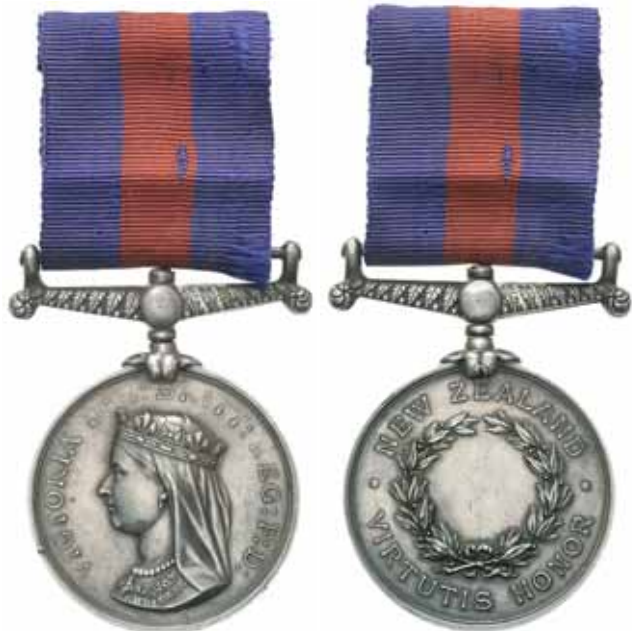
5124* New Zealand Medal 1869 , undated reverse. 3156 Pte. G. Byford. 40th Foot. Engraved. Small edge nick on obverse, otherwise very fine.