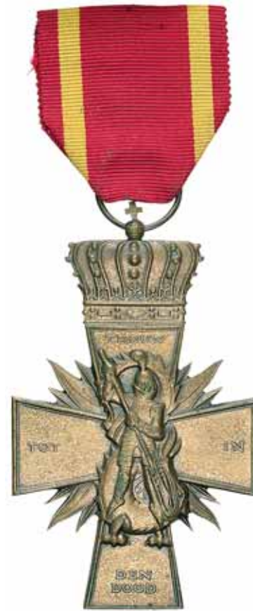
5291* Netherlands , Resistance Cross for Europe 1940-1945. Good very fine. $500