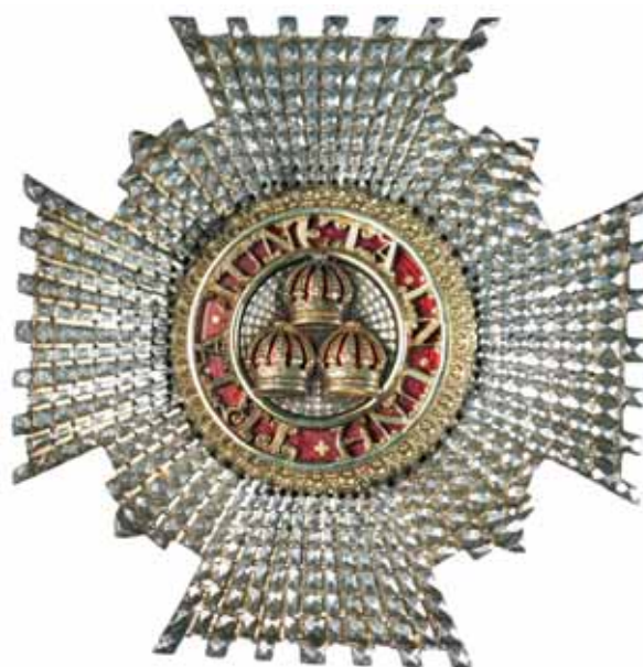
5084* The Most Honourable Order of the Bath, Knight Commander (KCB) (Civil) breast star. Extremely fine.