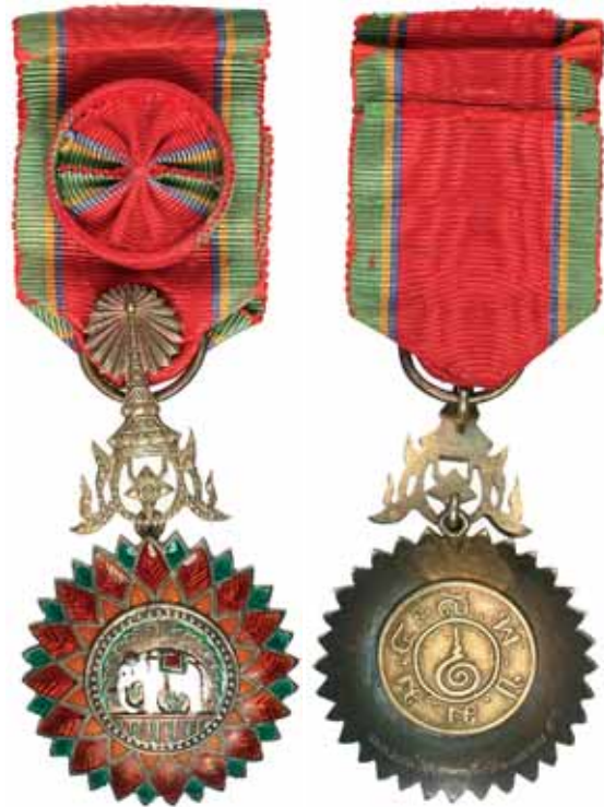
5324* Thailand , Order of the White Elephant, Commander (?) breast badge. Nearly extremely fine.