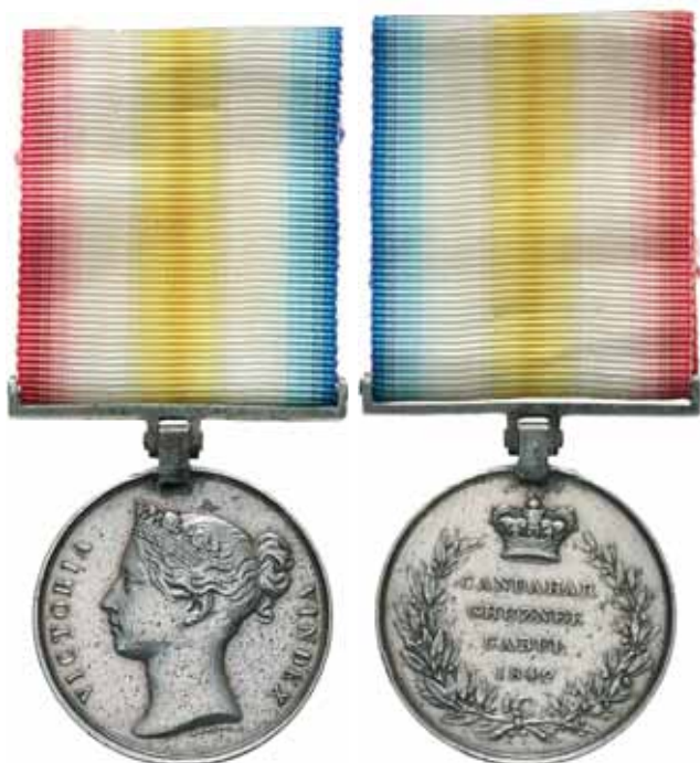
5088* Candahar Ghuznee Cabul Medal 1842. Private Thomas Surridge H.M.40th Regt. Engraved in running script, Naming very worn but legible and medal with many contact marks, otherwise fine.