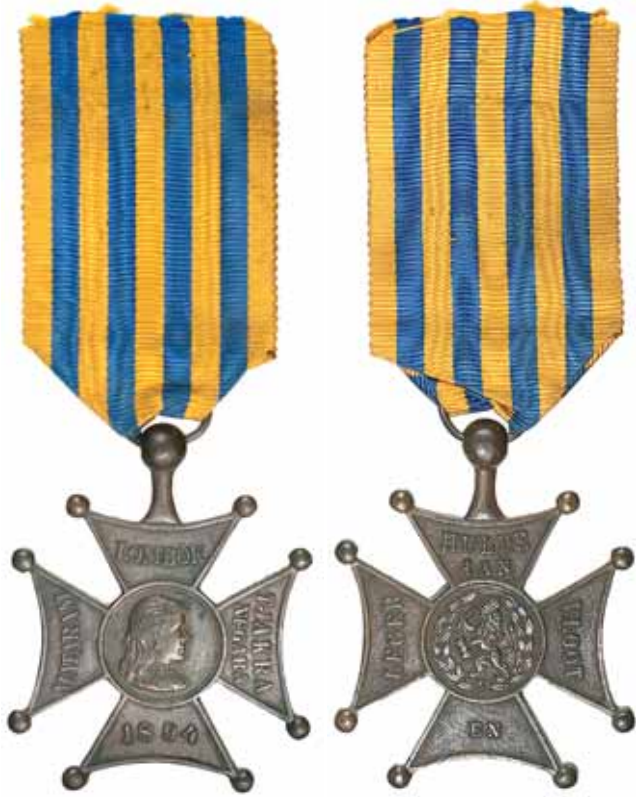
5281* Netherlands , Lombok Cross 1894. Toned good very fine. $100