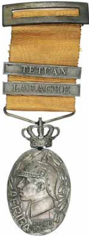
5303* Spain , Morocco Campaign Medal (Marruecos on obverse), - two clasps - Larache, Melilla; Rif Campaign Medal (Campania Del Rif on obverse), eight clasps - Quebdana, Zoco El Jemis, Sidi Hamed El Hach, Pennon-Alhucemas, At Laten, Penon-Alhucemas (2nd), Quebdana, Taxdirt-Hidum-Zoco El Had; Africa Campaign Medal (Africa on obverse), - two clasps - Larache, Tetuan. Very fine. (3)