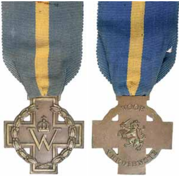
5287* Netherlands , Cross of Merit 1941. Good very fine. $150