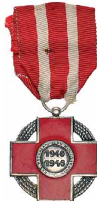
5292* Netherlands , Red Cross Memorial Cross 1940-1945. Very fine. $100