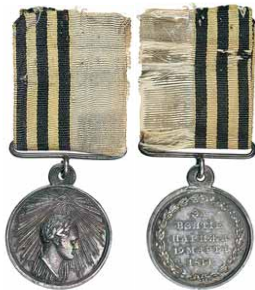
5311* Russia , Medal for Taking of Paris 1814, in silver (28mm). Nicely toned, very fine and scarce.