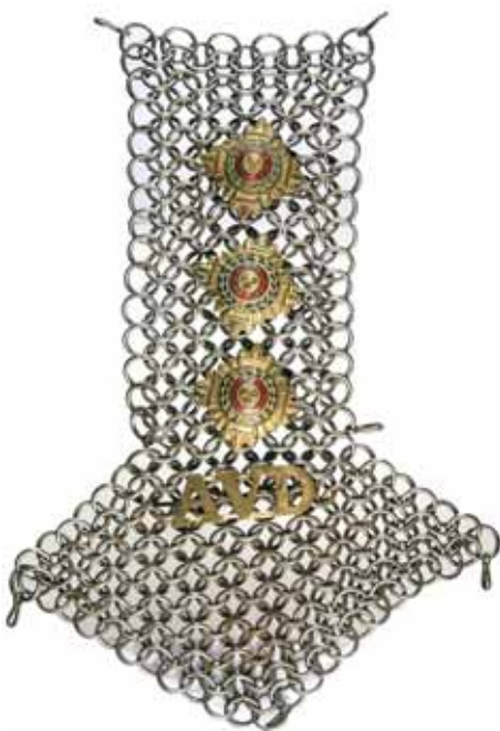
lot 5146 part

Together with multi-ringed metal shoulder board with three gilt and enamel pips (Captain); title in brass, AVD; two small gilt buttons (QVC) Army Veterinary Dept; riding crop decorated at top with a squirrel; photo in uniform mat framed under glass in timber frame (35x42.5cm).