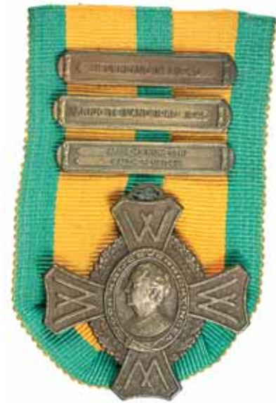
5283* Netherlands , Expedition Cross - two clasps - Kleine Soenda-Eilanden 1905-1909, Atjeh 1906-1910; Commemorative War Cross, - three clasps - Nederland Mei 1940, Krijg Te Land 1940-1945, Arnhem-Nijmegen Walcheren 1944, back of mounting ribbon with embroidered name, Fa.A.Tack/Breda. Good very fine. (2)