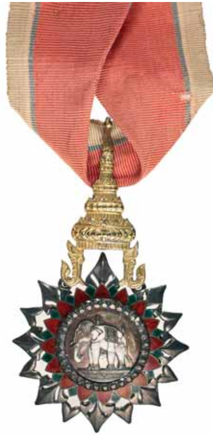
5323* Thailand , Order of the White Elephant, Commander neck badge. In case of issue, ribbon very faded and torn, medal toned extremely fine.