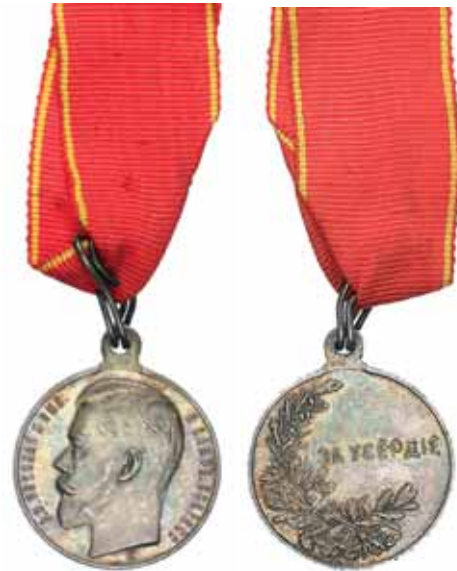
5310* Russia , Nicholas II Medal for Zeal, silver breast medal (28mm) on St Anne ribbon. Nicely toned, extremely fine.