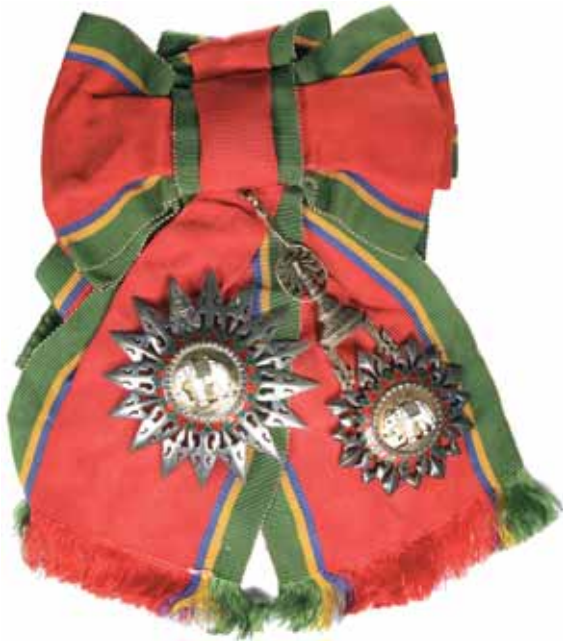
5322* Thailand , Order of the White Elephant, Knight Commander sash with badge and with breast star. Nearly extremely fine. (2)