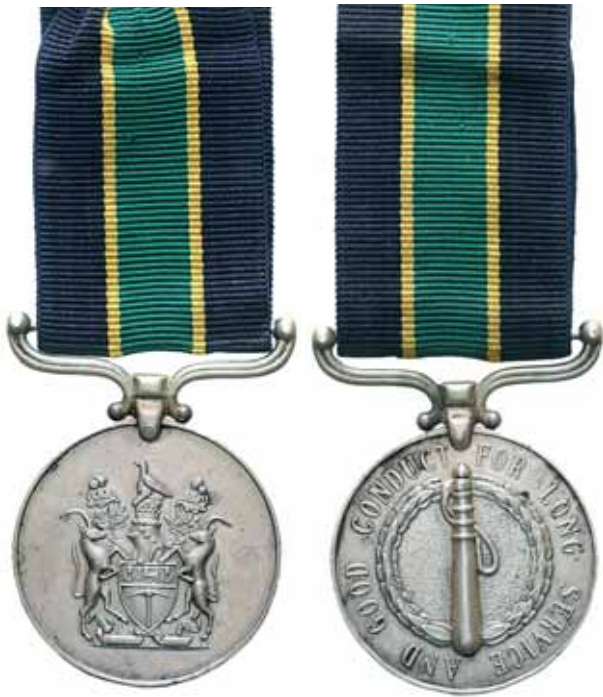
5306* Rhodesia , Police Long Service and Good Conduct Medal. 13785 Const. Murambiwa. Impressed. A few edge bumps, very fine.