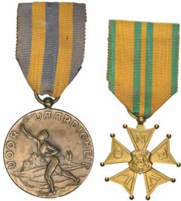
5285* Netherlands , Skills Medal of the Royal Dutch-Indian Army 1919, in bronze for first successful participation; Vierdaagse Cross (Nijmegen Marches Cross) pre 1959, in gilt bronze for first or second successful march. Good very fine; extremely fine. (2)