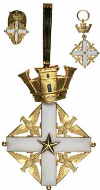
5266* Italy , Order of Merit of the Italian Republic, Commander, neck badge (suspension ring stamped 750), with miniature of the Order (suspension ring stamped 750) and a lapel badge of the Order (reverse stamped 750). Missing ribbons, some toning to parts of enamel on main medal, otherwise virtually uncirculated.