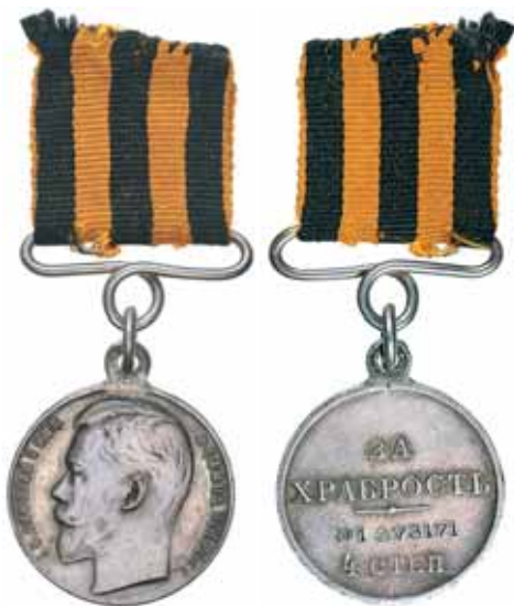
5308* Russia , St George Medal for Bravery Fourth Class, reverse impressed, No1 273171. Very fine.