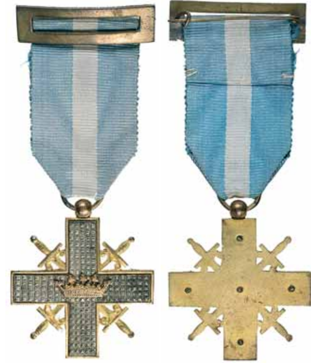
5304* Spain , War Cross 1936-39. Nearly extremely fine.