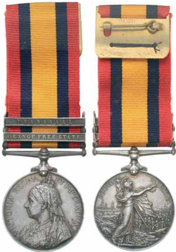
5138* Queen's South Africa Medal 1899 , (type 3 reverse), - two clasps - Orange Free State, Transvaal. 2090 Tpr: P.H.Richards. N.S. Wales M.R. Impressed. Nice mottled toning, very fine.