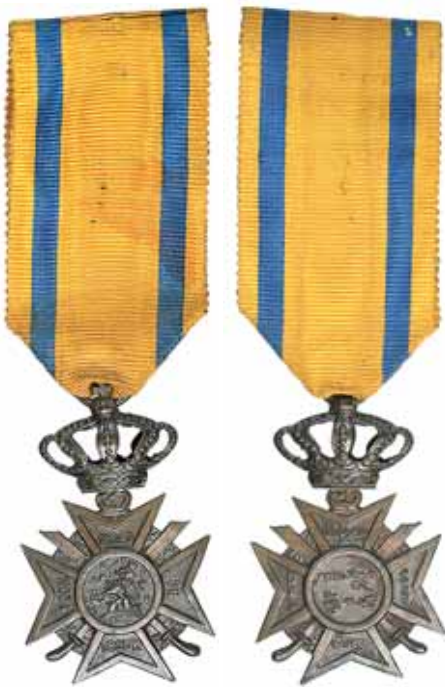
5282* Netherlands , Cross for Bravery and Loyalty 1898, issued to islanders serving with Dutch East Indies Army, with Javanese inscription on reverse and hence very rare. Extremely fine. $900