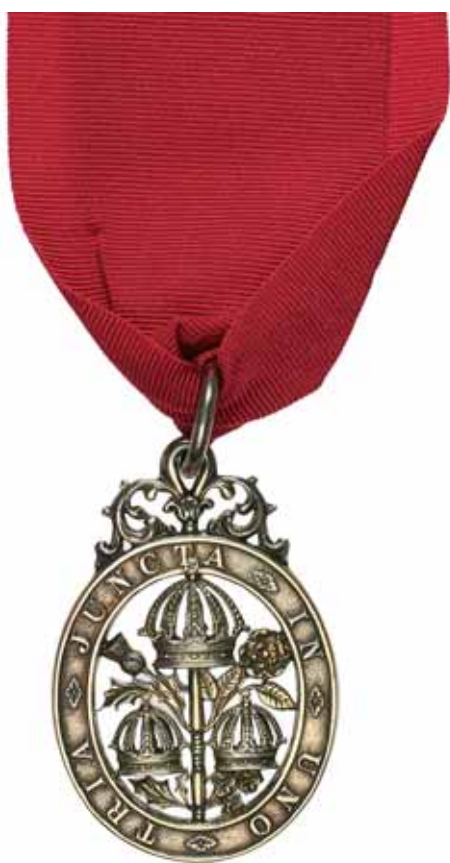
5083* The Most Honourable Order of the Bath, Knight Grand Cross (GCB) (Civil) sash badge in gilt-silver with neck ribbon. Extremely fine.