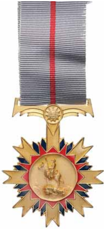
5321* South West Africa Police , Star for Distinguished Merit, in gilt and enamel. Uncirculated.