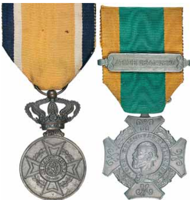
5280* Netherlands , Medal of the Order of Orange Nassau in bronze; Expedition Cross - clasp - Atjeh 1873-1890. Extremely fine. (2)