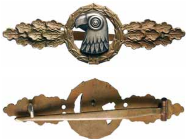
5265* Germany , Third Reich, Squadron Clasp for Reconnaissance Pilots, Bronze grade. Extremely fine.