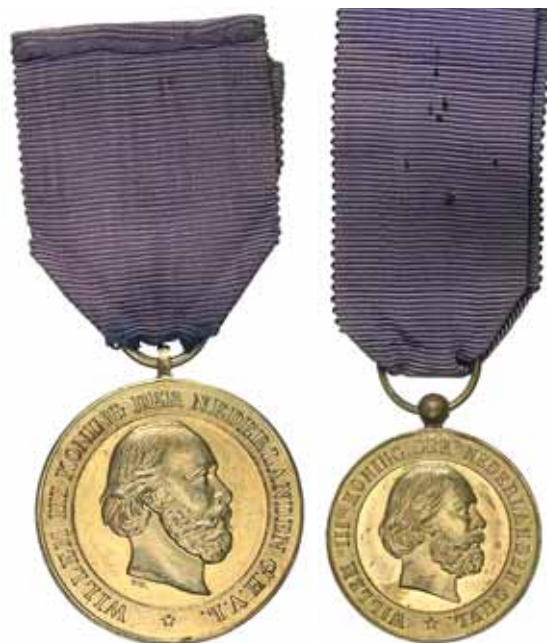
5279* Netherlands , Atjeh Campaign Medal 1873-1874 (also known as the Kraton Medal), in gilt bronze (36x3mm); another but in a reduced size (29x2mm). Extremely fine; good very fine. (2)