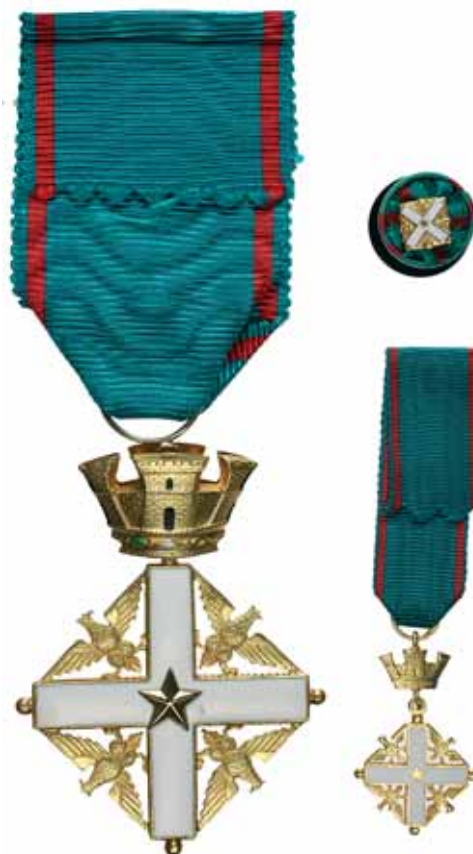
5267* Italy , Order of Merit of the Italian Republic, Knight, breast badge in case of issue with miniature of the Order (suspension ring stamped 750) and a lapel badge of the Order. Virtually uncirculated.