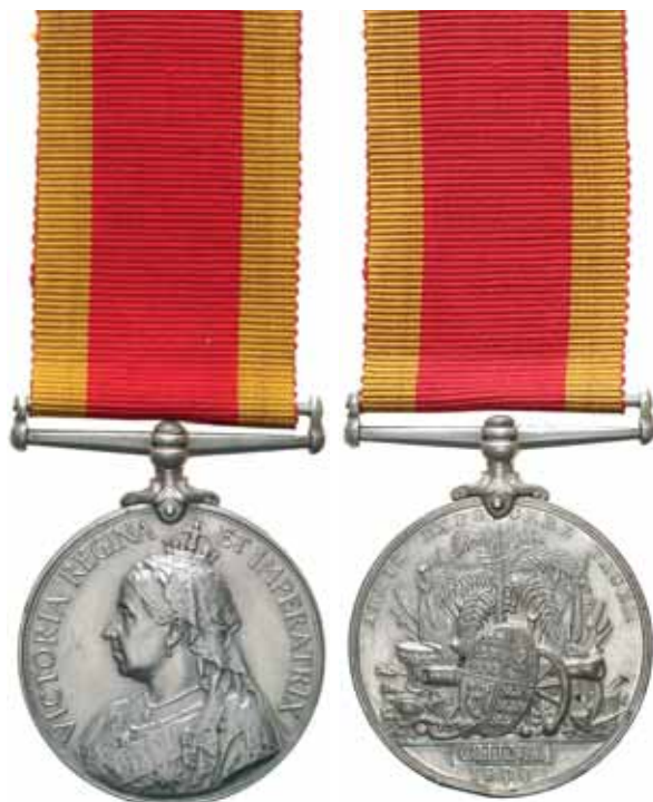
5149* China War Medal 1900. C.E.Holmes Boy., Victoria. Nav. Cont. Impressed. Mounted on black felt backing board, minor edge bump, otherwise extremely fine.