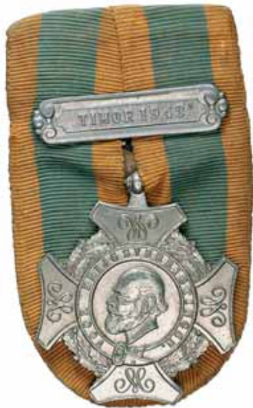
5284* Netherlands , Mobilization Cross 1914-18; Mobilization Cross 1939; Expedition Cross - clasp - Timor 1942. Good very fine. (3)