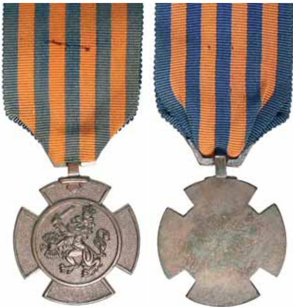
5289* Netherlands , Bronze Lion Decoration 1944. Extremely fine. $120