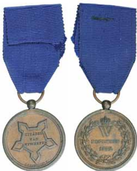
5278* Netherlands , Siege of Antwerp Medal 1832. Very fine.