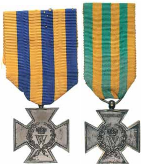
5277* Netherlands , Hasselt Cross 1830-1831; another but Volunteer issue (VRIJWILLIG at top arm on obverse). Good very fine; very fine. (2)