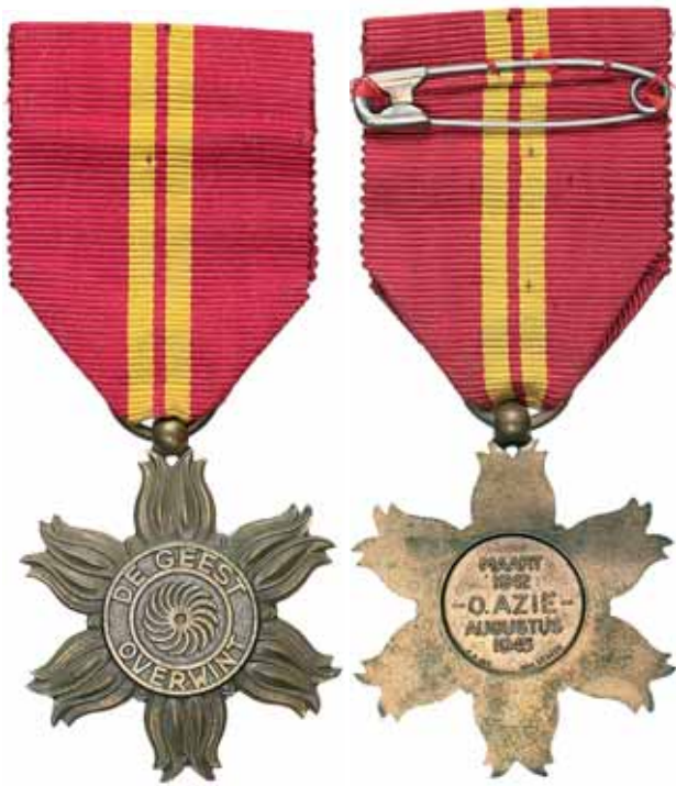
5293* Netherlands , Resistance Star for East Asia 1942-1945. Good very fine.