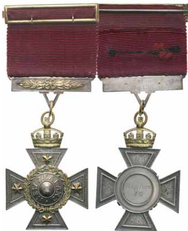
5089* New Zealand Cross 1869, official replica by P&F Ltd in 18ct gold and sterling silver, with brooch bar, reverse centre marked, 'Replica 49', being a limited edition made officially in the 1980s from original dies. In original case of issue, uncirculated.