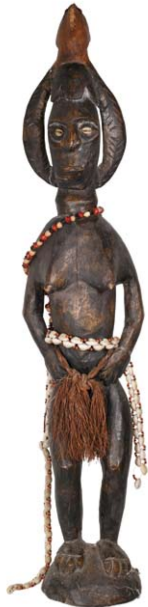
2489* New Guinea , 20th century, wooden fertility tiki, of elongated form with headdress, beaded necklace, grass belt and prominent phallus, (58cm high). Very fine. $100