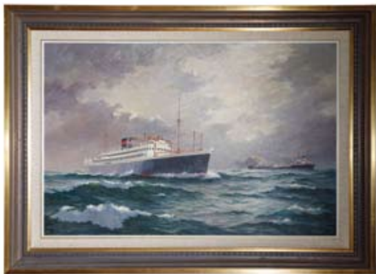
2423* Hansen, Ian , (1948-), oil on canvas, framed, (90cm x 60cm), 'The MV Duntroon', off the coast of Australia. Very fine. $1,500

Royal Caroline was one of the most sumptuously decorated vessels of all time. She was sailed for pleasure cruises by the royal family, and as a transport for members of court sailing between England and Holland. She was usually escorted by as many as four frigates and, when the King was aboard, accompanied by the First Lord of the Admiralty.