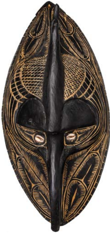
2486* Papua New Guinea , Sepik, 19th century, large hardwood spiritual face mask, of elongated form with stylised nose and headdress, (610mm long). Very fine and scarce. $100