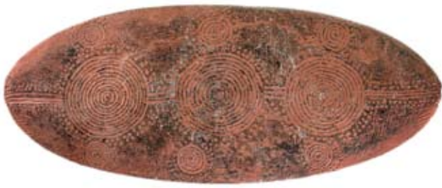
2476* Australia , Aboriginal stone churinga, flat stone covered in red ochre, with incuse rings, lines and dots on both sides (10.5x26cm). Very fine.