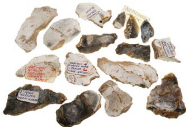
2432* Neolithic (New Stone Age) rock collection , includes small axe head, small blade, arrow heads, spoon scrapers and various other pieces. Fine . (16)