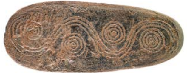
2477* Australia , Aboriginal stone churinga, flat stone, with incuse rings and lines on one side and incuse rings and winding lines on the other side (9.5x24cm); another but with incuse rings on both sides (8x14.8cm). The first with traces of red ochre, nearly fine, the second with no red ochre, good. (2)