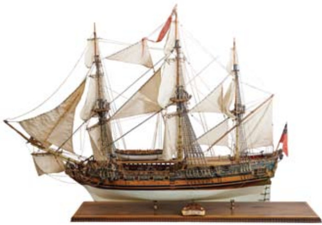
2422* HMY Royal Caroline Model , by V.T.Priest, 1991, (95cm long x 80cm high), full timber construction, with intricate detail including canvas sails, rigging and metal fittings of canon and lamps. Slight damage, otherwise very fine and scarce.