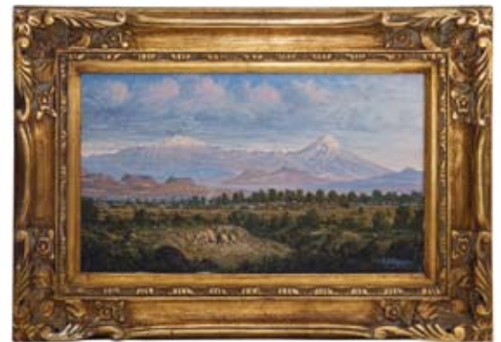
2425* Oropeza, Miguel , 20th century, framed oil on canvas, 50cm x 30cm, Mexican panoramic landscape depicting a settlement in the foreground with desert landscape and snowcapped mountains in the distance. Very fine. $500

The MV Kanimbla was converted to an armed merchant cruiser (the HMAS Kanimbla) in WWII. She was present during the Japanese midget sub attack in Sydney Harbour in 1942.