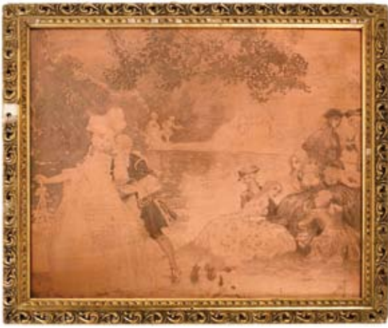
2427* Lindsay, Norman , etched copper plate, 'Gossip', 1934, original copper plate depicting an 18th century French scene with figures by a lake, (33.1 x 23.4cm). Very fine and scarce .