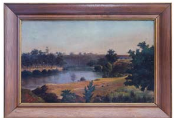
2426* Adams, J. , (19th century), oil on board, depicting an Australian landscape scene with river, dated 1889, (40cm x 25cm), framed. Very fine. $100