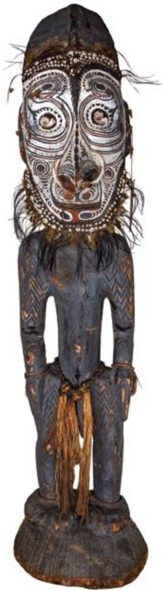
2480* New Guinea , Latmul people, 20th century, tribal ancestral figure, of monumental form, standing with arms flat, elaborately painted face with white and red highlights, shell inlays, boar tusks through nose, grass belt, (164cm high). Very fine and scarce.