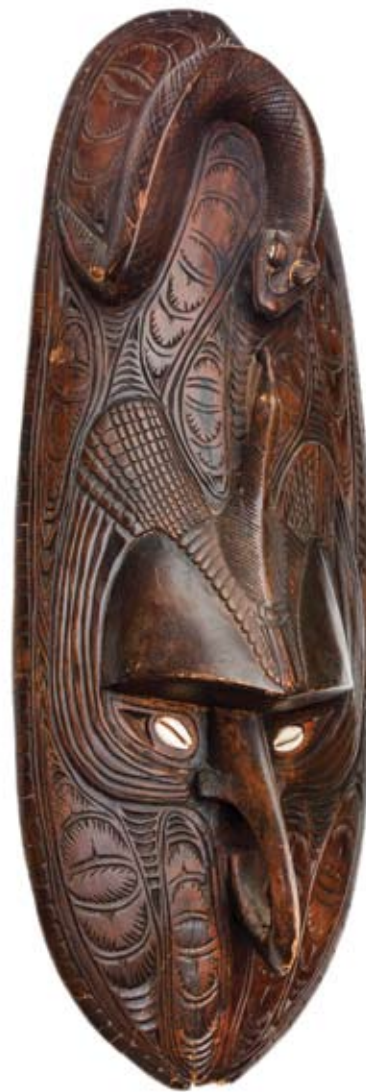
2482* New Guinea , 20th century, dark timber mask, of monumental form, highly carved with elaborate snake and bird above forehead, cowrie shell inlaid eyes, (115cm high). Very fine.