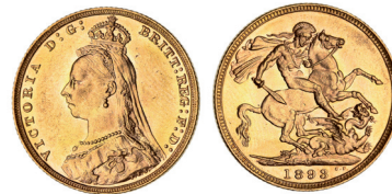
1679* Queen Victoria, Jubilee head, 1893 Melbourne. Nearly uncirculated. $850