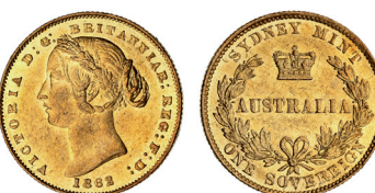
1573* Queen Victoria, second type, 1862. Original frosty mint bloom, good extremely fine and rare. $2,800 Ex David Ross Collection, from Spink Australia Sale 19 (lot 2479).