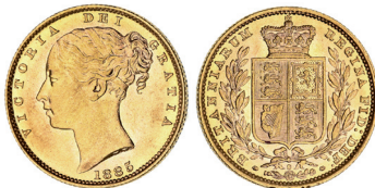
1621* Queen Victoria, 1885 Sydney. Uncirculated. $1,000

Ex Chris Hall Collection, Noble Numismatics 96 (lot 1406).