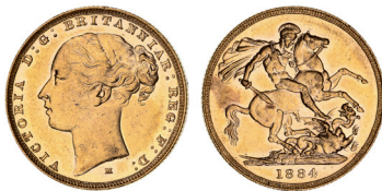
1655* Queen Victoria, 1884 Melbourne (McD.167a). Nearly uncirculated.