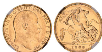
1748* Edward VII, 1908 Perth. Light scratch behind ear, otherwise good very fine.