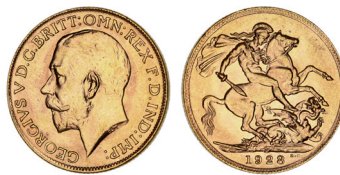
1714* George V, 1928 Perth. Uncirculated.