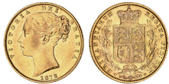
1601* Queen Victoria, 1873 Sydney. Good very fine. $750