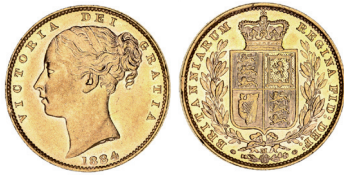
1618* Queen Victoria, 1884 Melbourne. Nearly uncirculated. $900