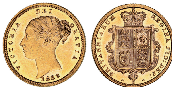
1730* Queen Victoria, 1882 Sydney. Uncirculated/choice uncirculated and very rare in this condition, one of the finest known of this key date.