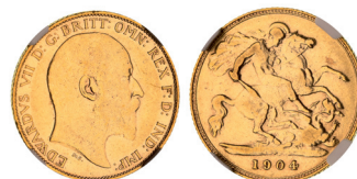
1747* Edward VII, 1904 Perth. Good very fine/very fine.