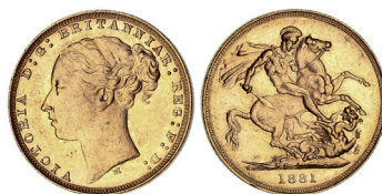
1648* Queen Victoria, 1881 Melbourne, no BP (McD 161a). Nearly uncirculated.