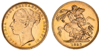
1652* Queen Victoria, 1883 Melbourne (McD.165b). Full original mint bloom, uncirculated.

Ex Chris Hall Collection, from Noble Numismatics Sale 92 (lot 1405).