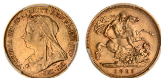
1742* Queen Victoria, old head, 1893 Sydney. Nearly extremely fine.