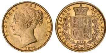
1599* Queen Victoria, 1872 Sydney. Nearly uncirculated. $1,050