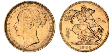
1657* Queen Victoria, 1884 Sydney. Frosty mint bloom, nearly uncirculated, rare thus.