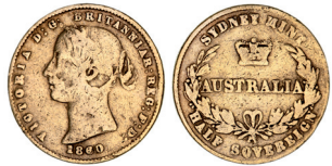
1586* Queen Victoria, second type, 1860. Slight bend, nearly fine and rare. $450

Ex David Ross Collection from Spink Australia Sale 26 (lot 838).