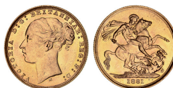
1647* Queen Victoria, 1881 Melbourne (McD.161). Choice uncirculated.

Ex Chris Hall Collection, from Noble Numismatics Sale 91 (lot 1376).