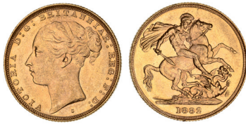
1651* Queen Victoria, 1882 Sydney, faint BP (McD.162a). Toned obverse, uncirculated.