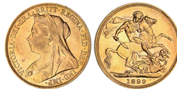
1689* Queen Victoria , 1899 Perth. Toned obverse, nearly extremely fine/nearly uncirculated and scarce.