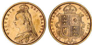
1741* Queen Victoria, Jubilee head, 1893 Melbourne. Good very fine.