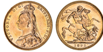
1678* Queen Victoria, 1892 Sydney. Choice uncirculated, one of the finest known.

Ex Chris Hall Collection, from Downies RBA sale 29.11.05 and eBay 10/4/10.