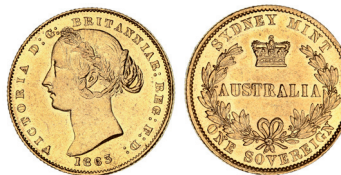
1575* Queen Victoria, second type, 1863. Extremely fine/good extremely fine and rare thus. $2,000 Ex Chris Hall Collection, from Noble Numismatics Sale 93 (lot 1302).