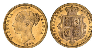
1731* Queen Victoria, 1883 Sydney (McD.25a). Minute obverse hairline, good extremely fine/nearly uncirculated.

Ex Noble Numismatics Sale 48 (lot 1637) earlier from Spink Noble Sale 39 (lot 1170).