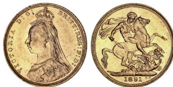
1676* Queen Victoria, 1891 Sydney (McD 182). Nearly uncirculated. $750