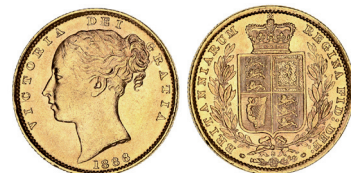
1623* Queen Victoria, 1886 Sydney. Die break rim through 6 to truncation, rubbed, uncirculated. $1,250

Ex Chris Hall Collection, from Noble Numismatics Sale 91 (lot 1360).