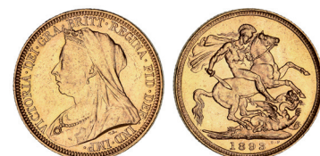
1682* Queen Victoria, old head, 1893 Sydney. Nearly uncirculated. $850