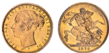
1643* Queen Victoria, 1879 Sydney. Good extremely fine or nearly uncirculated and rare in this condition.

Ex Chris Hall Collection, from Noble Numismatics Sale 91 (lot 1381).