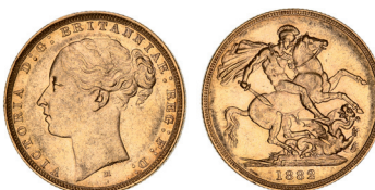
1650* Queen Victoria, 1882 Melbourne (McD.163a). Nearly extremely fine.

Ex Chris Hall Collection, from Roxbury's Sale 13/2/10 (lot 1268).