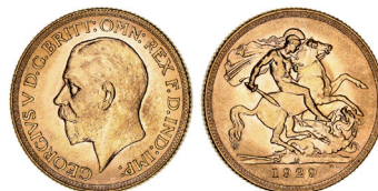
1715* George V, small head, 1929 Melbourne. Uncirculated and rare.