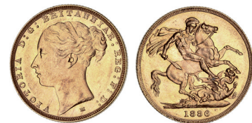
1660* Queen Victoria, 1886 Melbourne (McD 171). Nearly uncirculated.