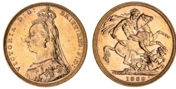
1673* Queen Victoria, 1889 Melbourne. Nearly uncirculated. $700

Ex Chris Hall Collection, from Downies RBA sale 29.11.05 and eBay 10/4/10.