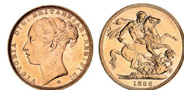
1661* Queen Victoria, 1886 Melbourne. Nearly uncirculated.