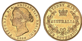
1567* Queen Victoria, second type, 1859. Very fine.

Ex Chris Hall Collection, from Noble Numismatics Sale 91 (lot 1326).