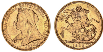
1683* Queen Victoria , old head, 1893 Sydney. Toned nearly uncirculated.