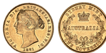
1571* Queen Victoria, second type, 1861. Extremely fine.

Ex Chris Hall Collection, from Noble Numismatics Sale 92 (lot 1351).