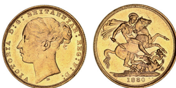
1645* Queen Victoria, 1880 Melbourne (McD.159a). Nearly uncirculated.

Ex Chris Hall Collection, from Noble Numismatics Sale 95 (lot 1420).