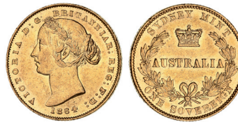
1576* Queen Victoria, second type, 1864. Extremely fine. $1,500 Ex Chris Hall Collection, from Noble Numismatics Sale 91 (lot 1332).