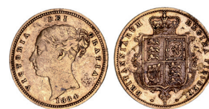
1732* Queen Victoria, 1884 Melbourne. Very fine.