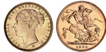
1656* Queen Victoria, 1884 Melbourne (McD 167b). Subdued mint bloom good extremely fine.

Ex Chris Hall Collection, from Noble Numismatics Sale 91 (lot 480).