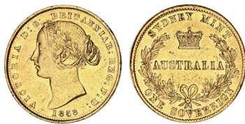
1566* Queen Victoria, second type, 1858. Very fine and rare in this condition.