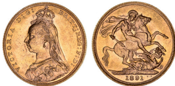
1675* Queen Victoria, 1891 Melbourne (McD.183a). Nearly uncirculated. $800

Ex Chris Hall Collection, from Noble Numismatics Sale 94 (lot 1477).