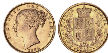
1624* Queen Victoria, 1886 Sydney. Tiny die break rim through 6 to truncation, original subdued mint bloom, nearly uncirculated. $1,000

Ex Chris Hall Collection, from Downies Sale 27/10/10 (lot 1661).