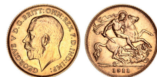
1749* George V, 1911 Perth. Extremely fine and scarce.