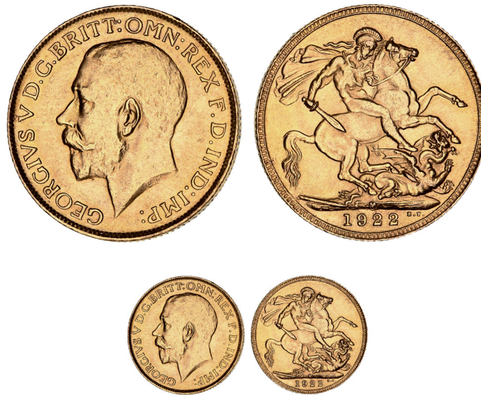
1702* George V, 1922 Melbourne. Good extremely fine and extremely rare.