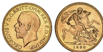
1717* George V, small head, 1930 Melbourne. Nearly uncirculated and scarce.