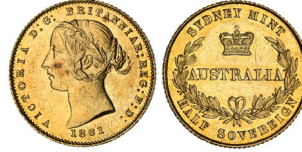
1588* Queen Victoria, second type, 1861. Good extremely fine. $3,500

Ex David Ross Collection from Spink Australia Sale 26 (lot 838).