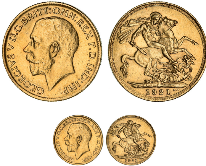
1701* George V, 1921 Sydney. Extremely fine or better and rare.