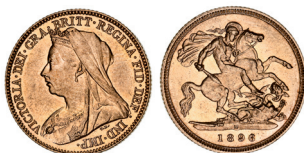
1744* Queen Victoria, 1896 Melbourne. Good extremely fine.