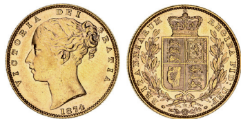
1602* Queen Victoria, 1874 Melbourne. Nearly uncirculated and rare in this condition. $1,250