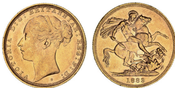
1653* Queen Victoria, 1883 Sydney. Extremely fine.

Ex Chris Hall Collection, from Noble Numismatics Sale 91 (lot 1385).