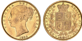
1619* Queen Victoria, 1884 Sydney. Obverse light tone, nearly uncirculated. $1,000

Ex Chris Hall Collection, from Downies Sale 27/10/10 (lot 1657).