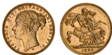
1641* Queen Victoria, 1879 Melbourne (McD.157). Extremely fine.