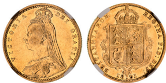
1740* Queen Victoria, 1891 Sydney (McD 38a). Nearly extremely fine.