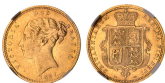
1728* Queen Victoria, 1881 Sydney. Good very fine/nearly extremely fine.

Ex David Ross Collection from KJC September 2007.