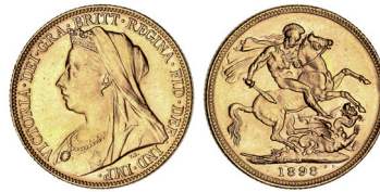
1687* Queen Victoria , 1898 Melbourne. Good extremely fine.

Ex Chris Hall Collection, from Noble Numismatics Sale 94 (lot 1865 part).