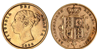
1729* Queen Victoria, 1882 Melbourne (McD.24). Very fine.