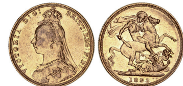
part 1680* Queen Victoria, Jubilee head, 1893 Melbourne (McD 188a and 188b medium tail) the second illustrated. Very fine; good very fine and rare, only one other medium tail known. (2) $1,800

Ex Chris Hall Collection, from Downies Sale 25/10/11 (lot 719).