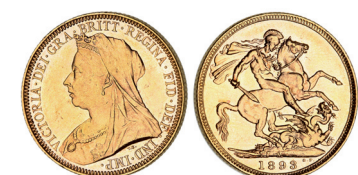
1681* Queen Victoria, old head, 1893 Melbourne. Mirror-like fields, nearly uncirculated and scarce thus. $900

Ex Chris Hall Collection, from Noble Numismatics Sale 94 (lot 1478).