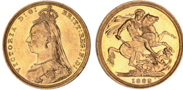
1674* Queen Victoria, 1889 Sydney. Uncirculated/choice uncirculated. $750

Ex Chris Hall Collection, from Noble Numismatics Sale 92 (lot 1404).