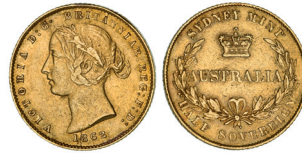
1589* Queen Victoria, second type, 1862. Die break rim to neck beside 8, dull tone good very fine. $1,400

Ex David Ross Collection from KJC March 2002.