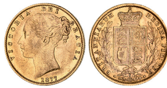
1604* Queen Victoria, 1877 Sydney. Toned extremely fine. $750