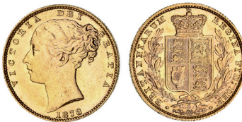
1605* Queen Victoria, 1878 Sydney. Nearly uncirculated. $900