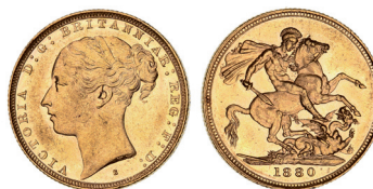
1646* Queen Victoria, 1880 Sydney (McD. 158b). Nearly uncirculated.