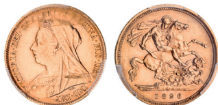
1743* Queen Victoria, 1896 Melbourne. Extremely fine/nearly uncirculated.