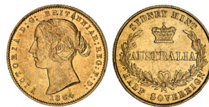
1591* Queen Victoria, second type, 1864. Die break rim through 4 to neck, nearly extremely fine. $1,650

Ex David Ross Collection from KJC in Dec 05.