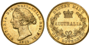
1572* Queen Victoria, second type, 1862. Nearly uncirculated. $4,200 Ex David Ross Collection from Spink Australia Sale 27 (lot 1443).