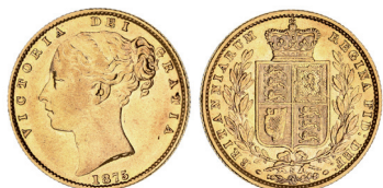
1603* Queen Victoria, 1875 Sydney. Good very fine. $750