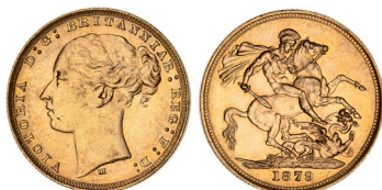
1642* Queen Victoria, 1879 Melbourne (McD.157a). Attractive colour, uncirculated and rare thus.

Ex Chris Hall Collection, from Noble Numismatics Sale 94 (lot 1442).