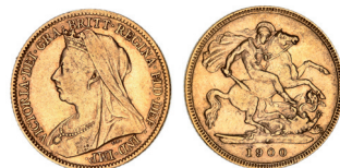
1746* Queen Victoria, 1900 Perth. Good very fine and scarce thus.