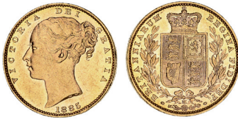
1620* Queen Victoria, 1885 Melbourne. Nearly uncirculated. $900

Ex Chris Hall Collection, from Noble Numismatics Sale 91 (lot 1359).