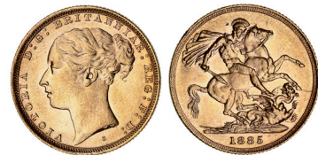
1659* Queen Victoria, 1885 Sydney. Nearly uncirculated.