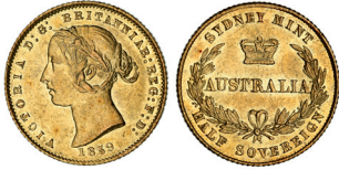
1585* Queen Victoria, second type, 1859. Good extremely fine. $4,200

Ex David Ross Collection from Noble Numismatics Sale 57 (lot 1471).