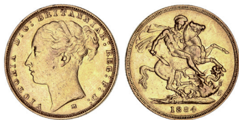
1654* Queen Victoria, 1884 Melbourne, no BP (McD 167). Very fine and very rare, only four others known.

Ex Chris Hall Collection, from Noble Numismatics Sale 92 (lot 1407).