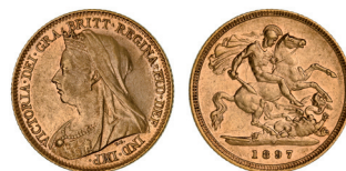
1745* Queen Victoria, 1897 Sydney. Nearly extremely fine.