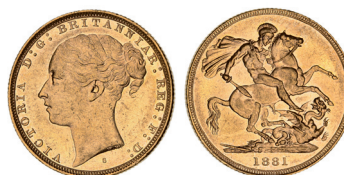
1649* Queen Victoria, 1881 Sydney, no BP (McD.160a). Good extremely fine/nearly uncirculated.

Ex Chris Hall Collection, from Noble Numismatics Sale 92 (lot 1404).