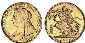
1686* Queen Victoria , 1894 Sydney. Uncirculated.

Ex Chris Hall Collection, from Noble Numismatics Sale 91 (lots 1417, 8).