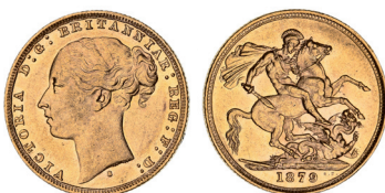
1644* Queen Victoria, 1879 Sydney. Extremely fine and very scarce in this condition.