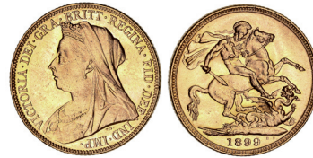
1688* Queen Victoria , 1899 Melbourne. Uncirculated.