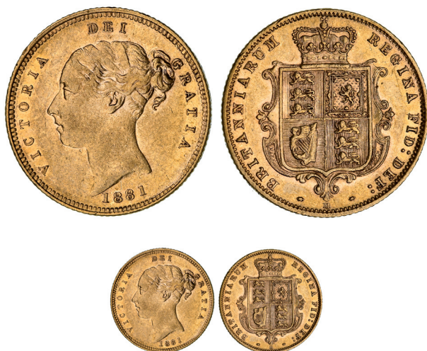
1727* Queen Victoria, 1881 Melbourne. Extremely fine/good extremely fine and rare.