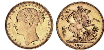
1658* Queen Victoria, 1885 Melbourne (McD 169c). Good extremely fine.

Ex Chris Hall Collection, from Noble Numismatics Sale 92 (lot 1411).