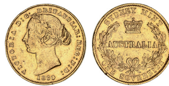
1569* Queen Victoria, second type, 1860. Very fine and rare.

Ex Chris Hall Collection, from Noble Numismatics Sale 91 (lot 1324).