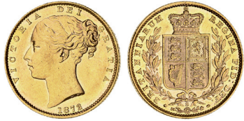
1600* Queen Victoria, 1872 Sydney. Extremely fine/good extremely fine. $900

Ex Chris Hall Collection, from Downies Sale 22/2/11 (lot 1477).