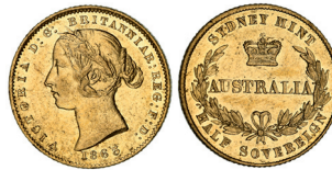
1590* Queen Victoria, second type, 1863. Nearly uncirculated and rare in this condition. $5,200