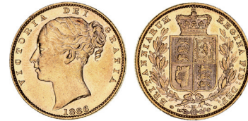
1622* Queen Victoria, 1886 Melbourne. Obverse surface marks, extremely fine/good extremely fine and very rare. $12,000

Ex Chris Hall Collection, from Noble Numismatics Sale 91 (lot 1359).