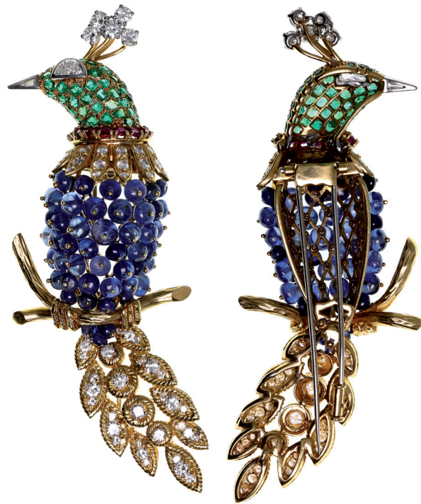
2172 Jewelled peacock brooch , in 18ct yellow gold, large peacock posing on a gold branch with brilliant cut diamond tail, crest and shoulder plumage, eye and beak with shaped diamonds to suit in white gold, the main body with pin set sapphire beads, a collar of pave rubies and a head of pave emeralds, (gold wt approx 33.13g; ruby wt approx 0.32ct; emerald wt 1.65ct; sapphire wt 7.20ct; diamond wt 2.43ct, colour F, VS1), total length 92mm. Extremely fine.