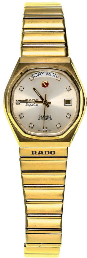
2208* Gents Wristwatch , Rado, Sapphire, automatic movement, twenty five jewels, c 2000, gold plated stainless steel case, 35mm. In working order, without certificate, extremely fine. $300