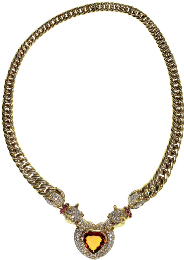
2171* Diamond and jewel panther necklace , graduating curb link chain in 18ct gold with central pendant heartshaped citrine (8.01ct), with a frame of pave set diamonds mounted in the jaws of two panther heads with pave ruby collars and cabachon ruby eyes, extending on pave diamond leaves, (diamond wt, 2.40ct, colour F, VS1; ruby wt, 0.12ct; 18ct gold wt est 62.18g). Extremely fine.