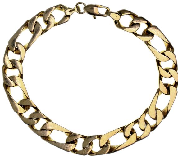
2141* Gold chain bracelet, 18 carat (39.69g). Extremely fine.