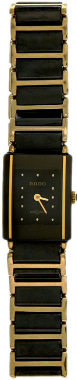
2206* Ladies Wristwatch , Rado Diastar Integral Jubilee, black ceramic and gold, model 153.0283.3N, missing backing plate screw, working order. Very fine. $300