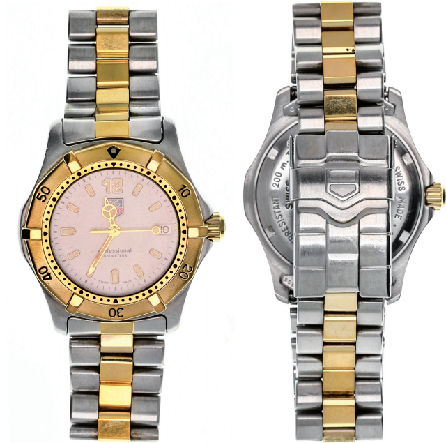
2197* Gentleman's wristwatch , Tag Heuer, Quartz, stainless steel and 18 carat gold plating, model:WK1220, in need of a new battery. With original case and certificate, extremely fine.