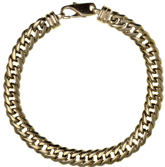
2142* Gold chain bracelet, 18 carat (39.09g). Very fine.