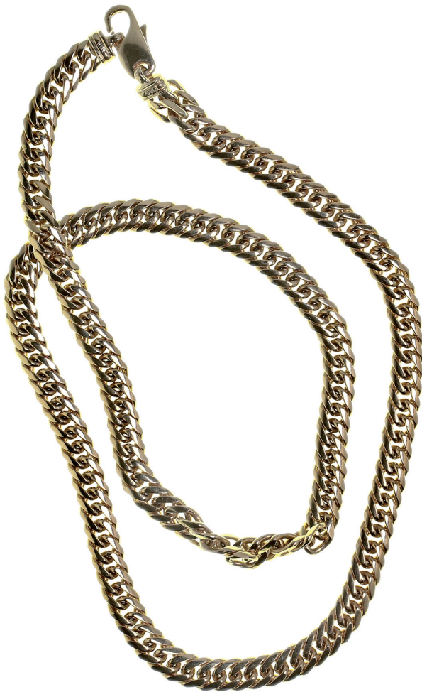
2140* Gold chain or necklace, 18 carat, Italy (97.03g). Extremely fine.