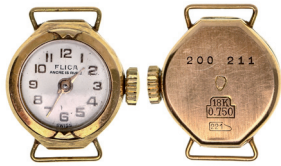
2196* Ladies Flica Wrist Watch , manual wind in 18ct gold case (tot wt 4.88g), white dial with gold numerals and hands, no band. Very fine.