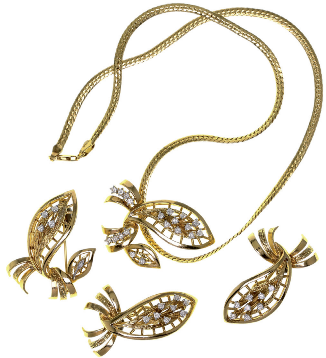
2143* Ladies matching necklace, earrings and brooch set in 18 carat gold with tiny diamonds (36) all in plush case (43.27g). Extremely fine.