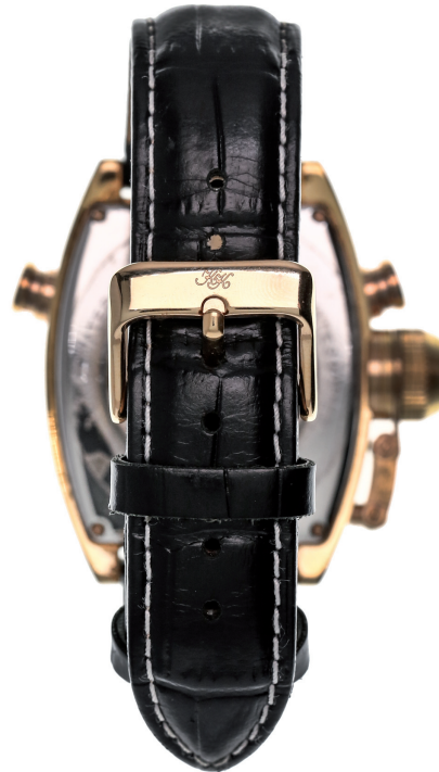
2201* Gentleman's Wristwatch , Kristian Kiel, Tempus rose gold plated automatic, rectangular case with black face, day, date dials and 24 hour day phase function, in original case with warranty. Extremely fine.