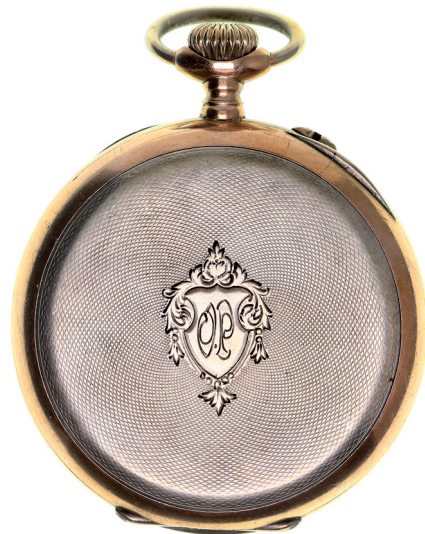
2210* Pocket chronometer , by Hy (Henry) Moser & Cie (Company), in 900 fine silver with gold plating sections, rear cover with patterned design and with shield in centre, this inscribed with initials, 'J.P.', with white dial and two sub dials, the main dial with black Arabic numerals from 1 to 12 and black Arabic numerals in yellow circles from 13 to 24 and around the outside is a seconds dial, the sub dials also have black Arabic numerals, one in 5 second intervals to 30 and