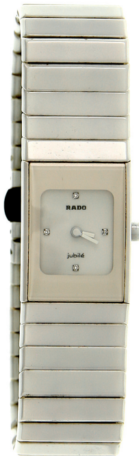
2207* Ladies Wristwatch , Rado Diastar, white ceramic with diamond marker dial, model 963.0712.3. Working order, very fine. $400