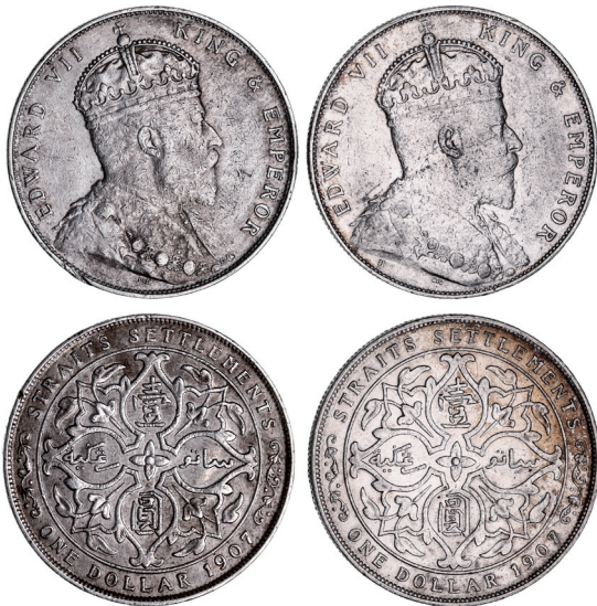
2855* part Straits Settlements, Edward VII, silver one dollars, 1907, 1907H and 1908 (KM.26). Very fine - good very fine. (3) $240