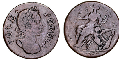
2867* USA, Colonial, Voce Populi, Hibernia halfpenny, 1760. Struck in Dublin as tokens, even brown patina, fine/nearly fine.