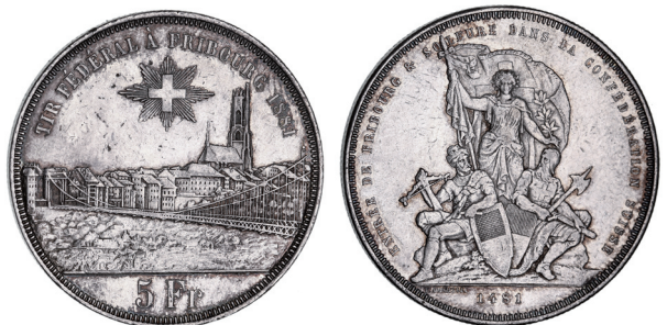
2859* Switzerland, shooting thaler, Fribourg, five francs, 1881 (KM.X S15). Nearly extremely fine. $150

Ex D. Featherstone/L. McNaught Collection.