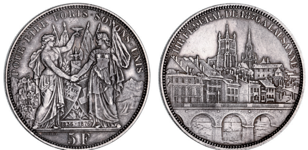
2858* Switzerland, shooting thaler, Lausanne, five francs, 1876 (KM.X S13). Toned, nearly extremely fine. $150

Ex D. Featherstone/L. McNaught Collection.