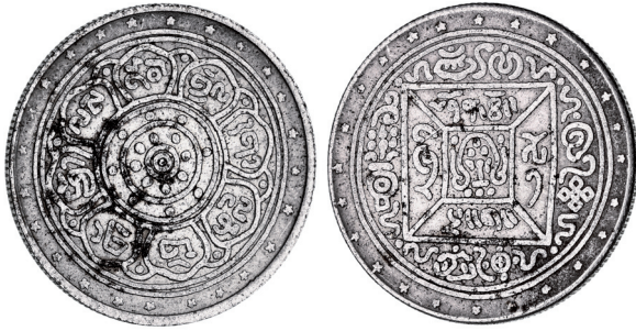
2861* Tibet, silver srang (1909) (17.90g) (cf KM.Y.9), a probable cast. Nearly very fine.