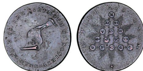
2869* USA, Post Colonial issue, Kentucky 'cent' plain edge (1792-94). Pitted surface, otherwise fine or better.