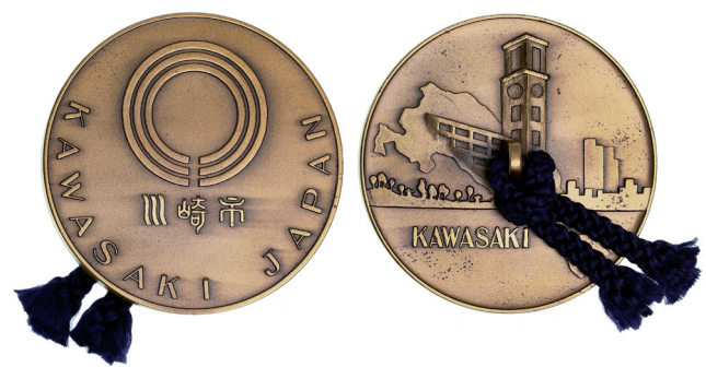
2967* Japan , Kawasaki medal in bronze (60mm), obverse, three broken circles as on the Kawasaki City flag, above Japanese text, reverse, Kawasaki city scene on background of island of Japan, with lug in centre with short blue woven cotton cord attached. In case of issue, some tone spotting, otherwise uncirculated.