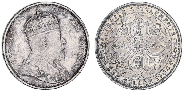
2853* Straits Settlements, Edward VII, silver dollar, 1904 (KM.25). Toned obverse, extremely fine/good extremely fine. $150