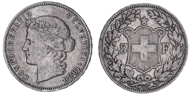
2856* Switzerland, silver five francs, 1889B (KM.34). Toned, good fine/very fine. $180

Ex D. Featherstone/L. McNaught Collection.