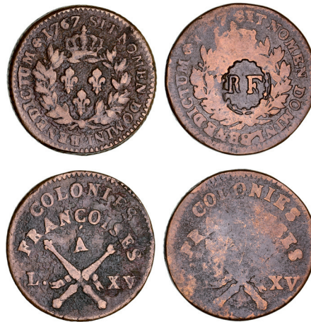
2868* USA, French Colonies in general, copper sou, 1767 A; another countermarked raised RF in oval for use in the West Indies (Guadeloupe, Pridmore fig 15, p228). Nearly fine; very good. (2)