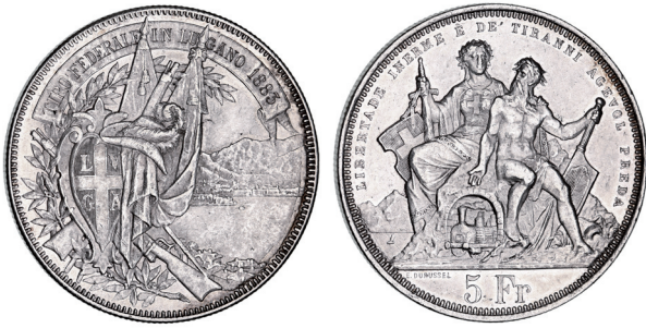
2860* Switzerland, shooting thaler, Lugano, five francs, 1883 (KM. X S16). Good extremely fine.

Ex D. Featherstone/L. McNaught Collection.