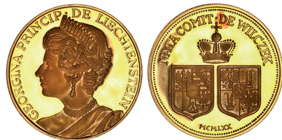
2968* Liechtenstein , Georgina Princip De Liechtenstein commemorative, 1970, .900 fine gold, 22 g, proof finish. Nearly FDC.