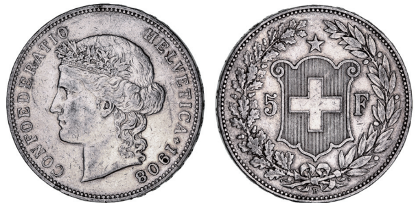
2857* Switzerland, silver five francs, 1908B (KM.34). Very fine or better. $200

Ex D. Featherstone/L. McNaught Collection.