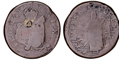
2866* USA, Colonial, New Jersey, Mark Newby St. Patrick farthing struck in Dublin under Charles II, annulet below king (S.6572). Evenly worn with brass plug visible, fair.