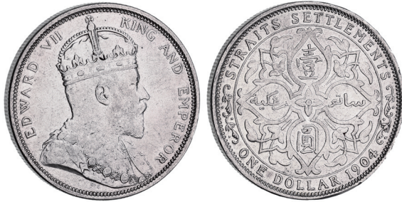
2854* Straits Settlements, Edward VII, silver dollar, 1904 (KM.25). Nearly extremely fine. $120