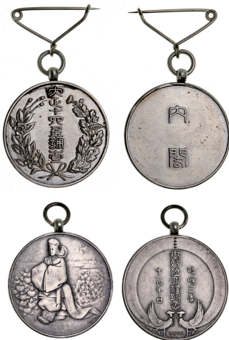
2966* Japan , Census Taker's badge, Taisho 14 (1925), in silver (27mm), ring top suspension with pin-fitting attached, in box of issue (this with a tear); Ladies Enthronement Commemorative Medal for 3rd year of Showa Emperor, November 10 (1928), in silver (28mm), with ring top suspension, in packet of issue. Extremely fine. (2)