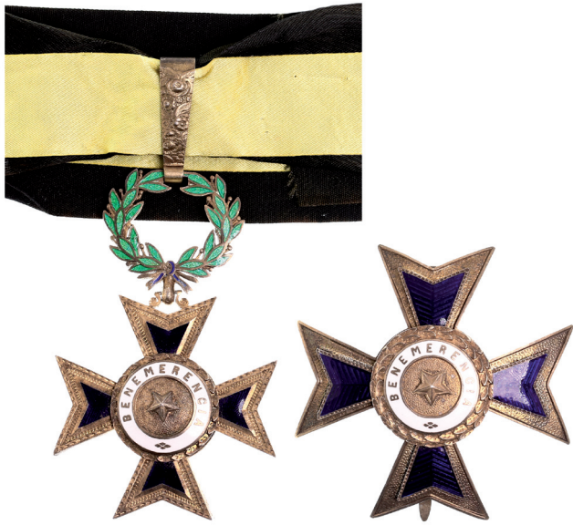
4219* Portugal, Order of Merit Second Class (Grand Officer) neck badge and breast star in gilt and enamel. Very fine. (2) $600