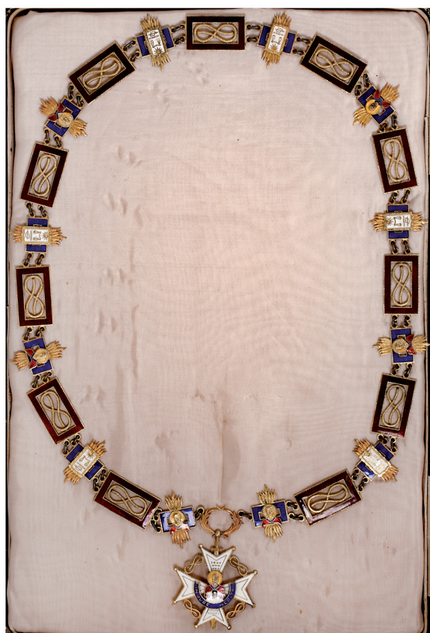
4231* Spain, Order of the Cross of St Raymond of Penafort, collar chain of the Grand Cross in gilt and enamel, stored in a case by Wm Drummond & Co, Melbourne, case damaged. Collar chain and cross extremely fine.