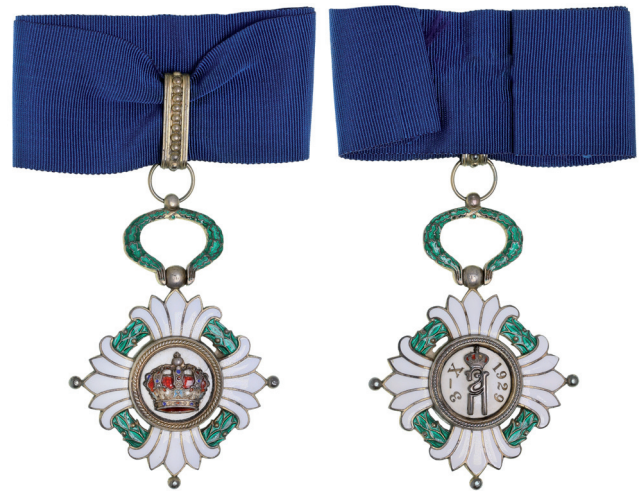
4250* Yugoslavia, Kingdom of , Order of the Crown, Commander (Third Class), neck badge in silver gilt and enamel, in a fitted case by Huguenin Freres & Co, Le Locle (Suisse), this with some damage. A few small enamel chips, otherwise good very fine.