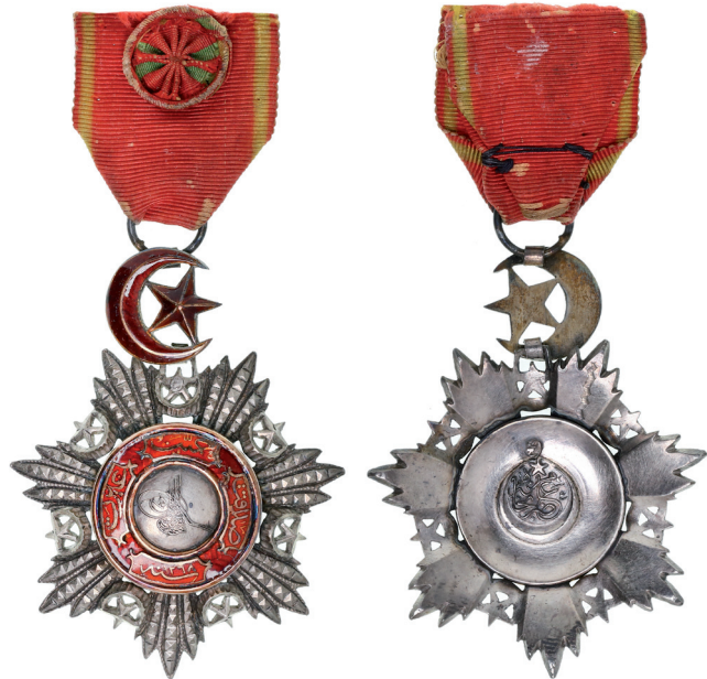
4238* Turkey , Order of Medjidjie, badge in silver, gold and enamel, with rosette on ribbon. Very fine.