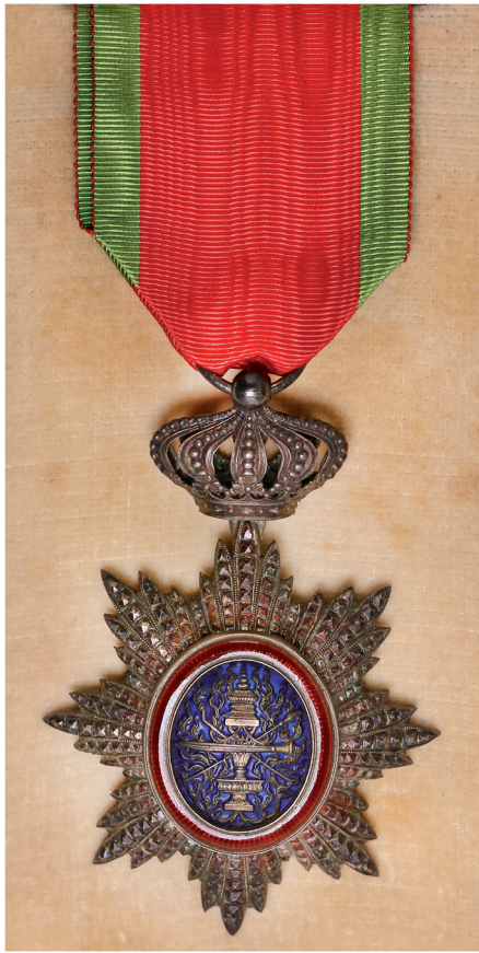
4195* Cambodia, French Protectorate, 1896-1948, Royal Order of Cambodia, Knight/Chevalier badge in silver and enamel. In A. Chobillon, Palais-Royal, Paris box, good extremely fine.