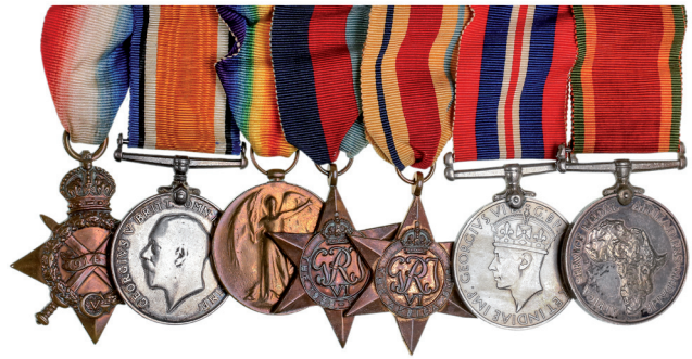
4188* South Africa, Group of Seven: 1914-15 Star; British War Medal 1914-18; Victory Medal 1914-19 (South African pattern); 1939-45 Star; Africa Star; War Medal 1939-45; Africa Service Medal 1939-45. C.G.Bird Brands F.S. Rfls. on first medal (note naming initials are reversed), Dvr. G.C.Bird. S.A.S.C. on second and third medals, 251782 G.C.Bird on last four medals. All medals impressed. Swing mounted, contact marks, some medals with remnants of cleaning material, otherwise good - very fine. $350

Together with a matching set of swing mounted miniatures; Cape Mounted Rifles (QVC) cap badge; 1 Rhodesian Regiment (1/RR) shoulder title badges in brass (2); ID disc marked, '1/R. R./179'; South African War Veterans Association 1899-1902 badge in gilt and enamel, button back; British Legion badge in gilt, silvered and enamel, button back, numbered 744402.