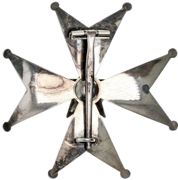
4233* Sweden, Royal Order of the North (Polar) Star, Commander 1st Class breast badge in silver. Extremely fine.