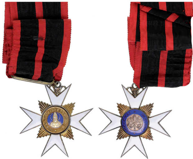
4247* Vatican , Order of St Sylvester, Commander's neck badge in silver, gilt and enamel. Very fine.