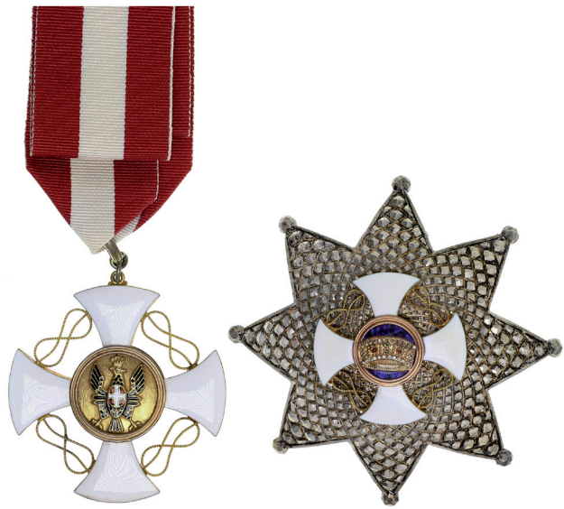
4211* Italy, Kingdom of, Order of the Crown of Italy Grand Officer breast star and neck badge in gold, silver and enamel, the breast star marked on the reverse, 'E.Gardino Succ. Cravanzola, Roma' (E. Gardino subsequent company, Cravanzola, Rome). A few sections of neck ribbon with tape marks, otherwise extremely fine - nearly uncirculated. (2)