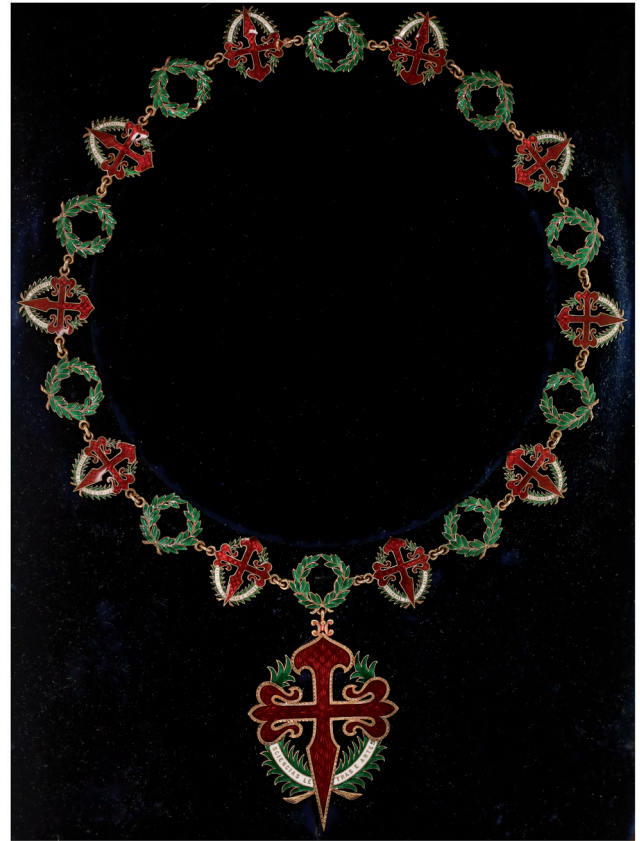
4222* Portugal, Military Order of St James of the Sword, Type II collar badge in silver gilt and enamel, in case, this badly damaged. Extremely fine.