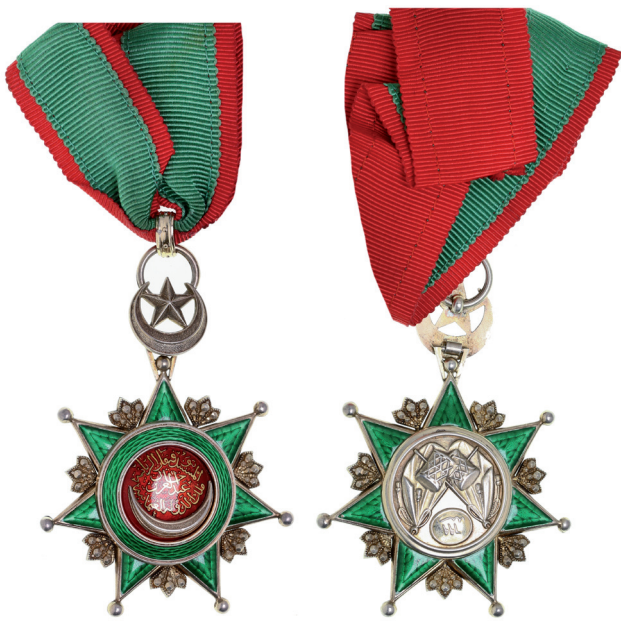
4237* Turkey , Order of Osmania, Commander's neck badge in silver, gilt and enamel. Extremely fine.