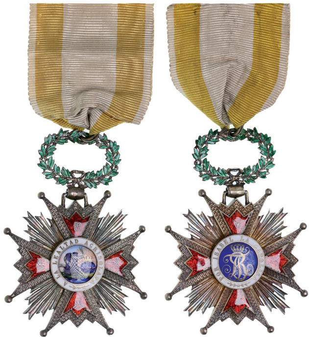
4230* Spain, Order of Isabella the Catholic, Commander (Second Class) breast badge in silver, gilt and enamel. Toned nearly extremely fine.