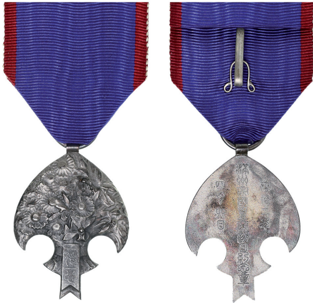
4214* Japan , Manchukuo State (Japanese puppet state) medal in silver on ribbon, Imperial Visit of Emperor Pu-Yi of Manchukuo to Japan, 1935, marked M 1000 on ring. In box of issue, nearly uncirculated and rare.