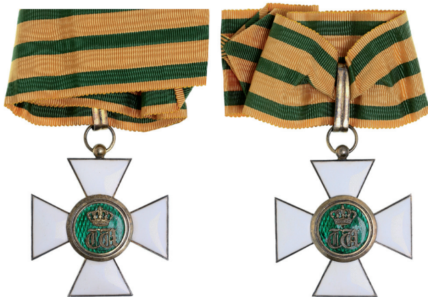
4215* Luxembourg , Grand Duchy, Order of the Oak Crown, Commander (Third Class) neck badge in gilt and enamel. In fitted case of issue, this with some damage, neck badge nearly uncirculated.