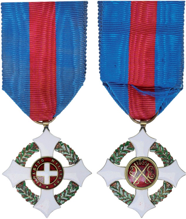
4209* Italy, Savoy, Military Order of Savoy (Chevalier Fifth Class), in gilt and enamel. Very fine.