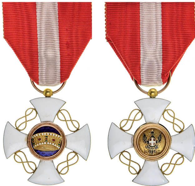
4212* Italy, Order of the Crown, in gold and enamel. Extremely fine.