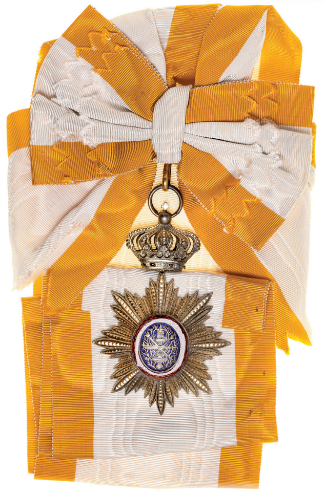
4196* Cambodia, Order of Cambodia, Grand Cross sash badge in gilt and enamel, with white sash badge edged with orange as conferred by French authorities. Nearly extremely fine.