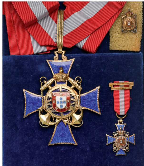
4223* Portugal, Maritime Order neck badge in gilt and enamel with blue enamel cross with crossed anchors behind arms of Portugal, together with a matching miniature medal and a lapel badge, in case by Frederico Costa of Lisbon. Nearly uncirculated. (3 items)