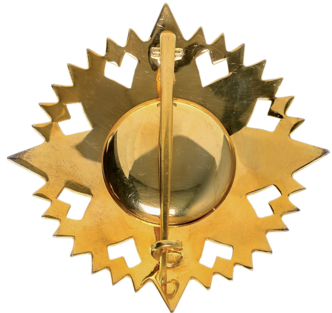
4235* Thailand, Order of the Crown of Thailand, breast star in silver, gilt and enamel, reverse numbered 36/1 and this number also on back of suspension pin. Some chipping to enamel, otherwise extremely fine.