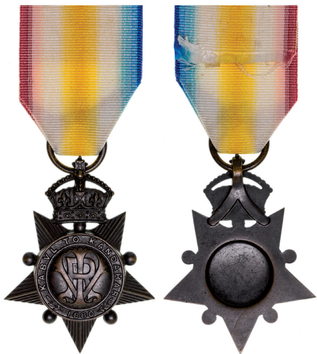
4115* Kabul to Kandahar Star 1878-80. Unnamed. Extremely fine.