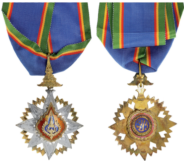
4236* Thailand , Order of the Crown of Thailand, neck badge in silver, gilt and enamel, reverse numbered 38/2. In case of issue, nearly uncirculated.