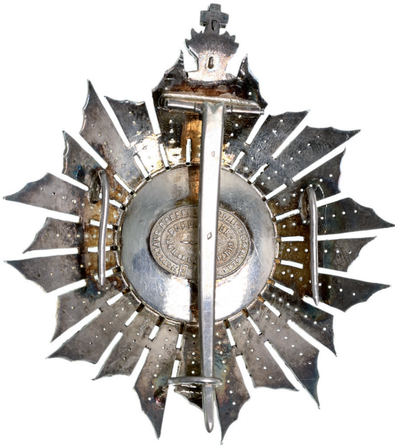
4221* Portugal, Military Order of St James of the Sword, pre 1910 type breast star in silver gilt and enamel, by Boullanger, Paris. Extremely fine.