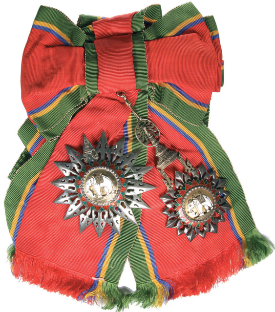
4234* Thailand, Order of the White Elephant, Knight Commander sash with badge and with breast star. Nearly extremely fine. (2)