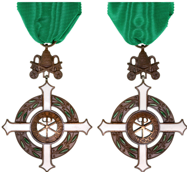
4248* Vatican , Bene Merenti Jubilee Bronze Cross of Pope Pius XII, 1950. Good very fine.