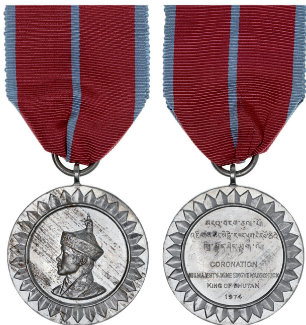
4191* Bhutan , Kingdom of, Coronation of King Jigme Singye Wangchuck Medal, 1974. Unnamed as issued. Streaky toning, otherwise very fine.