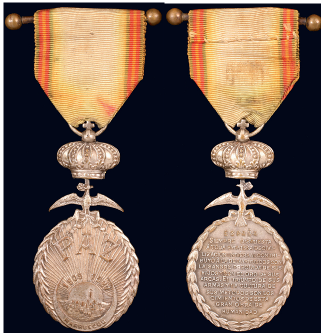
4232* Spain, Medal for Peace in Morocco 1909 - 1927. Unnamed. Ribbon aged, good very fine.