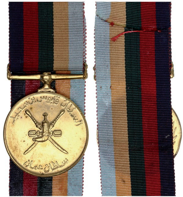
4217* Oman , Sultan's Bravery Medal. Some tone spots and ribbon with glue residue, otherwise good very fine and scarce.