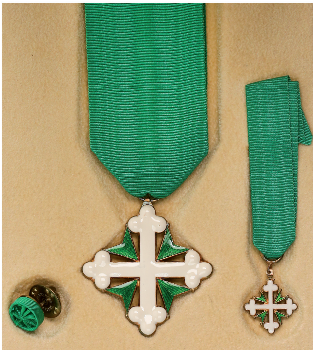
4210* Italy, Kingdom of, Order of St Maurice and St Lazarus, Fifth Class (Knight), breast badge in gilt and enamel, together with miniature medal and a lapel rosette, in fitted case of issue by maker, Gardino, Gioielli Argenti, Roma. Uncirculated. (3 items)