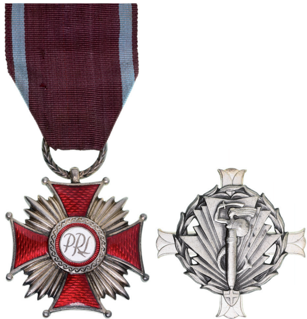
4218* Poland , People's Republic, Cross of Merit 2nd Class (type IV 1943-85), reverse inscribed S1, together with case of issue; Poland, 2nd Artillery Group, breast badge in white metal showing the 'Maid of Warsaw' behind an artillery shell, made by F.M.Lorioli, Milano, Roma. Good very fine, the badge scarce. (2)