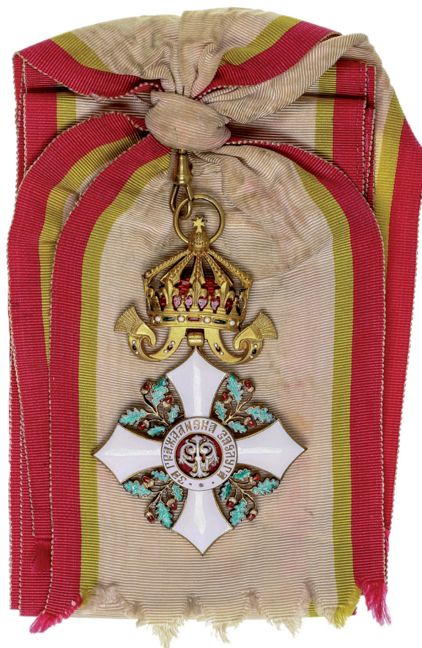
4193* Bulgaria , Kingdom of, Order of National Merit (Civil), Great Cross sash badge, in gilt and enamel. Sash ribbon with some dirt marks, badge extremely fine.