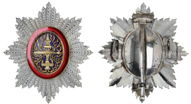
4197* Cambodia, Order of Cambodia breast star in silvered, gilt and enamel. Good very fine.