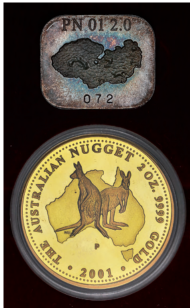
958* Elizabeth II , Perth Mint, proof two ounce fine gold two hundred dollars, 2001, kangaroo/nugget. In case of issue, FDC.