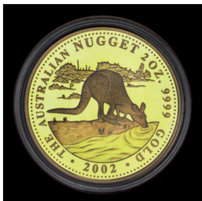
959* Elizabeth II , Perth Mint, proof two ounce fine gold two hundred dollars, 2002, kangaroo/nugget. In case of issue, FDC.