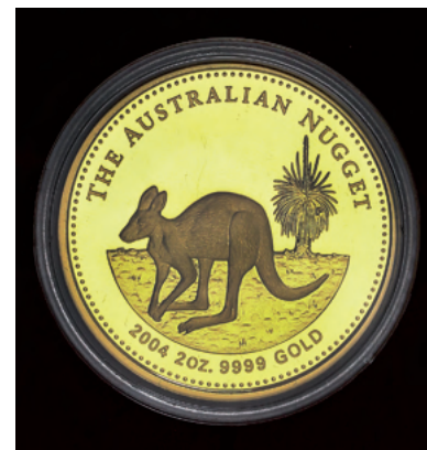
961* Elizabeth II , Perth Mint, proof two ounce fine gold two hundred dollars, 2004, kangaroo/nugget. In case of issue, FDC.