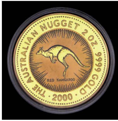
957* Elizabeth II , Perth Mint, specimen two ounce fine gold two hundred dollars, 2000, kangaroo/nugget. In case of issue, uncirculated.