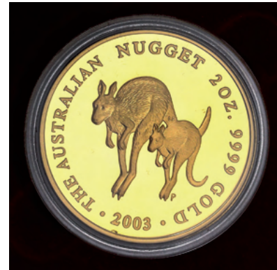
960* Elizabeth II , Perth Mint, proof two ounce fine gold two hundred dollars, 2003, kangaroo/nugget. In case of issue, FDC.