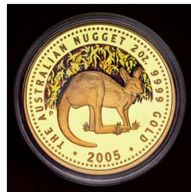
962* Elizabeth II , Perth Mint, proof two ounce fine gold two hundred dollars, 2005, kangaroo/nugget. In case of issue, FDC.