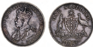
1840* George V, 1917M. Toned, good very fine.