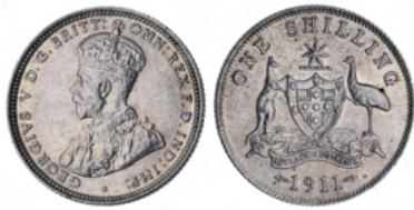
1837* George V, 1911. Good extremely fine.