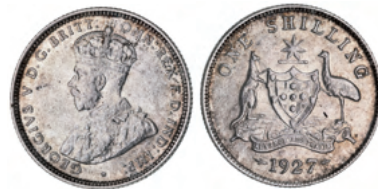
1841* George V, 1927. Struck from rusty dies, nearly extremely fine.