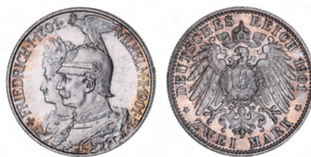
2248* Germany, Prussia, Wilhelm II, silver two mark, 1901A, 200th Anniversary of the Kingdom of Prussia (KM.525; J.105). Uncirculated; choice uncirculated. (2) $100