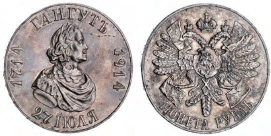
2393* Russia, Nicholas II, silver rouble, 1914, 'Gangut' commemorative (KM.Y.71), 200th Anniversary of the Battle of Gangut. Minute contact marks either side, mirror-like fields, nearly uncirculated and rare.