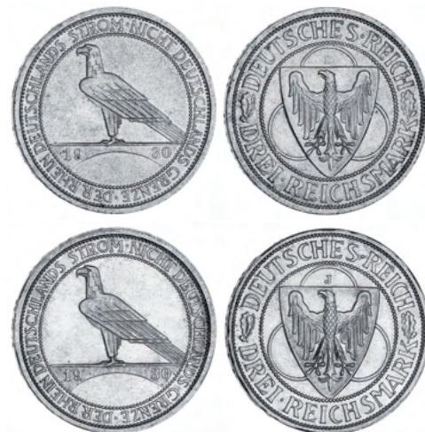
2279* Germany, Weimar Republic, silver three mark, 1930D and 1930J, Liberation of Rhineland (KM.70; J.345 D, J). Nearly uncirculated; uncirculated and scarce. (2)