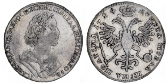
2338* Russia , Peter I, silver poltina or half rouble, 1724 (KM.160). Nearly very fine/very fine.