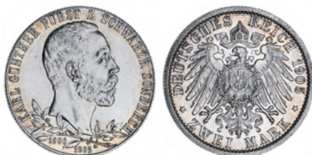
2262* Germany, Schwarzburg-Sonderhausen, Karl Gunther, silver two mark, 1905 25th Anniversary of Reign (KM.153; J.169B). Good extremely fine/nearly uncirculated.