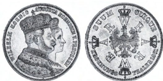
2244* Germany, Prussia, Wilhelm I, silver vereins thaler, 1861A, Coronation (KM.488). Toned, nearly uncirculated. $70