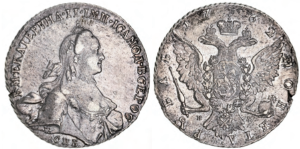
2367* Russia, Catherine II, silver rouble, 1762 (KM.C.67.2). Minor rim break, otherwise good very fine.