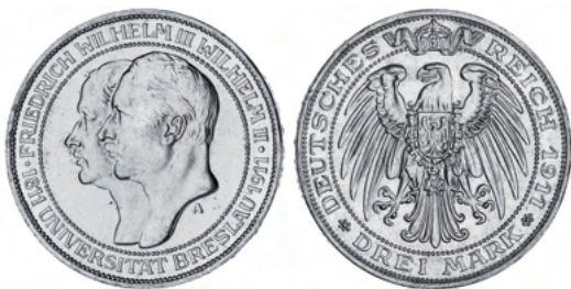
2252* Germany, Prussia, Wilhelm II, silver three mark 1911A, Breslau University, (KM.531; J.108). Choice uncirculated.