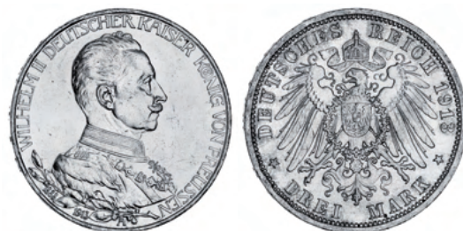
2257* Germany, Prussia, Wilhelm II, silver three mark, 1913A, 25th Year of Reign (KM.535; J.112). Choice uncirculated.