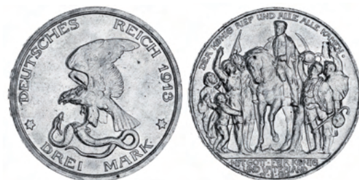
2256* Germany, Prussia, Wilhelm II, silver three mark, 1913A, Defeat of Napoleon (KM.534; J.110). Uncirculated.