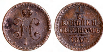
2379* Russia , Nicholas I, copper half kopek 1840 (KM.C.143.2). Spot of verdigris on obverse, otherwise nearly extremely fine.