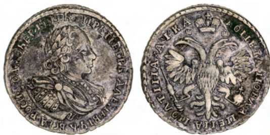
2336* Russia , Peter I, silver poltina or half rouble (1721)(KM.156). Toned very fine.