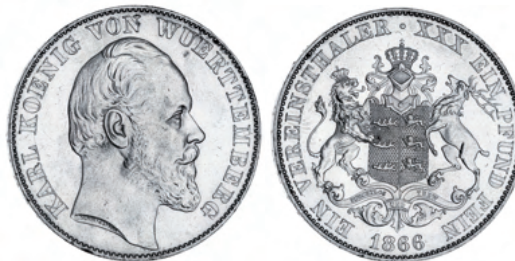
2264* Germany, Wurttemberg, Karl I, silver vereins thaler, 1866 (KM.615). Uncirculated and very scarce in this condition.