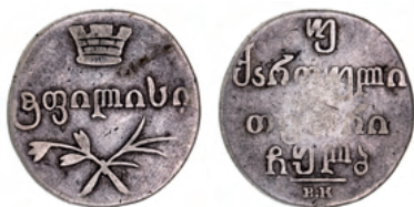
2384* Russia, Nicholas I, Georgia, silver two abazi or rouble (1832)(KM.86). Fine/nearly fine.