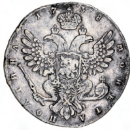
2349* Russia, Anna, silver poltinas or half roubles, 1733 (KM.195); 1738 (KM.199). Toned very fine; very fine. (2)