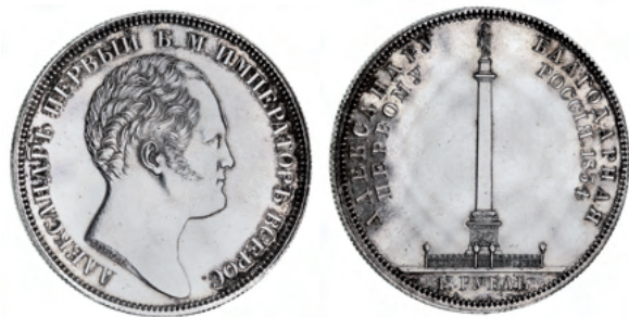
2383* Russia , Nicholas I, commemorative silver rouble, 1834, Alexander I Monument (KM.C.169). A little polished, otherwise proof-like, good extremely fine or nearly uncirculated and very scarce.