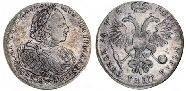
2337* Russia , Peter I, silver rouble, 1720 (KM.157.1). Good fine.