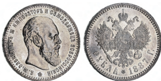
2387* Russia, Alexander III, silver rouble, 1887 (KM.Y.46). Obverse rim bruise at 11, otherwise extremely fine or better.