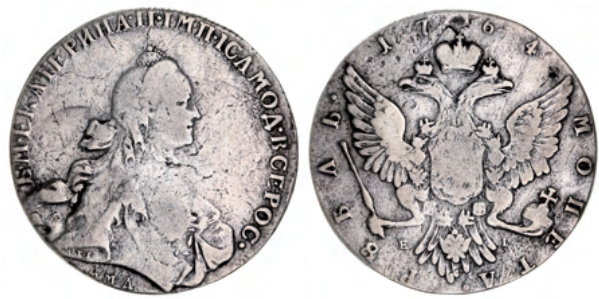
2366* Russia, Catherine II, silver rouble, 1764 M.M.A. (KM.C.67.1). Nearly fine.