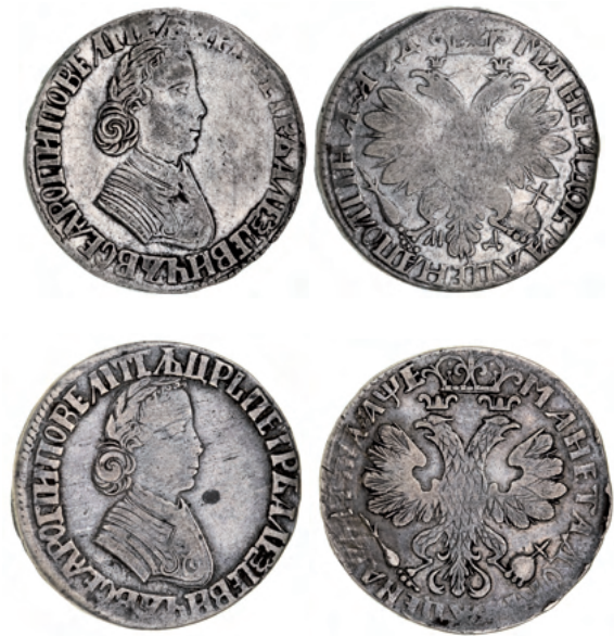
2330* Russia, Peter I, silver poltina or half rouble (1704) and (1705)(KM.106). Good fine/very good; fine. (2) $400