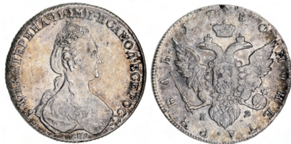
2369* Russia, Catherine II, silver rouble, 1780 (KM.C.67b). Very fine or better.