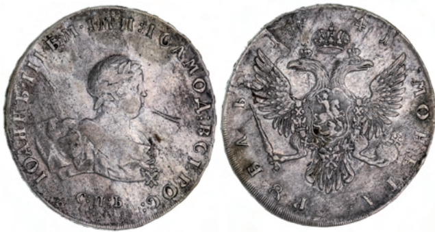
2352* Russia, Ivan III, silver rouble, 1741 (KM.207.2). Flan flaw at 7 of date and obverse scratch to right, otherwise very fine and rare. $3,500