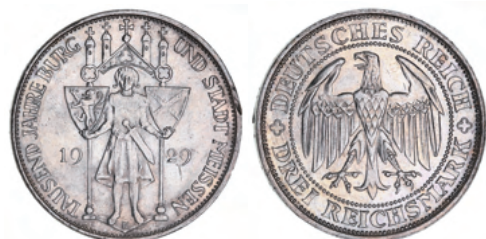
2276* Germany, Weimar Republic, silver three mark, 1929E, 1000th Anniversary of Meissen (KM.65; J.338). Nearly uncirculated, reverse rim scrape, otherwise good extremely fine.