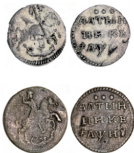
2335* Russia , Peter I, silver three kopeks or altyn (1718)(KM.154.1). Nearly very fine; toned very fine/good very fine. (2)