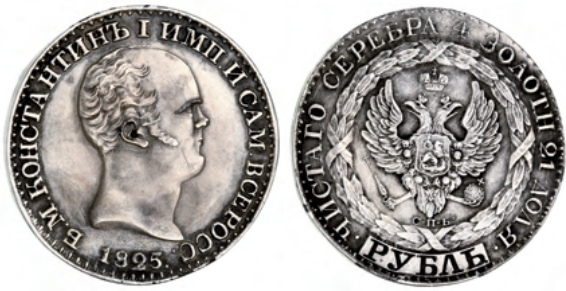
2378* Russia , Constantine, electrotype copy of rouble, 1825 (KM. Pn.88). Extremely fine.