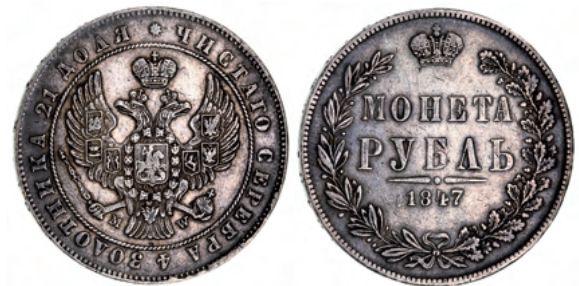
2381* Russia , Nicholas I, silver roubles, 1829 (KM.C.161), 1846 (KM.C.168.1), 1847 (KM.C.168.2). Good very fine; nearly extremely fine; good very fine. (3)