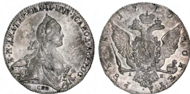
2368* Russia, Catherine II, silver rouble, 1772 (KM.C.67a.2). Underlying original mint bloom, toned, nearly uncirculated.