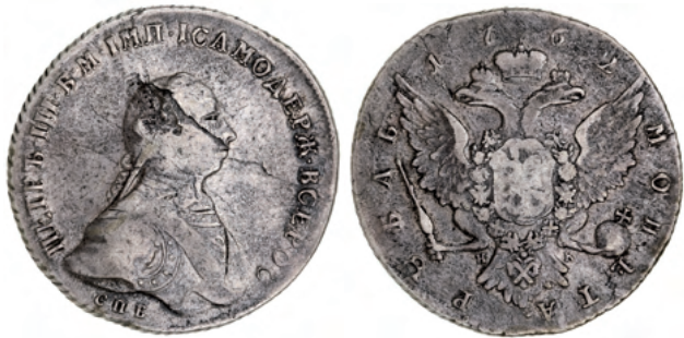
2363* Russia, Peter III, silver rouble, 1762 (KM.C.47.2). Flan flaw on obverse, otherwise toned good fine. $150