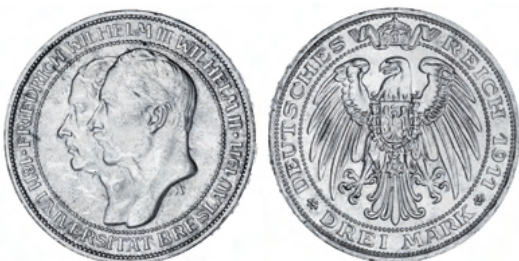
2253* Germany, Prussia, Wilhelm II, silver three mark, 1911A, Breslau University (KM.531; J.108). Nearly uncirculated.