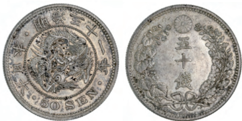
2307* Japan , Meiji, silver fifty sen, yr 31 (1898) (KM.Y.25). Nearly uncirculated.