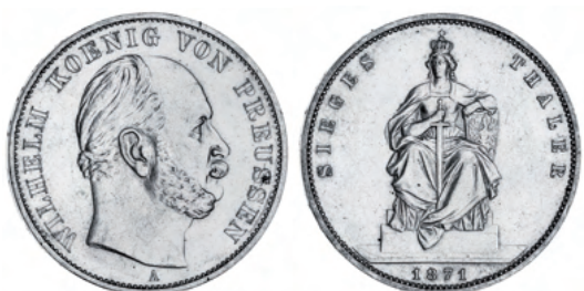
2245* Germany, Prussia, Wilhelm I, silver sieges thaler, 1871A, Victory over France (KM.500). Nearly extremely fine; nearly uncirculated. (2) $100