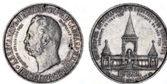
2390* Russia, Nicholas II, silver rouble 1898, Alexander II Memorial (KM.Y.61). Good extremely fine and very scarce.