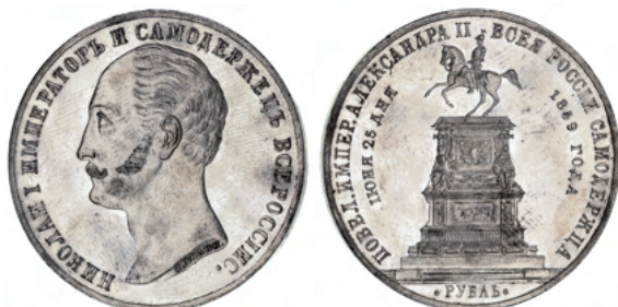
2385* Russia, Alexander II, silver rouble, 1859, Nicholas I Memorial commemorative, plain edge (KM.Y.28). Mirror-like fields, nearly uncirculated.