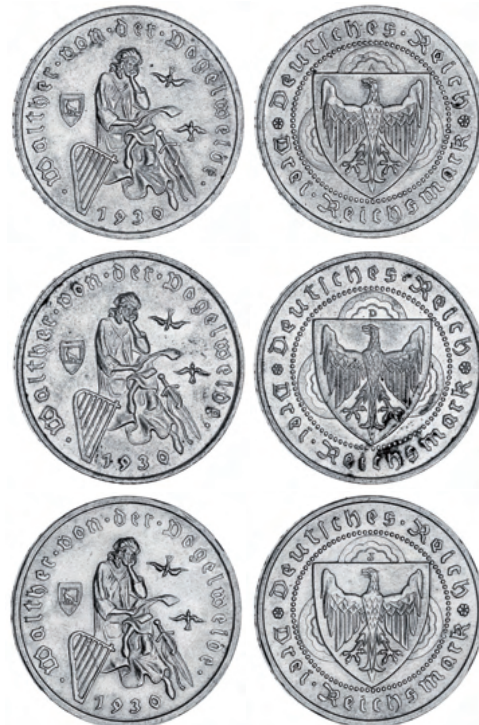
2278* Germany, Weimar Republic, silver three mark, 1930A, 1930D, 1930F, 700th Anniversary of Death of Von Der Vogelweide (KM.69; J.344 A, D, F). Considerable subdued mint bloom, virtually uncirculated. (3)