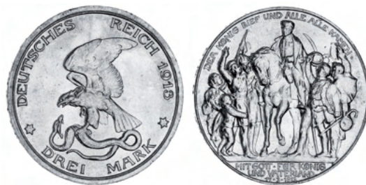
2255* Germany, Prussia, Wilhelm II, silver three mark, 1913A, Defeat of Napoleon (KM.534; J.110). Choice uncirculated.