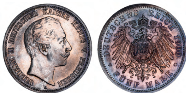
2247* Germany, Prussia, Wilhelm II, proof silver five mark, 1900 A (KM.523; J.101). Superb iridescent toning over brilliant proof fields, FDC and rare, especially in this condition. $1,500