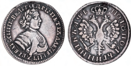
2332* Russia , Peter I, silver poltura, 25 kopek or quarter rouble (1705)(KM.112.1). Toned very fine.