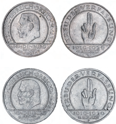
2275* Germany, Weimar Republic, silver three mark 1929D and 1929F, 10th Anniversary of the Constitution (KM.63; J.340D, F). Matte toned nearly uncirculated. (2)