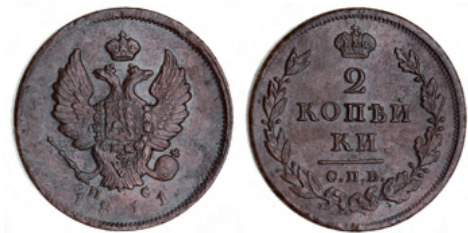
part 2364* Russia, copper two kopeks, Elizabeth to Nicholas II, Elizabeth 1758, 1759, 1761 (KM.C.7.1, .2, 8), Peter III 1762 (KM.C.42); Catherine II, 1763, 1765 (KM.C.58.5, .6); Paul, 1797 (both), 1799 (both)(KM.C.95.2, .3, .4); Alexander I 1802 (KM.114.1), 1810 (both), 1811, 1814, 1818, 1822 (KM.C.118.1 to .6); Nicholas I-II, 1829, 1839, 1837, 1839, 1840, 1843, 1844, 1854, 1855, 1856, 1857, 1861, 1869, 1874, 1885, 1914, 1915. Very good - uncirculated. (36) $500