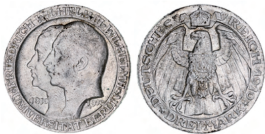
2251* Germany, Prussia, Wilhelm II, silver three mark, 1910A, Berlin University (KM.530; J.107). Uncirculated.