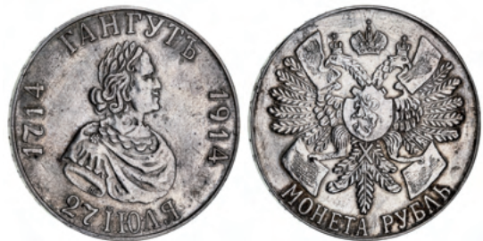
2394* Russia, Nicholas II, silver rouble, 1914, Gangut commemorative (KM.Y.71). Slightly rubbed and tiny scratching, otherwise extremely fine and rare.