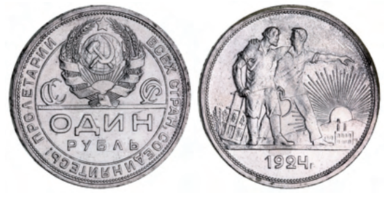
2395* Russia, R.S.F.S.R, silver 10 and 50 kopeks and rouble 1921, 15 and 20 kopek 1923 (KM.Y.80-84); СССР, bronze five kopeks 1924 (KM.Y.79) silver 50 kopek 1924 (KM.Y.89) and one rouble 1924 (KM.Y.90). Extremely fine - uncirculated. (8)