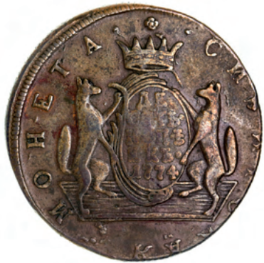
2365* Russia, Catherine II, Siberia, copper polushka 1771, denga 1768, kopek 1775, two kopeks 1774, five kopeks 1773 and ten kopeks 1774 (KM.C.1-C.6). Very fine - good very fine. (6)