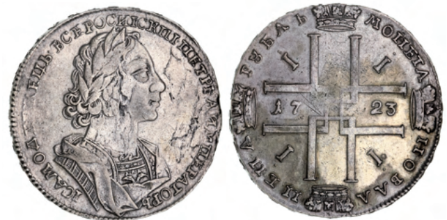
2339* Russia , Peter I, silver rouble, 1723 (KM.162.5). Obverse flan flecking right field, otherwise very fine.