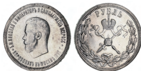
2389* Russia, Nicholas II, silver rouble, 1896, Coronation commemorative (KM.Y.60). Nearly uncirculated.