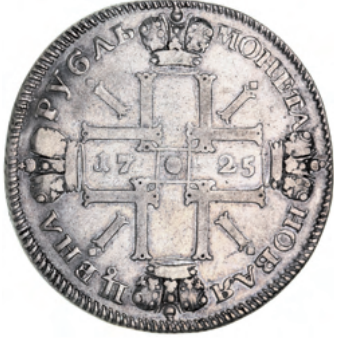
2340* Russia, Peter I, silver rouble, 1725 (KM.166). Nearly very fine.