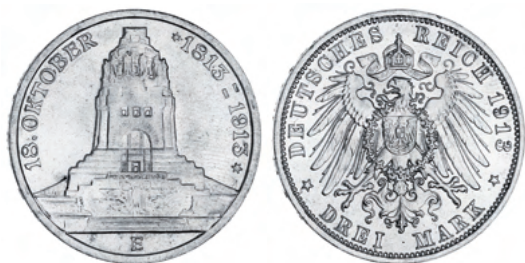
2261* Germany, Saxony, Friedrich August III, silver three mark, 1913E, Battle of Leipzig Centennial (KM.1275; J.140). Choice uncirculated.