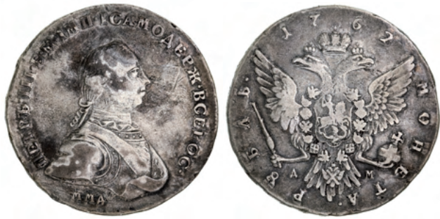
2362* Russia, Peter III, silver rouble, 1762 M.M.A. (KM.C.47.1). Toned, obverse scratches right field, otherwise very fine. $400