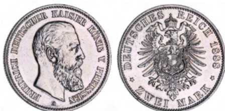
2246* Germany, Prussia, Friedrich III, silver two mark, 1888A (KM.510; J.98). Nearly uncirculated. $100