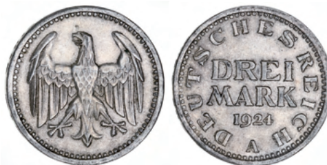
2266* Germany, Weimar Republic, silver three mark, 1924A (KM.43; J.312). Toned, good extremely fine or nearly uncirculated.