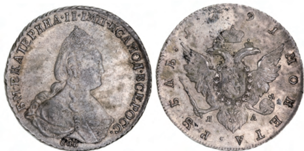
2370* Russia , Catherine II, silver rouble, 1791 (KM.C.67c). Toned, underlying mint bloom, extremely fine/good extremely fine or nearly uncirculated.