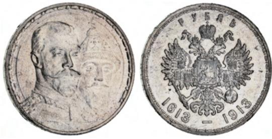
2392* Russia, Nicholas II, silver rouble 1913, 300 years of Romanov's commemorative (KM.Y.70). Nearly uncirculated.