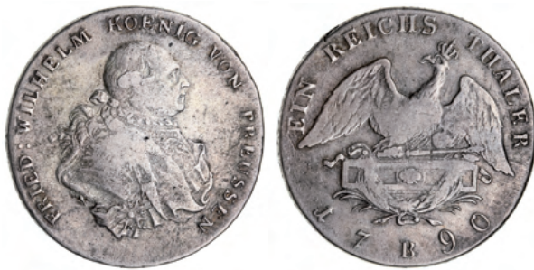
2243* Germany, Prussia, Friedrich Wilhelm II (1786-1797), silver thaler, 1790B, (KM.38a, D.2597). Good fine, scarce. $100