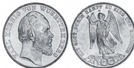
2265* Germany, Wurttemberg, Karl I, silver thaler, 1871, Victorious Conclusion to Franco-Prussia War (KM.620). Choice uncirculated.