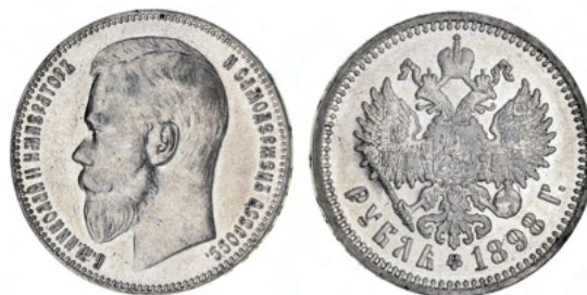
2388* Russia, Nicholas II, silver roubles, 1897, 1898 (2)(KM.Y.59). Very fine; fine; extremely fine. (3)