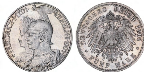
2249* Germany, Prussia, Wilhelm II, silver five mark 1901A (KM.526; J.106). Lightly toned, uncirculated. $200