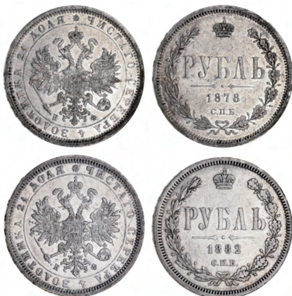
2386* Russia, Alexander II, silver rouble, 1878 (KM.1/25); Alexander III silver rouble, 1882 (KM.Y.25). Good very fine; very fine. (2)