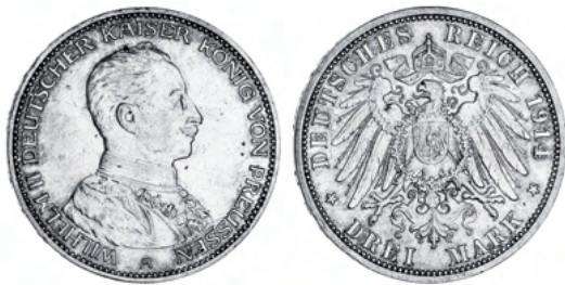
2259* Germany, Prussia, Wilhelm II, silver three mark, 1914A (KM.538; J.113). Toned good extremely fine or nearly uncirculated and scarce.