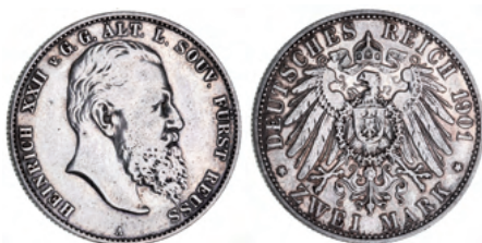
2260* Germany, Reuss, Henrich XXII, silver two mark, 1901A (KM.128. J.118). Polished, very fine and scarce.