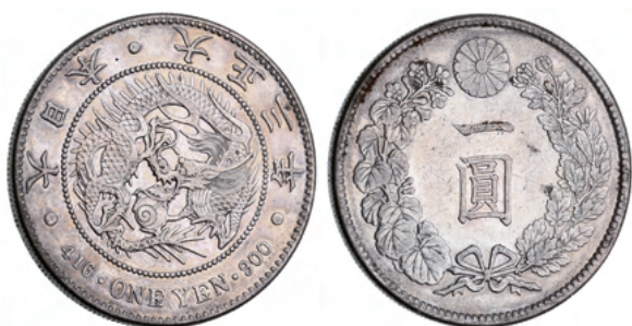
2309* Japan , Taisho, silver yen, yr 3 (1914) (KM.Y.38). Nearly extremely fine.