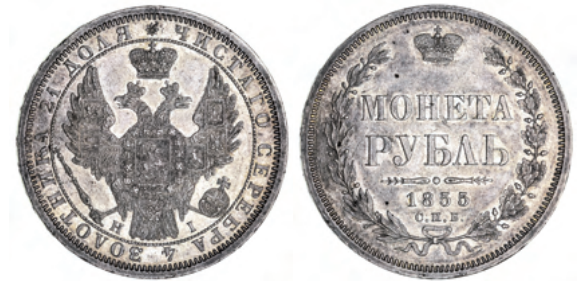
2382* Russia , Nicholas I, silver rouble, 1855 C.H.E. HI (KM. C.168.1). Toned good very fine.