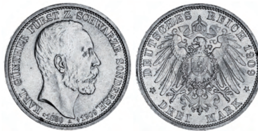
2263* Germany, Schwarzburg-Sonderhausen, Karl Gunther, silver three mark, 1909A (KM.154; J.170). Nearly uncirculated.