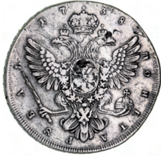
2351* Russia, Anna, silver rouble, 1738 (KM.204). Very fine. $350