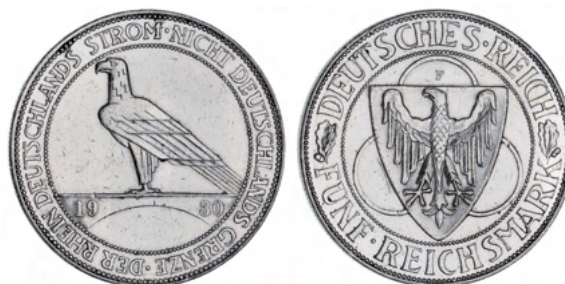
2280* Germany, Weimar Republic, silver five mark, 1930F (KM.71; J.346) Liberation of Rhineland. Scratching under bridge on the reverse, otherwise nearly extremely fine.