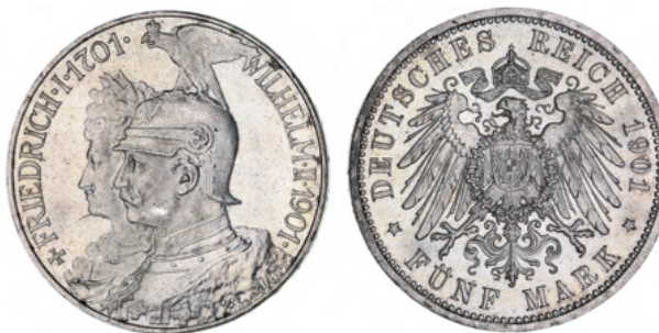
2250* Germany, Prussia, Wilhelm II, silver five mark 1901 (KM.526; J.106). Lightly toned, wiped right obverse field, otherwise uncirculated. $200