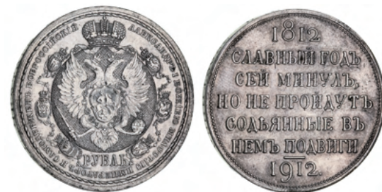
2391* Russia, Nicholas II, silver rouble, 1912, Defeat of Napoleon commemorative (KM.Y.68). Good extremely fine and scarce.