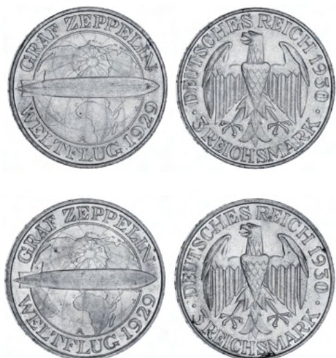
2277* Germany, Weimar Republic, silver three mark, 1930A, Graf Zeppelin Flight (KM.67; J.342). Nearly uncirculated; uncirculated. (2)