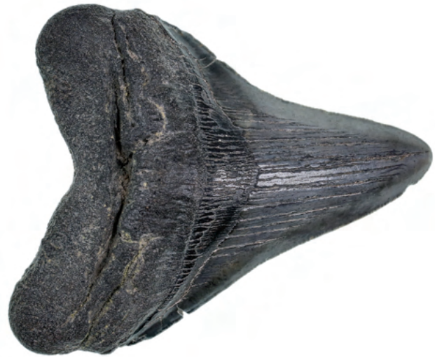
2560* Megalodon tooth , ( Carcharocles megalodon ), Miocene Era - (22-18 million years ago), medium piece with grey enamel, black root and serrations, (11cm long x 8.5cm wide). Extremely fine and rare.