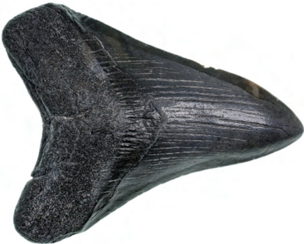
2558* Megalodon tooth , ( Carcharocles megalodon ), Miocene Era - (22-18 million years ago), medium piece with black enamel and black root, (10.5cm long x 8cm wide). Nearly extremely fine and rare.