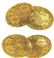
2477* Cufflinks , a vintage pair of cufflinks in gold (15ct; 11.52g), each link features two oval sections joined by a link and the oval sections are elaborately decorated with hand engraving. Very fine.