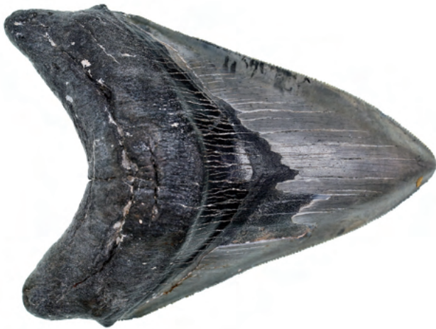
2549* Megalodon tooth , ( Carcharocles megalodon ), Miocene Era - (22-18 million years ago), large piece with grey enamel, black root and serrations, (13cm long x 9.5cm wide). Very fine with some losses of enamel, rare.