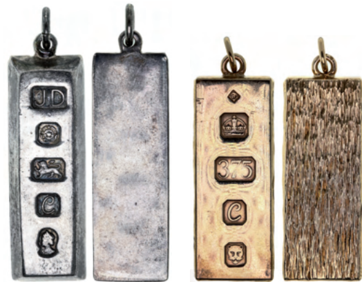
2463* Rectangular ingots, silver (.925) Sheffield 1977 by JD (31.99); gold (.375)(28.31g) London 1977 by T (?). Very fine. (2) $850