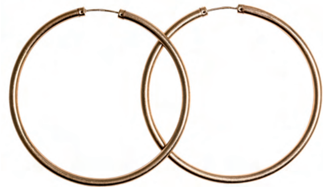
2475* Gold hoop earrings , 50mm diameter, 9ct yellow gold, total weight 5.17g. Fine.