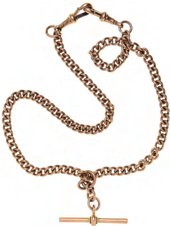
2459* Fob chain, curb link, 9ct rose gold, total weight 20g. Very fine. $450