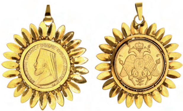
2456* Cyprus, Archbishop Makarios, gold sovereign, 1966 with floral surround mount (13.56g). Nearly extremely fine. $750