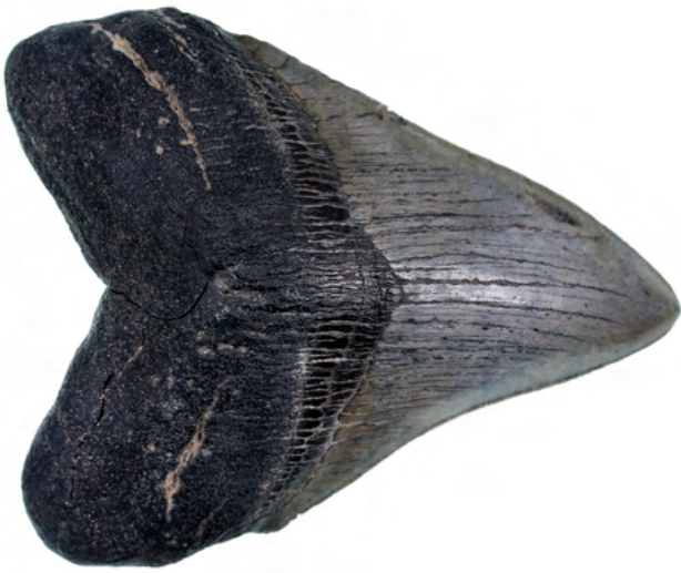
2548* Megalodon tooth , ( Carcharocles megalodon ), Miocene Era - (22-18 million years ago), large piece with grey enamel, black root and serrations, (12cm long x 10cm wide). Extremely fine and rare.