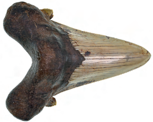
2555* Megalodon tooth , ( Carcharocles suriculatus ), Eocene Era - (54 million years ago), medium piece with cusps, tan coloured enamel, dark brown root and serrations, (9.5cm long x 7.5cm wide). Extremely fine and rare.