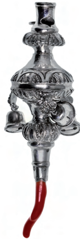
2536* Sterling silver baby rattle , hallmarked Birmingham, 1865, maker George Unite, the repoussé decorated body with whistle, three bells and a coral teether, (11.5cm long, 26.57 g weight). Extremely fine and a good maker . $300