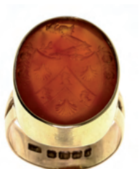
2476* Men's ring , in gold, (18ct, tot wt 13.36 g), hallmarked Birmingham, 1903, maker H Aston Ltd, set with a large oval carnelian intaglio, intricately carved with a heraldic crest depicting escallops and griffin heads (Earle family?). Extremely fine, the carnelian engraving of the highest quality.