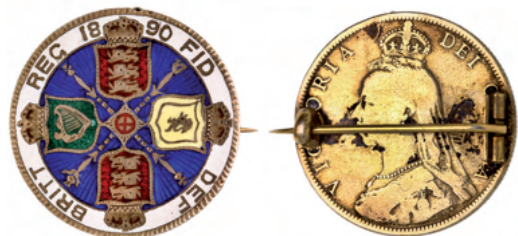
2464* A small collection of enamelled British coins, reverse George III crown 1818 (pin brooch mount) another, uncertain date; William IV halfcrown 1821 enamelled date in error for 1836 (pin brooch mount); Queen Victoria young head crown 1844, Jubilee coinage, double florin 1887, florin 1890, shilling 1887. Very good - very fine. (7) $400