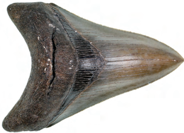
2554* Megalodon tooth , ( Carcharocles megalodon ), Miocene Era - (22-18 million years ago), medium piece with grey enamel, black root and serrations, (11cm long x 8.5cm wide). Extremely fine and rare.