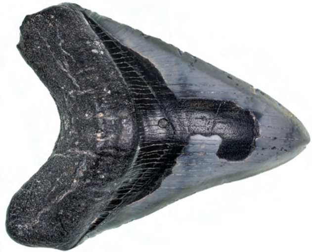
2551* Megalodon tooth , ( Carcharocles megalodon ), Miocene Era - (22-18 million years ago), large piece with grey enamel and black root, (13.5cm long x 10.5cm wide). Very fine with some losses of enamel and slight chip to root, rare.