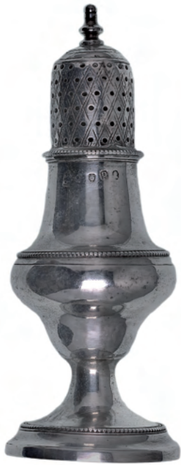
2534* Sterling silver pepper pot , hallmarked London, 1790, maker Samuel Davenport, the associated pierced lid hallmarked George Cowdery? possibly over Hester Bateman, of baluster form with circular base, (68.95 g, 140mm high). Very fine . $150