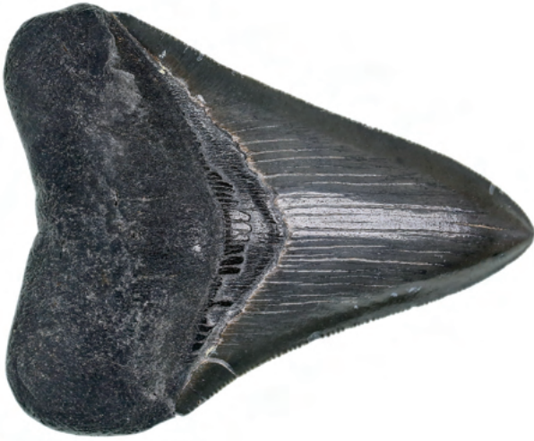
2557* Megalodon tooth , ( Carcharocles megalodon ), Miocene Era - (22-18 million years ago), medium piece with grey enamel, black root and serrations, (9cm long x 7cm wide). Extremely fine and rare.