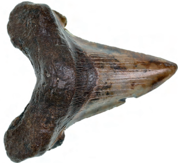
2561* Megalodon tooth , ( Carcharocles suriculatus ), Eocene Era - (54 million years ago), medium piece with cusps, tan coloured enamel, dark brown root and serrations, (9cm long x 7.5cm wide). Nearly extremely fine and rare.