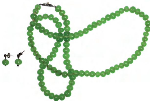
2483* Jade necklace and earrings , attractive vintage Russian jade beaded necklace and earrings, pearl clasp on necklace, some cracks to beads. Fine.