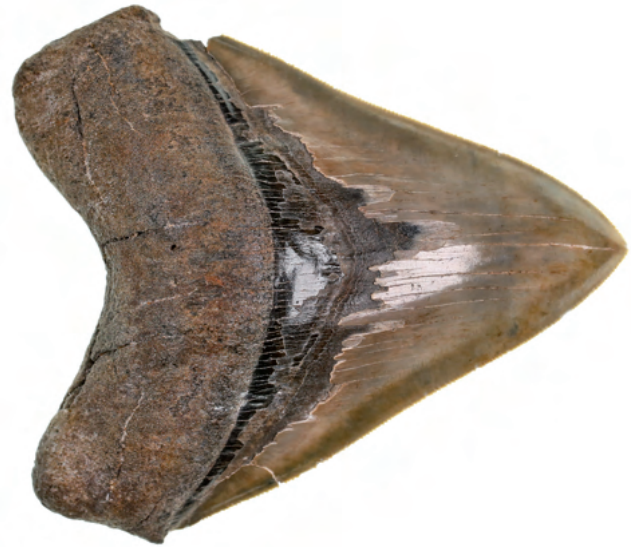
2550* Megalodon tooth , ( Carcharocles megalodon ), Miocene Era - (22-18 million years ago), medium piece with tan coloured enamel, grey root and serrations, (12cm long x 10cm wide). Extremely fine and rare.