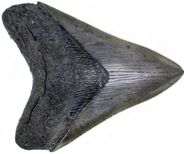
2553* Megalodon tooth , ( Carcharocles megalodon ), Miocene Era - (22-18 million years ago), medium piece with grey enamel, black root and serrations, (10cm long x 8.5cm wide). Extremely fine and rare.