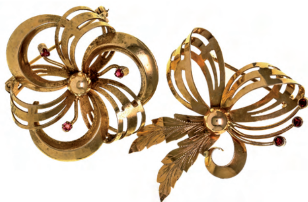
2479* Brooches , 2 attractive mid century floral and ribbon design brooches with 3 pink stones in each, 18ct gold, total weight 20g. Very fine.