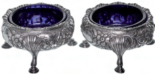
2535* Sterling silver salts , hallmarked, London, 1891, maker Goldsmiths & Silversmiths Co (William Gibson & John Lawrence Langman), the pair of cauldron form, with gadrooned rims, on three shell and paw feet, chased with flowers and foliage to the bowls, with blue glass linings, (total weight without linings 167.20 g). Extremely fine . (2) $250