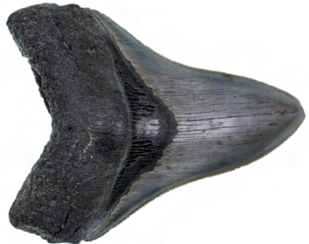
2556* Megalodon tooth , ( Carcharocles megalodon ), Miocene Era - (22-18 million years ago), medium piece with grey enamel, black root and serrations, (10cm long x 8cm wide). Extremely fine and rare.