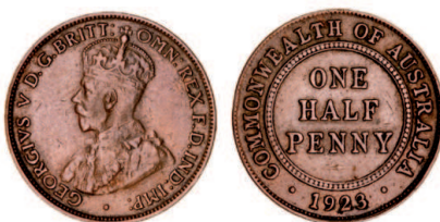
2340* George V, 1923. Diagnostic die breaks either side, even brown patina, six pearls and nearly full centre diamond, nearly very fine.

Private purchase from Jaggards 26/7/83 ($475).