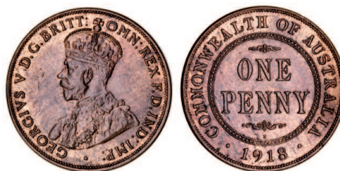
2278* George V, 1918I. Brown and red, good extremely fine and rare thus.