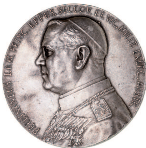
Lot 2398 part