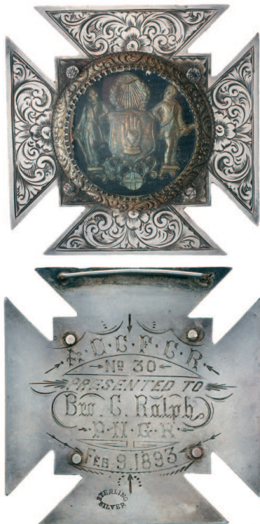
Lot 2376 part