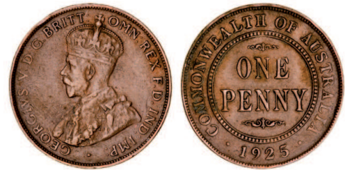
2286* George V, 1925, London die. Plain die state, nearly very fine.