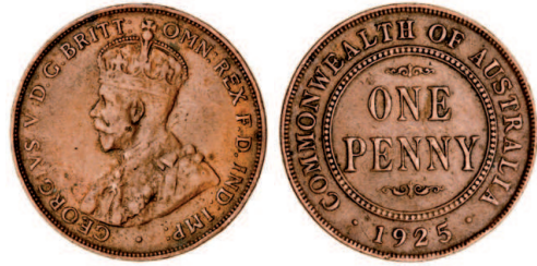
2294* George V, 1925, London die. Horizontal line on neck die state, even brown patina however there are a few marks on the obverse, otherwise very fine.