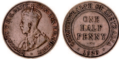
2338* George V, 1923. Peripheral die breaks on left side of obverse (with die cud) and reverse, even brown patina, nearly fine/good fine and extremely rare die state.

Private purchase from Status with their 2x2 holder ($1,950).