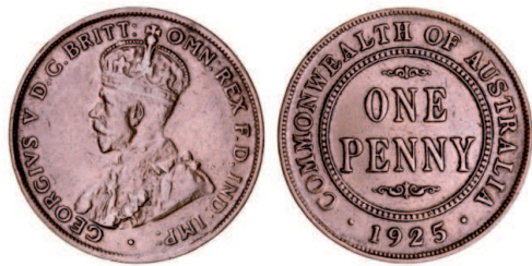
2291* George V, 1925 London die. Q die state; plain die state, first damaged, otherwise very fine; second six pearls even brown patina, very fine. (2)