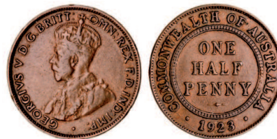
2344* George V, 1923. Six pearls, even brown patina, nearly very fine.