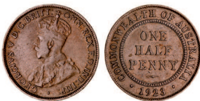
2341* George V, 1923. Peripheral die breaks either side, good fine/very fine.