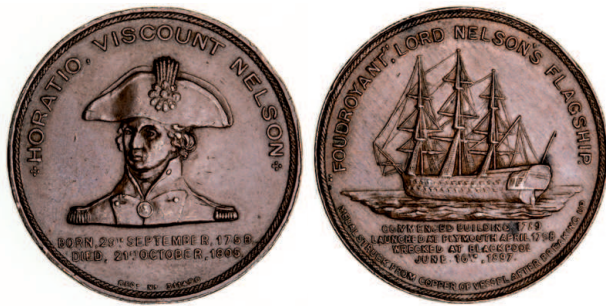
2378* Admiral Horatio Nelson, 1897 , in copper (37mm) breaking up of the flagship Foudroyant (BHM 3613; Eimer 1813). Glossy brown patina, extremely fine.