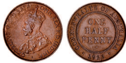
2339* George V, 1923. Peripheral break either side on the left only, dark brown patina, full centre diamond, very fine or better.