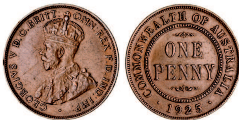
2292* George V, 1925 London die. Horizontal line on neck die state, eight pearls, three tiny rim nicks, otherwise nearly extremely fine.