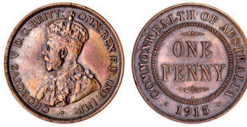
2275* George V, 1915H. Cleaned, glossy patina, good very fine.