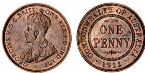
2271* George V, 1911. Good extremely fine with some mint red or nearly uncirculated.