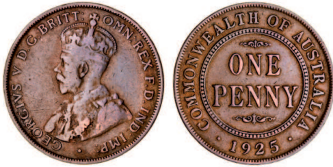
2290* George V, 1925 London die. Q die state, fine/good fine.