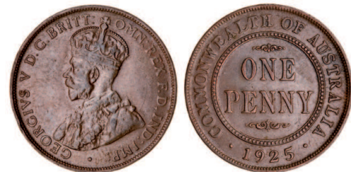
2288* George V, 1925 London die. Q die state, very fine.