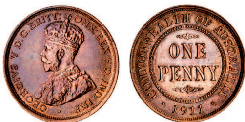
2272* George V, 1911. Cleaned and rubbed, otherwise good extremely fine.