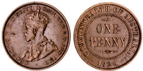
2281* George V, 1920 dot below bottom scroll, London die. Nearly very fine and rare thus.