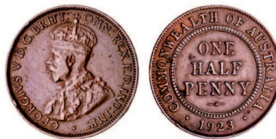
2346* George V, 1923. Six pearls, part centre diamond, even brown patina, minor rim nicks, otherwise very fine.