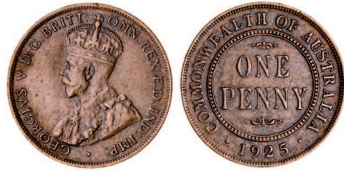
2293* George V, 1925, London die. Horizontal line on neck die state, porous surface, otherwise very fine.