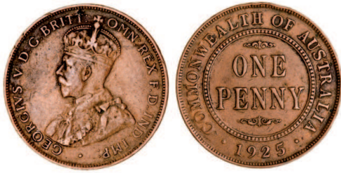
2289* George V, 1925, London die. Q die state, brown patina, very fine.