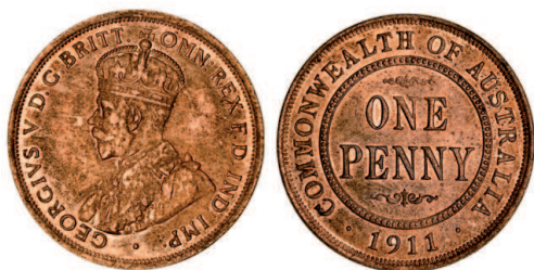
2270* George V, 1911. Dusty spotted obverse, some mint red, nearly uncirculated.