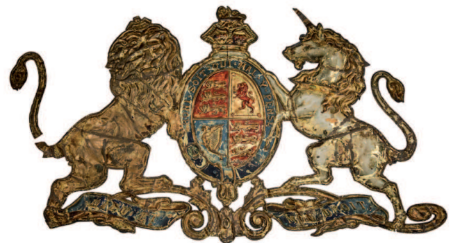
2381* Vintage British Royal coat-of-arms, pre 1900 , voided design in pressed metal (approx 70x45cm), hand painted. Much of the paint worn or faded, otherwise very good.