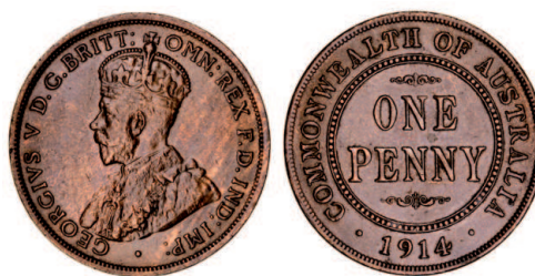
2274* George V, 1914. Sloping 4 variety, glossy nearly extremely fine and very scarce thus.