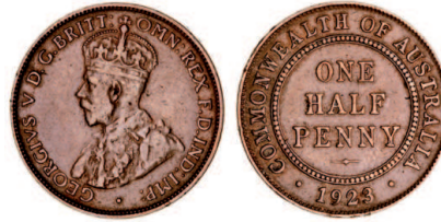
2342* George V, 1923. Diagnostic peripheral die breaks either side, even brown patina, nearly very fine.