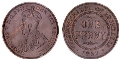
2273* George V, 1913 and 1927 London die. Extremely fine; good extremely fine. (2)