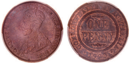
2285* George V, 1923. Patchy tone, good extremely fine.