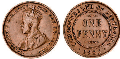
2295* George V, 1925, London die. Horizontal line on neck die state, nearly very fine.