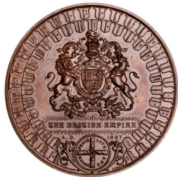
2380* Queen Victoria, the British Empire, 1897 , in bronze (76 mm) by Spink & Son London (Eimer 1816; BHM 3511). Good extremely fine.