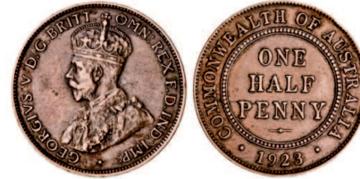
2343* George V, 1923. Diagnostic peripheral die breaks either side, eight pearls and centre diamond, good very fine.