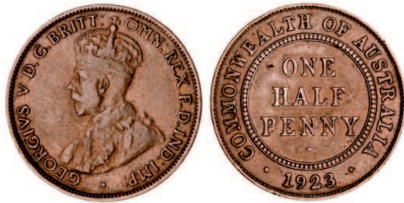
2337* George V, 1923. Peripheral die breaks either side, medium brown patina, six pearls, fine/good fine.