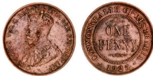
2298* George V, 1925 London die. Broken N die state, dry verdigris areas, otherwise extremely fine sharpness.