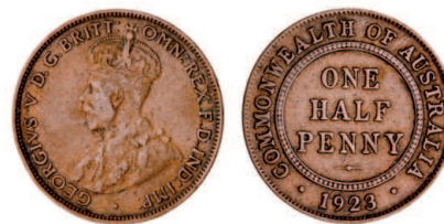
2345* George V, 1923. Diagnostic peripheral die breaks either side, part centre diamond, even brown patina, nearly very fine.