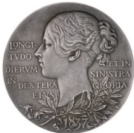
2379* Diamond Jubilee Of Queen Victoria, 1897 , medallion in silver (56mm) by G.W. de Saulles after T.Brock/W.Wyon (BHM 3506; Eimer 1817) in red Royal Mint case of issue. Gun metal grey toned, uncirculated.