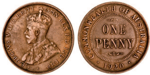
2280* George V, 1920 dot below bottom scroll, London die. Well struck denticles, nearly very fine and very rare, especially in this condition.