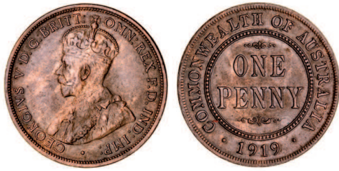
2279* George V, 1919 and 1920 dot below scroll, Indian die. Extremely fine; good very fine. (2)