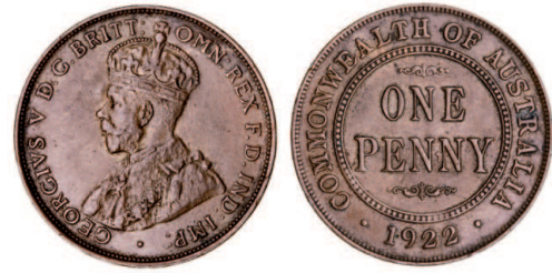
2284* George V, 1922 London die. Extremely fine.