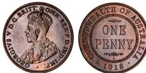
2277* George V, 1918I. Glossy grey brown patina, nearly uncirculated.