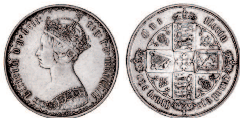
2570* Queen Victoria , Gothic florin, 1853 (S.3891). Good very fine.