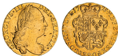
2418* George III, guinea, fourth bust, 1775 (S.3728). Slightest haymarking on the obverse, otherwise extremely fine or better.

Private purchase from Jaggards with their holder.