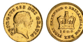
2421* George III, third guinea, second head, 1809 (S.3740). Very fine.

Private purchase from Jaggards with their 2x2 holder.