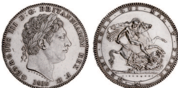
2552* George III, new coinage, silver crown, 1819 LIX (S.3787). Polished, good extremely fine. $500