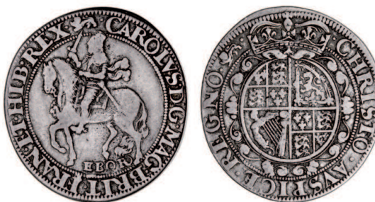
2523* Charles I, (1625-1649), York Mint silver halfcrown, mm lion (S.2869)(14.73g). Evenly worn, toned fine.