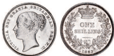
2571* Queen Victoria , young head, shillings, 1853 (S.3904). Full original mint bloom, choice uncirculated.