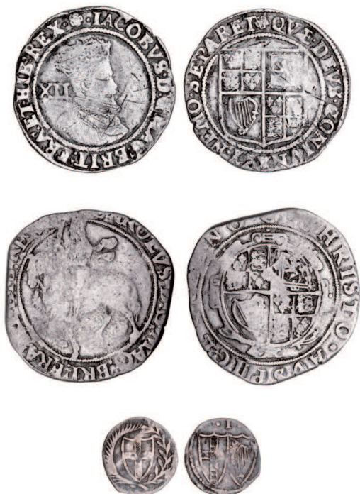
2520* James I, (1603-1625), second coinage, shilling, mm rose (1605-6), fourth bust (S.2655); Charles I, (1625-1649), Tower Mint halfcrown, group IV mm triangle in circle (1641-3)(S.2779); Commonwealth, (1649-1660), silver penny (S.3222). Very good; very good; fine. (3)