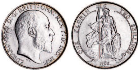
2598* Edward VII, florin, 1902 (S.3981). Nearly uncirculated.