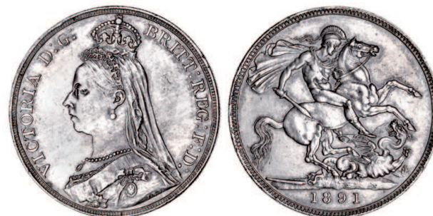
2572* Queen Victoria , Jubilee coinage, silver crowns, 1887 and 1891 (S.3921). Mirror-like fields obverse scuffs, otherwise good extremely fine; nearly extremely fine. (2)