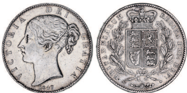
2568* Queen Victoria , young head, silver crown, 1847 (S.3882). Good very fine.