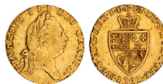
2419* George III, half guinea, fifth bust or spade type, 1797 (S.3735). Nearly very fine/very fine.