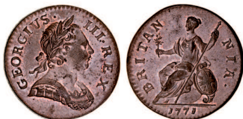
2546* George III, first issue, copper halfpenny 1771 (S.3774). Traces of original mint red, red brown toned, nearly uncirculated. $200