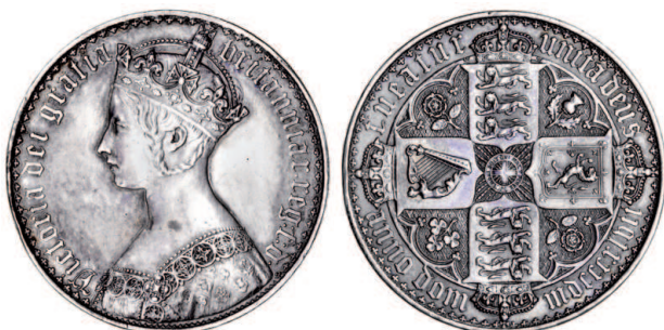
2569* Queen Victoria , Gothic crown, 1847 undecimo (S.3883). Plugged from mount removed on edge at A of TVTAMEN, otherwise polished, toned extremely fine.