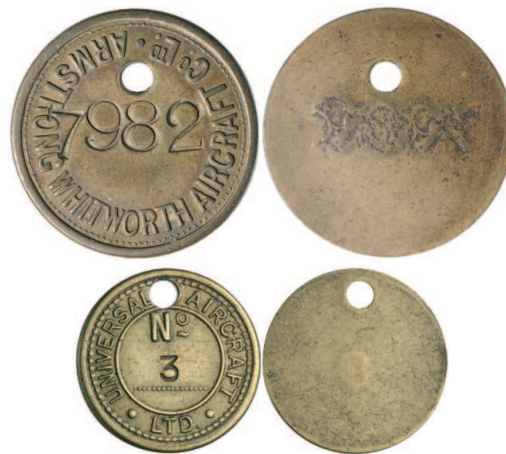
2642* Tokens, Universal Aircraft Ltd, Factory Token 'No 3', brass (24mm); another, Armstrong Whitworth Aircraft Co Ltd factory token '7982', bronze (30mm), both holed for suspension. Fine - very fine and rare. (2)