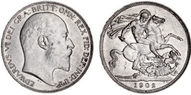
2596* Edward VII, silver crown, 1902 (S.3978). Good extremely fine.