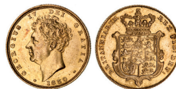
2424* George IV, bare head, sovereign, 1830 (S.3801). Nearly extremely fine.