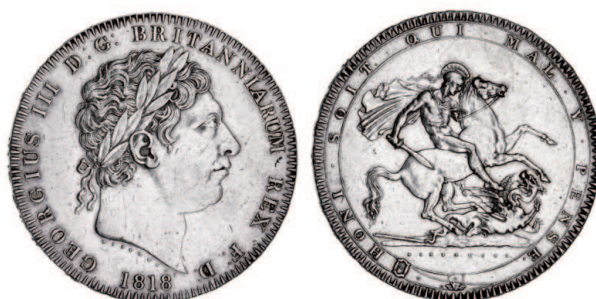
2551* George III, new coinage, silver crown, 1818 LVIII (S.3787). Good very fine. $250