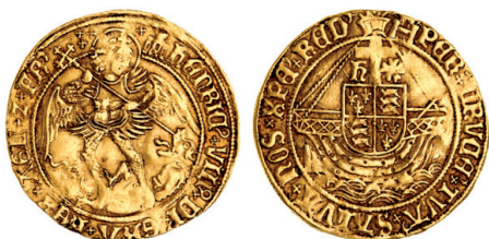
2416* Henry VIII, (1509-1547), first coinage 1509-26, angel, mm castle/castle with H (S.2265). Weak area on dragon's body, otherwise very fine.