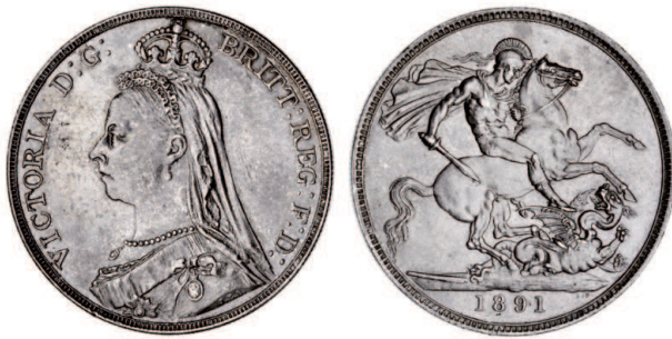
2576* Queen Victoria , Jubilee coinage, silver crown, 1891 (S.3921). Grey toned, nearly extremely fine/extremely fine.