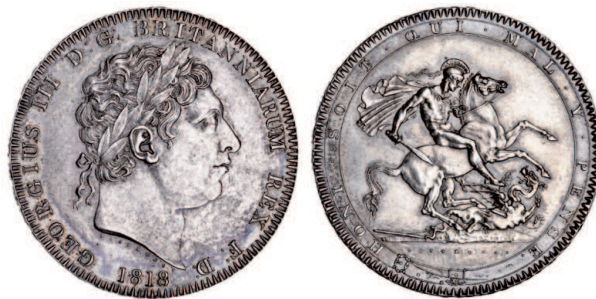
2550* George III, new coinage, silver crown, 1818 LVIII (S.3787). Underlying mirror-like fields, iridescent toning, good extremely fine. $400