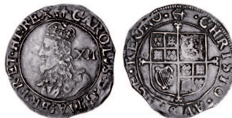
2522* Charles I, (1625-1649) Tower Mint, silver shilling type 4.1mm anchor sideways (1638-9)(S.2797). Toned very fine.