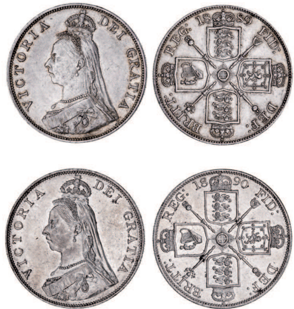
2581* Queen Victoria , Jubilee coinage, double florins 1889 and 1890 (S.3923). Good very fine; extremely fine. (2)