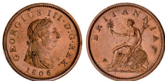
2549* George III, fourth issue, copper penny, 1806 (S.3780). Light red brown patina with underlying mint bloom, good extremely fine. $100