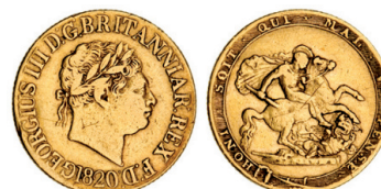
2422* George III, new coinage, sovereign, 1820 open 2 (S.3785C). Scratched, otherwise good fine.

Private purchase from Jaggards with their 2x2 holder.