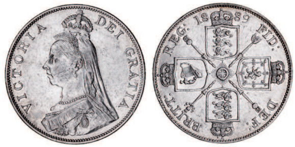
2580* Queen Victoria , Jubilee coinage, double florin, 1889, inverted 1 for I in Victoria (S.3923). Surface marks, nearly extremely fine/extremely fine and very scarce.