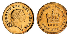
2420* George III, third guinea, second head, 1808 (S.3740). Obverse scratch, otherwise nearly extremely fine.

Private purchase from Jaggards with their 2x2 holder.