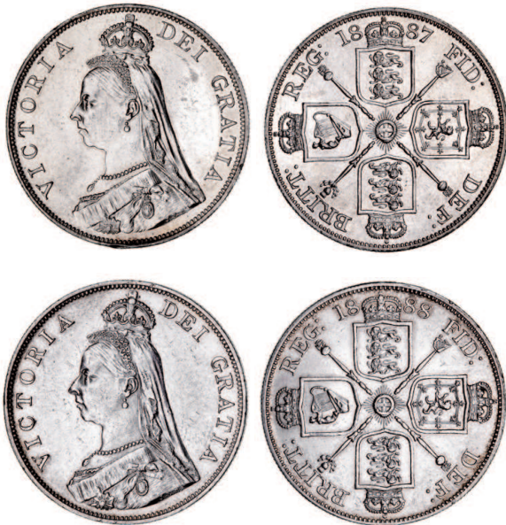
2577* Queen Victoria , Jubilee coinage, double florins, 1887, Arabic I; 1888 (S.3923). Nearly uncirculated; extremely fine/good extremely fine. (2)