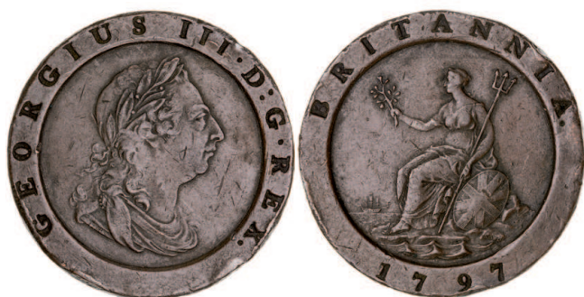
2547* Great Britain, George III, copper cartwheel twopence, 1797 (S.3776). Even chocolate brown tone, minor edge knocks, good very fine. $150