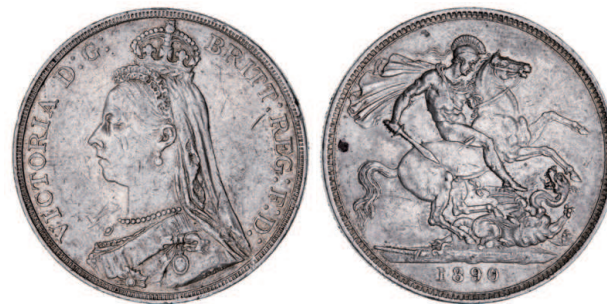
2574* Queen Victoria , Jubilee coinage, silver crowns 1889 and 1890 (S.3921). Extremely fine; nearly extremely fine. (2)