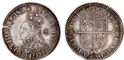
2518* Elizabeth I, (1558-1603) milled coinage, sixpence, 1562 (S.2596)(3.05g). Die flaw at 9 on obverse, grey toned very fine or better.