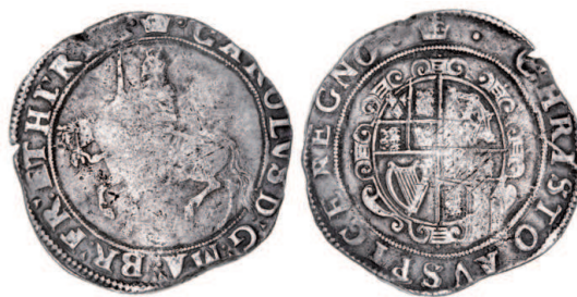
2521* Charles I, (1625-1649) Tower Mint silver halfcrown, group III, 2a1, mm crown (1635-6)(S.2773). Toned nearly fine.