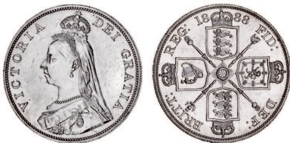
2579* Queen Victoria , Jubilee coinage, double florin 1888 (S.3923). Full mint bloom, uncirculated.

Ex Mayor's Hoard, the second from Lawson's auction (lot 303) with lot card.