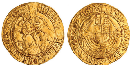
2415* Henry VII, (1485-1509), angel, type V, mm pheon (1509)(S.2187). Good very fine.