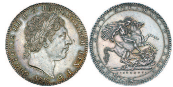
2553* George III, new coinage, silver crown, 1819 LIX (S.3787). Blue grey and red toning, nearly extremely fine. $400