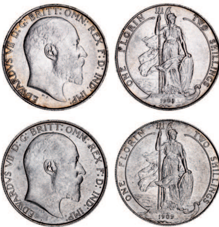
2599* Edward VII, florins 1903 and 1909 (S.3981). Very fine; nearly extremely fine. (2)