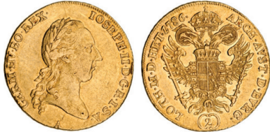
2646* Austria, Joseph II, two ducats, 1786A (KM.1876). Two rim bruises, otherwise nearly extremely fine/ extremely fine. $800