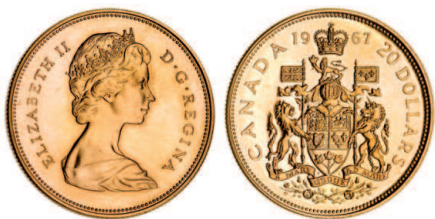
2679* Canada, Elizabeth II, specimen set, 1967, Centennial, includes gold twenty dollars. In case of issue, silver toned, otherwise FDC. (7)