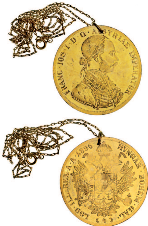
2657* Austria, Franz Joseph, four ducats, 1896, Levantine jewellers' copy (cf KM.2276) with 22 carat fine chain (coin 8.18g with chain 10.24g). Extremely fine or better.