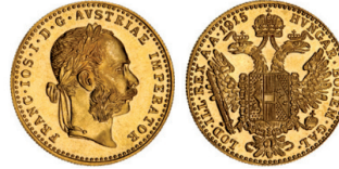
2652* Austria, Franz Joseph, one ducat, 1915 restrike (KM.2267). Extremely fine. $300