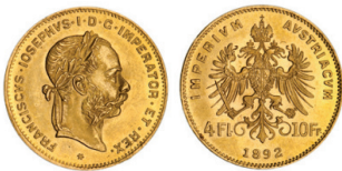
2648 Austria, Franz Joseph, four florins/ten francs, 1892 restrike (KM.2260). Extremely fine. (2) $300