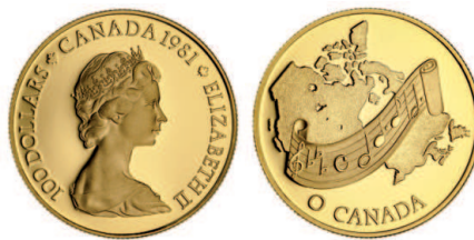
2682* Canada, Elizabeth II, proof one hundred dollars, 1981, Anthem (KM.131). In case of issue with certificate 058004, FDC.