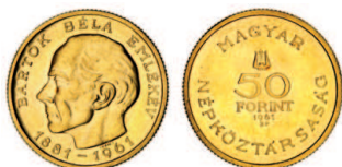
2710* Hungary , fifty forint, 1961BP (KM.562) 80th Anniversary Birth of Bartok. Extremely fine.