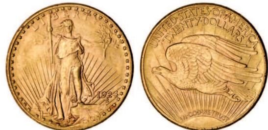
2793* USA, twenty dollars or double eagle, 1924, St. Gaudens. Nearly uncirculated.