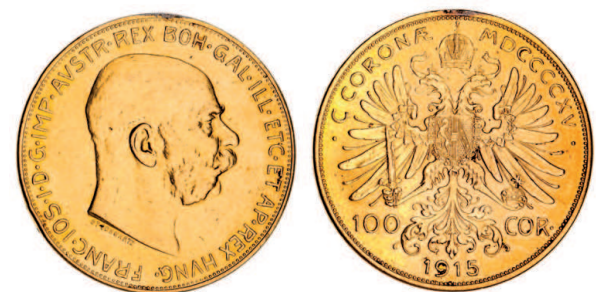
2662* Austria, Franz Joseph, one hundred corona, 1915 (KM.2819). Possibly mounted on the top, otherwise very fine or better.