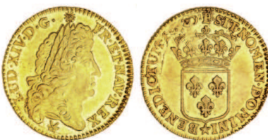
2692* France, Louis XIV, Louis d'or 1690P star Dijon (KM.278.13). Date double struck, some mint bloom, nearly uncirculated and rare thus.