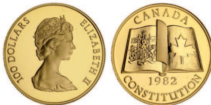
2683* Canada, Elizabeth II, proof one hundred dollars 1982, Constitution (KM.137). In case of issue with certificate 107716, FDC.