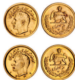
2716* Iran , Mohammad Reza Pahlavi Shah, half pahlavi, SH 1338, 1345 (2), 1349, 1354 (KM.1161). Extremely fine-uncirculated. (5)