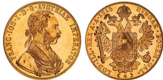
2654* Austria, Franz Joseph, four ducats, 1915, restrike (KM.2276). Uncirculated. $1,100