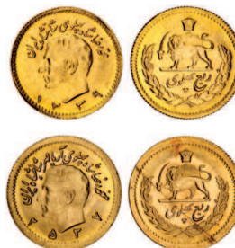
2715* Iran , Mohammad Reza Pahlavi Shah, quarter pahlavi, SH 1339 (KM.1160a) MS 2537 (KM.1198). Uncirculated. (2)