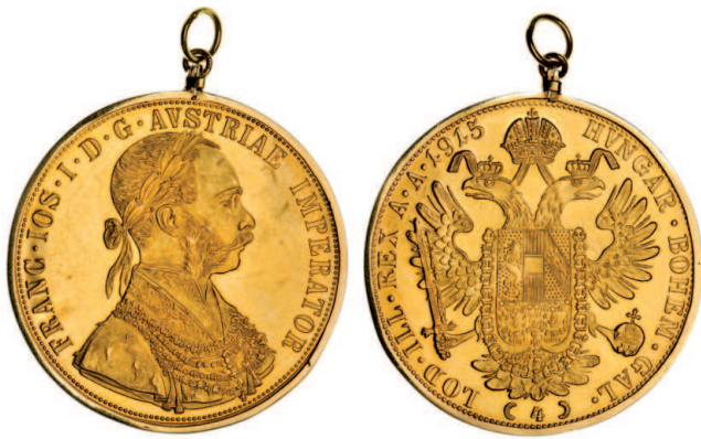
2656* Austria, Franz Joseph, four ducats, 1915 (KM.2276) restrike (16.02g). Set in 14 carat (.585) surround mount, otherwise good extremely fine.