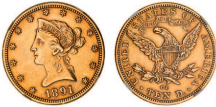
2785* USA, ten dollars or eagle, 1891cc, Liberty head. Surface marks, otherwise nearly extremely fine.