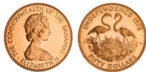
2663* Bahamas, Elizabeth II, fifty dollars 1973 (KM.48). Uncirculated.