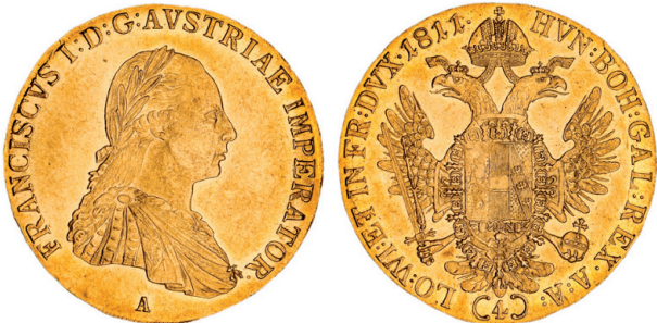
2647* Austria, Franz II, four ducats, 1811A (KM.2177). Considerable mirror-like brilliance, minor surface hairline scratch not visible to the naked eye, nearly uncirculated and very scarce. $2,500