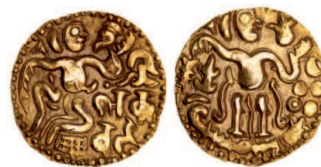
2684* Ceylon (Sri Lanka), Period of the Chola Invasion, (c.990-1070), gold Kahavanu, 20mm, (4.39 g), obv. King reclining right, holding annulet, rev. King standing facing, head right, holding globule; altar, flames, conch, pellets, and lotus around, (Mitchiner, Non-Islamic 825; Friedberg 1). Good very fine, scarce.