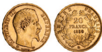
2694* France, Napoleon III, twenty francs, 1859BB (KM.781.2). Fine.