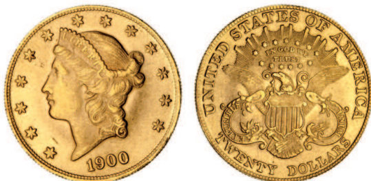
2789* USA, twenty dollars or double eagle, 1900, Liberty Head, jewellers' copy (32.03g). Nearly uncirculated.