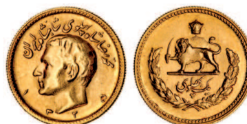
2714* Iran , Mohammad Reza Pahlavi Shah, pahlavi, SH 1325 (KM.1150). Nearly uncirculated.