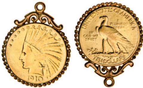
2787* USA, ten dollars or eagle, 1910S, Indian head (18.58g). Set in ornate rope entwined and scroll surround mount, very good.