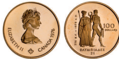
2681* Canada, Elizabeth II, proof gold one hundred dollars, 1976 (KM.116). In case of issue with certificate, FDC.