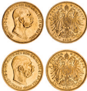
2658* Austria, Franz Joseph, ten corona 1909 (KM.2815), 1910 (KM.2816). Nearly extremely fine. (2)