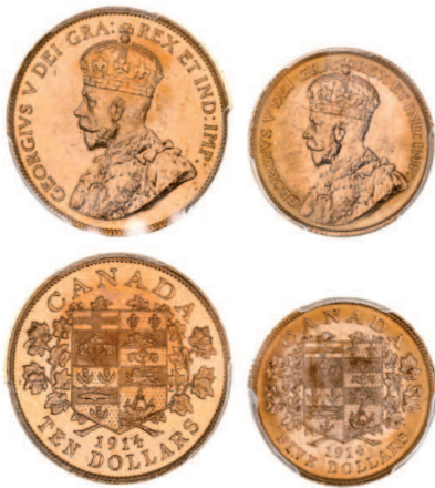
2676* Canada, George V, five and ten dollars, 1914 (KM.26,7). Uncirculated. (2)