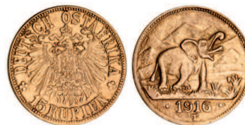
2697* German East Africa, fifteen rupien, 1916T (KM.16.2). Good very fine and rare.