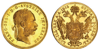
2650* Austria, Franz Joseph, one ducat, 1915 restrike (KM.2267). Uncirculated. $270