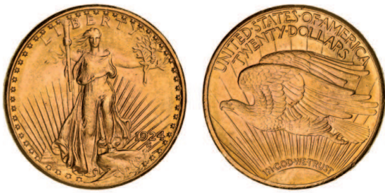
2794* USA, twenty dollars or double eagle, 1924, St. Gaudens. Nearly uncirculated.