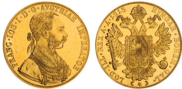
2653* Austria, Franz Joseph, four ducats, 1915 restrike (KM.2276). Uncirculated. $1,200