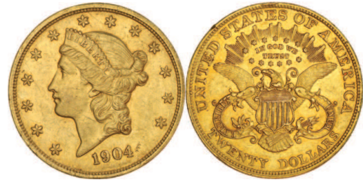
2791* USA, twenty dollars or double eagle, 1904, Liberty head. Rim nicks and edge bump, otherwise good very fine.