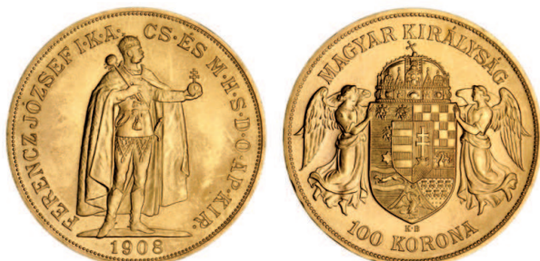
2709* Hungary , Franz Joseph, one hundred korona, 1908, restrike (KM.491). Uncirculated.