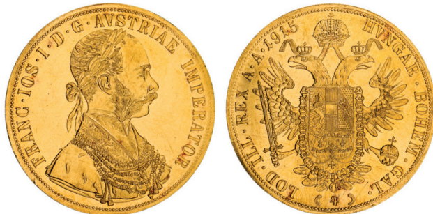
2655* Austria, Franz Joseph, four ducats, 1915 restrike (KM.2276). Slight bending and hairlines, otherwise nearly uncirculated. $1,000