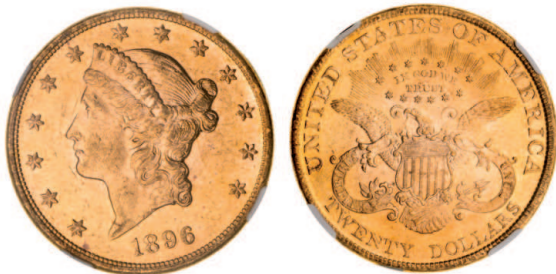
2788* USA, twenty dollars or double eagle, 1896, Liberty head. Considerable original mint bloom, nearly uncirculated.