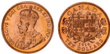
2677* Canada, George V, ten dollars, 1914 (KM.27). Uncirculated.