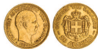
2699* Greece, George, twenty drachma, 1884A (KM.56). Good very fine.