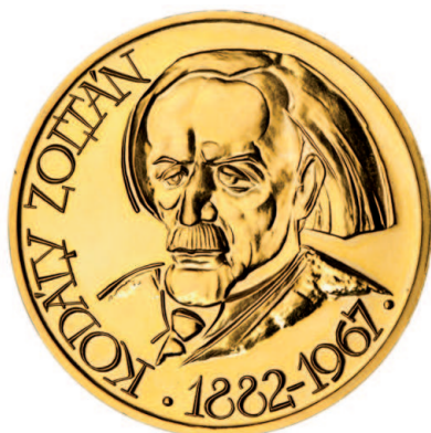
2711* Hungary , one thousand forint, 1967 (KM. 581) 85th Birthday of Zoltan Kodaly. Uncirculated.