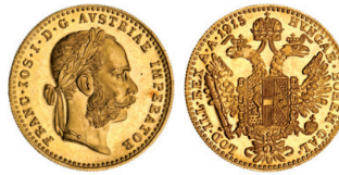
2651 Austria, Franz Joseph, one ducats, 1915 restrikes (KM.2867). Uncirculated. (2) $550