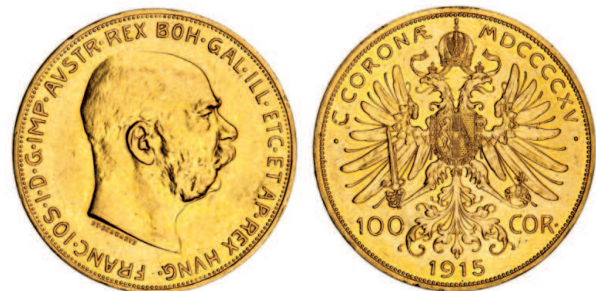
2661* Austria, Franz Joseph, one hundred corona, 1915, restrike (KM.2819). Good extremely fine/nearly uncirculated.