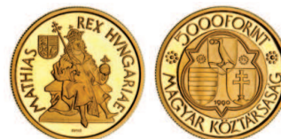
2713* Hungary , proof five thousand forint, 1990BP (KM.681) 500th Anniversary of the death of Mathias. In case with brochure, nearly FDC.