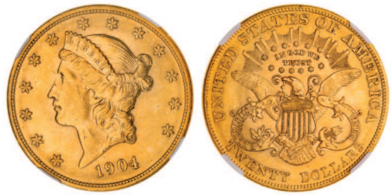
2790* USA, twenty dollars or double eagle 1904, Liberty head. Nearly uncirculated.