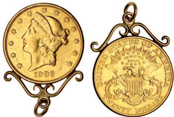
2792* USA, twenty dollars or double eagle, 1906S Liberty head (35.59g). Set with thick scroll mount, very fine.