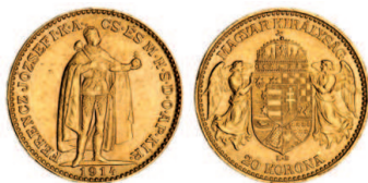
2708* Hungary , Franz Joseph, gold twenty korona, 1914KB (KM.486). Extremely fine or better.