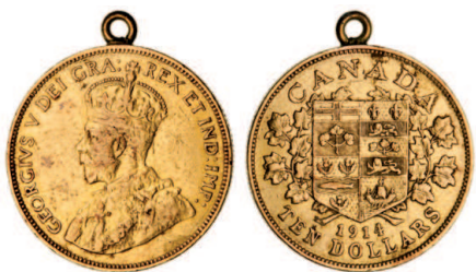
2678* Canada, George V, ten dollars, 1914 (KM.27)(16.80g). Loop mount at top, otherwise very fine.

In a slab by PCGS as MS63, ex Canadian Gold Reserve.