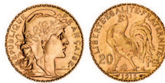
2695* France, Republic, twenty francs, 1913 (KM.857). Good extremely fine.