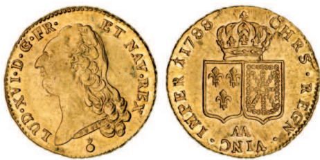
2693* France, Louis XVI, double Louis d'or 1788 AA (Metz)(KM.592.3). Slight adjustment marks in reverse field, some mint bloom, good extremely fine.