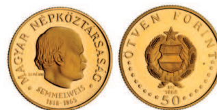
2712* Hungary , proof fifty forint, 1968BP (KM.583) 150th Anniversary Birth of Semmelweis. Uncirculated.