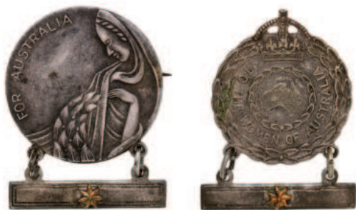
116* Australia, WWII, Mother and Widows badge by Angus & Coote, 1942, pin back, numbered A8383 on reverse, with one star; together with Nearest Female Relative badge, by Angus & Coote, 1942, with one star, numbered A157931 on reverse. Good very fine. (2)