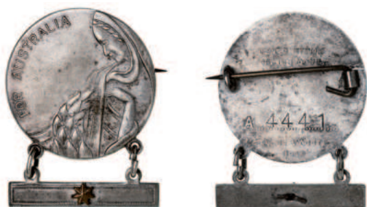
117* Australia, WWII, Mother's and Widow's badge , by Angus & Coote, 1942, numbered A4441, with one star. Some toning, very fine.