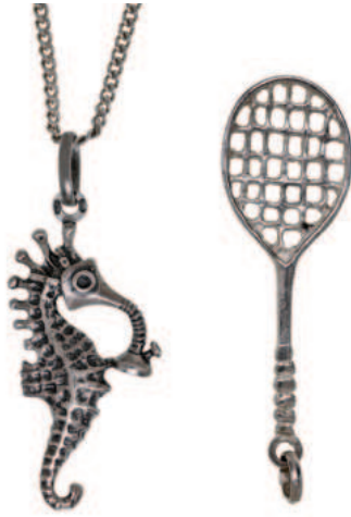
283* Silver pendants on chain, one seahorse and one tennis racket silver pendant with silver chain, total weight 15.36g. Very fine. (3)