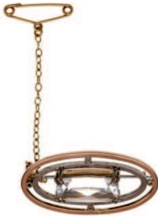
284* Brooch, multicolour 9ct gold brooch featuring rose gold and white gold concentric oval rings, with a large claw set rectangular white stone, complete with a yellow gold pin and safety chain, total weight 7.23g. Extremely fine.