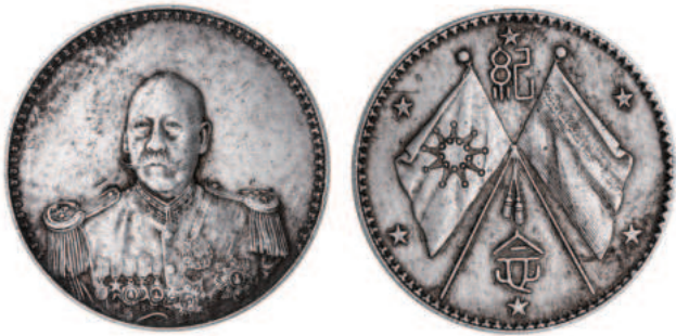
1706* China, Republic, President Tsao Kun in military uniform, silver dollar (1923) (KM.K.678) (26.80g). Some adhesion, surface marks, otherwise very fine.