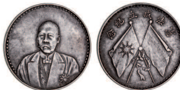
1705* China, Republic, Tsao Kun, silver dollar (1923) (KM.Kann 677) (26.85g). Toned very fine. $500