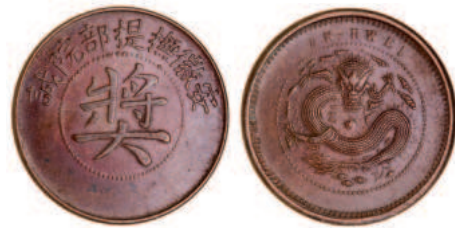
1672* China, Empire, Anhwei Province, military Achen, ten cash (1902) (KM.W47). Glossy brown extremely fine or better and rare.