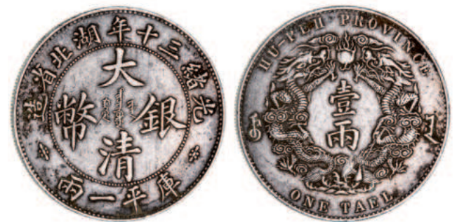
1680* China, Empire, Hupeh Province, bullion silver tael (1904) (37.19g) (KM.128.2). Very fine and scarce.