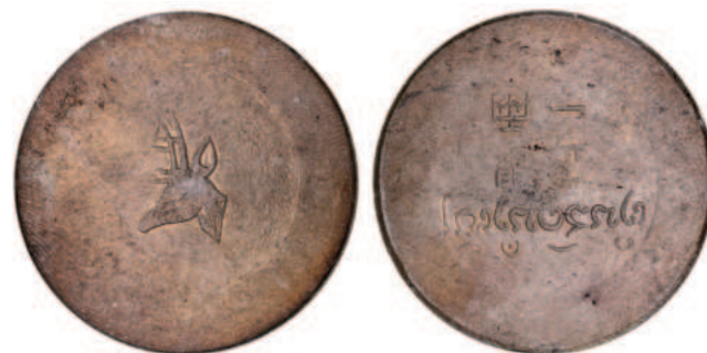
1730* China, Yunnan-Burma, silver tael (1943) (KM.K.939) (36.72g). Flat strike as usual, otherwise very fine.