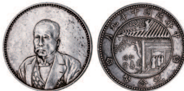
1702* China, Republic, President Hsu Shih-Chang, silver dollar, Yr. 10 (1921), Pavilion reverse (KM.K.676) (26.83g). Good very fine. $1,000