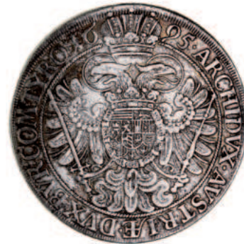
1583* Austria , Leopold I, silver thaler, 1695, Vienna mint (KM.1275.4). Die break and flaw behind head, vertical scratch in front, otherwise good very fine.