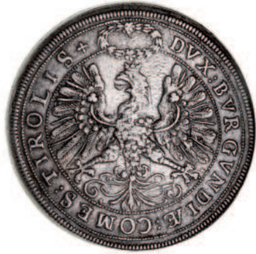
1576* Austria, Leopold, silver two thaler, 1626, Hall mint (KM.641). Good very fine and very scarce.