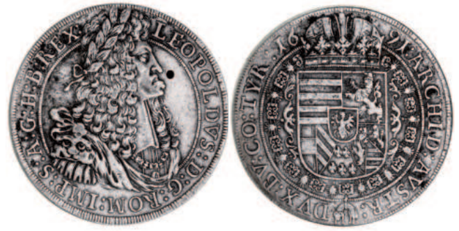
1582* Austria , Leopold I, silver thaler, 1691, Hall mint (KM.1303.2). Punch mark in front of mouth, otherwise nearly very fine. $150

From an old Austro-Hungarian Collection.