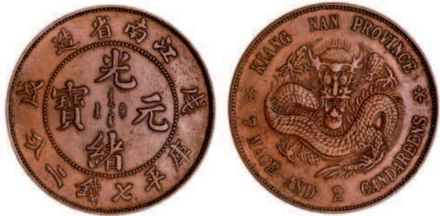
1684* China, Empire, Kiang Nan Province, plain edge pattern dollar in red bronze (KM.Pn4). Extremely fine and rare.