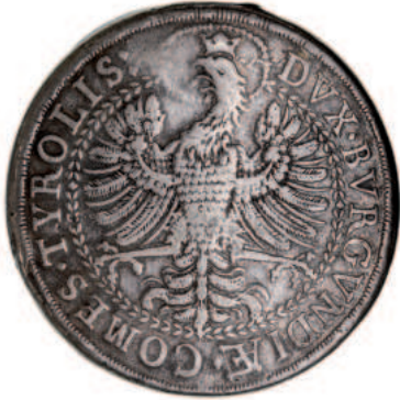
1580* Austria , Ferdinand Charles, silver two thaler, 1646, Hall mint (KM.934). Old mount cut off at top, nearly fine.