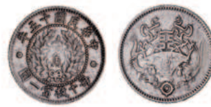
1711* China, Republic, silver ten cents (one chiao) Yr. 15 (1926) (KM.Y.334). Very fine.