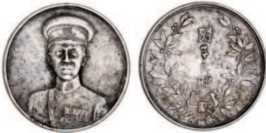
1707* China, Republic, medalllic coinage mid silver 50 cents, Chang Hsueh-liang gift issue (KM.XM535). Toned good very fine.