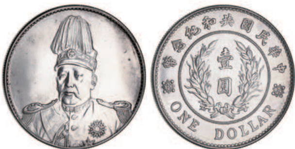
1693* China, Republic, Yuan Shi-kai founding of the Republic, Hung-hsien, silver dollar (1914) (KM.Y.322) (26.62g). Cleaned, nearly uncirculated. $1,000