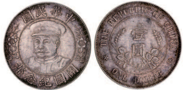
1688* China, Republic, Li Yuan-hung silver dollar (1912) Founding of the Republic (KM.Y.320). Light grey tone, very fine.