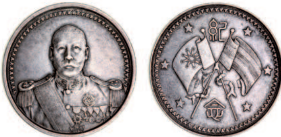
1708* China, Republic, Tsao Kun, silver medal (1923) (KM.XM1231) 3mm thick. Good very fine.