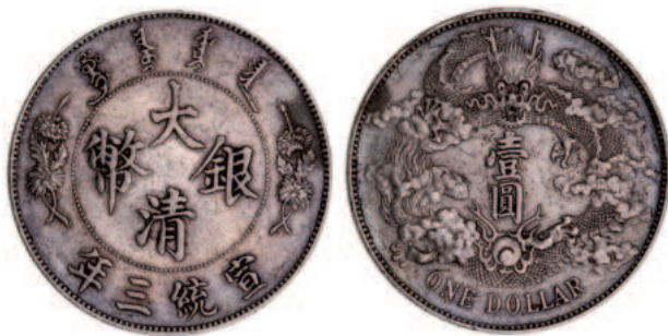
1669* China, Empire, silver dollar (1911) (KM.Y#31). High rim, good very fine.