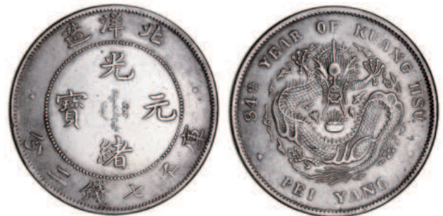
1674* China, Empire, Chihli Province, silver dollar, Yr 34 (1908) (KM.Y.73.3) (26.66g). Good very fine.