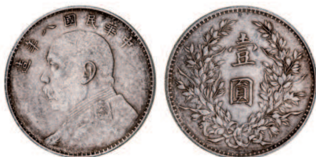
1699* China, Republic, Yuan Shi-kai, silver dollar, Yr. 8 (1919) (KM.329.6) (26.76g). Grey tone, good very fine. $100