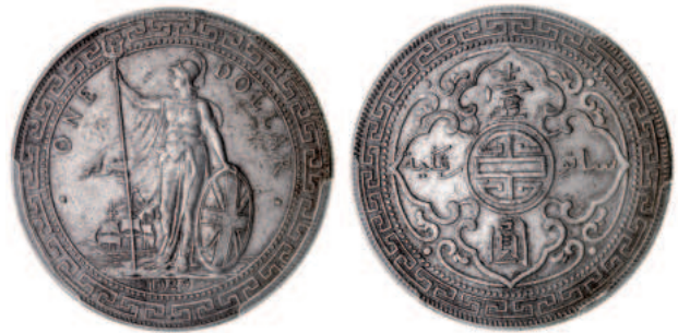
1639* British Trade Dollar, 1929/1 overdate (KM.T.5) (Pridmore 26). Grey brown tone, lightly polished, otherwise nearly extremely fine and scarce.