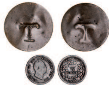
1640* British West Indies, Trinidad (or Tobago) worn French sous countermarked incuse T (of KM5), known as a 'black dog'. Very fine and rare. (2)