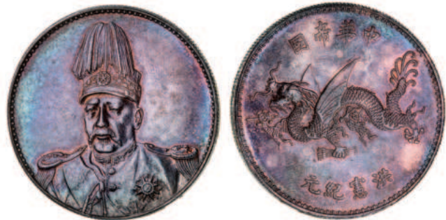
1696* China, Republic, Hung-hsien, silver dollar (1916), (KM. Y332) (26.93g), milled edge. Dark blue grey tone, edge with dirt adhesion (?), otherwise uncirculated. $1,000