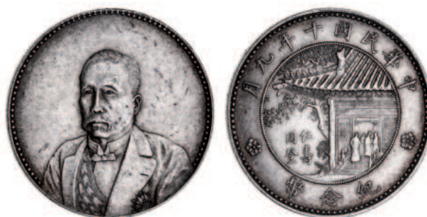
1703* China, Republic, Hsu Shih-Chang, silver dollar, Yr. 10 (1921) 'Pavilion dollar' (KM.Y.676) (26.82g). Toned very fine. $1,000