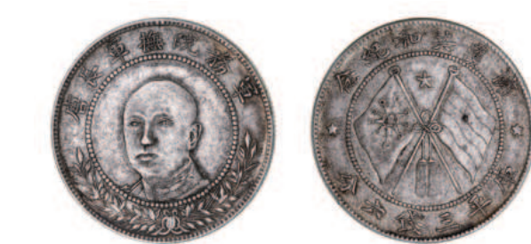
1728* China, Republic, Yunnan Province, General Tang Chi-yao, silver fifty cents (1917) (KM.Y.479). Very fine.