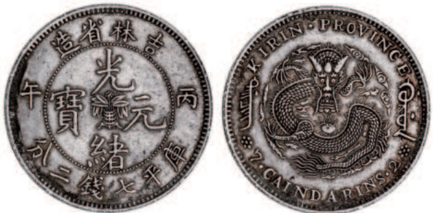
1685* China, Empire, Kirin Province, silver dollar (1907) (KM.Y#183). Good very fine.