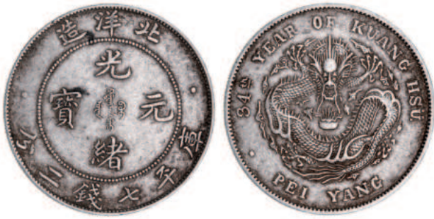
1675* China, Empire, Chihli Province, silver dollar, Yr 34 (1908) (KM.Y#73.3). Very fine.