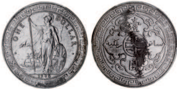
1635* British Trade Dollar, 1908B (KM.T.5). Mud stain on reverse, cleaned, otherwise well-struck, good extremely fine.

In slab by PCGS as XF Detail and AU Detail.