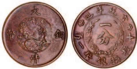
1667* China, Empire, general issue, copper ten cash (1911) (KM. Y.27a). Good very fine.