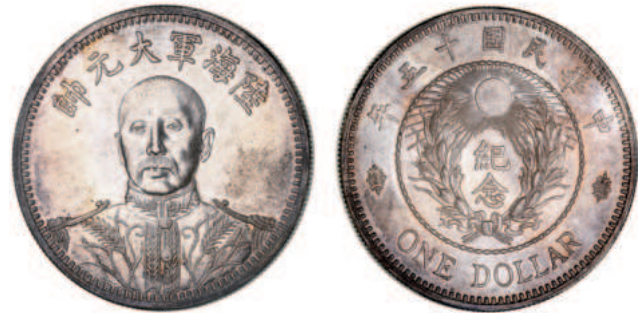
1712* China, Republic, Chang Tso-lin, silver dollar, Yr15 (1926) (26.90g) (KM.Pn79; Kann 685). Light reverse tone, full mint bloom, uncirculated and very rare.