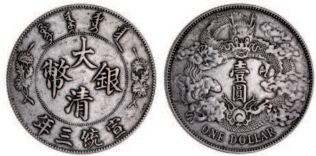
1671* China, Empire, silver dollar (1911) Hsuen Tung (KM.Y.31) (24.65g). Very fine.