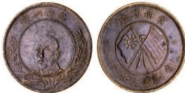
1729* China, Yunnan Province, brass fifty cash (1919) (KM.Y.478). Good very fine.