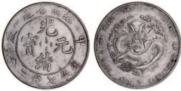
1683* China, Empire, Kiang Nan Province, silver dollar (1904) (KM.Y.145a.12) (26.86g). Good very fine.