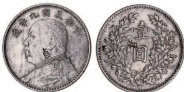
1700* China, Republic, Yuan Shih-kai silver dollar Yr. 9(1920) (KM.Y.329.6) and another with single chopmark either side. Very fine. (2) $300