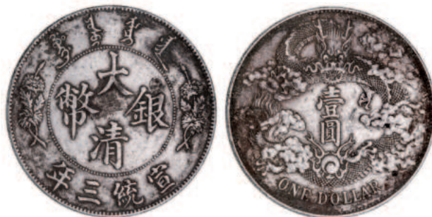
1670* China, Empire, silver dollar (1911) (KM.Y.#31). Some dark adhesions, nearly very fine.