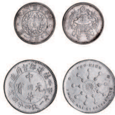
1710* China, Republic, silver ten cents, Yr. 15 (1926) (KM.Y.334); Fukien, silver twenty cents (1911) (KM.Y377). Good very fine; very fine. (2)