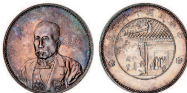
1704* China, Republic, President Hsu Shih-Chang silver dollar, Year 10 (1921), reverse plain under Pavilion for impressing inscription of award (KM.Pn64; 676a.2) (26.94g) edge milled (or straight ground). Attractively toned, uncirculated and rare. $2,500