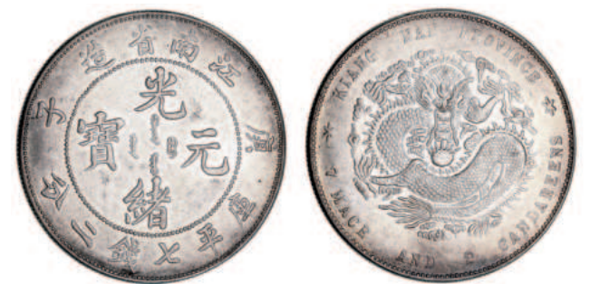
1682* China, Empire, Kiang Nan Province, silver dollar (1900) (KM.Y.145a.4) (26.75g). Mint bloom, nearly extremely fine.