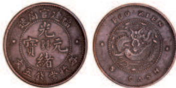
1677* China, Empire, Fukien Province, copper five cash (1901-03) (KM.Y#99). Good very fine.