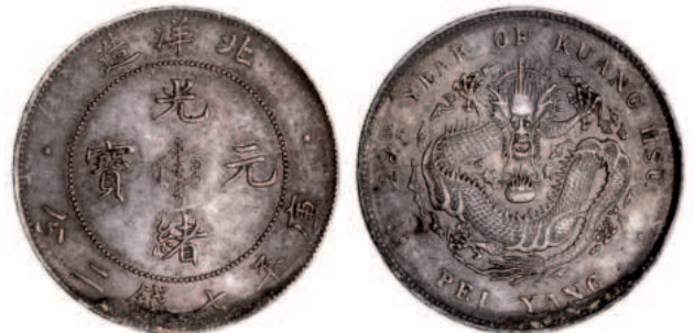
1673* China, Empire, Chihli province, silver dollar, Yr 29 (1903) (KM.Y#73.1). Dark grey matte tone, some mud adhesion, otherwise very fine.