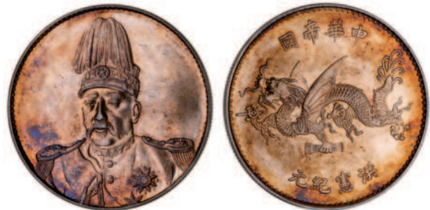
1695* China, Republic, Hung-hsien, silver dollar (1916) (KM. Y.332) (26.94g) full mint bloom, peripheral iridescent toning, probable restrrike. Choice uncirculated. $500