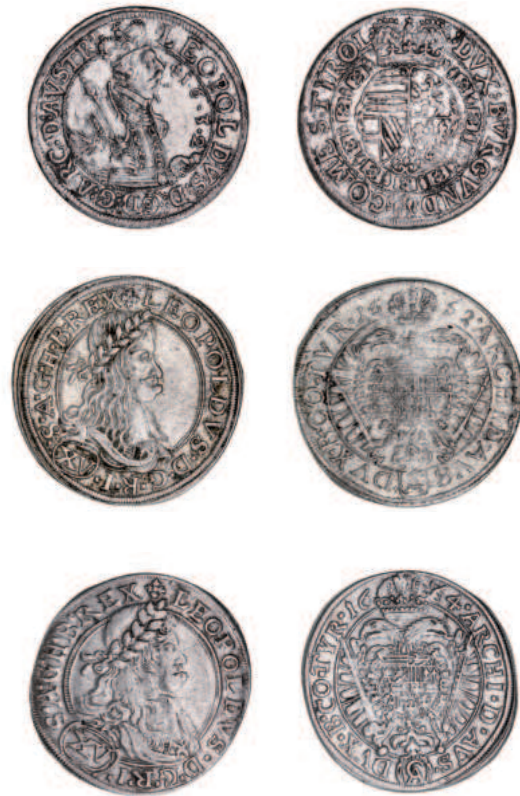
1578* Austria, Leopold, silver 10 kreuzer, 1632, Hall mint (KM.589.2); 15 kreuzer 1662, Vienna mint (KM.1198); 1664 Neuburg am Inn mint (KM.1220.2). Very fine - good very fine. (3)

From an old Austro-Hungarian Collection.