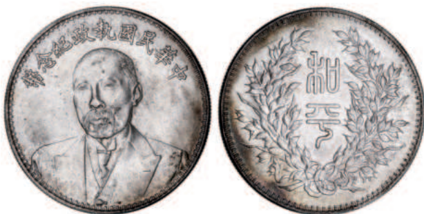
1709* China, Republic, President Tuan Chi-jui silver dollar (1924) (KM.683). Some peripheral toning, nearly uncirculated and rare.