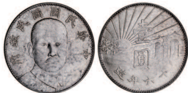
1713* China, Republic, Sun Yat-sen memorial or mausoleum silver dollar (1927). Shallow relief as struck light toning, uncirculated and rare.