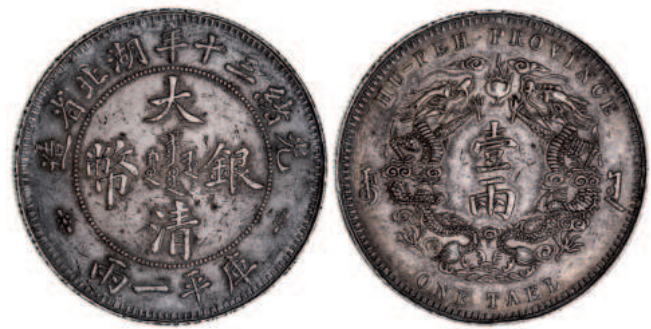
1679* China, Empire, Hupeh Province, bullion silver tael (1904) (37.23g) (KM.128.2). Rim nick, toned nearly extremely fine and rare thus.