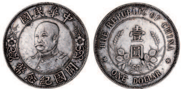
1689* China, Republic, Li Yuan-hung, silver dollar (1912) (KM.Y321). Good very fine.