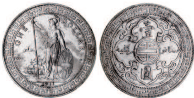
1636* British Trade Dollar, 1911B (KM.T.5). Cleaned of uneven toning, frosty original mint bloom, uncirculated.

In a slab by PCGS as Cleaned All Detail.