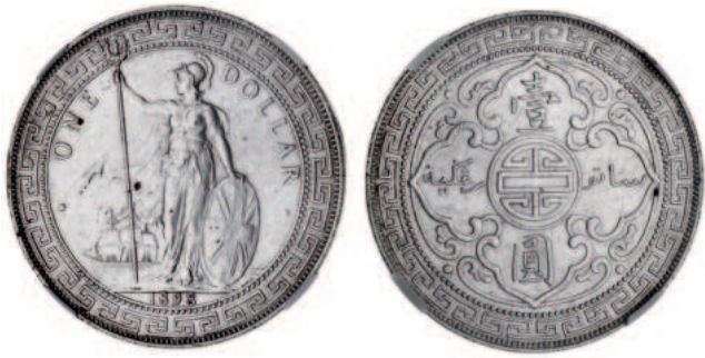
1633* British Trade Dollar, 1898B (KM.T.5). Has been wire brushed, otherwise good extremely fine.