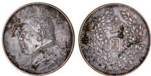
1701* China, Republic, Yuan Shih-kai, silver dollar, Yr 9 (1920) (KM.Y.329.6) (26.80g). Patchy tone, very fine. $80