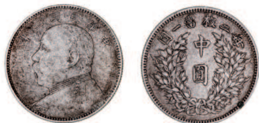
1690* China, Republic, Yuan Shi-kai, silver fifty cents (KM.Y.328). Very fine/good very fine.