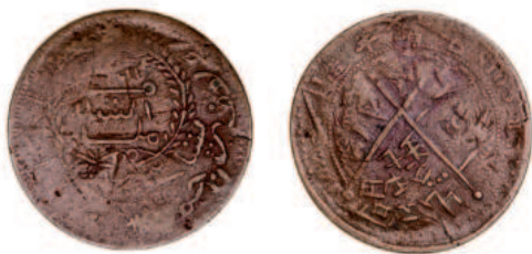
1686* China, Sinkiang Province, Uighuristan Republic, copper ten cash AH1352 (KM.YD38.2). Fine for this.