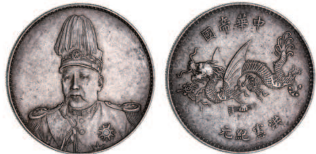
1697* China, Republic, Hung-hsien, silver dollar (1916) (KM. Y.332) (26.93g). Toned good very fine. $750