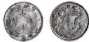
1687* China, Republic, silver ten cents (1911) (KM.Y.28). Good extremely fine.