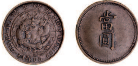
1676* China, Fengtien Province, token coinage, copper dollar (1904) (KM.Tn1). Very fine and rare.