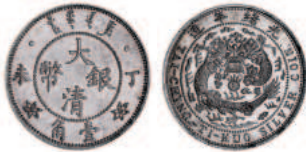
1668* China, Empire, silver ten cents (1907) (KM.215). Unmarked full mint bloom, uncirculated.