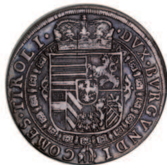
1577* Austria, Leopold, silver thaler 1632, Hall mint (KM.629.2) (Dav. 3338). Very fine.