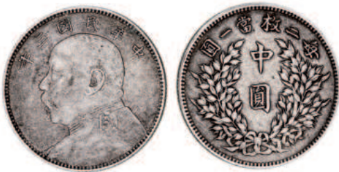
1692* China, Republic, Yuan Shih-kai, silver fifty cents, Yr. 3 (1914) (KM.Y#328). Toned very fine. $70