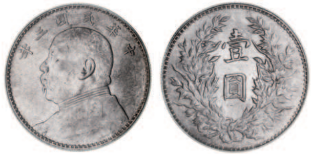
1694* China, Republic, Yuan Shi-kai silver dollar, Yr 3 (1914) (KM. Y.329). Considerable original mint bloom, uncirculated. $300