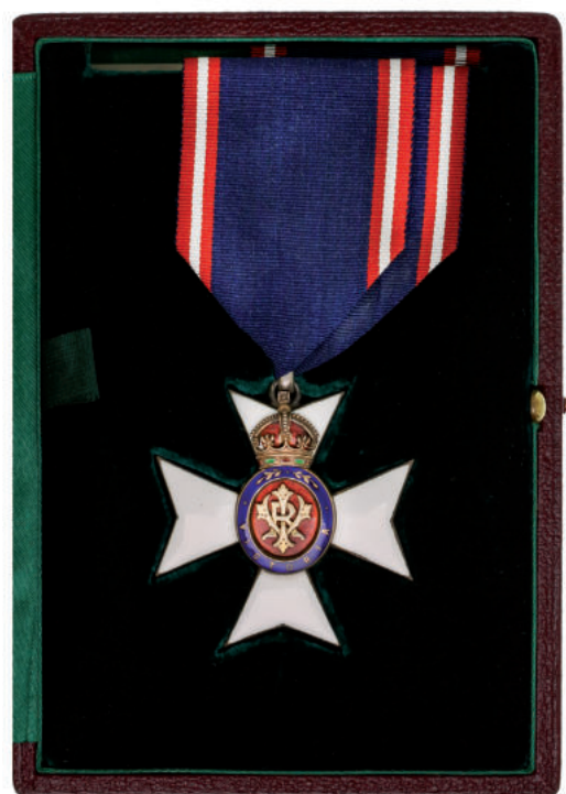
2875* The Royal Victorian Order, Commander (CVO), neck badge, reverse numbered 1636. In Collingwood (Jewellers) Ltd case of issue, metal toned, otherwise good extremely fine.