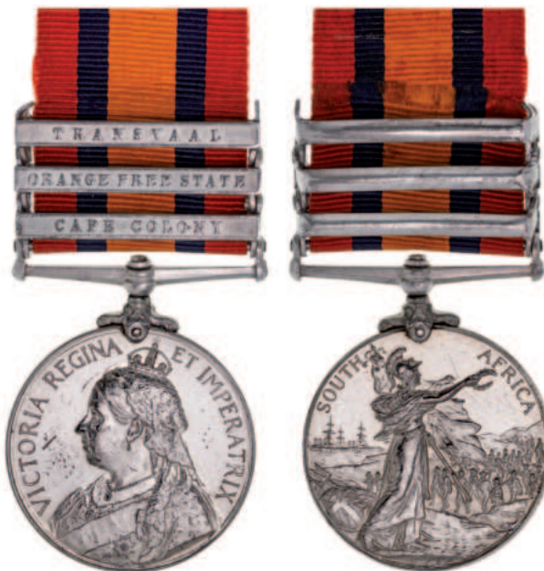
2957* Queen's South Africa Medal 1899 , (type 3 reverse), - three clasps - Cape Colony, Orange Free State, Transvaal. 3450 Tpr: H. T. (sic, should be F) Hadfield. N.S. Wales I.B. Impressed. Hairlines, otherwise good very fine.

Together with 2TIB (2 Tasmanian Imperial Bushmen) brass shoulder title; folding utensils set by Singleton & Priestman of Sheffield, includes fold-out knife, fork and spoon, metal cover inscribed on one side, 'J.H.H. 184. T.I.B.'; smoking pipe; walking stick with silver end piece and silver top band marked 'W.Golding/Stg.Silver' and inscribed, 'Presented to/Trooper J.H.Johnson/2nd T.I.B./Returned 15.6.02'; Boer War greeting cards with printed triple leaf-like inserts, one features emus on the centre leaf and the other features a wounded soldier, also various photos and documents relating to Johnson and his war service; a large family photo album, also includes some memorial cards for family members; various photos (over 70) relating to J.H.Johnson's son who served in WWII with RANR, noted a Leave Ticket for HMAS Huon 9-5-46 to 8-6-46, and an HMAS Cerberus Christmas Day 1940 Menu card.