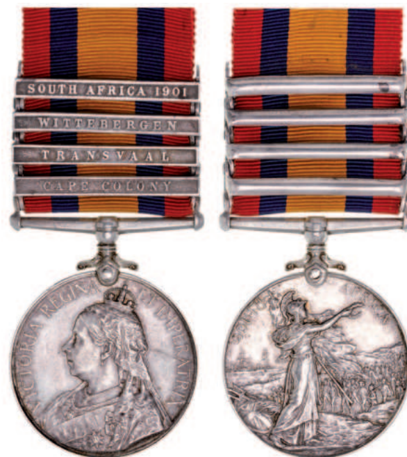
2958* Queen's South Africa Medal 1899 , (type 2 reverse with very faint ghost date), - four clasps - Cape Colony, Transvaal, Wittebergen, South Africa 1901. Tpr. G. A. Gross Brabants Horse. Impressed. A few very small scratches, otherwise toned very fine.

Henry Foster Hadfield confirmed as a Trooper with 3rd Contingent of NSW Imperial Bushmen.