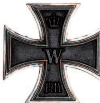
3066* Germany, Iron Cross, WWI, 1st Class, 1914, in silver. Good very fine.

The Star of the Grand Cross of the Iron Cross was only awarded twice, once in 1815 and again in 1918.