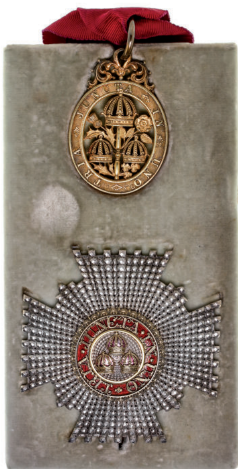
2873* The Most Honourable Order of the Bath, Knight Commander (KCB) (Civil) breast star in silver gilt and enamel, also neck badge (Civil) in gilt silver hallmarked for London 1898 by maker James Garrard. The neck badge toned, otherwise good very fine - extremely fine. (2)