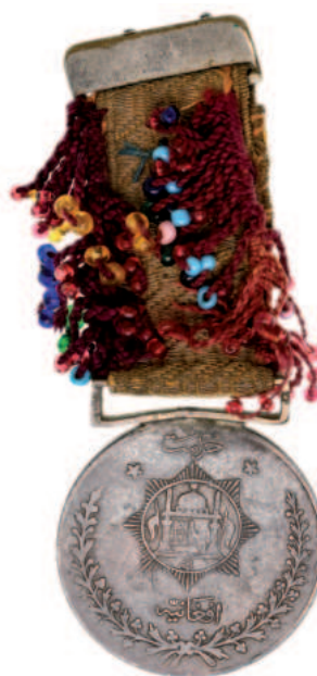
3064* Afghanistan, Amanullah Khan (AH1337-1346) 1919-1928, silver medal of merit, with woven gold jacquard ribbon with beaded attachments, with double stick-pin ribbon suspender. Fine.

With copy of Service File and other research.