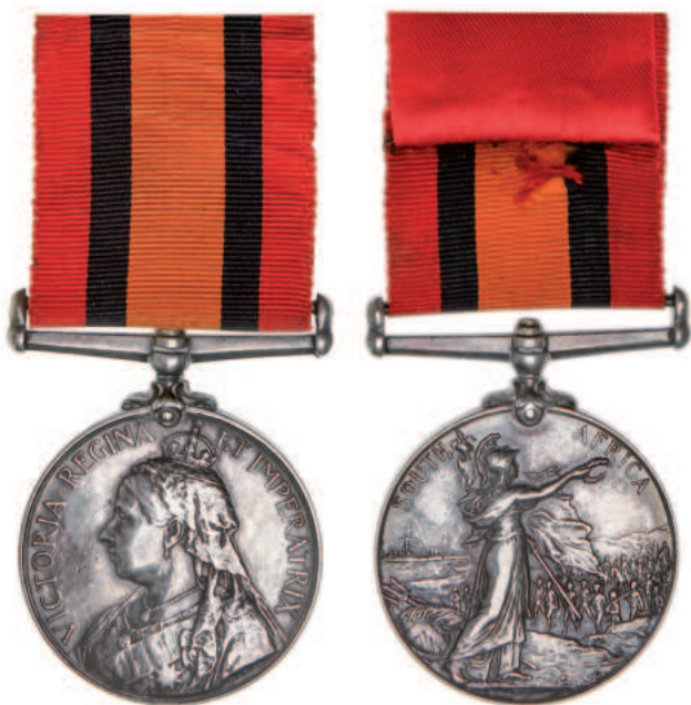
2962* Queen's South Africa Medal 1899 , (type 2 reverse with faint ghost dates). 437 Tpr. F.C.Westergaard. Victorian M.R. Impressed. Toned very fine. $500

Horace G.C. Campbell confirmed as a Trooper with 3 Battalion, Australian Commonwealth Horse.