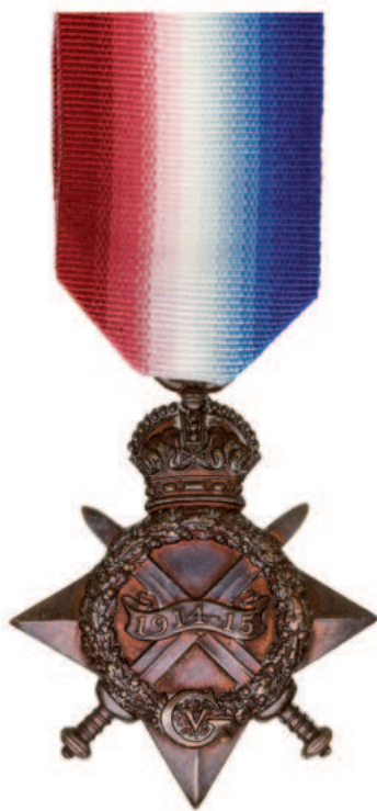
Lot 2924 part

2924* Trio to WIA at Gallipoli: 1914-15 Star; British War Medal 1914-18; Victory Medal 1914-19. 10099 Pte C.E.McManus Hamps:R. on all medals. Impressed. Very fine. $160