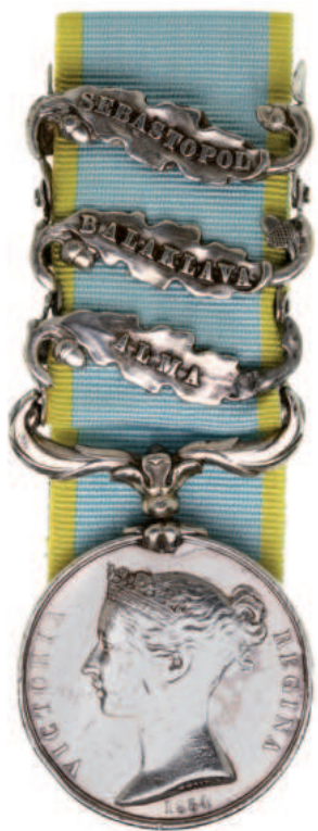
2880* Crimea Medal 1854-56, - three clasps - Alma, Balaklava, Sebastopol. ?? Geo James 1st Batn RI ? (some naming details worn). Engraved and possibly renamed. Display court mounted, heavy contact marks, otherwise fine.