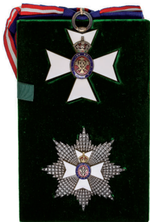
2874* The Royal Victorian Order, Knight's Grand Cross (GCVO), set of insignia comprising sash badge in silver gilt and enamel with sash ribbon, reverse numbered 687, and breast star in silver, silver gilt and enamel, reverse numbered 687. Some metal toned, otherwise extremely fine. (2)