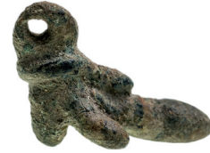
2989* Roman , (c.1st-3rd century AD), bronze phallus amulet, shaped as a standing shoe with multiple phallus protrusions, (37mm wide). Very fine and rare. $100

The third item from a New York private collection.