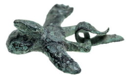
2991* Roman , (1st-3rd century AD), bronze phallic amulet, shaped as a full set with hand to left and penis to right, loop suspension, (35mm wide). Very fine and scarce. $100