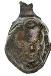
2998* Roman , (c.1st-2nd century A.D.), bronze attachment moulded as a bearded head, with stern features, (30mm high). Very fine and scarce.