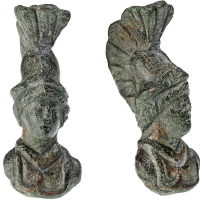
2996* Roman , (c.3rd century AD), bronze head, depicting the helmeted and plumed head of Minerva, finely worked as part of a larger vessel, (45mm high). Very fine and rare.