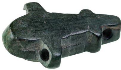
2986 Greek and Roman , (c.3rd century BC - 3rd century AD), bronze spearheads and arrowheads, various styles, (35mm - 115mm long). Toning and find inclusions, very fine. (14) $100

With certificate from Alex G. Malloy. Found in Northern Black Sea area.