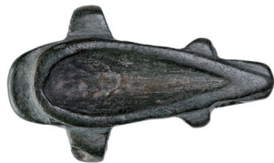
2987* Roman , (2nd century AD), bronze palm thimble, holed for suspension, (38mm long). Very fine and scarce. $100