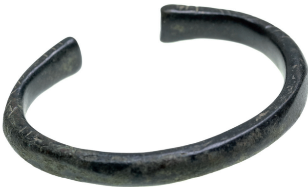
2997* Roman , (c1st-3rd century AD), bronze bracelet, with linear designs, (70mm wide). Attractive dark patina, very fine and wearable.