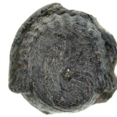
2999* Roman , (c.2nd century A.D.), deep green glass theatre mask medallion, moulded as a grotesque figure with furrowed brows and large open mouth, (30mm high). Very fine and rare.