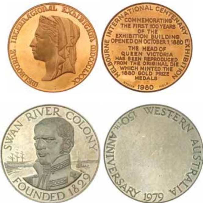
Lot 724 part