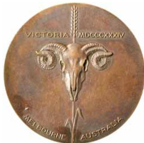
Lot 666 obverse