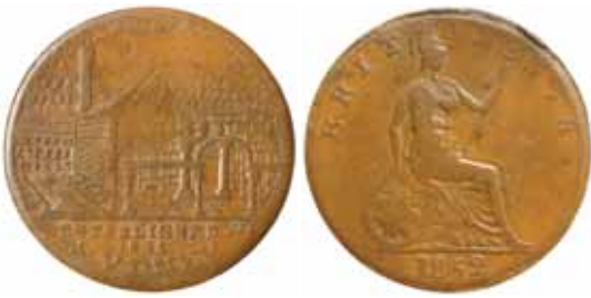
802* (Peek & Cambell) Tea Stores , Sydney penny, 1852 (A.426). Evenly worn brown patina, fine and rare.