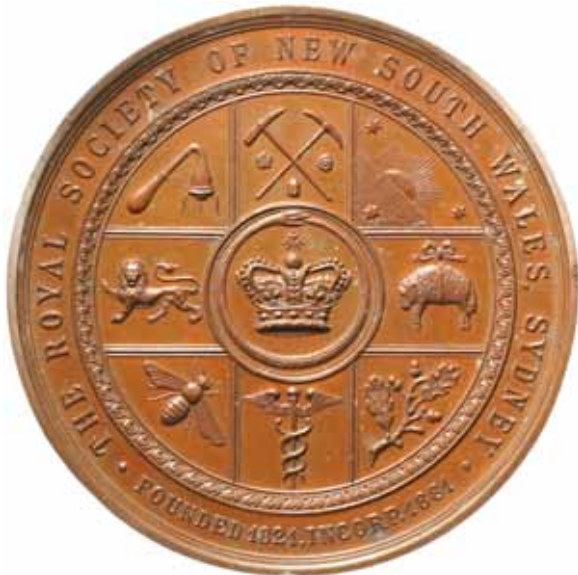
Lot 631 (obverse)