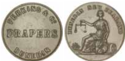
805* Perkins & Co. , Dunedin halfpenny, undated (A.436; L.337a this token). Dark grey brown patina, good very fine and rare.