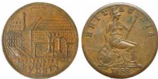
804* (Peek & Cambell) Tea Stores , Sydney penny, 1853 (A.431). An exceptionally well struck example of this date, the finest known, good very fine.