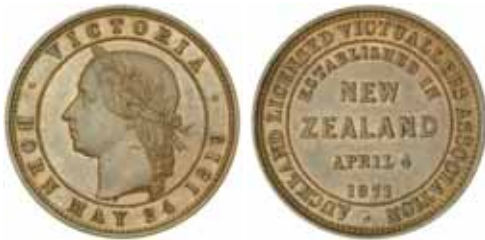
786* Auckland Licensed Victuallers Association, Auckland penny, 1871 (A.327; L.304b). Contact mark on neck otherwise brown and faded red, nearly uncirculated and rare in this condition.