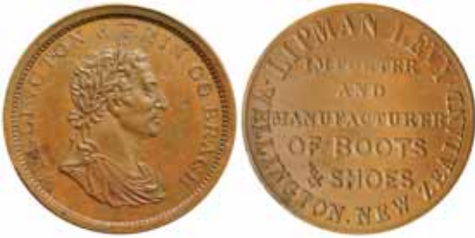
784* Levy, Lipman, Wellington, Wellington head mule penny, undated (A.323; L.328b). Glossy brown toning with traces of mint red, nearly uncirculated and rare.