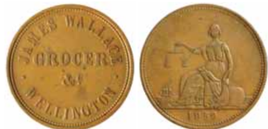
810* Wallace , James, Wellington penny, 1859 (A.592; L.345). Very fine.