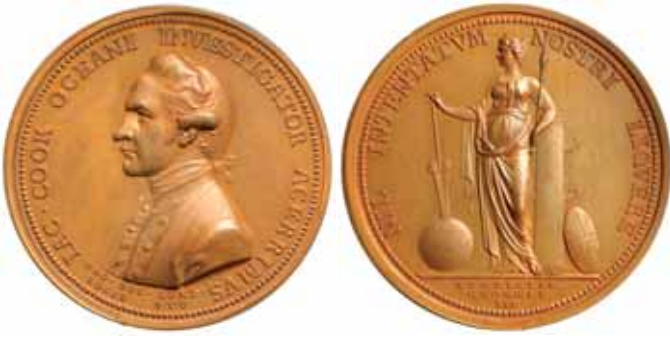
604* Captain James Cook , memorial medal (1784) in bronze (43mm) by L. Pingo for the Royal Society (M.H.374; BHM.258). Copper red patina, nearly uncirculated and rare in this condition, one of the finest known, 577 struck. $1,500