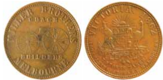
790* Miller Brothers, Melbourne penny, 1862 (A.371). Even brown patina, good very fine.