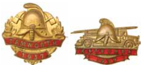
Lot 658 part