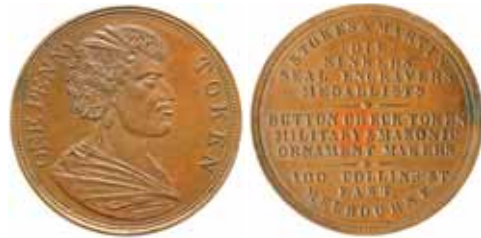
808* Stokes & Martin , Melbourne penny, undated (A.566). Traces of mint red, good extremely fine and very scarce.