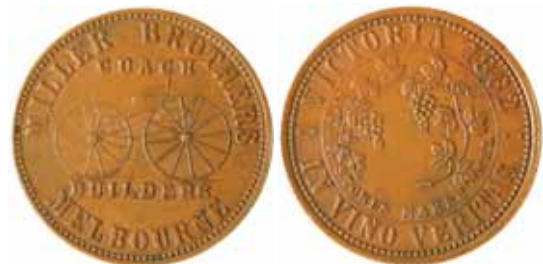
792* Miller Brothers, Melbourne penny, 1862 (A.373). Even brown patina, old scratch otherwise good very fine.

Ex R.V. Warren (lot 488 part) Collection.