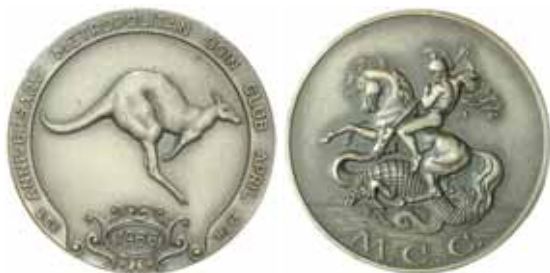
Lot 718 part