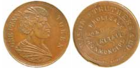
788* Mason Struthers & Co., Christchurch penny, undated (A.354; L.330). Good very fine.