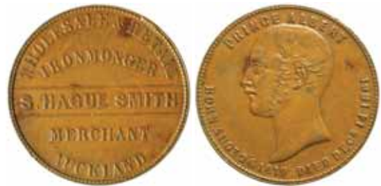
806* Smith , S. Hague, Auckland penny, undated (A.470). Light brown tone, nearly extremely fine.