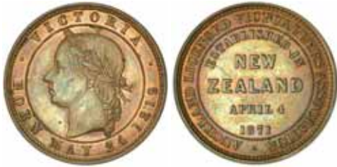
785* Auckland Licensed Victuallers Association, Auckland penny, 1871 (A.327; L.304b). Bluish brown and red, uncirculated and rare thus.