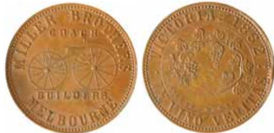
791* Miller Brothers, Melbourne penny, 1862 (A.372). Brown patina with hints of red, nearly uncirculated and rare thus.