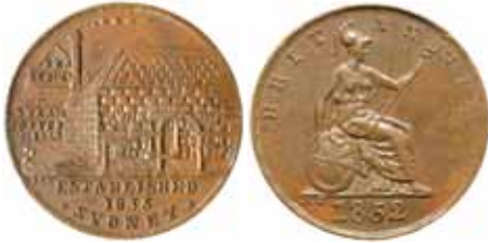
803* (Peek & Campbell) Tea Stores , Sydney halfpenny, 1852 (A.428). A well struck example with high rims, underlying mint bloom attractive brown patina, good extremely fine/ extremely fine and extremely rare in this condition, the finest known.