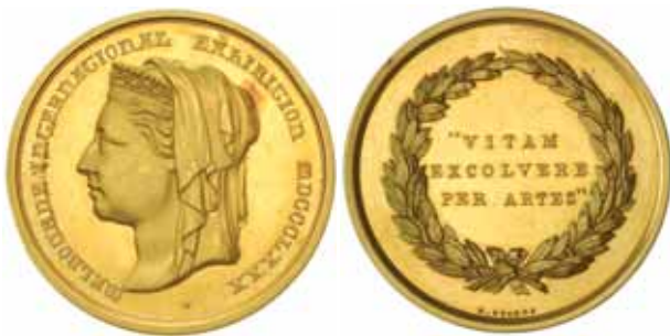
626* Melbourne International Exhibition, 1880 , in gold (51.3 gms, 39mm) by H.Stokes, impressed around edge 'Major H.Clementi - For Services'. Edge bruise and edge knock at 2 o'clock, otherwise good extremely fine.