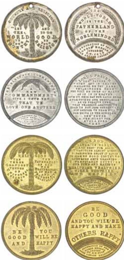
Lot 995 part