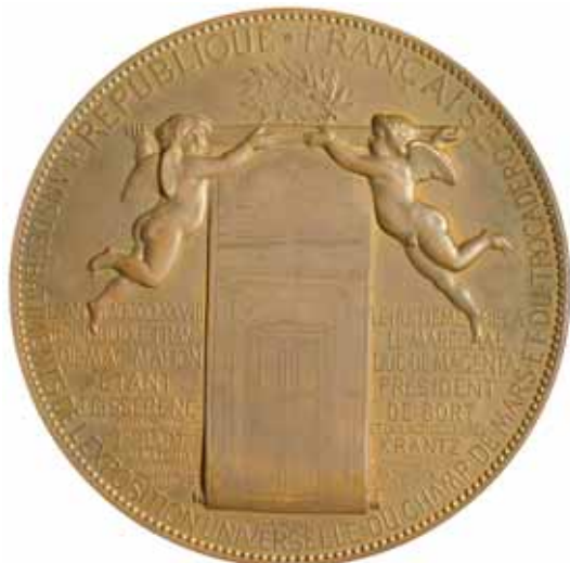
Lot 929 reduced