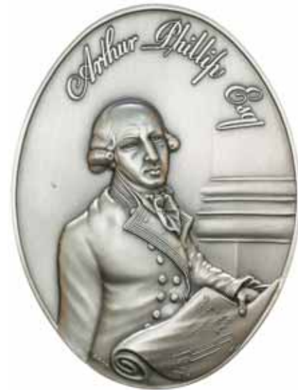
part (obverse only)