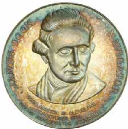
Lot 990 obverse