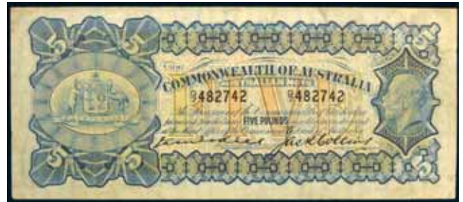
2964* Five pounds , Kell/Collins (1924) Q/7 482742 (R.38a). Good very fine and rare thus. $4,500