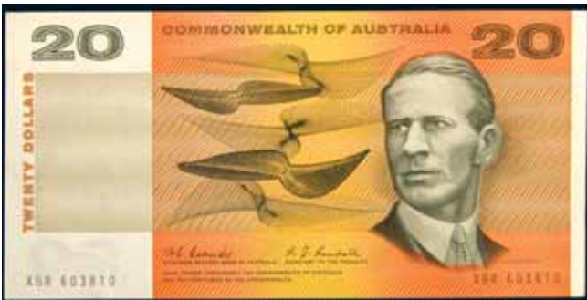
3150* Twenty dollars , Coombs/Randall (1967) XBR 603810 (R.402). Lower left corner fold otherwise crisp nearly extremely fine. $750