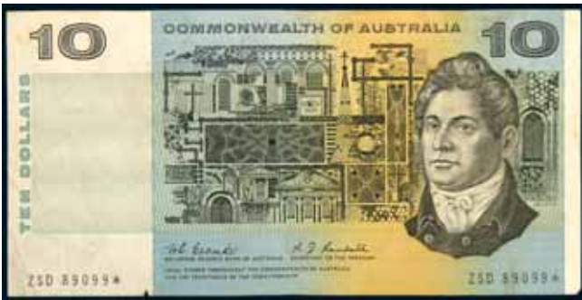
3069* Ten dollars , Coombs/Randall (1967) ZSD89099* (R.302s). Nick out of bottom edge otherwise fine and rare.