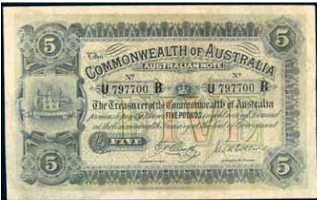
2963* Five pounds , Cerutti/Collins (1918) U 797700 B (R.37b). Four pin-holes, full note, good fine. $3,000