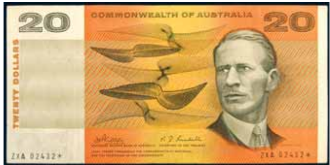
3074* Twenty dollars , Phillips/Randall (1968) ZXA 02432* (R.403s). Creases and folds, good fine and rare.