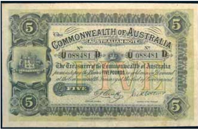
2961* Five pounds , Cerutti/Collins (1918) U 088481 D (R.37b). Trimmed, 3mm tear in top margin, otherwise good fine. $6,000