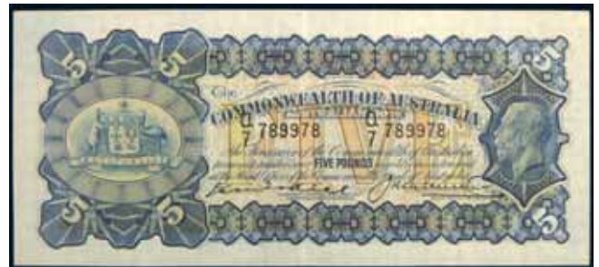
2965* Five pounds , Kell/Heathershaw (1927) U/7 789978 (R.39). Note Issue Dept. Heavy centrefold but crisp original paper nearly extremely fine and very rare in this condition. $15,000