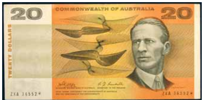
3075* Twenty dollars , Phillips/Randall (1968) ZXA 36552* (R.403s). Tear to right of top edge, flattened of centrefold otherwise fine and rare.