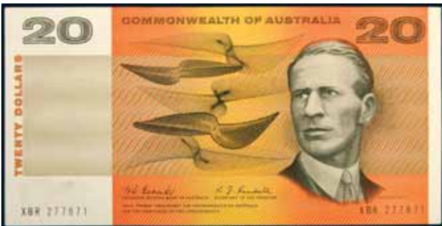
3149* Twenty dollars , Coombs/Randall (1967) XBR 277871 (R.402). Some light handling marks and central fold, extremely fine and rare in this condition. $750