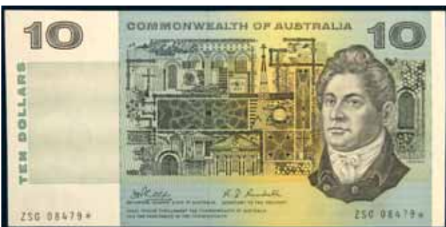
3071* Ten dollars , Phillips/Randall (1968) ZSG 08479* (R.303s). Flattened of vertical folds otherwise crisp nearly extremely fine.