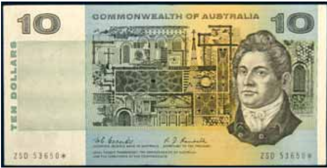
3068* Ten dollars , Coombs/Randall (1967) ZSD 53650* (R.302s). Many creases and folds, otherwise fine and rare.