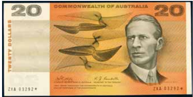
3073* Twenty dollars , Phillips/Randall (1968) ZXA 03292* (R.403s). Flattened of centrefold otherwise nearly extremely fine and rare.