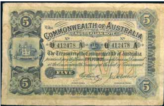
2962* Five pounds , Cerutti/Collins (1918) U 412478A (37b). Good body but many folds and creases otherwise fine and rare thus. $4,000