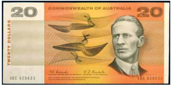
3151* Twenty dollars , Coombs/Randall (1967) XBS 020633 (R.402). Two vertical folds, crisp and extremely fine and rare thus. $500