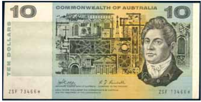
3072* Ten dollars , Phillips/Randall (1968) ZSF 73466* (R.303s). Crisp good very fine.