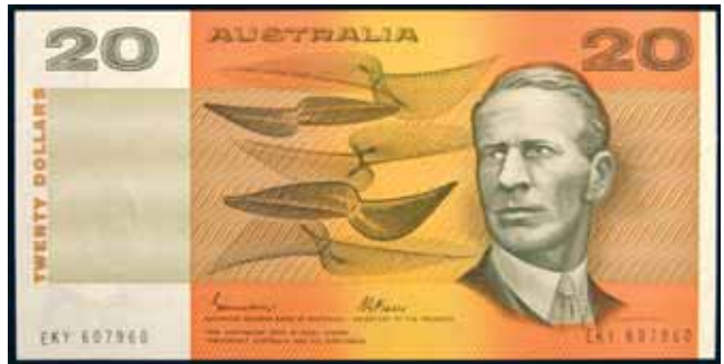
3154* Twenty dollars , Johnston/Fraser (1985) EKY 607960 (R.409b) gothic serials. Uncirculated and scarce. $500