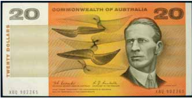
3147* Twenty dollars , Coombs/Randall (1967) XBQ 902265 (R.402). Good extremely fine. $1,000