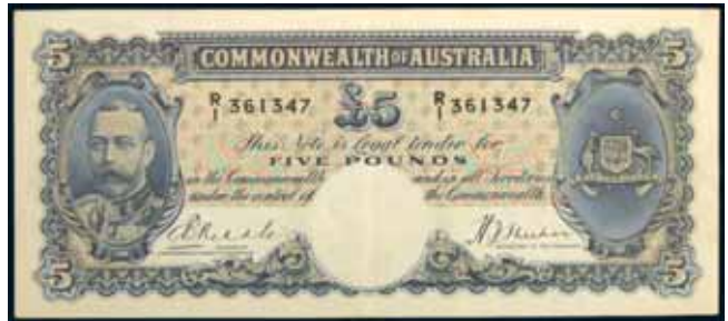
2973* Five pounds , Riddle/Sheehan (1933) R/1 361347 (R.44a). Good very fine. $1,500