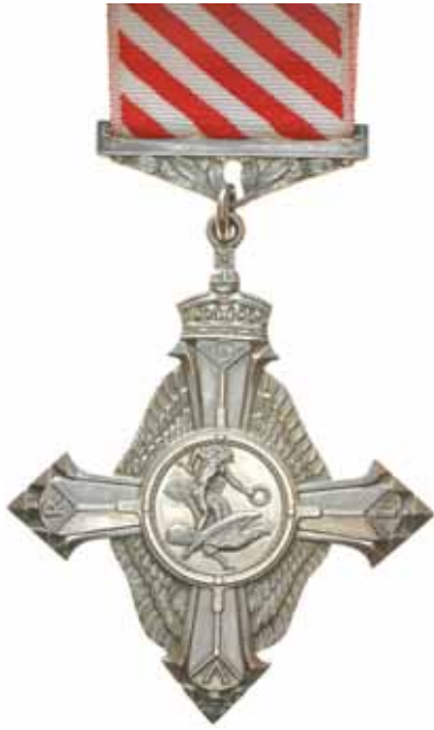
3889* Air Force Cross (GVIR). Unnamed. Extremely fine. $1,250