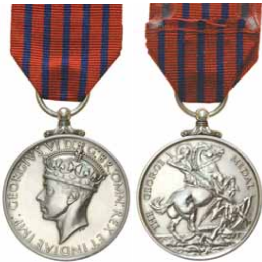
3890* George Medal (GVIR) 1st type. George Goshawk. Engraved. Nearly uncirculated. $3,500

George Goshawk. Ambulance Attendant Auxillary Ambulance Service. Action: Air Raid, Saving Life at Hyde Buildings, Rotherhithe Street, London, 7 September 1940. L.G.: 26Mar1941 p.1778 "During an air raid, Matthewman and Goshawk left with an ambulance to pick up casualties at premises where a big fire was raging. The road leading to the building was blocked by a sheet of flame. Without hesitation they drove the ambulance through and, with the help of a policeman, loaded the stretchers with casualties. The heat was so great that the stretchers were almost too hot to handle. After being warned by the policeman to get away before the building collapsed, which in fact it did just after they had left, they got their patients safely to hospital and reported back to their station for further duty. Both men displayed splendid courage and devotion to duty'. Together with photo of recipient. Bertram Matthewman - Ambulance Driver was awarded the George Medal for the same action.