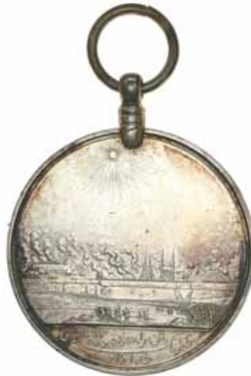
3892* Seringapatan Medal 1799, in silver (48mm). Good extremely fine. $1,500