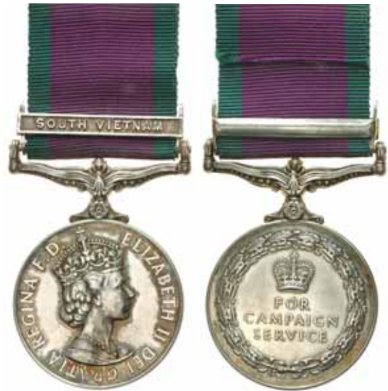
3926* Campaign Service Medal 1962 - bar - South Vietnam. Unnamed. Extremely fine.