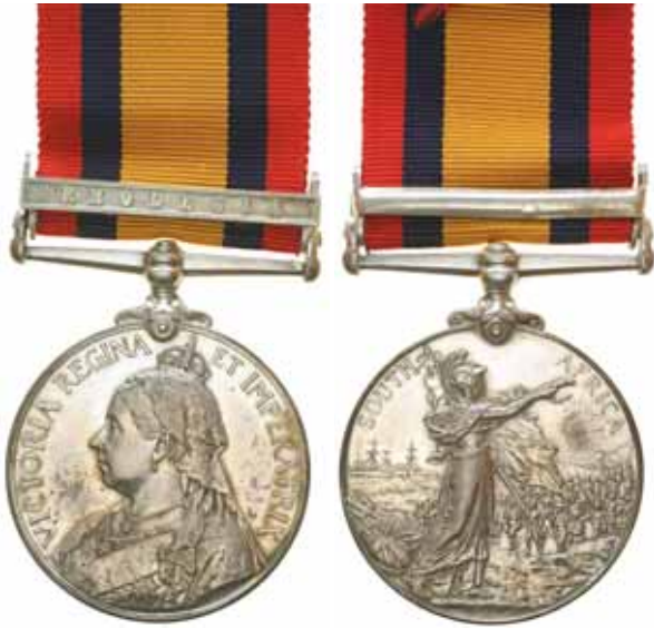
3186* Queen's South Africa Medal 1899 - bar - Rhodesia. 1005 Tpr A.Lovejoy B.S.A. Police. Impressed. Extremely fine. $500