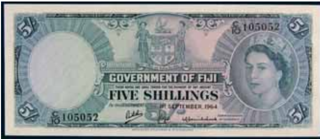
2596* Fiji , Elizabeth II, five shillings, 1st September 1964, C/10 105052 (P.51d). Uncirculated. $300