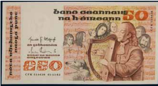
2673* Ireland (Eire) , Central Bank of Ireland, fifty pounds, 1982 issue (P.74a). Uncirculated.