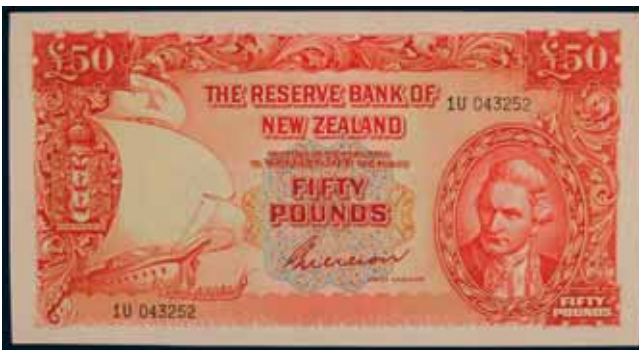
2715* New Zealand , Reserve Bank, G. Wilson 1955 - 6, fifty pounds, 1U 043252 (P. 162 b). Nearly uncirculated.