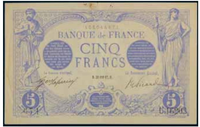
2601* France , five francs, 31.1.1917 (better date), (P.70). Good very fine, scarce. $150