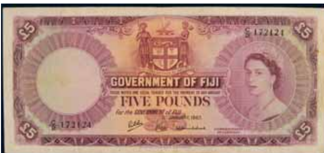
2599* Fiji , Elizabeth II, five pounds, 1st January, 1967, C/2 172 124 (P. 54 f). Good fine and scarce. $400