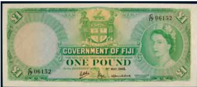
2598* Fiji , Elizabeth II, one pound, 1st May 1965 C/17 06152 (P. 53 g). Uncirculated. $600