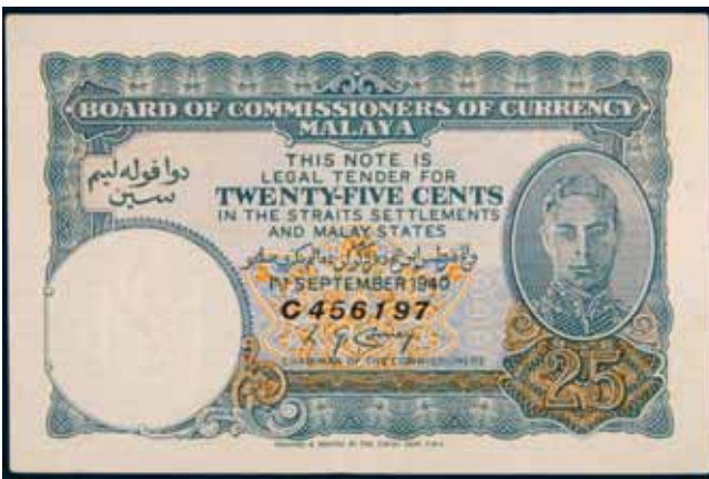
2676* Malaya , Board of Commissioners of Currency, twenty five cents, 1st September 1940 C456197 (P.3). Flattened extremely fine or better and scarce thus.