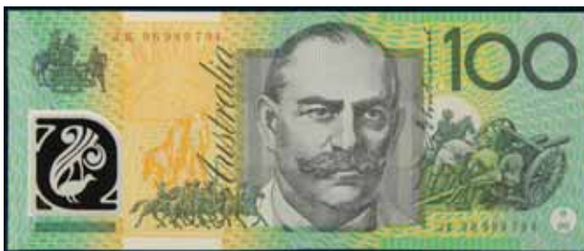
Lot 2839 part