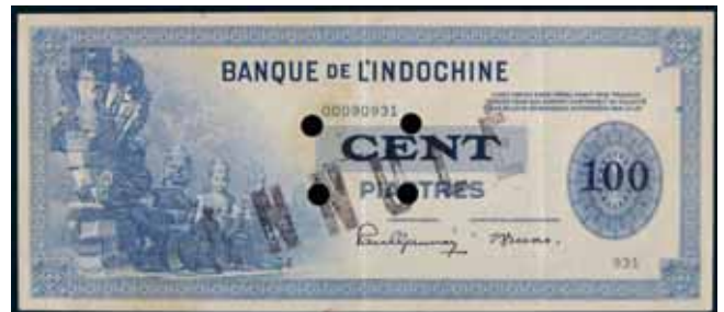
2603* French Indo China , Banque de L'Indochine, one hundred pastres nd. c.1945, specimen issue number 00090931, (P.71). With usual specimen holes (4) and with black diagonal countermark ANNULE, extremely fine and extremely rare. $600