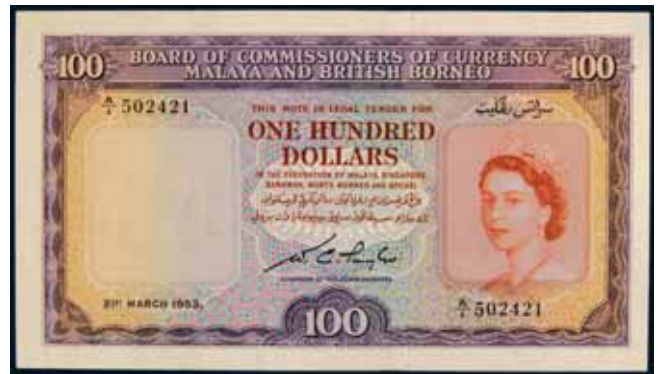
2679* Malaya and British Borneo , Board of Commissioners of Currency, one hundred dollars A/1 502421, 21st March 1953, (P.4). Nearly uncirculated and scarce.