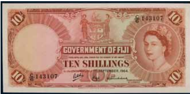
2597* Fiji , Elizabeth II, ten shillings, 1st September 1964, C/6 143107 (P.52d). Uncirculated. $600