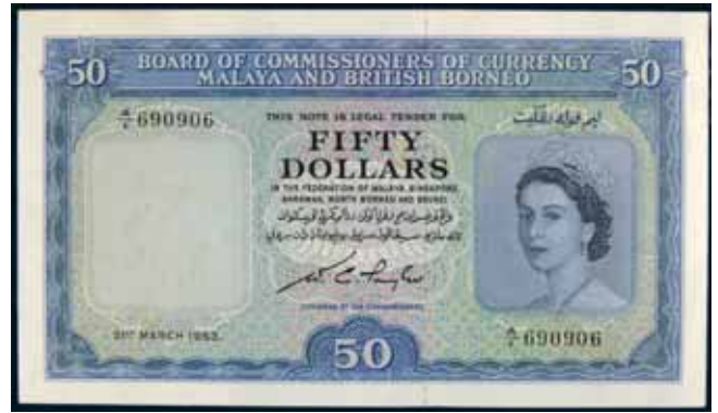
2678* Malaya and British Borneo , Board of Commissioners of Currency, fifty dollars A/1 690906, 21st March 1953, (P.4). Nearly uncirculated and scarce.