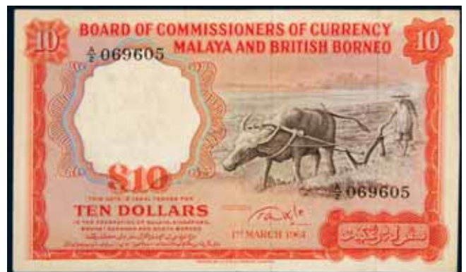
2680* Malaya and British Borneo , Board of Commissioners of Currency Malaya and British Borneo, ten dollars, 1st March 1961, A/2 069605 (P.9a). Good very fine.