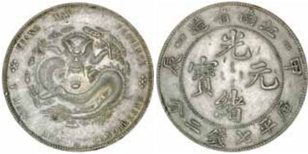
2405* China , Kiangnan Province, silver dollar 1904, HAH CH and without dots or rosettes on obverse, (KM.Y145a.12). Nearly extremely fine, scarce.