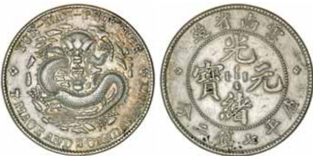
2408* China , Yunnan Province, silver dollar not dated, (1908), (KM.Y254). Nearly extremely fine, scarce.