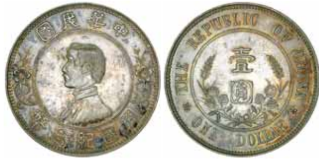
2409* China , Republic, dollar, ND (1912) (KM.Y.319). Some scuff marks in obverse field, toned, proof-like uncirculated.