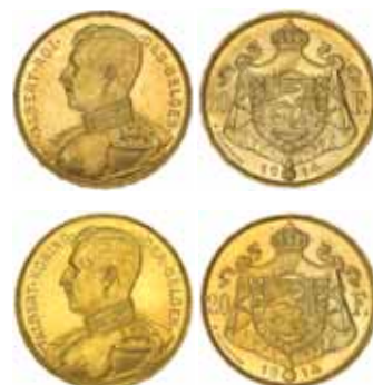
2172* Belgium , Albert I, twenty francs, 1914 (KM.78, 79) both position A. Nearly uncirculated. (2)