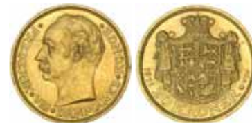
2190* Denmark , Frederick VIII, twenty kroner, 1911 (KM.810). Nearly uncirculated.