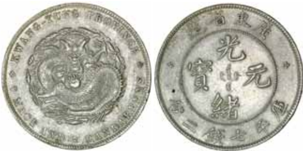
2407* China , Kwangtung Province, silver dollar ND c.(1890 - 1908) (KM.203). Extremely fine.