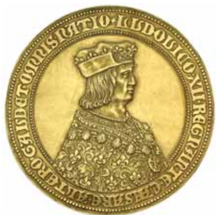
2165* Austria , Holy Roman Empire, Prague Mint, 17th century gold medal, obverse Louis XII of France, reverse Anne of Brittany (22.83g; 56.8mm). Cast and tooled as made, extremely fine and rare.