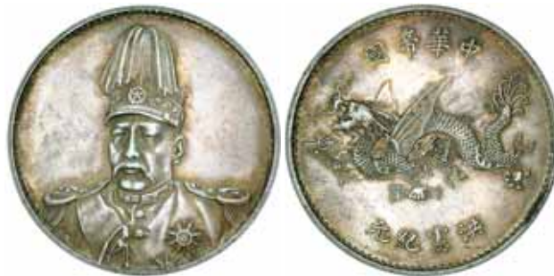
2411* China , Republic, General Issue, silver dollar, not dated (1916), obv. Yuan Shih-kai facing with plumed cap, and military uniform, rev. dragon to left, commemorating inauguration of Hung Hsien regime, (KM.Y.332 Kann 663). Golden blue patina, extremely fine or better and rare.