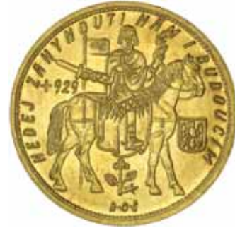
2188* Czechoslovakia , ten dukatu 1931, obv. Czech lion with Slovak shield, rev. Duke Wenceslas on horseback to right, (KM.14). Only 1239 struck, uncirculated and rare.