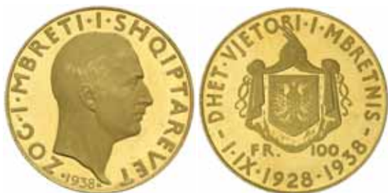
2164* Albania , Zog I, one hundred franga ari, 1938, (KM.26). Proof-like field, about as struck and FDC.