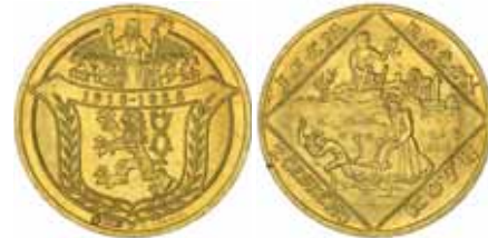
2189* Czechoslovakia , four dukaten, undated (1928), tenth anniversary of the Republic, 1918-1928, (Bruce X.M4). Uncirculated.