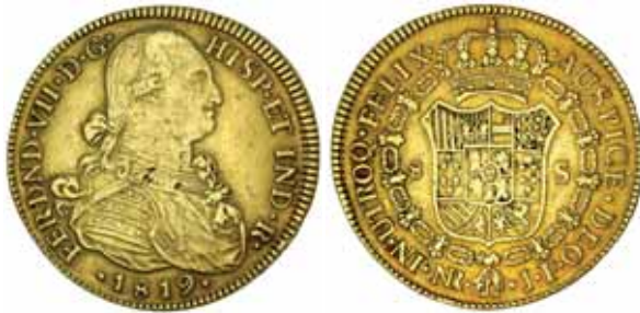
2185* Colombia , Ferdinand VII, eight escudos 1819 JF, NR (Nuevo Reino) with bust of Charles III (KM.66.1). Nearly very fine.