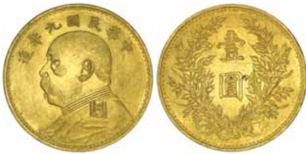
2184* China , Republic, general issue, gold dollar, obv. Yuan Shikai to left, dated year 9 (1920), (Kann 1562, KM.Pn-). Good extremely fine and extremely rare.