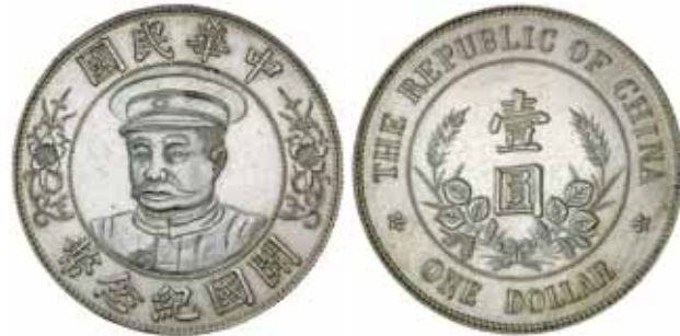
2410* China , Republic, General Issue, silver dollar, not dated (c.1912), obv. Li Yuan-Hung facing with military cap, and military uniform, rev. ONE DOLLAR, (KM. Y.320.1, Kann 638). Nearly uncirculated and scarce.