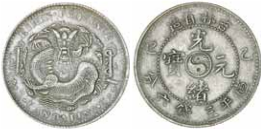
2406* China , Kirin Province, under Empire, fifty cents, undated, c.1898 (KM.Y.182.1). Very fine.