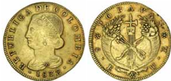
2186* Colombia , Republic, eight escudos 1832 U.R., Popayan (KM.82.2). Nearly very fine.