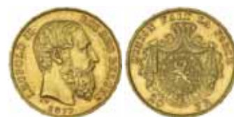
2171* Belgium , Leopold II, twenty francs, 1877 (KM.37). Extremely fine.