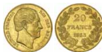
2168* Belgium , Leopold I, twenty francs, 1865 L. Wiener (KM.23). Extremely fine.