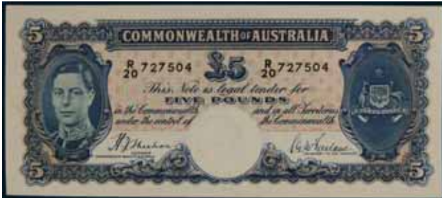
3534 Five pounds , Armitage/McFarlane (1941) to Coombs/Wilson (1960) (R.46-50). All flat extremely fine or better, the last nearly uncirculated. (5) $1,000