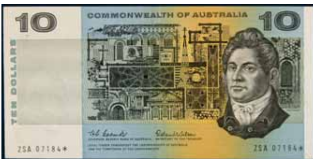
3608* Ten dollars , Coombs/Wilson (1966) ZSA 07184* (R.301s). Flattened of two vertical folds otherwise crisp original, nearly uncirculated. $3,500