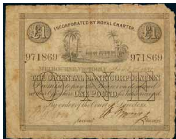
3424* Oriental Bank Corporation , one pound, Melbourne, Victoria, January 1st 1881, 971869 (MVR type 1c). Tiny pinholes, spots on back, edge fraying, limp paper, otherwise nearly fine and rare.