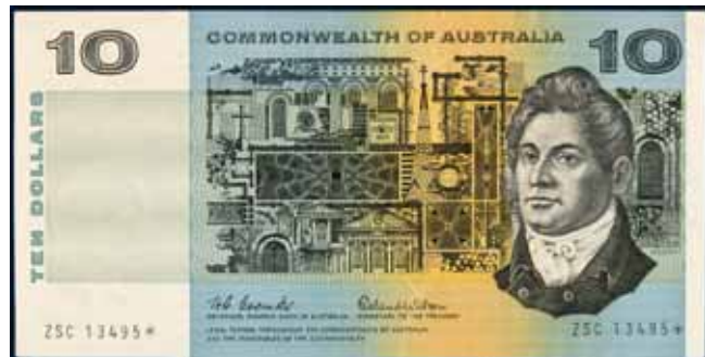
3611* Ten dollars , Coombs/Wilson (1966) ZSC 13495* (R.301s). Corner fold, minor creasing otherwise crisp extremely fine. $1,500