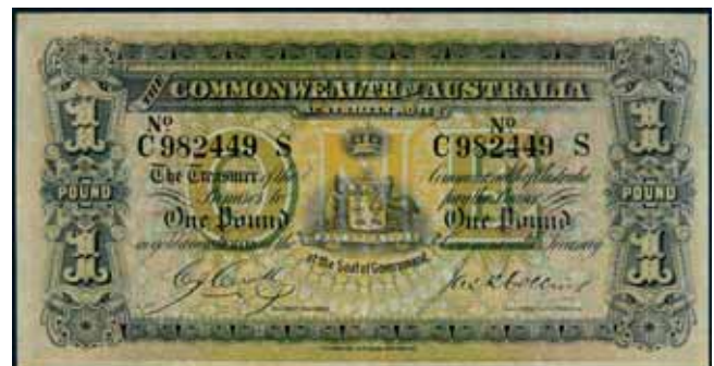
3480* One pound , Cerutti/Collins (1918) C 982449 S (R.21). Toned, nearly very fine.