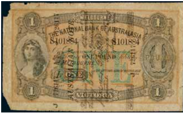
3474* One pound , Collins/Allen (1910) superscribed on National Bank of Australasia one pound Melbourne form, S101884, superscribe no. J 726117 (R.S50). Torn left corners otherwise very good and rare.