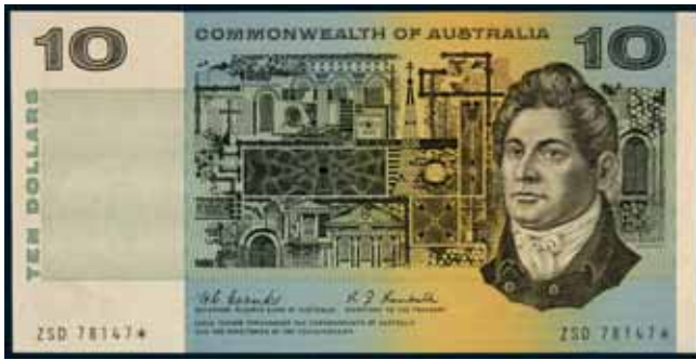
3613* Ten dollars , Coombs/Randall (1967) ZSD 78147* (R.302s). Virtually uncirculated and rare in this condition. $10,000