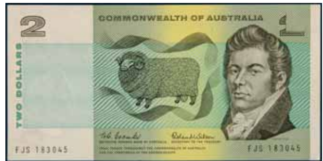
3618* Two dollars , Coombs/Wilson (1966) FJS 183045 (R.81), missing part denomination on front right hand side. Nearly uncirculated. $150