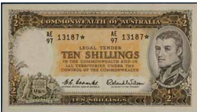
3579* Ten shillings , Coombs/Wilson (1961) AE/97 13187* (R.17s). Three vertical folds, otherwise nearly extremely fine. $4,000