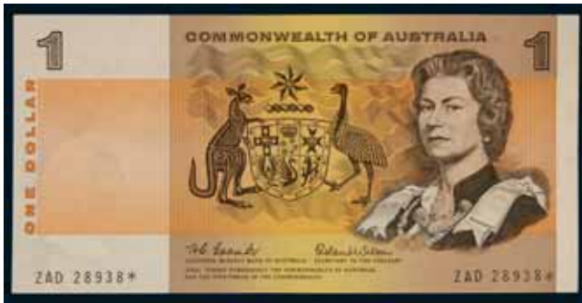
3597* One dollar , Coombs/Wilson (1966) ZAD 28938* (R.71s). Teller's cornerfold, otherwise crisp nearly uncirculated. $1,700