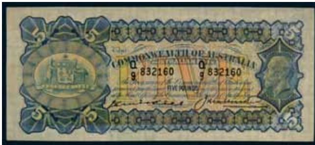
3520* Five pounds , Kell/Heathershaw (1927) Q/9 832160 (R.39). Small stain on back of top edge otherwise good fine. $3,500