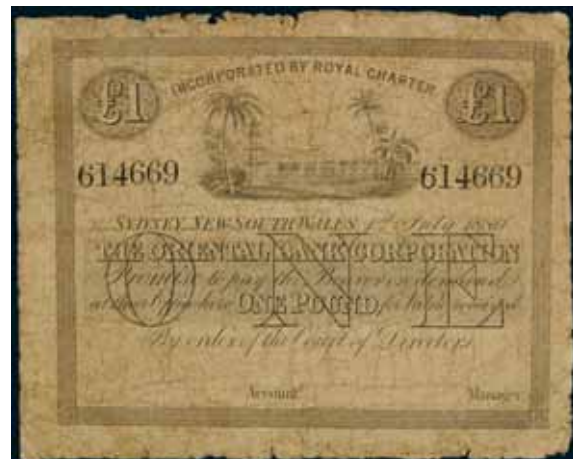
3423* Oriental Bank Corporation , one pound, Sydney, New South Wales, 1st July 1880, 614669 (MVR type 1c). Frail edges, limp nearly very good and rare.