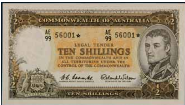
3578* Ten shillings , Coombs/Wilson (1961) AE/99 56001* (R.17s). Flat, crisp, choice uncirculated and very rare in this condition, one of the finest known. $22,000