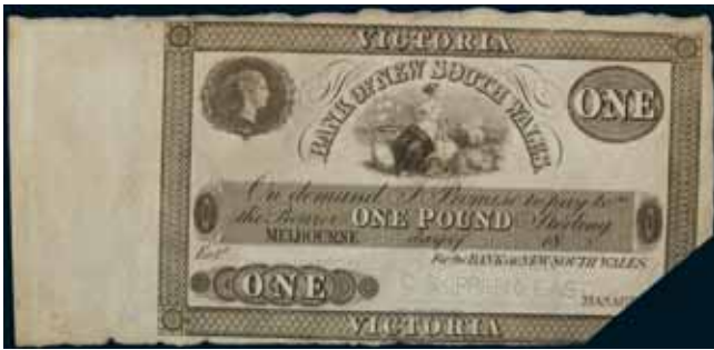
3419* Bank of New South Wales , specimen one pound, Melbourne 18- (MVR type 7e) perforated specimen C Skipper & East, lower right corner cut cancelled, wide left margin. Extremely fine and rare.