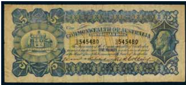
3519* Five pounds , Kell/Collins (1924) Q/2 545480 (R.38a). Very good. $700