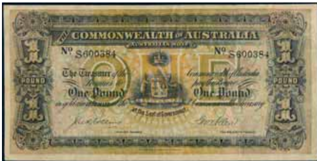
3475* One pound , Collins/Allen (1913) small serials, No. S600384 (R.18b). Good fine and very rare in this condition, one of the finest known.