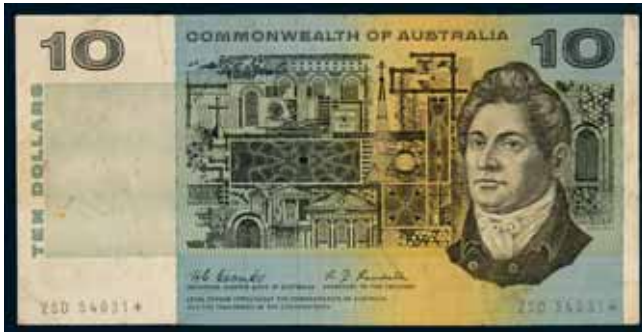
3614* Ten dollars , Coombs/Randall (1967) ZSD 54031* (R.302s). "90" written on back, slightly soiled, otherwise fine. $600