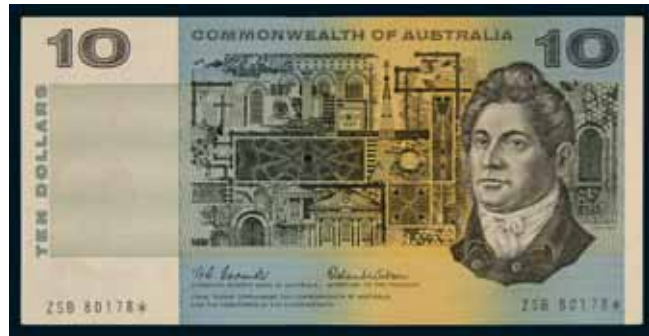
3609* Ten dollars , Coombs/Wilson (1966) ZSB 80178* (R.301s). Hint of a light centre fold, virtually uncirculated. $2,000