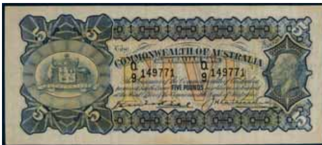
3521* Five pounds , Kell/Heathershaw (1927) Q/9 149771 (R.40). Flattened and cleaned, good fine. $2,000