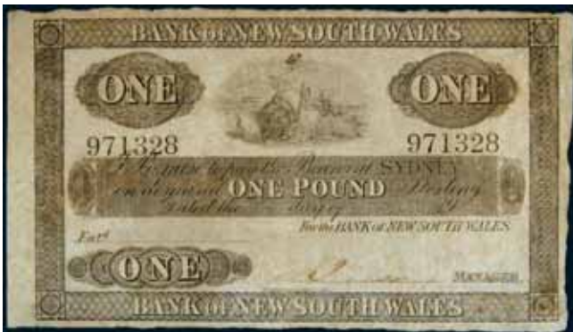
3420* Bank of New South Wales , one pound, Sydney, 5 April 1904, 971328 (MVR type 7f). Flattened full note, nearly fine and rare.