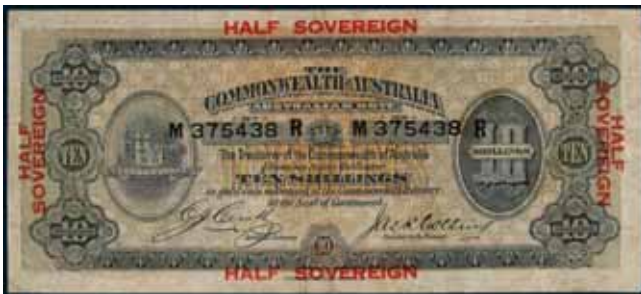
3436* Ten shillings , Cerutti/Collins (1918) M 375438 R (R.3b). Limp paper, two minute pin-holes otherwise good colour nearly fine.