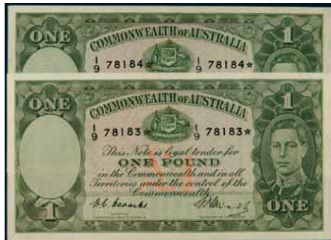
3582* One pound , Coombs/Watt (1949) I/9 78183/4* (R.31s) consecutive pair of star replacement notes. Flattened of vertical folds otherwise extremely fine and extremely rare as such. (2) $50,000