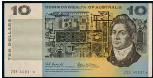
3610* Ten dollars , Coombs/Wilson (1966) ZSB 40081* (R.301s). Minor creases and folds, crisp good extremely fine. $1,700