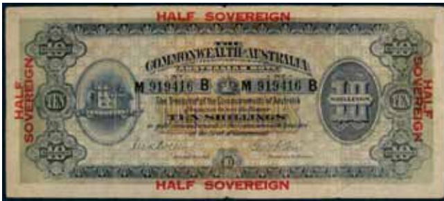
3435* Ten shillings , Collins/Allen (1915) M 919416 B (R.2e). Nicks top and bottom edge where centrefold ends, quarter folds otherwise nearly fine.