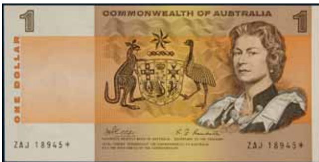
3600* One dollar , Phillips/Randall (1969) ZAJ 18945* (R.73s). Virtually uncirculated. $3,200