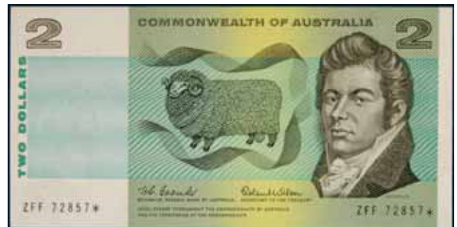
3603* Two dollars , Coombs/Wilson (1966) ZFF 72857* (R.81s). Virtually uncirculated. $3,750