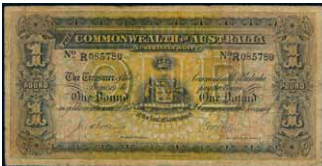
3476* One pound , Collins/Allen (1913) No. R085789 (R.18b). Very limp paper from multiple creasing, however a full note, good and rare.