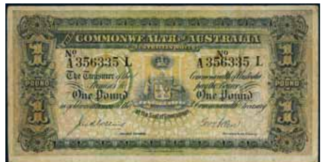
3479* One pound , Collins/Allen (1913) A 356335 L (R.18e). Limp body but full note, very good.