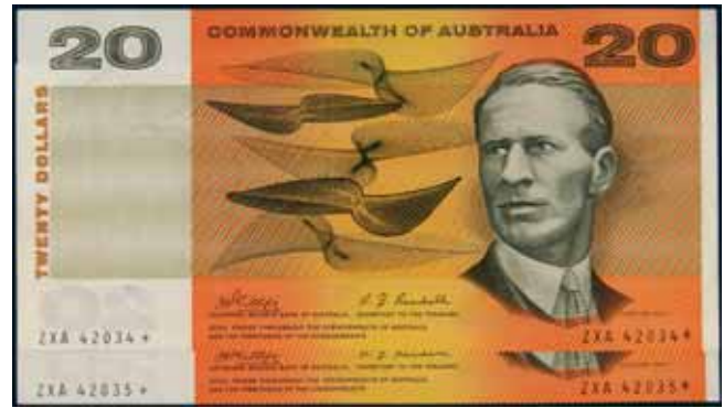
3616* Twenty dollars , Phillips/Randall (1968) ZXA 42034/5* (R.403s) consecutive pair of star replacement notes. Flattened of centrefold, crisp originals, nearly uncirculated and very rare as such. (2) $30,000