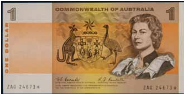
3599* One dollar , Coombs/Randall (1968) ZAG 24673* (R.72s). Uncirculated and rare in this condition. $8,500