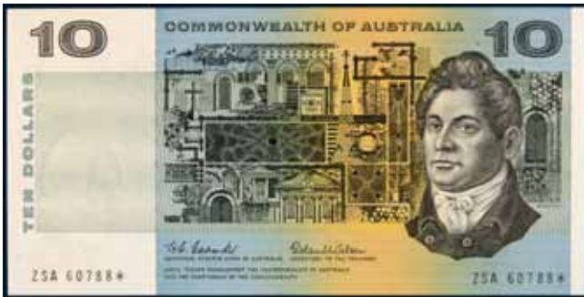
3607* Ten dollars , Coombs/Wilson (1966) ZSA 60788* (R.301s). Crisp, original, virtually uncirculated. $4,500