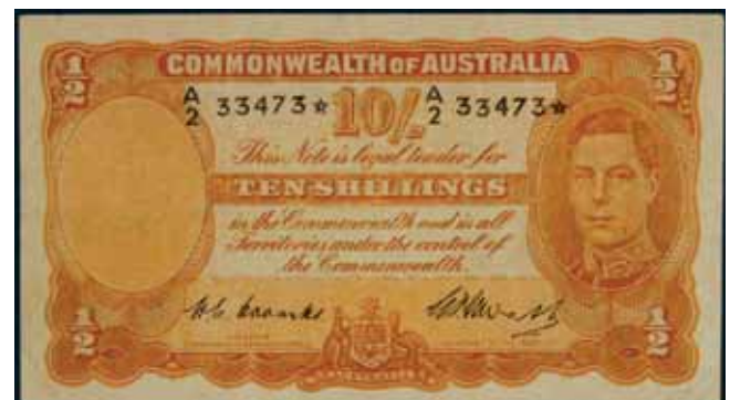
3576* Ten shillings , Coombs/Watt (1949) A/2 33473* (R.14s). Has been flattened otherwise nearly fine and rare.