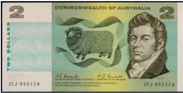
3605* Two dollars , Coombs/Randall (1968) ZFJ 89633* (R.82s). Crisp, flat uncirculated and rare thus. $7,500