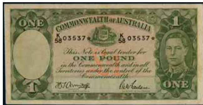
3581* One pound , Armitage/McFarlane (1942) K/58 03537* (R.30bs). 2mm tear at top edge otherwise flattened fine or better and very rare. $8,500