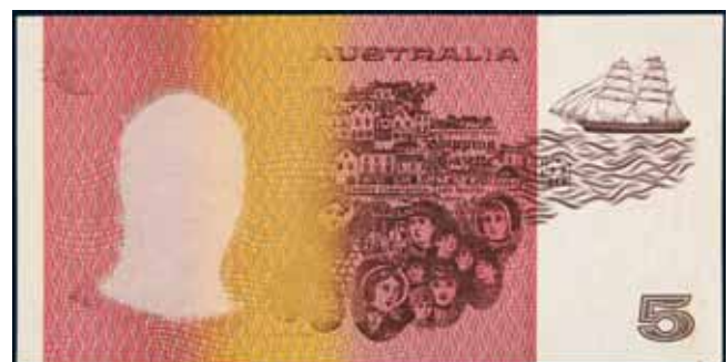
3619* Five dollars , Fraser/Higgins (1990) QFU 050433 (R.212) intaglio ink fade out of left back causing ghost portrait. Extremely fine. $500