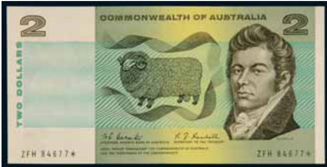
3606* Two dollars , Coombs/Randall (1968) ZFH 84677* (R.82s). Diagonal crease or impression top right of centre, otherwise crisp virtually uncirculated and rare in this condition. $4,000