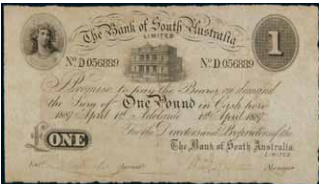
3421* The Bank of South Australia , one pound, Adelaide, 1st April 1887, NoD056889 (MVR type 3b(ii)). A clear full note with considerable creasing flattened out, good fine and very rare.