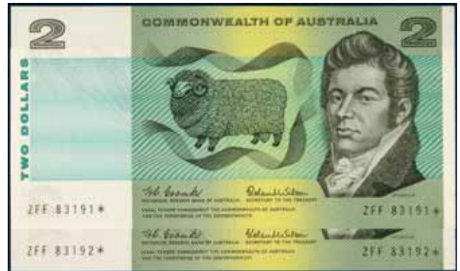
3601* Two dollars , Coombs/Wilson (1966) ZFF 83191/2* (R.81s) consecutive pair of star replacement notes. Crisp, virtually uncirculated. (2) $6,000