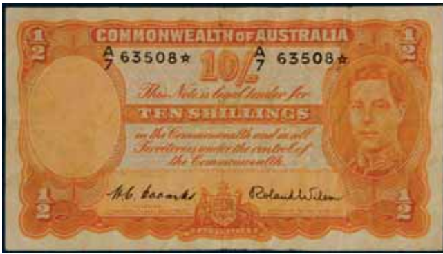
3577* Ten shillings , Coombs/Wilson (1952) A/7 63508* (R.15s). Many folds and creases, original body, very good and rare. $1,250