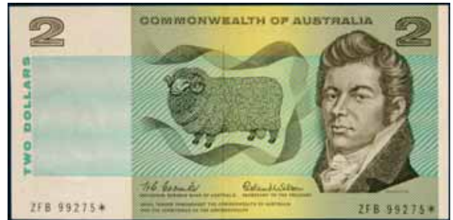
3602* Two dollars , Coombs/Wilson (1966) ZFB 99275* (R.81s). Virtually uncirculated. $3,750