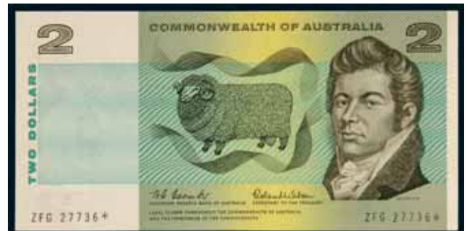
3604* Two dollars , Coombs/Wilson (1966) ZFG 27736* (R.81s). Uncirculated. $2,500