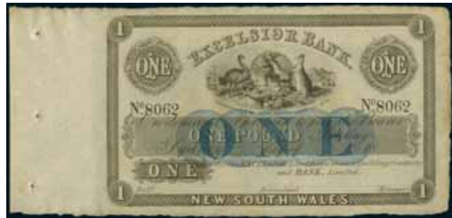
3422* Excelsior Bank , one pound, Sydney 18- (C.1884) No. 8062 (MVR type 1), unused note form ready to be issued. In display folder, nearly uncirculated and rare.