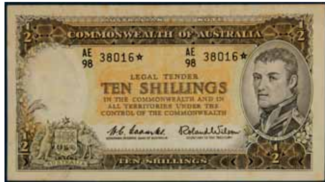
3580* Ten shillings , Coombs/Wilson (1961) AE/98 38016* (R.17s). Crisp body, very fine but with rust moisture spots throughout top margin. $750