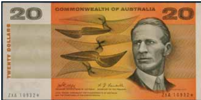
3615* Twenty dollars , Phillips/Randall (1968) ZXA 10932* (R.403s). Nearly uncirculated and rare, especially in this condition. $15,000