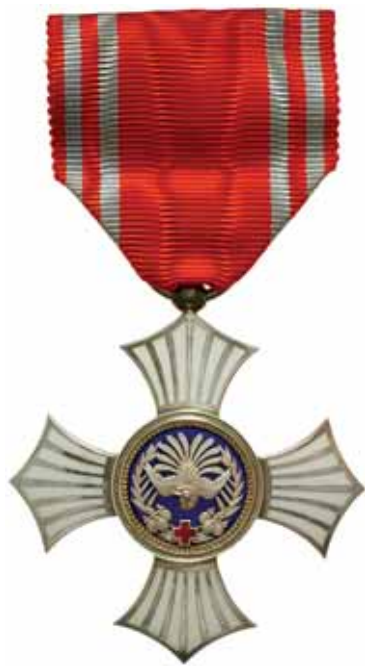
4458* Japan , Red Cross Society Silver Order of Merit Decoration, with lapel rosette in form of a cross. In case of issue, uncirculated.