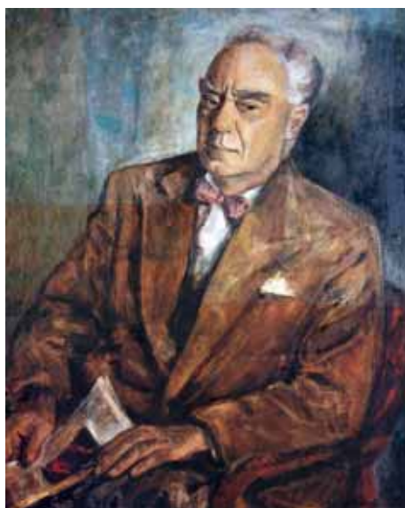
Archibald Prize entry Lot 4437 part