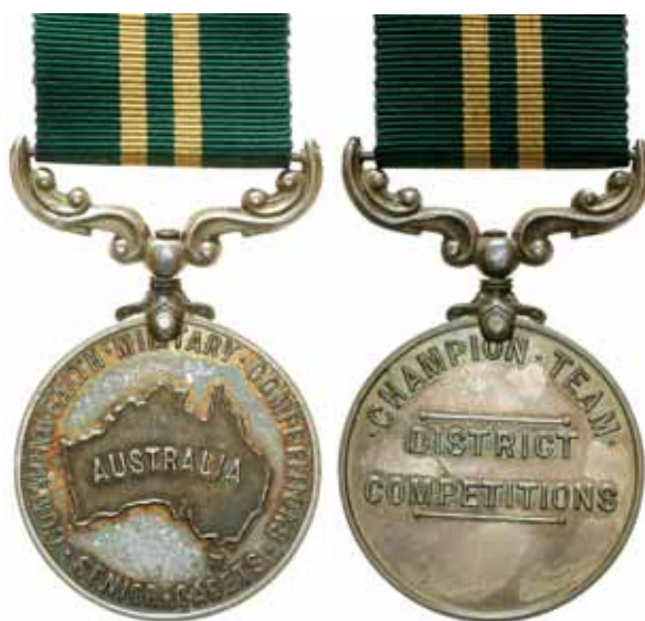
4392* Australian Senior Cadet Competition Medal , District Competitions, undated. Unnamed. Very fine.