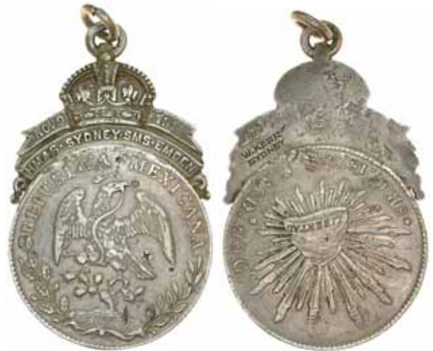
4393* HMAS Sydney , SMS Emden, Nov 9 1914, commemorative medal, Mexican dollar surmounted by crowned scroll by W.Kerr, Sydney. Some minor damage to top of coin and scroll, otherwise nearly very fine.