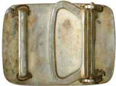
4531* Japan , silver belt buckle, dragon design, 1939. In timber case of issue, extremely fine.