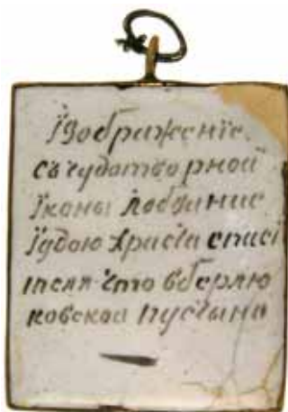
Lot 4635 part