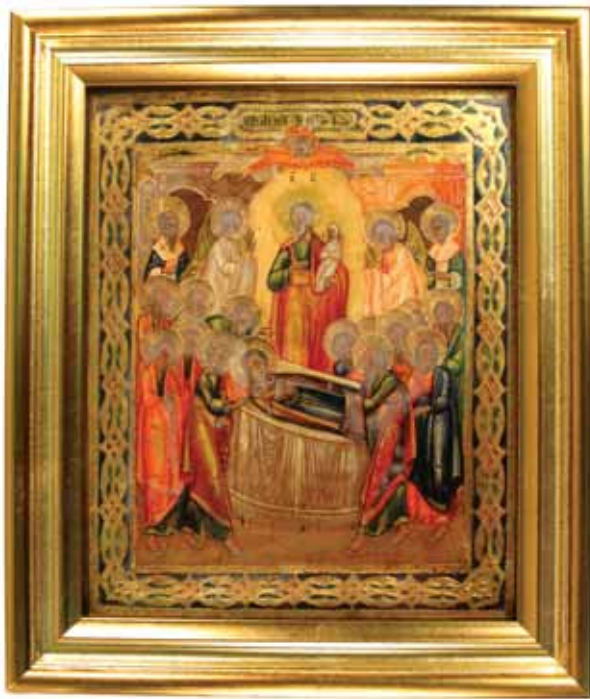
4661* Russia , late 19th century icon, traditionally painted, depicting the death of Mary, with elaborate gilt border, in a later gilt frame, (22cm x 18cm).