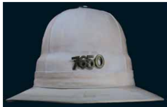
4540* Victoria Police , white pith helmet with number 7650, 7 in brass and 650 in white metal, all joined, inside branded in ink, 'Made / by / W.M.Rubble / Standard Helmet'. Very fine and scarce.