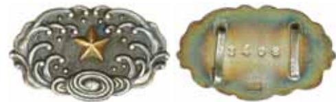
4461* Japan , Kimono Berp stopper for ladies' badges, WWII, number 3408 impressed on reverse and Japanese hallmark, silver. In case with neat hole in back, extremely fine and rare.