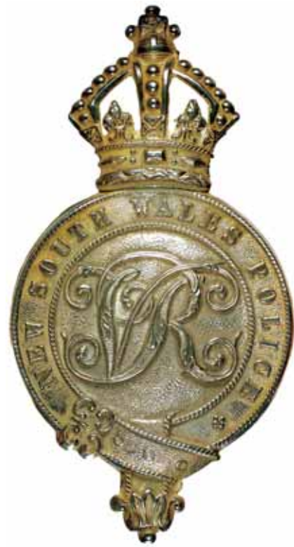
4536* New South Wales Police , helmet plate (Officer) (VR) crown, pre 1901, in silver (102mm x 53mm). Extremely fine and rare.