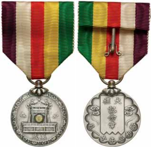
4452* Japan , Showa Enthronement Commemorative Medal, 1928, in silver and gilt. In case of issue, nearly uncirculated. $100