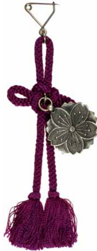
4456* Japan , Killed in Combat Medal for parents of deceased. In timber case of issue, this has some borer damage, medal uncirculated. $100

The priests at Yasukani, the national shrine to the war dead, gave this medal to parents who visited the shrine to pray for the souls of their fallen sons.