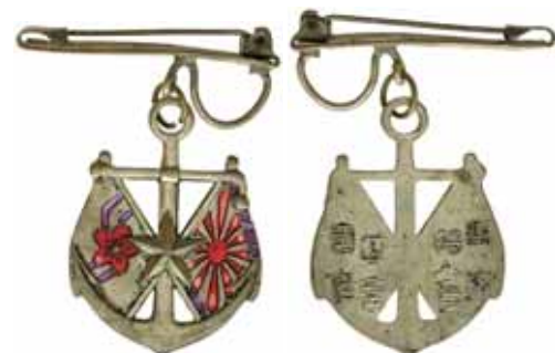
4462* Japan , Imperial Navy Ladies Society, WWII, member's badge in silver and enamel. In case of issue, good very fine and rare.