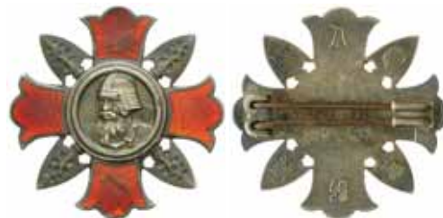
4457* Japan , Military Wound Badge, Ko'Sho, in silver and enamel, WWII. In case of issue, some crazing to enamel, very fine and scarce. $160

The priests at Yasukani, the national shrine to the war dead, gave this medal to parents who visited the shrine to pray for the souls of their fallen sons.