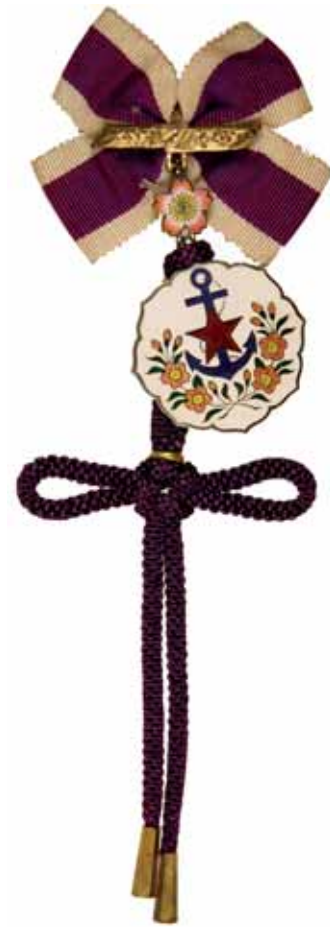
4460* Japan , Patriotic Women's Association, Decoration for Exceptional Zeal. In case of issue, uncirculated and rare.