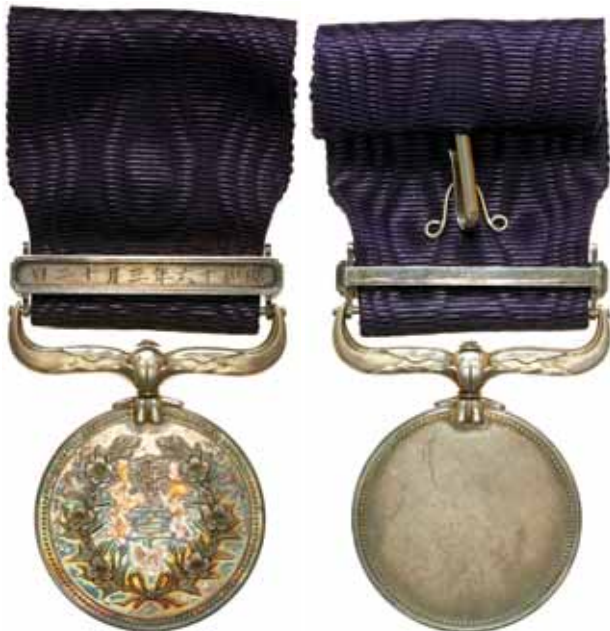
4459* Japan , Violet Ribbon Merit Medal. In case of issue, extremely fine.