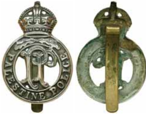
4532* Palestine Police cap badge , c.1920 - 1948, in silvered brass (43mm x 30mm), brass slider on back. Very fine.