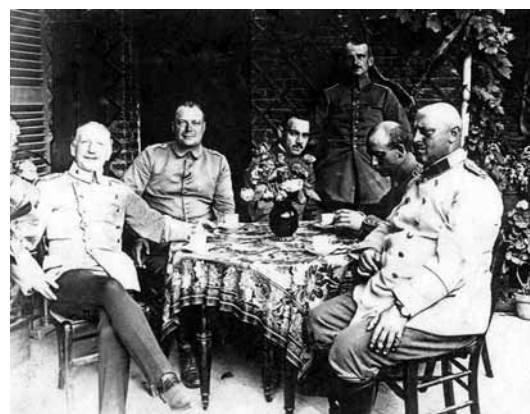
With German officers