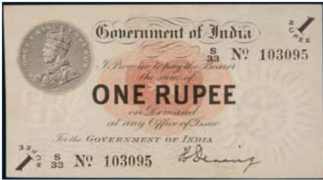
2514* India , Government, George V, one rupee S/33 No.103095 (1917-30 issue) (P.1c). Good extremely fine.