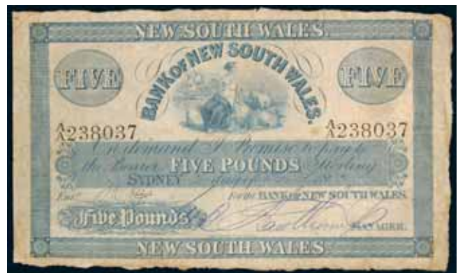
2732* Bank of New South Wales , five pounds, Sydney, 2 day of April 1883, A/A 238037 (MVR type 7c). Pin hole, edge creases otherwise nearly very fine and rare. $19,000