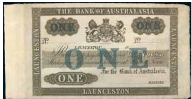
2733* Bank of Australasia , printer's proof for one pound (circa 1838) Launceston 18- No- (MVR type 1b) imprint Ashby & Co. London, two colour printed, green denomination on black main print. Large left margin with one cm tear, otherwise extremely fine and excessively rare, the only example we have seen by this printer. $20,000