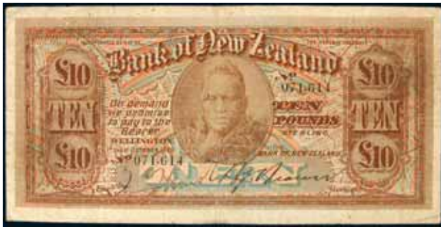
2573* Bank of New Zealand , uniform issue, ten pounds, Wellington, 1 October 1926, 071,614, arched bank name, black serial numbers (Robb.D.851; L.471; P.S237). Creases, folds and pinholes, otherwise nearly fine and scarce.