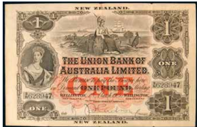
lot 2586 part