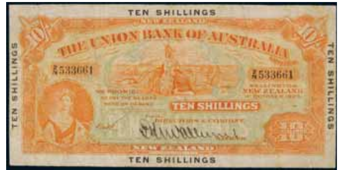
2589* Union Bank of Australia , uniform issue, ten shillings, without "sterling", Wellington, 1st October 1923, No. 2/N 533661, imprint of Waterlow & Sons Limited, London (Robb.M.81; L.542; P.S371b). Many creases and folds, nearly fine and scarce.

Ex Noble Numismatics Sale 62 (lot 3378).