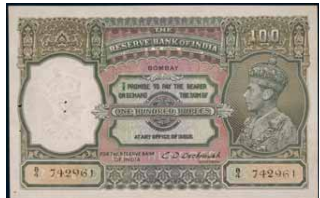
2519* India , George VI, Reserve Bank, one hundred rupees, Bombay, B/4 742961 (1943) (P.20b). Three spike holes otherwise extremely fine and rare.