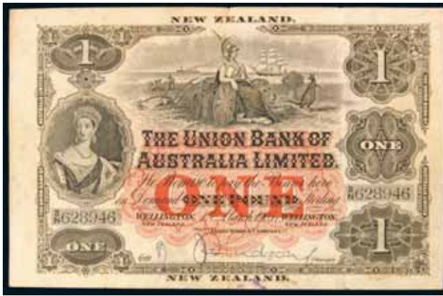
2586* Union Bank of Australia , fourth issue, one pound, Wellington, 1st March 1905, No. 3/N 628946/7 consecutive pair, imprint of Waterlow & Sons, Ld. London (Robb.M.42; L.533, P.S362b). Both with slight margin tears, the second with heavy folds and discoloured back, otherwise very fine and very scarce as a pair. (2)