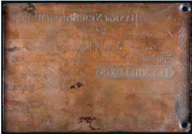
2729* Bank of New South Wales , engraved copper printing plate by Samuel Clayton for ten shillings, Sydney 1819 (MVR type 1b). Two filing holes top and bottom right corners, otherwise nearly very fine and very rare, of great historical interest. $15,000