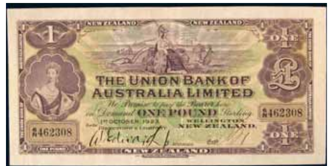
2590* Union Bank of Australia , uniform issue, one pound, Wellington, 1st October 1923, 6/N 462308, imprint of Waterlow & Sons Ld, London (Robb.M.82; L.543; P.S372). Light folds, full body, good very fine and rare in this grade.