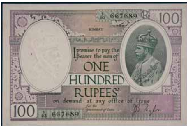
2516* India , George V, one hundred rupees, Bombay, S/63 667689 (1917-30 issue) (P.10a). Spike hole in panel otherwise extremely fine and rare.