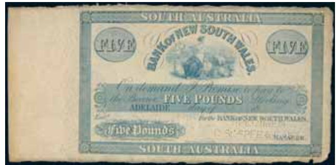
2731* Bank of New South Wales , specimen five pounds, Adelaide, 18-, South Australia top bottom borders (MVR type 7c). Wide left margin, perforated specimen C Skipper & East in signature, extremely fine and rare. $16,000

Mount Alexander was near Castlemaine and the notes were used as payment for gold from the gold fields.