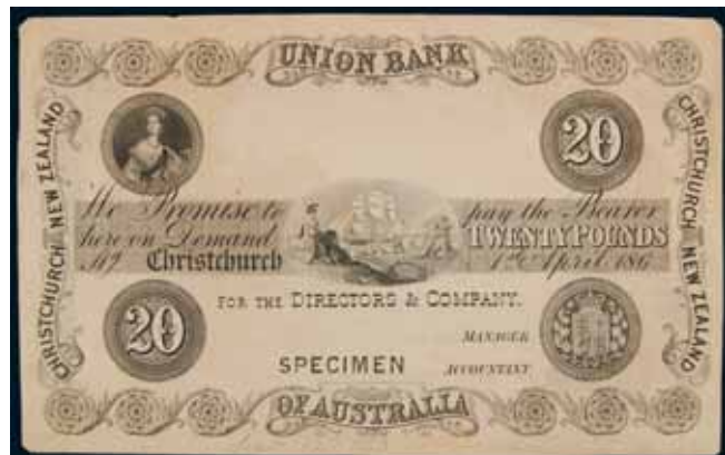
2585* Union Bank of Australia , second issue, uniface printer's proof by Perkins Bacon & Co., Christchurch, 1st April 186 - black on white paper, specimen overprinted in signature reserve, pencilled Sept 12th 1863 bottom margin, corners cut as issues (P.S 349; Robb 34e). Extremely fine. $2,100