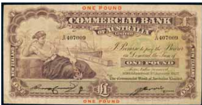
2575* Commercial Bank of Australia , uniform issue, one pound, Wellington, 1st January 1927, No. A407009, imprint of Waterlow & Sons Limited, London Wall. London. E.C. (Robb.H.82; L.485; P.S282). Flattened, fine and scarce.