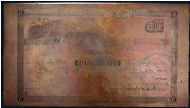
2730* Bank of New South Wales , engraved copper printing plate for five pounds Victoria, Mount Alexander Agency 18(5-) (MVR type 6b; figure 75, page 77). Very fine, very rare and historically important. $20,000

Mount Alexander was near Castlemaine and the notes were used as payment for gold from the gold fields.