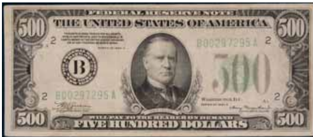
2713* U.S.A. , Federal Reserve, five hundred dollars, series of 1934A, B00297295A (P.434a). Stamp on back "Subject To", good fine and rare.