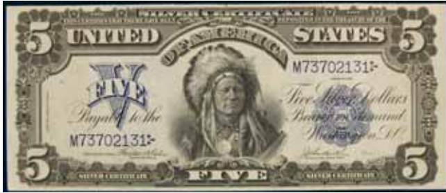
2712* U.S.A. , silver certificate, five dollars, series of 1899, M 73702131:- (P.340). Nearly uncirculated and rare in this condition.