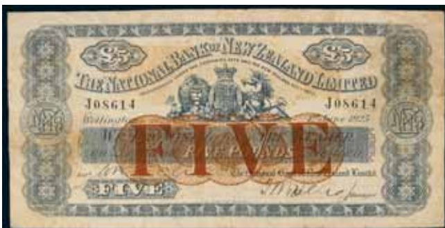
2583* National Bank of New Zealand , uniform issue, five pounds, Wellington, 1st June 1925, J08614, imprint of Perkins Bacon & Co.Ld, London (Robb.J.84; L.513; P.S318). Some discolouration, otherwise good fine and very rare. $3,100