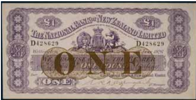
2580* National Bank of New Zealand , uniform issue, one pound, Wellington, 1st June 1926, D428629, imprint of Perkins, Bacon & Co. Ld. London (Robb.J.82; L.512; P.S317). Crisp original body, extremely fine and rare in this condition. $2,700