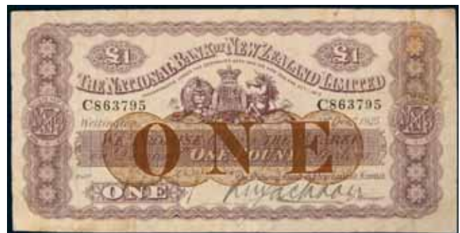
2579* National Bank of New Zealand , uniform issue, one pound, Wellington, 1 Decr.1925, C863795, imprint of Perkins, Bacon & Co. Ld. London (Robb.J.82; L.512; P.S317). Some light toning, nearly very fine and scarce.