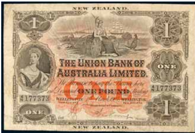
2587* Union Bank of Australia , fourth issue, one pound, Wellington, 1st March 1905, No. 4/N 177373, imprint of Waterlow & Sons, Ld. London (Robb.M.42; L.533, P.S362b). Many folds, fine.