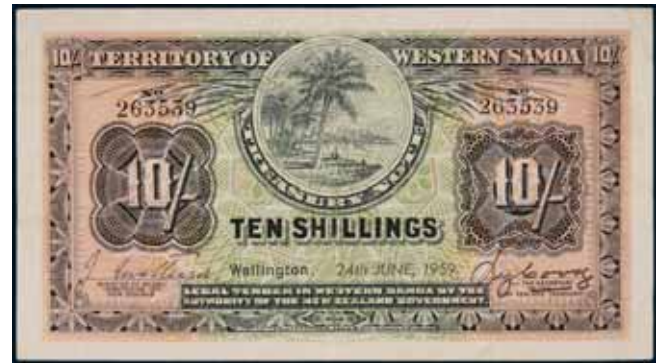
2716* Western Samoa , Territory of Western Samoa, ten shillings, Wellington, 24th June, 1959, No. 263539, legal tender in Western Samoa by the authority of the New Zealand Government, (P.7c). Nearly very fine and rare.