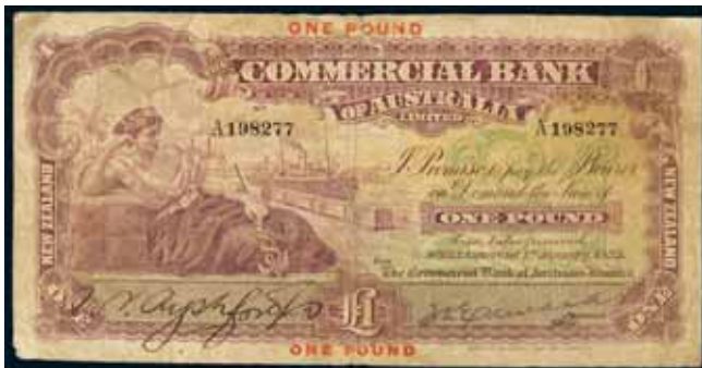
2574* Commercial Bank of Australia , uniform issue, one pound, Wellington, 1st January 1923, A198277 (Robb.H.82; L.485; P.S282). Nearly fine and rare.