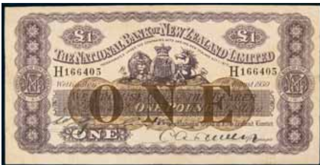
2581* National Bank of New Zealand , uniform issue, one pound, Wellington, 1st August 1930, H 166405, imprint of Perkins, Bacon & Co Ltd., London (Robb.J.82; L.512; P.S317). Good fine. $1,250