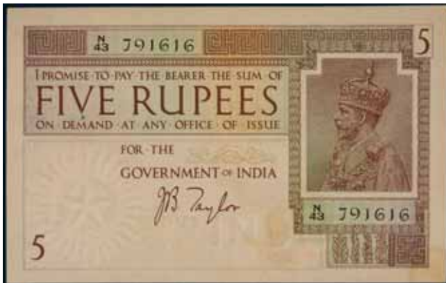
2515* India , George V, five rupees, N/43 791616 (1917-30 issue) (P.4b). Flattened spike hole on left otherwise good extremely fine with two moisture stains.