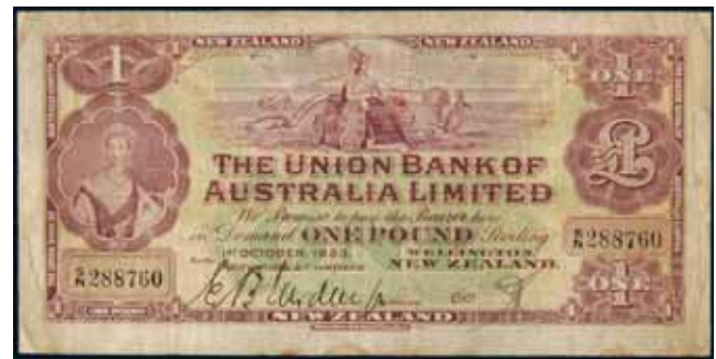
2591* Union Bank of Australia , uniform issue, one pound, Wellington, 1st October 1923, 5/N 288760, imprint of Waterlow & Sons Ld, London (Robb.M.82; L.543; P.S372). Many folds, light staining, otherwise fine and scarce.