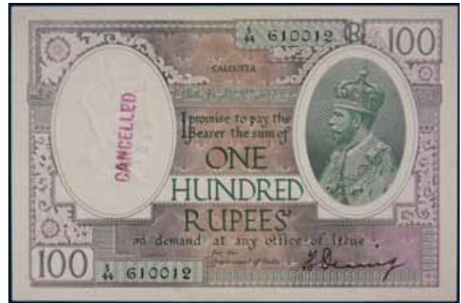
2517* India , George V, one hundred rupees, Calcutta S/44 610012 (1917-30) (P.10d) small black Calcutta. Cancelled stamped on front otherwise extremely fine and rare.