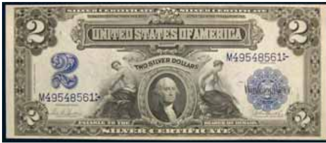
2711* U.S.A. , silver certificate, two dollars, series of 1899, M 49548561:- (P.339). Flat, nearly uncirculated.