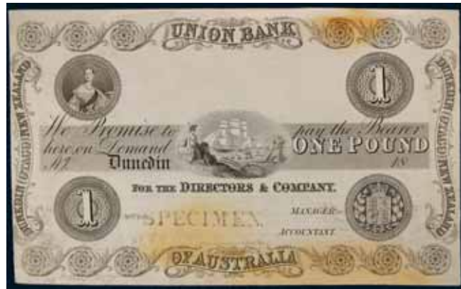
2584* Union Bank of Australia , second issue, specimen note for one pound, at Dunedin, dated 18-- without serial numbers, black ink, imprint of Perkins Bacon & Co London Patent Hardened Steel Plate, stamped "SPECIMEN" for Manager (Robb.M.32; L.521; P.S346). Some tone stains across the note, otherwise very fine. $1,400