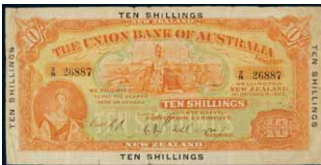
2588* Union Bank of Australia , uniform issue, ten shillings, with "sterling", Wellington, 1st October 1923, No. 2/N 26887, imprint of Waterlow & Sons Limited, London (Robb.M.81; L.542; P.S371a). Many folds and small tears, very good.