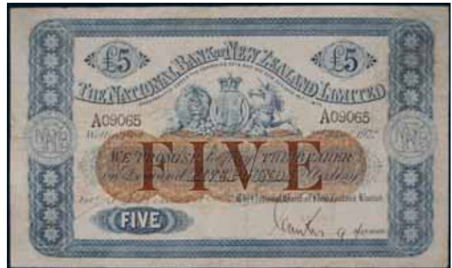
2576* National Bank of New Zealand Limited , third issue, five pounds, Wellington, 2 January 1922, A09065, imprint of Perkins, Bacon & Co. Ld. London, (L.507, P.S308, Robb J.34). Flattened of many creases and folds, 1cm hole in vertical centre fold, otherwise fine and very scarce.