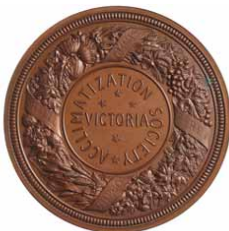
1037* Acclimatization Society , Victoria, 1878, in bronze (58mm) by J.S. & A.B.Wyon, 'SC / 1868 / F.Landseer ARA. Adj' in exergue (C.1868/3), uninscribed. Reverse with corrosive spot at 2 o'clock, otherwise as struck.