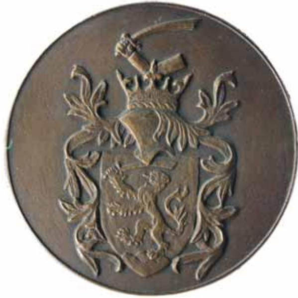
1083* Art medal , in bronze (135mm) a Hungarian family Coat of Arms, by Michael Meszaros, c1960s, as a private commission, unsigned, mounted on a wooden display panel (252mm x 195mm). Good very fine.