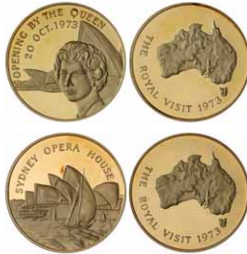
1095* The Royal Visit , Opening of the Sydney Opera House, 1973, proof medallions (2) in 18ct gold (31.9mm, 46.5gm) by Matthey Garrett, set No.0308. In case of issue, FDC. (2)