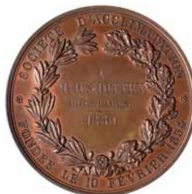
1040* Acclimatation Society of France , in bronze (51 mm) by Althie Dubois, inscribed to "Mr. H.S. Ditten/crustaces/1880". Good extremely fine.