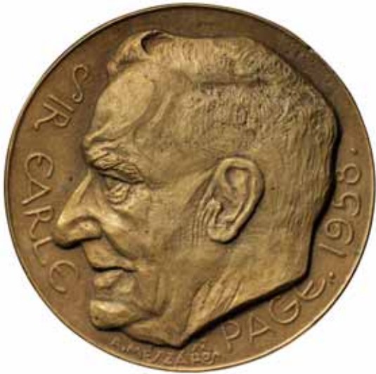
1081* Sir Earle Page 1958 , medal in bronze (69mm) (C.1958/1) by A.Mezzaros. In unofficial fitted case, uncirculated and scarce.