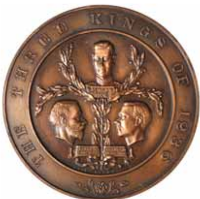
1070* The Three Kings of 1936 , King George VI Queen Elizabeth Crowned May 12 1937, in bronze (51mm) by Amor. Scarce, only 100 issued in bronze, uncirculated.