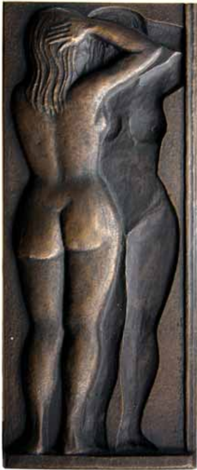
1091* Art medal , 'The Mirror' in bronze (160mm x 67mm) by Michael Meszaros, 1970, one of an edition of 25, screw mounted on wood panel (243mm x 192mm). Extremely fine.