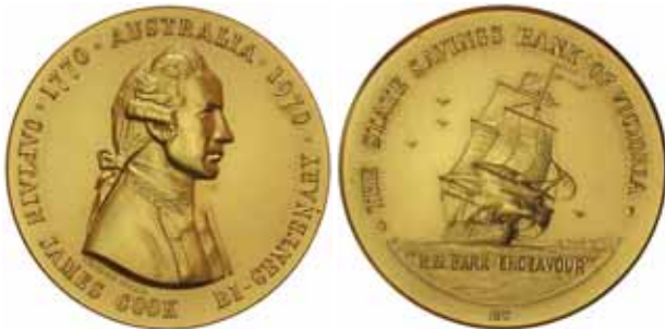
1093* Captain James Cook , Bicentenary, 1970, in 18ct gold (38mm, 52.2gm) (C.1970/22) by Stokes Ltd Melbourne for the State Savings Bank of Victoria. In case of issue, uncirculated.