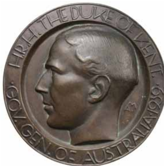
1073* Portrait medal , H.R.H. The Duke of Kent, Gov.Gen. of Australia, 1939, in bronze (138mm) by Andor Meszaros, screw mounted on wood (276mm x 200mm). Nearly extremely fine.