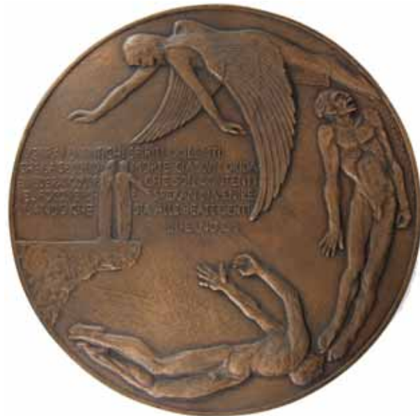
1084* Art medal , 'Dante', in bronze (178mm) by Andor Meszaros, 1965, screw mounted on wood panel (300mm x 240mm). Extremely fine.