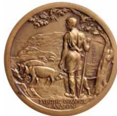
1077 French Exhibitions in Australia , March - April 1956, La Perouse 1741-1788, in bronze (67mm) by Georges Guiraud, cased. Uncirculated and scarce. $150