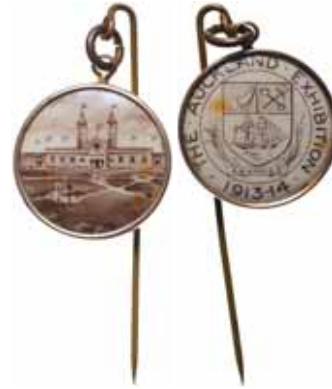
1309* Auckland Exhibition 1913-14 , celluloid and rolled gold coat pin (21mm)(M.1913-14/10). Very fine and rare.