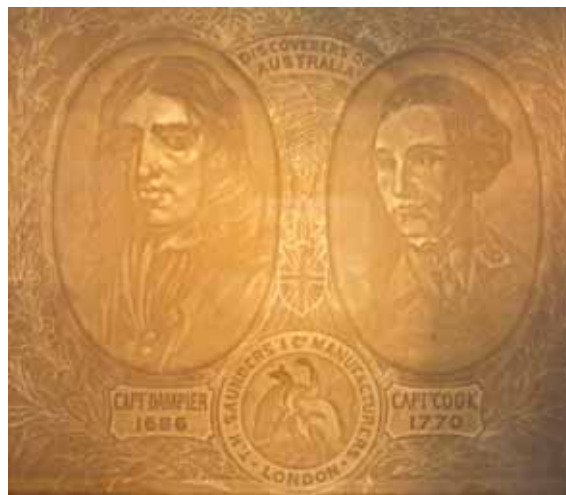
1039* Captain Cook Memorabilia , watermarked paper from models prepared by T.H. Saunders & Co., London (21 x 22.5cm) depicting Captain Dampier 1686 and Captain James Cook 1770 as discoverers of Australia. Framed and double glazed, very fine and important.