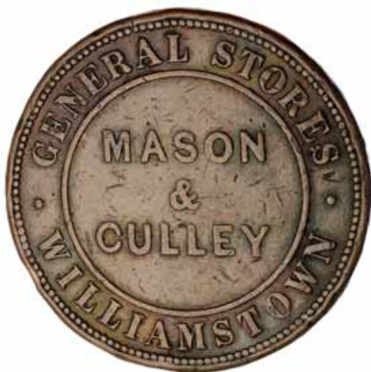
lot 1181 enlarged