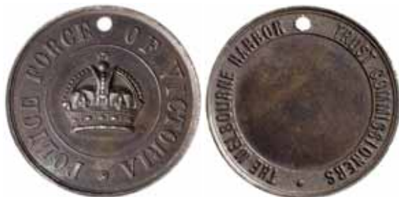
1071* Police Force of Victoria , The Melbourne Harbor Trust Commissioners, identity pass (GVR) in silver (36mm). Nearly uncirculated.