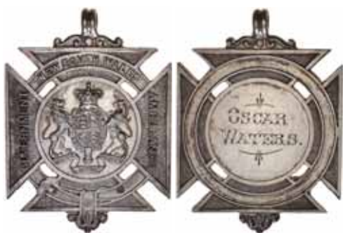
1069* N.S.W. Government Ambulance silver medal (30 x 30mm), reverse inscribed with recipient's name, 'Oscar Waters'. Extremely fine.