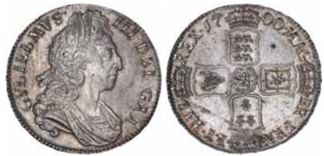
1800* William III , silver crown, third bust, 1700 (S.3474) Duodecimo edge. Subdued full original mint bloom, usual slight reverse weak area and adjustment marks through wreath otherwise nearly uncirculated.

Ex A.J. Gibbons Collection (first from Max Stern in August 1973, second in February 1985 and the last in June 1973).