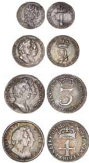
1797* William & Mary , silver Maundy set, 1692 (S.3446). Fine - very fine. (4)