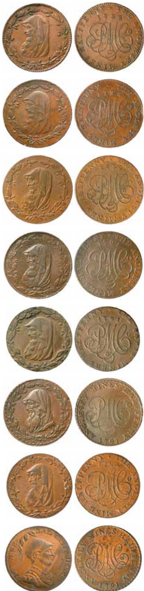
lot 2023 part