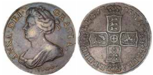
1803* Anne , Before the Union, silver crown, 1703 VIGO (S.3576). Rim bruising, grey toned, very fine and scarce.

Ex A.J. Gibbons Collection (from M.R.Roberts, March 1986).