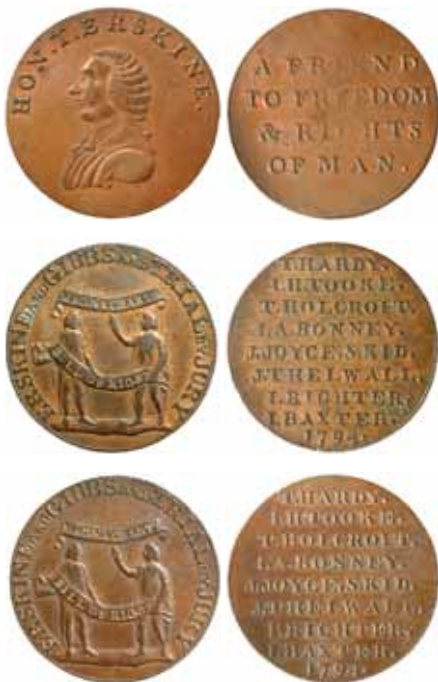
lot 2021 part