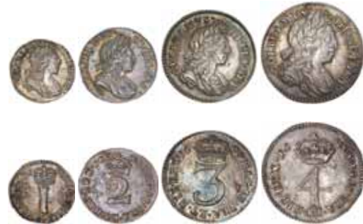
1802* William III , silver Maundy set, 1698 (S.3553). Toned, very fine - nearly extremely fine. (4)