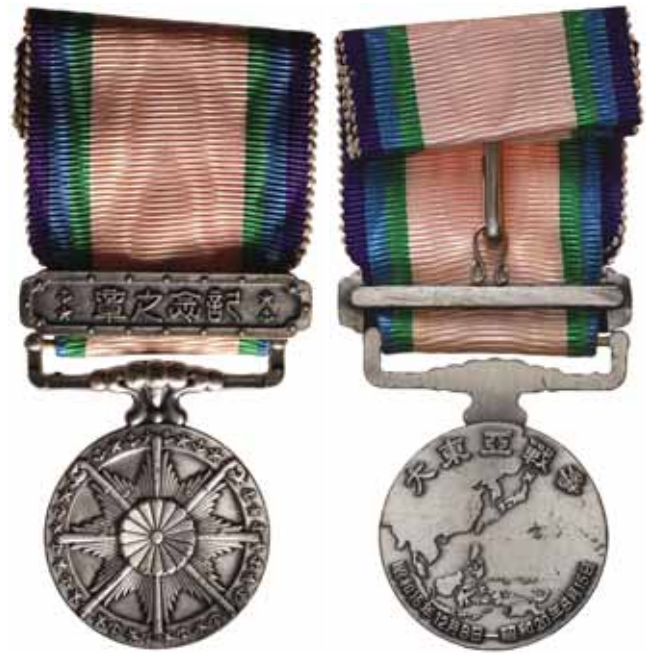
5783* Japan , veterans' commemoration medal for the Great East Asia War. In black lacquered case of issue, uncirculated.