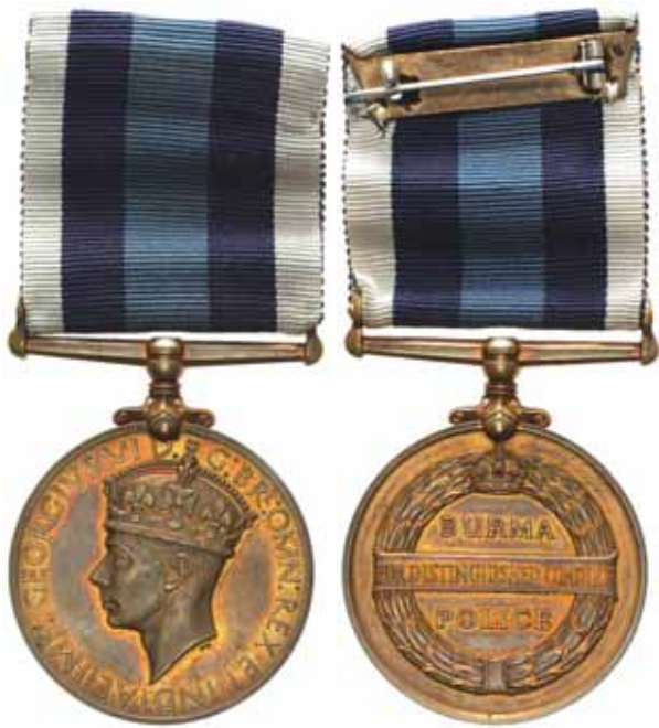
5589* Burma Police Medal, (GVIR) For Distinguished Conduct (1937-1948). Unnamed specimen. Extremely fine and rare. $1,000