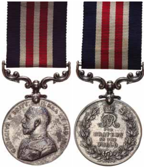
5586* Military Medal (GVR) , 19348 Pte F.Ogden. 11/N. & D.R. Impressed. Some pitting in reverse field, a few small edge bumps, otherwise very fine.