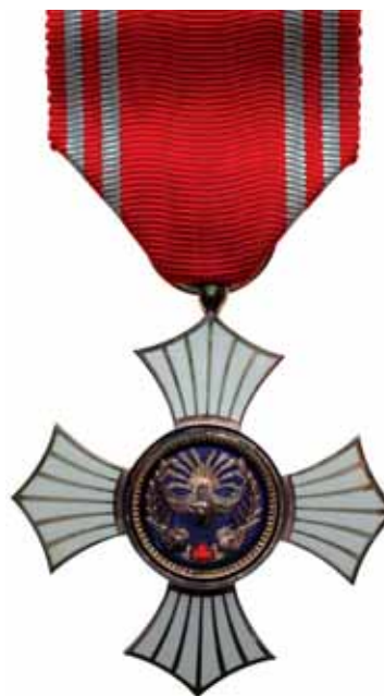
5779* Japan , Red Cross Society Order of Merit Decoration (Yuknosho) in silver and enamel. In official case of issue with lapel rosette, uncirculated.