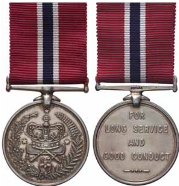
5769* New Zealand, Long Service and Good Conduct Medal (Police) 1966-1973 by Dick and Watt Ltd. Unnamed. Good very fine.