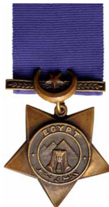
5598* Khedive's Star 1882 , undated. Very fine.