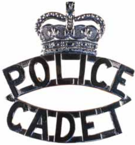
5856* New South Wales Police Cadet , cap badge (EIIR) crown, in chrome (58mm x 55mm). Extremely fine.