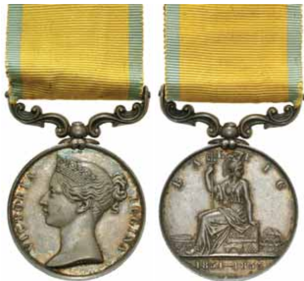
5594* Baltic Medal 1856 . Unnamed. Good very fine.