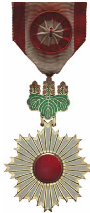
5777* Japan , Order of the Rising Sun 4th Class, merit award in gilt silver and enamel, with rosette on ribbon. In black lacquered case of issue with lapel rosette, uncirculated and rare.