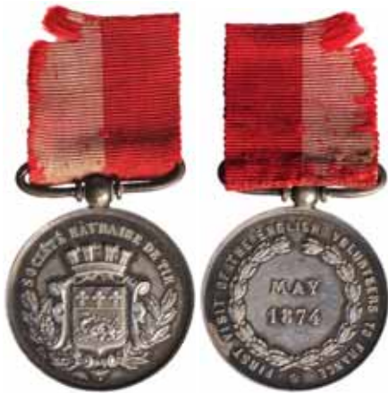
5774* France , Societe Hauraise De Tir (Hauraise Shooting Society) silver medal, obverse, coat of arms, reverse, 'First Visit of the English Volunteers to France' around a centre wreath with the date 'May / 1874' inside. Extremely fine.