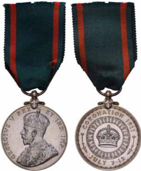
5680* Visit to Ireland Medal 1911. Unnamed. Extremely fine. $110