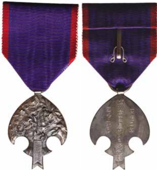
5781* Japan , Imperial Visit to Japan Commemorative Medal, 1935 (Emperor Pu - Yi's Medal). In official case of issue, uncirculated.