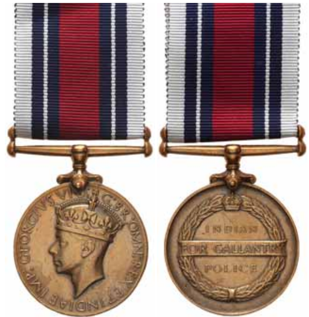
5588* Indian Police Medal, (GVIR) 2nd type For Gallantry (1944-48). Sultan Shah, Hd. Constable (Offg) No.2105 N.W.F.P. Engraved. Obverse with edge bruise at 4 o'clock, reverse with scratch in field, cleaned, otherwise very fine and rare.