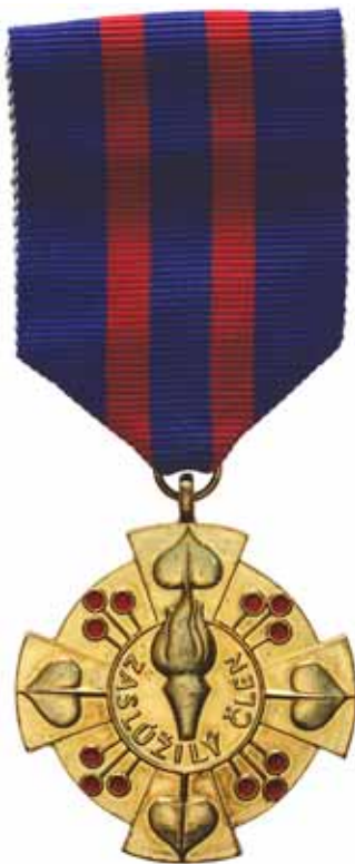
lot 5835 part