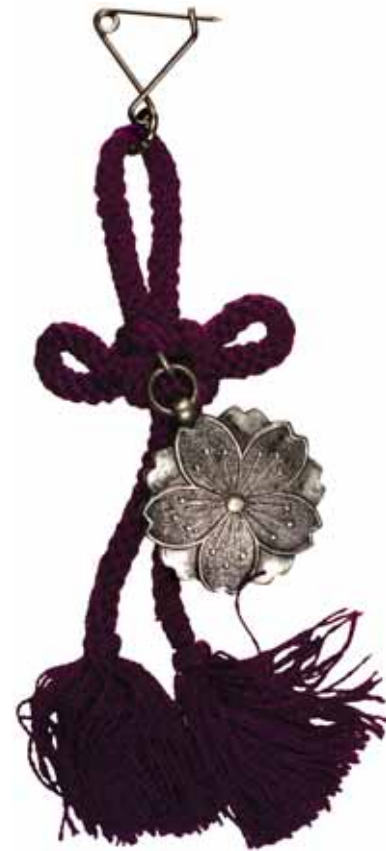
5782* Japan , Killed in Combat Medal for parent of deceased. In timber case of issue, no lid, medal uncirculated.