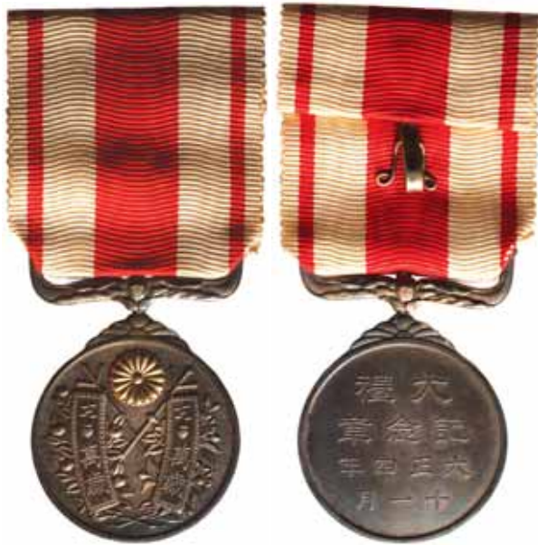
5780* Japan , Taisho Enthronement Commemorative Medal, 1915 in silver and gilt. In black lacquered case of issue, uncirculated.