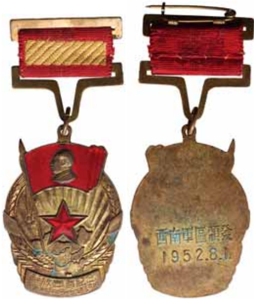
5773* China , People's Republic, Liberate Tibet Memorial Medal, West and South Army, presented on Army Day, 1.8.1952. Very fine.