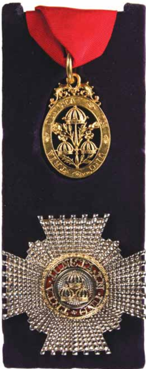
5581* The Most Honourable Order of the Bath , Knight Commander (KCB), civil badge in 18ct gold , hallmarked 1861 (Garrard) and breast star in gold, gilt and silver. On fitted, plush holder, good extremely fine. (2)