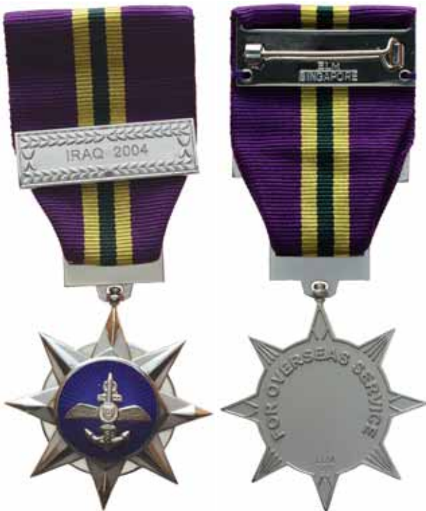
5795* Singapore , Armed Forces Overseas Service Medal - clasp - Iraq 2004, in silver and enamel. In official case of issue with miniature medal and ribbon bar, uncirculated.

Forty four Singapore Civil Defence Force officers who went to Taiwan to help in rescue work after the September 1999 earthquake received this medal in recognition of their dedication and bravery. With copy of newspaper report of the quake and the award.