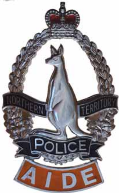
5857* Northern Territory Police AIDE , cap badge (EIIR) crown, in chrome (80mm x 49mm), No.A46 impressed on back. Extremely fine.