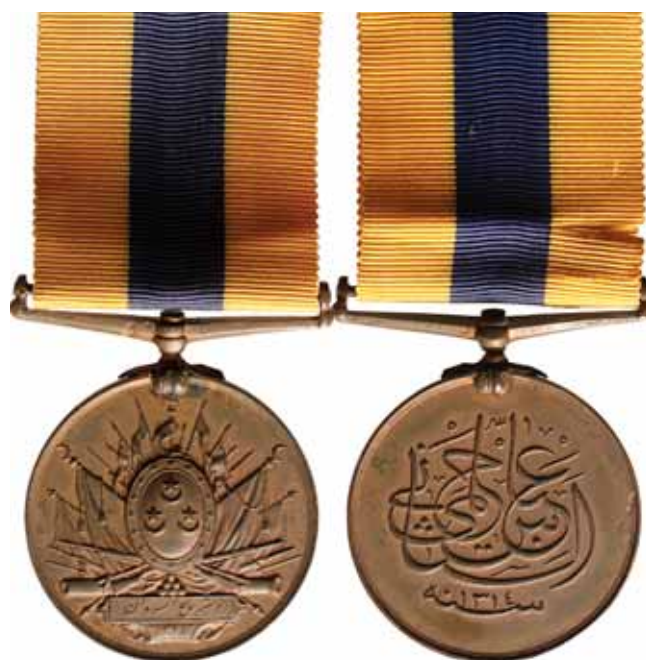
5602* Khedive's Sudan Medal 1896 . Unnamed. Nearly uncirculated with traces of mint red.