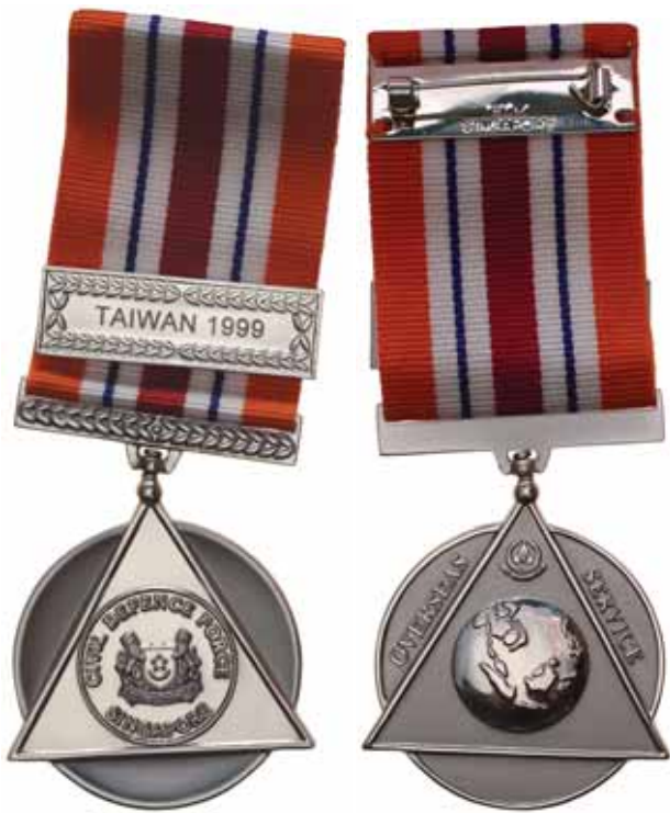
5794* Singapore , Civil Defence Overseas Service Medal - clasp - Taiwan 1999. In case of issue, uncirculated.