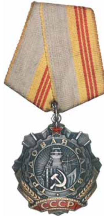
4036* Russia , USSR, Order of Labor Glory, 3rd Class, one-piece construction type, raised and curved Monety Dvor mintmark on reverse and engraved number 243213. Extremely fine.