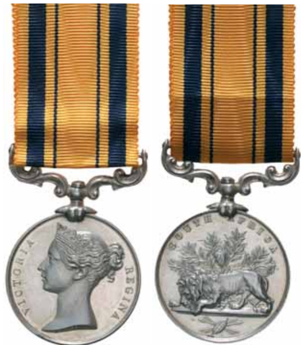
3904* South Africa Medal 1879. T.G.Jones. P.O.1.Cl. H.M.S. 'Eurphrates'. Engraved. Nearly uncirculated. $300

251 medals to HMS Eurphrates, all without clasp.