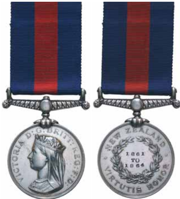
3901* New Zealand Medal 1869, reverse with impressed dates 1861 to 1864. Robt.R, Roan 40th Regt. Impressed. Very fine. $200

HMS Simoom not at Taku Forts. Medal possibly renamed.