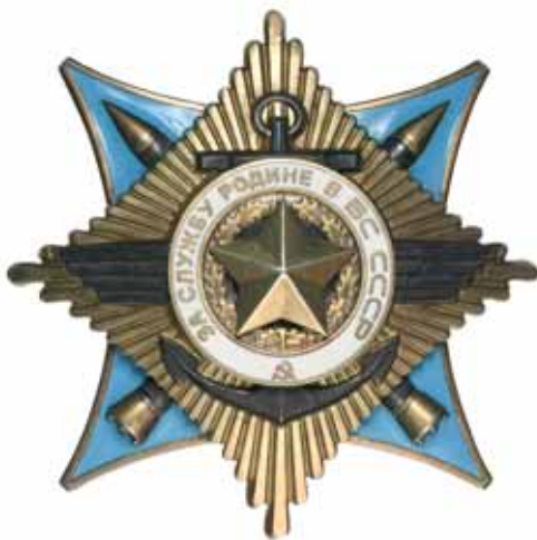
4031* Russia , USSR, Order for Service to the Motherland in the Armed Forces of the USSR, 1st Class, raised Monetny Dvor mintmark on reverse and engraved number 0012. Extremely fine and extremely rare .