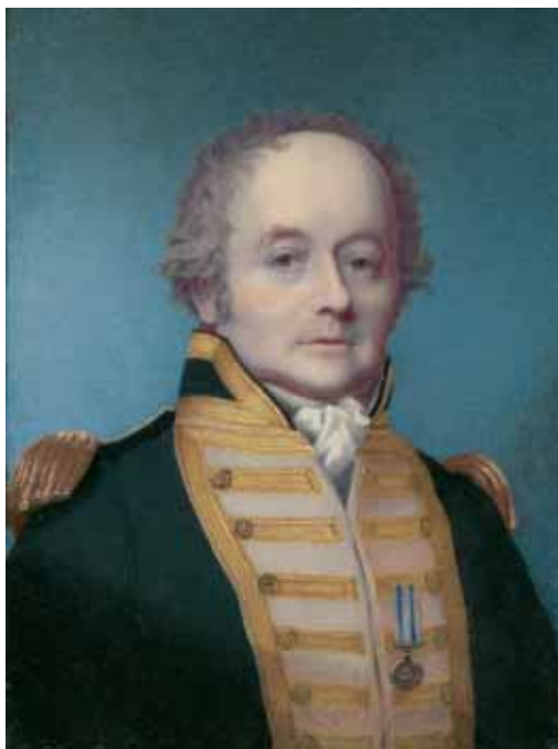
William Bligh in the uniform of a Flag Officer and wearing the Captain's Naval Gold Medal

William Bligh was born at St Tudy near Bodmin in Cornwall in 1754 and in 1761, as a seven-year old, he was signed up for the Royal Navy. In 1770, at the age of 16, he joined HMS Hunter as an able seaman because there were no vacancies for midshipmen but early in the next year he became a midshipman. In September of that year he was transferred to the Crescent where he served for the next three years. In 1776 he was selected by Captain James Cook to be his Sailing Master on the Resolution for Cook's Third Voyage to the Pacific and, as it turned out, Cook's last voyage after he was killed by natives in Hawaii in 1779.