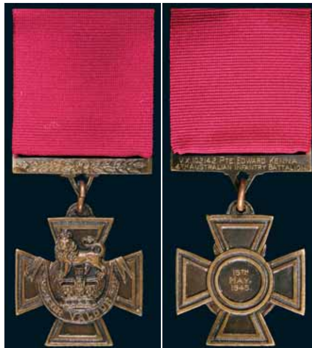
VC: LG 6/9/45, p4467, pos 2; CAG 13/9/45, p1979, pos 2. Citation: Valour of the highest order at Wirui Mission 15/5/45. (AMF O/A 29).

The full citation as recorded in LG Supplement 37253, pp4467-4468 is as follows; War Office, 6th September, 1945 The KING has been graciously pleased to approve the award of the VICTORIA CROSS to:- No. VX.102142 Private EDWARD KENNA, 2/4 Australian Infantry Battalion, Australian Military Forces.