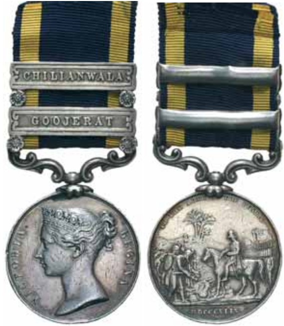
3890* Punjab Medal 1848-49, - two clasps - Chilianwala, Goojerat. Serjt W.Caplin, 1st Tp. 2nd Bde H.Arty. Impressed. Contact marks, edge nicks and bruises, fine. $300