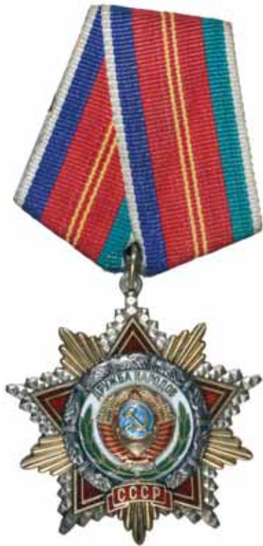
4030* Russia , USSR, Order of Friendship of Peoples, raised and curved Monetny Dvor mintmark on reverse and engraved number 53208. Extremely fine .