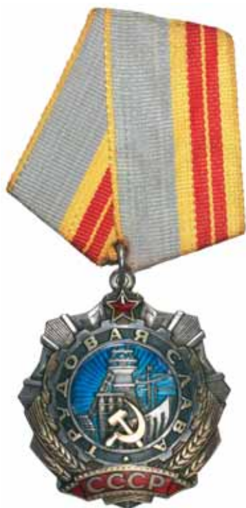
4035* Russia , USSR, Order of Labor Glory, 2nd Class, raised and curved Monety Dvor mintmark on reverse and engraved number 15902. Extremely fine.