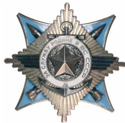
4033* Russia , USSR, Order for Service to the Motherland in the Armed Forces of the USSR, 3rd Class, raised Monetny Dvor mintmark on reverse and engraved number 129815. Extremely fine .