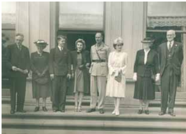
VC presentation day at Government House, Melbourne