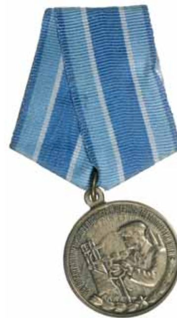
4037* Russia , USSR, Liberation of Warsaw Medal 1945; Medal for the Restoration of the Black Metallurgical Enterprises [illustrated]. Very fine - extremely fine. (2)