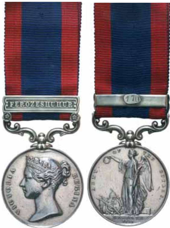
3889* Sutlej Medal 1845-46, (reverse Moodkee 1845), - clasp - Ferozeshuhur, disc impressed with 170 on back of clasp. Edwin Hockenhall 31st Regt. Impressed. Contact marks, polished, good fine. $400