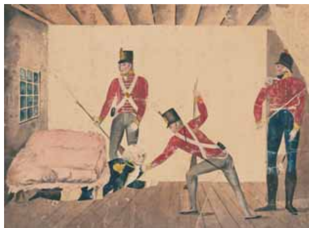
A cartoon from 1808 mocking the arrest of Governor Bligh

Bligh continued his service on His Majesty's Ships until he was offered the position of Governor of New South Wales, an appointment which was ratified on 14 May 1805. Bligh arrived at Sydney in August 1806 and very shortly was in conflict with several prominent and wealthy landowners, businessmen and government officials as well as military officers who were engaging in private trading ventures contrary to regulations. Throughout his time in office he tried to improve the situation of people in the colony but he also made decisions that upset many people and came into conflict with more and more people. Bligh's confrontational style, probably to be expected from a sea captain with absolute authority, was to be the catalyst for another historic event, one that became known as the Rum Rebellion.