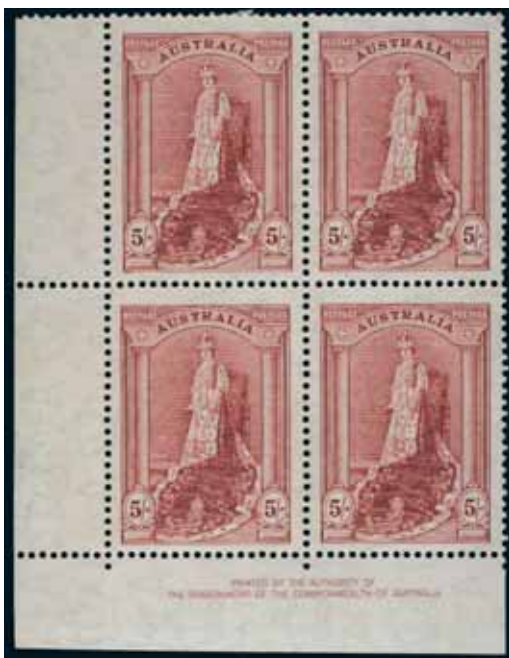
lot 4069 part