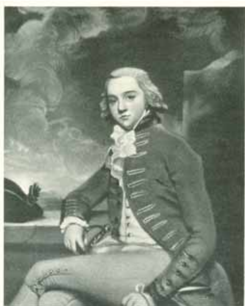
William Bligh in Captain's Uniform by R. Parkes after Reynolds

Then they placed Bligh and eighteen of his crew who remained loyal into a seven metre launch armed with only four cutlasses and supplied with enough food and water for a few days, a quadrant and a compass but no charts, sextant or marine chronometer. Four other loyal crewmen could not fit in the launch so they were retained for their useful skills and later released at Tahiti. Then from a seemingly impossible situation, Bligh completed one of the greatest seagoing feats in history by navigating from memory of his charts and guiding this small, overloaded and barely seaworthy vessel on a voyage of about 6,700 kilometres or over 3,600 nautical miles to arrive safely in Timor 47 days later. After his return to London he was subject to court martial in October 1790 for the loss of his ship but he was honourably acquitted. Shortly after, and as an indicator of their support, the Admiralty appointed Bligh to the rank of Captain in November.