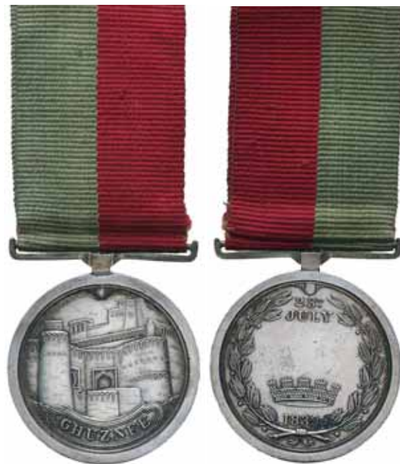
3887* Ghuznee Medal 1839 . Unnamed as issued. Light hairlines, extremely fine.

Confirmed on roll with clasp entitlements for recipient with King's German Legion 1st Battalion. Recorded on Waterloo roll as Schultze. Fowler Collection 1919.