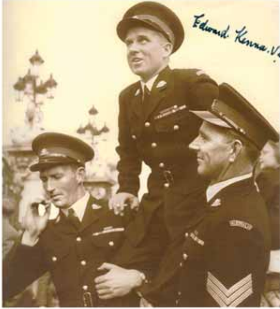
Ted Kenna on shoulders of comrades with 1953 Coronation Contingent

Edward 'Ted' Kenna was born at Hamilton, Victoria on 6 July 1919 where he grew up. The fourth child of a family of seven he attended school at St Mary's Convent, Hamilton but left at age 14 to become an apprentice plumber to help the family after his father became ill. On 9 August 1940, a month after his twenty-first birthday, he joined the Citizens Military Force and was allotted service number V55955 and posted to 32 Bn at Mt Martha, Victoria on 20 August. On 31 January 1941 he transferred to 23/21st Bn at Geelong, Victoria. On 15 December the CMF were called up for full time service for the duration of the war. On 2 May 1942 he entrained with his battalion for the 7th Military District (Northern Territory) for training. On 14 June 1942 Kenna volunteered for the AIF, enlisting at Hamilton, Victoria, and was allotted new service number VX102142. Private Kenna served in the 23/21st Battalion in Victoria and later in the Darwin area. His unit returned to Victoria in June 1943 and then to Queensland when it was disbanded and its members transferred as reinforcements to other units. On 3 September 1943 Private Kenna was posted to the 2/4th Battalion as a Bren gunner with 5 Section and after training at the Jungle Warfare School at Canungra he embarked from Cairns for New Guinea on 24 October 1944 aboard USAT Mexico.