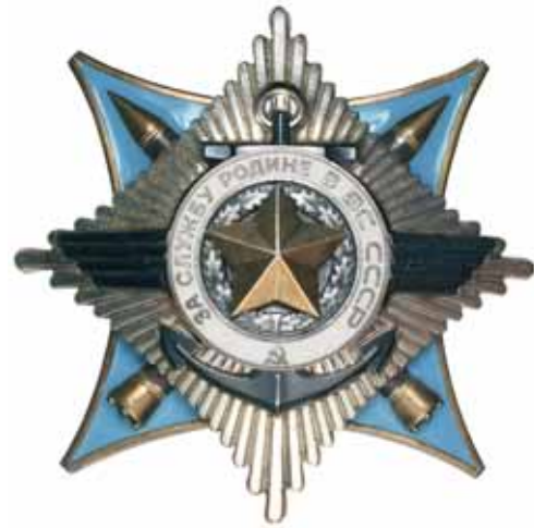
4032* Russia , USSR, Order for Service to the Motherland in the Armed Forces of the USSR, 2nd Class, raised Monetny Dvor mintmark on reverse and engraved number 0234. Extremely fine and rare .