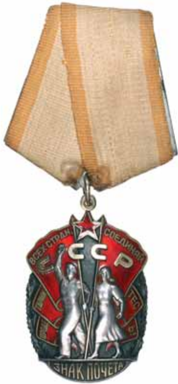
4034* Russia , USSR, Order of the Badge of Honor, type 4 variation 1 with concave reverse and Cyrillic letters made separately and affixed, raised and curved Monety Dvor mintmark on reverse and engraved number 843675. Good very fine.