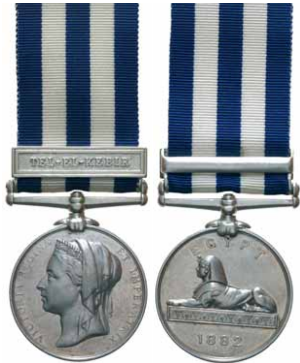
3908* Egypt Medal 1882, - clasp - Tel-El-Kebir. 1565. Pte W.Green. 1/R.I.Fus. Engraved. Good very fine.