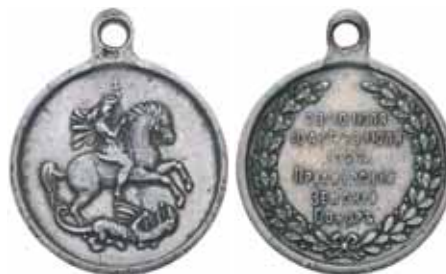
3813* Russia , Civil War, White Russia, Amur Medal 1922. No ribbon, very fine and scarce.