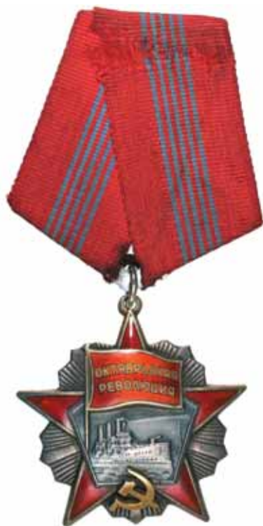
3811* Russia , USSR, Order of the October Revolution, variation two reverse, impressed Monetny Dvor mintmark on reverse and engraved number 68985. Good very fine.