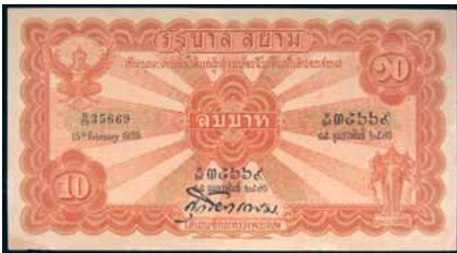
4341* Thailand , Kingdom of Siam, ten baht, 15th February 1928, N/29 35669 (P.18a). Stain bottom left corner, very fine.