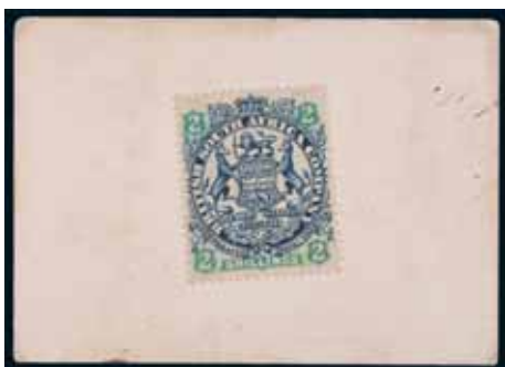
4334* South Africa , Mataberland, Marshall Hole postage stamp money, Bulawayo, 1st August, 1900, two shillings, postage stamp type A, oval hand stamp type II (P.S666b). Very fine.