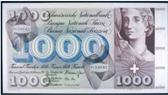
4339* Switzerland , Schweizerische Nationalbank, one thousand franken, Bern and Zurich, 10 February 1971 (P.52j). Uncirculated.