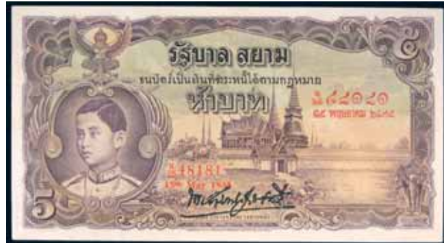
4343* Thailand , Kingdom of Siam, five baht, 15th May 1935, K/25 48181 (P.27). Very fine.