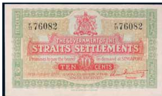
4337* Straits Settlements , The Government of the, ten cents, 14th October 1919, F/77 76082 (P.8b) Treasurer. Nearly uncirculated and rare thus.