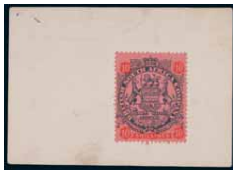
4336* South Africa , Mataberland, Marshall Hole postage stamp money, Bulawayo, 1st August, 1900, ten shillings, postage stamp type A, oval hand stamp type II (P.S670b). Very fine and rare.