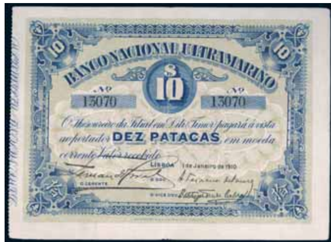
4346* Timor , Portuguese Administration, Banco Nacional Ultramarino, ten patacas, Lisbon, 1st January 1910, No.13070 (P.3). Very fine.