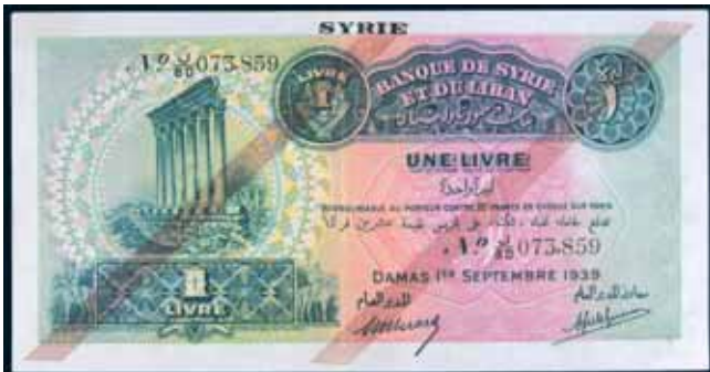
4340* Syria , Banque De Syrie, et du Liban, one livre (pound), 1st September 1939, J/BD 073,859, with lilac type B overprint, (P.40c). Extremely fine.