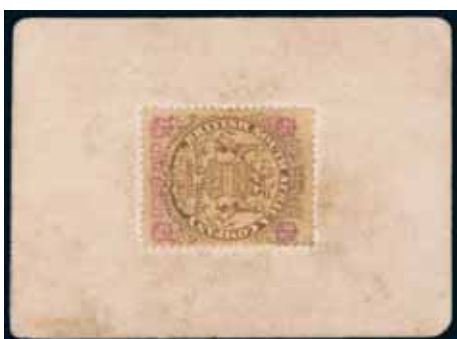
4335* South Africa , Mataberland, Marshall Hole postage stamp money, Bulawayo, 1st August, 1900, two shillings and sixpence, postage stamp type A, oval hand stamp type II (P.S667b). Very fine.