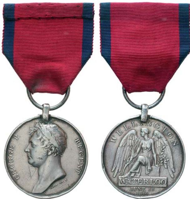
2009* Waterloo Medal 1815 . Charles Day 1st Batt 52nd Reg Foot. Renamed, engraved. Reverse with edge bruise at 6 o'clock, 'D' scratched in obverse field, good.