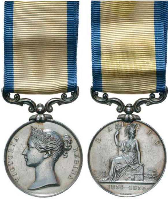
2028* Baltic Medal 1854-55. Unnamed. Good very fine.