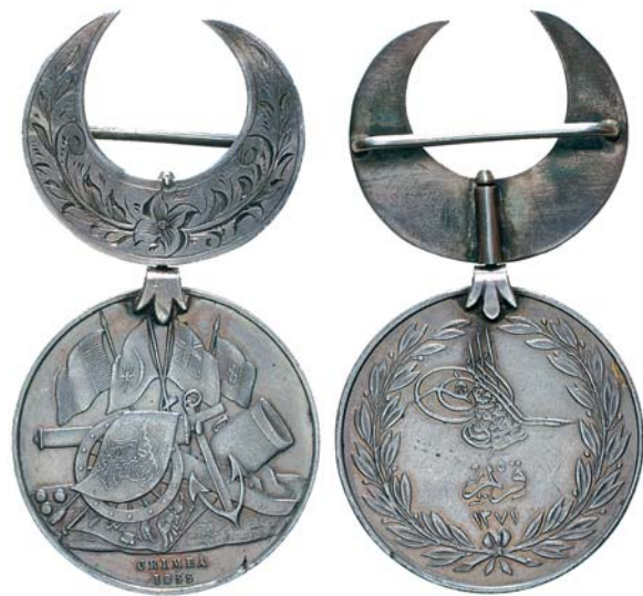
2025* Turkish Crimea Medal 1855 , (British issue) with unofficial handcrafted suspender. Very fine.