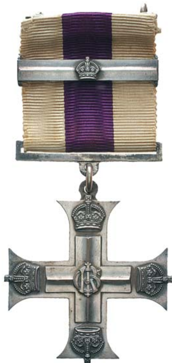
1999* Military Cross and bar (GVR). Unnamed. In case of issue, inside case with some rust spots, good very fine.