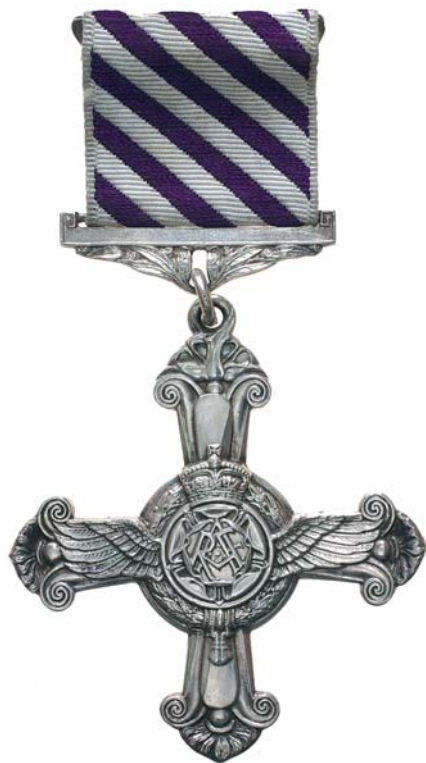
2001* Distinguished Flying Cross (GRI). Unnamed. In case of issue, uncirculated.