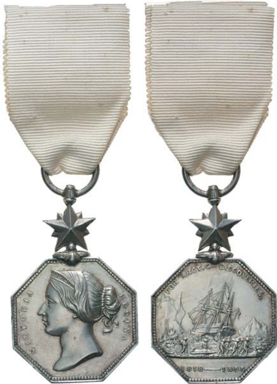
2029* Arctic Medal 1857. Unnamed as issued. Good extremely fine.