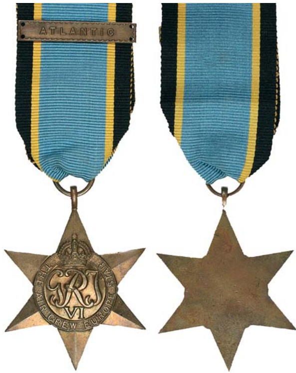
2174* Air Crew Europe Star , - clasp - Atlantic. Unnamed. Uncirculated.