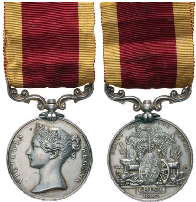
2014* China War Medal 1842. William Pearce HMS Blenheim. Impressed. Reverse with edge bruises at 4 and 6 o'clock, otherwise very fine.