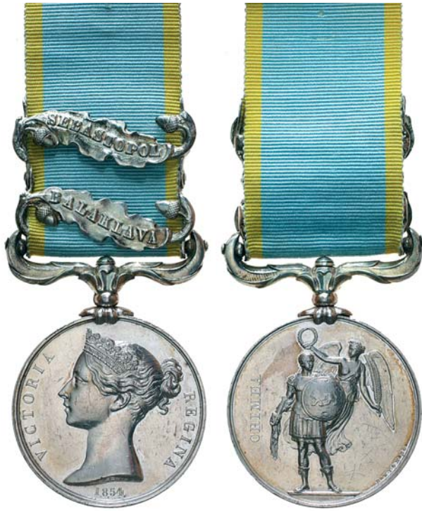
2022* Crimea Medal 1854 , - two clasps - Balaklava, Sebastopol. Unnamed. Good very fine.