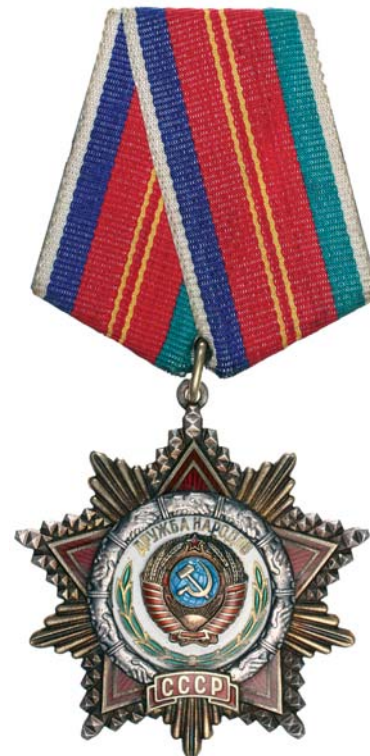
2229* Russia (USSR) , The Order of Friendship of Peoples, number 36045 engraved on reverse. Good extremely fine.