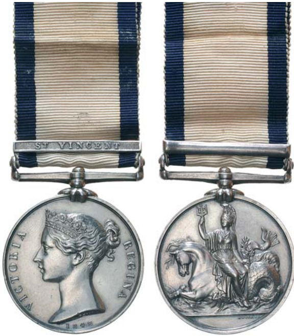
2003* Naval General Service Medal 1793-1840 , - clasp - St. Vincent. T.P.Cooke. Renamed, impressed. Very fine .