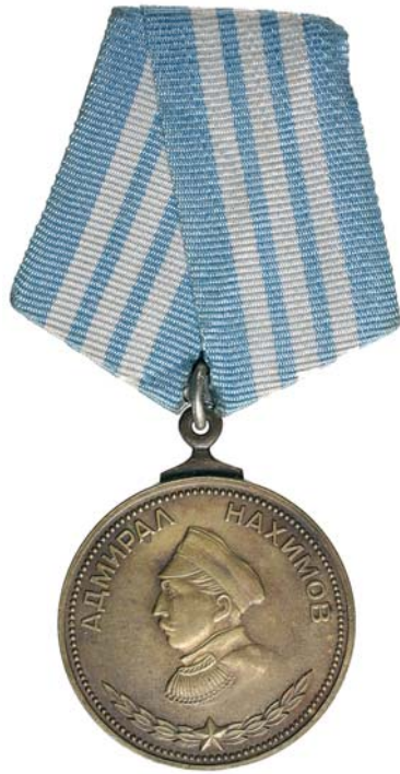
2226* Russia (USSR) , The Nakhimov Medal, variation 2 with impressed number 3011 on edge. Good very fine and scarce.