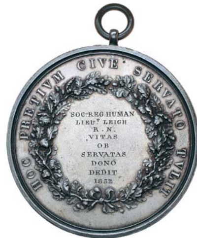
Lot 2117 part (following page)