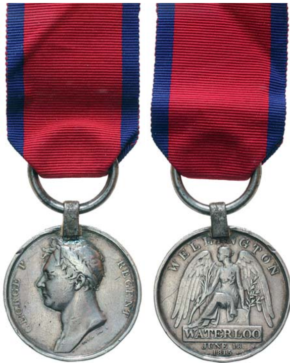
2012* Waterloo Medal 1815. Stephen Pedder 23rd Reg Light Dragoons. Impressed. Contact marks in fields, edge knocks, fine.