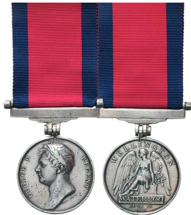
2011* Waterloo Medal 1815 . Edwd Marcon Lieut 54th Regt Foot. Renamed, engraved. Contact marks in fields, good.