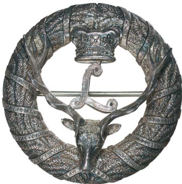
Lot 2063 part (previous page)