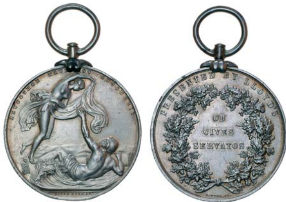
2053* Lloyd's Medal for Saving Life at Sea , small silver issue, edge inscribed, 'D. Davidson. "Terzo" 9. Nov. 1896.' No ribbon, a few minor edge nicks, otherwise extremely fine.