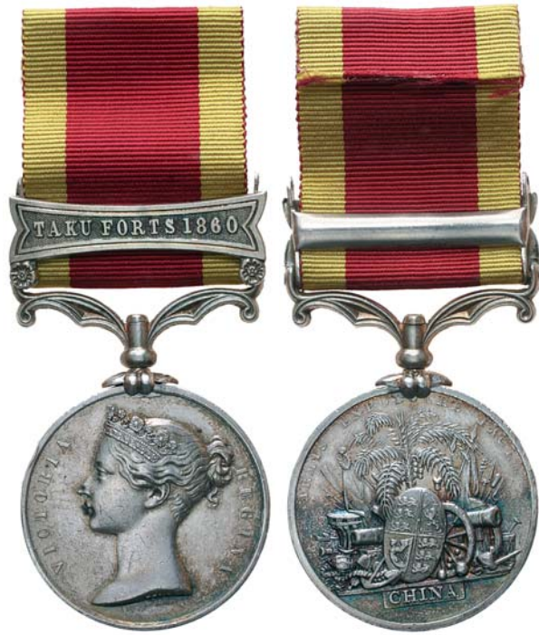
2030* Second China War Medal 1857-60, - clasp - Taku Forts 1860. Unnamed. Knocks in fields, suspender re-affixed, very fine. $170