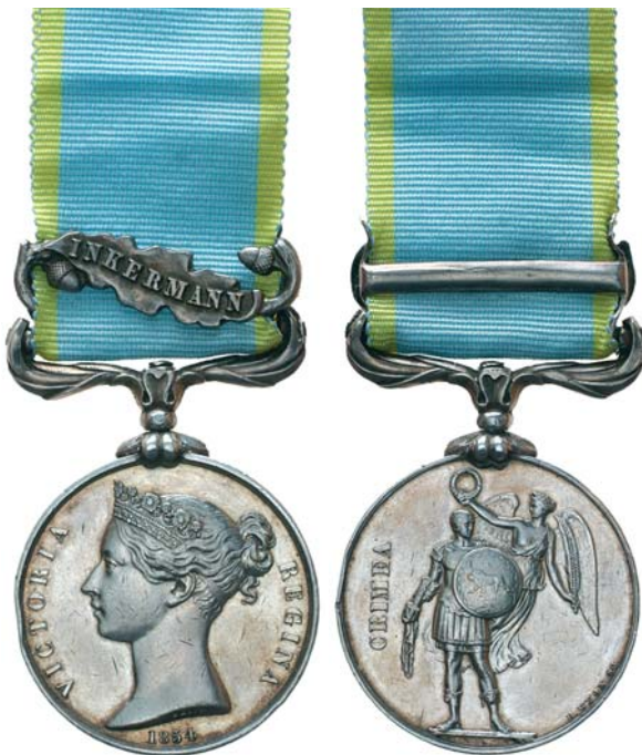
2023* Crimea Medal 1854 , - clasp - Inkermann. R.Quayle 11th Hussars. Officially impressed. Obverse with edge bruise at 9 o'clock, very fine.