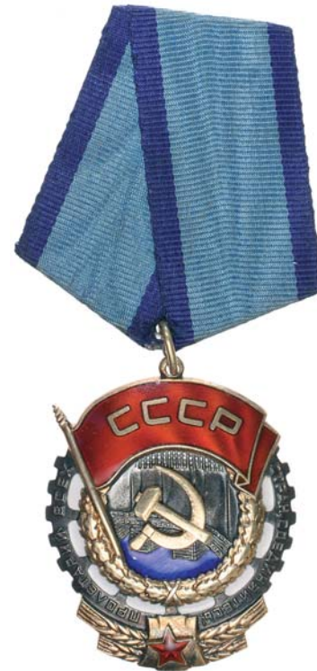
2228* Russia (USSR) , The Order of the Red Banner of Labor, type 5 variation 2 with curved Monety Dvor mint mark, number 318720 engraved at bottom of reverse. Uncirculated.